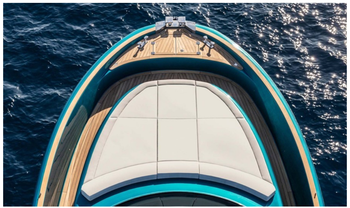
Aerial Bow View