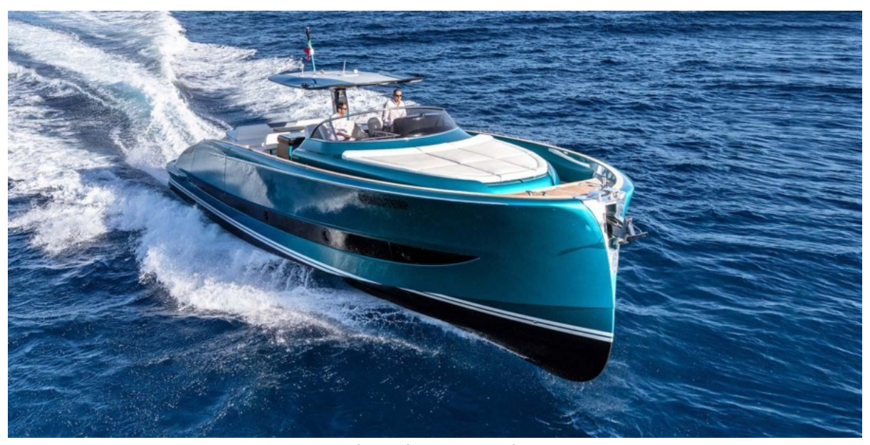
Starboard Bow Running