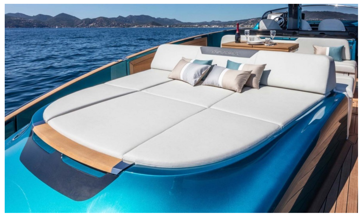
Stern Sunbathing Mattresses