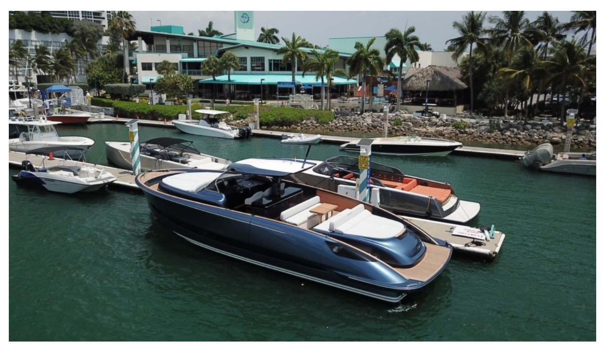
Port Aft View at Dock