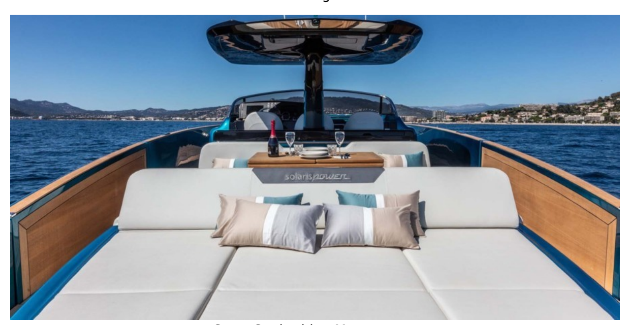
Stern Sunbathing Mattresses