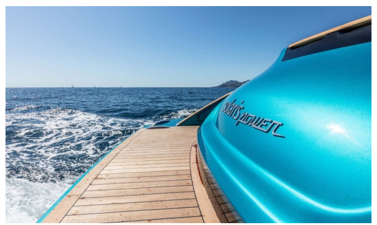
Swim Platform and Tender Garage