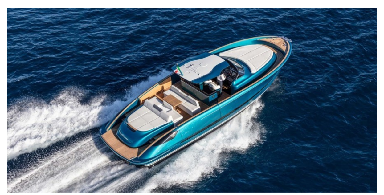
Starboard Aft Running