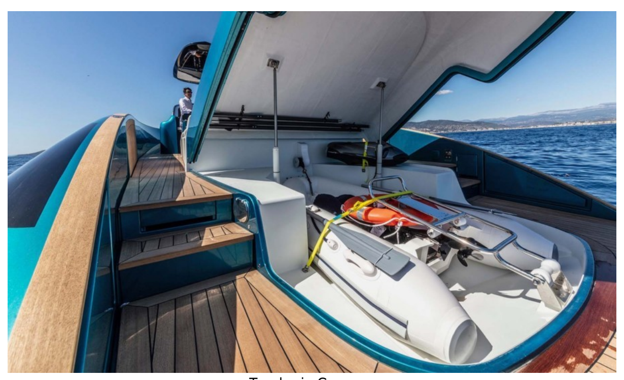
Tender in Garage