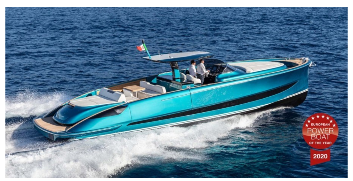
Starboard Side Running