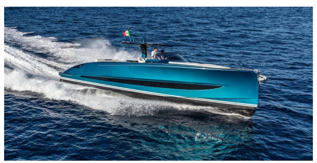
Starboard Profile Running