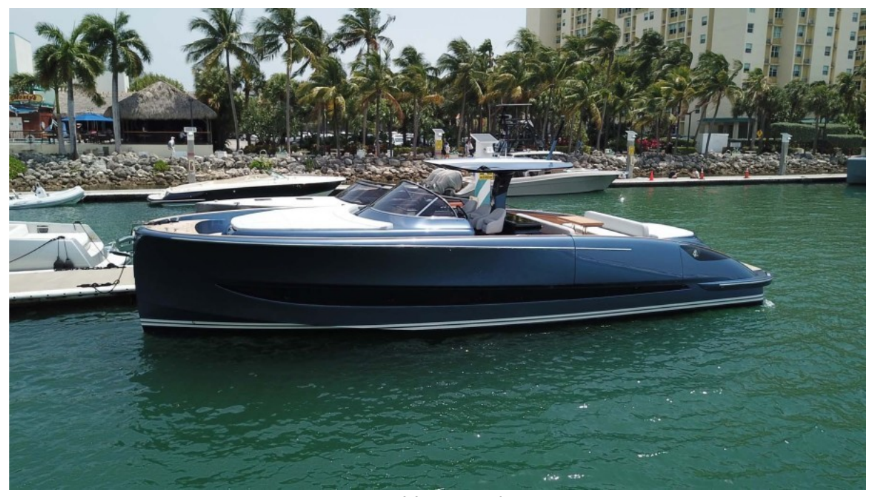
Portside at Dock