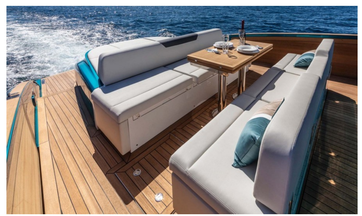
Deck Seating and Table