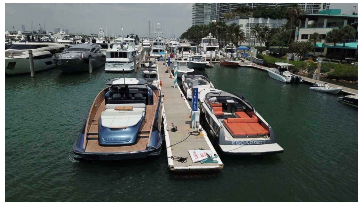
Stern View at Dock