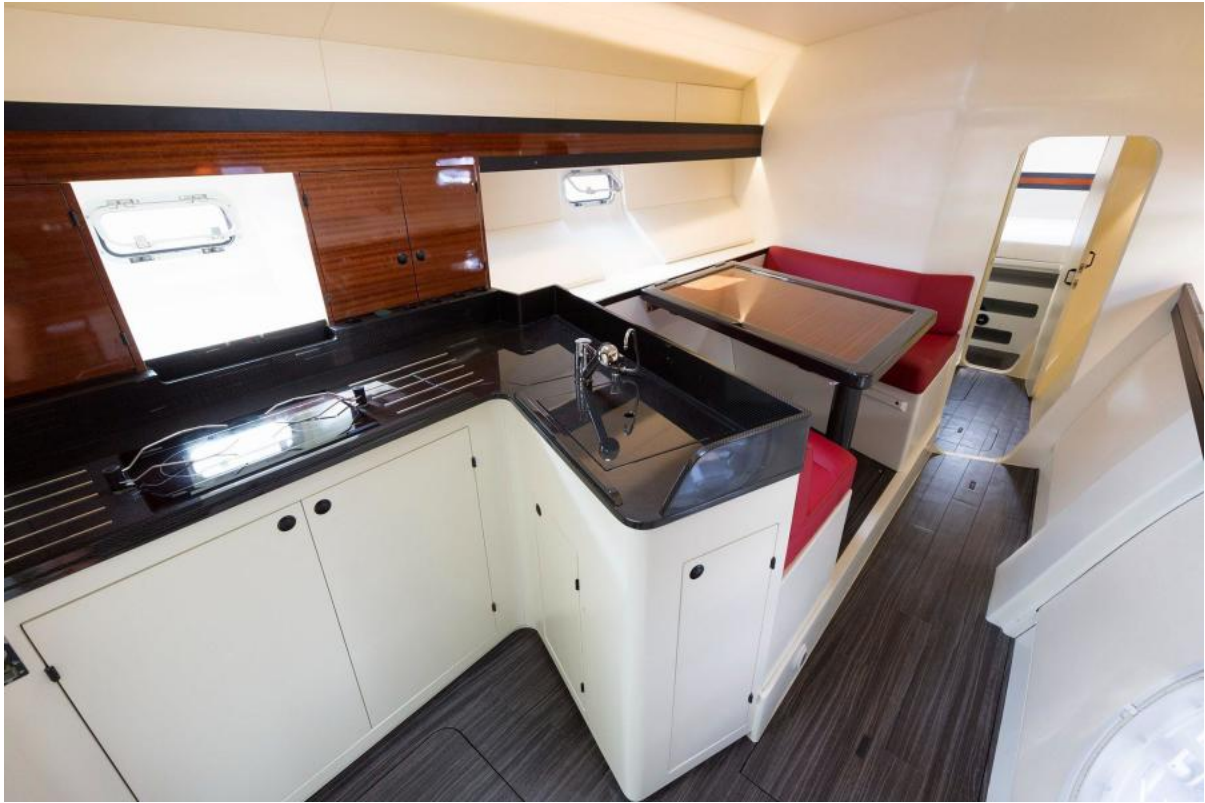
Galley looking aft