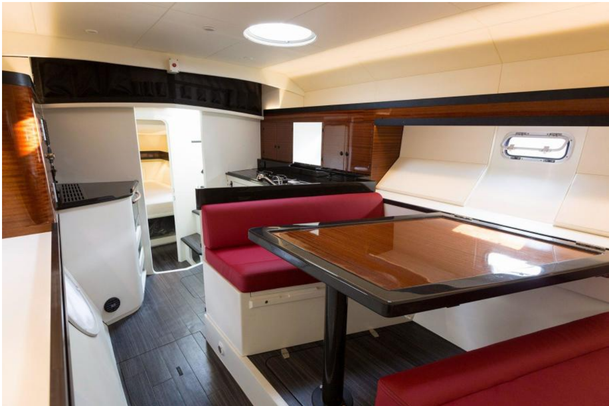
Salon looking forward