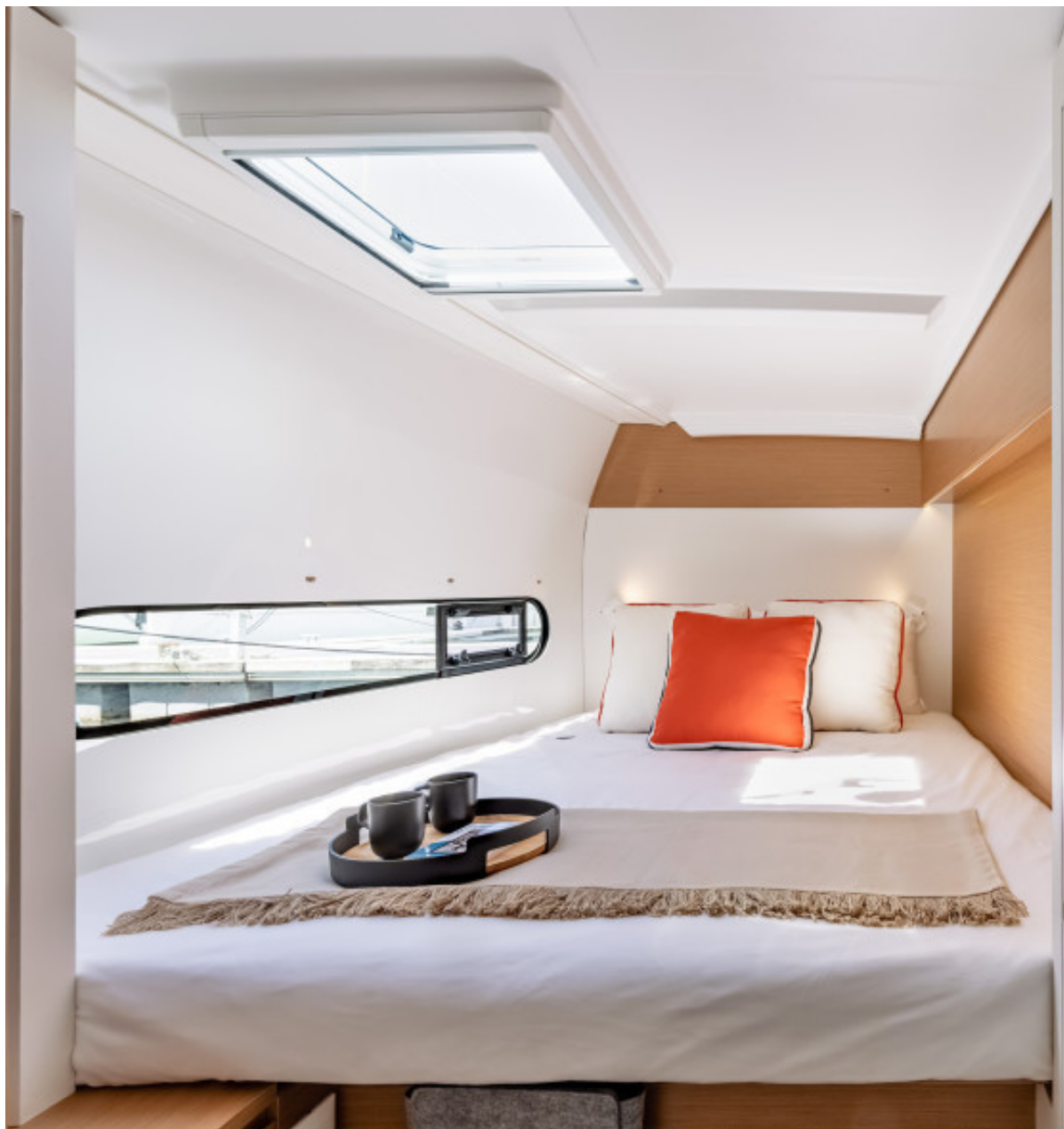
Excess 11 - Mention obligatoire/Mandatory credit: Photo Nicolas Claris