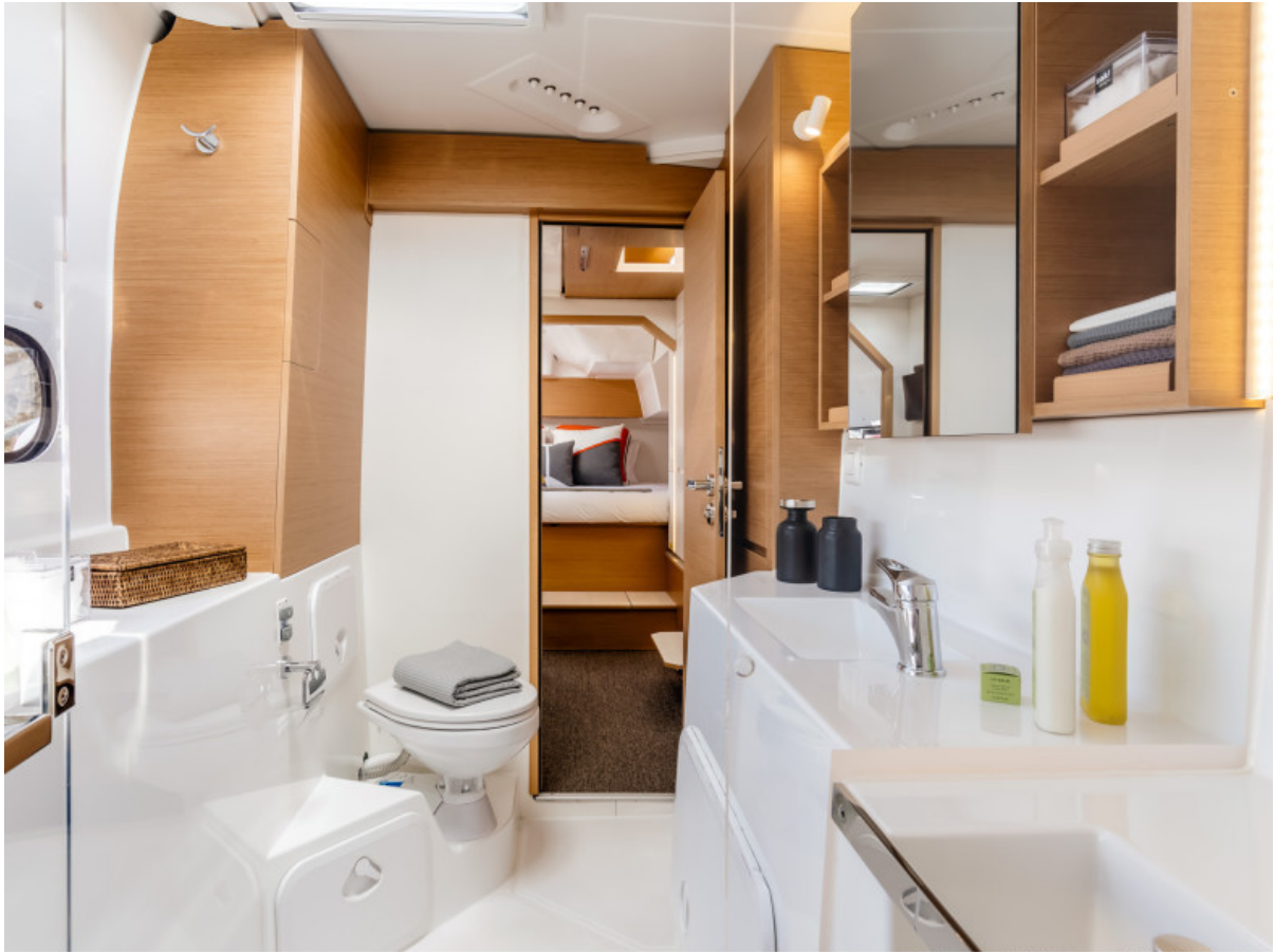
Excess 11 - Mention obligatoire/Mandatory credit: Photo Nicolas Claris