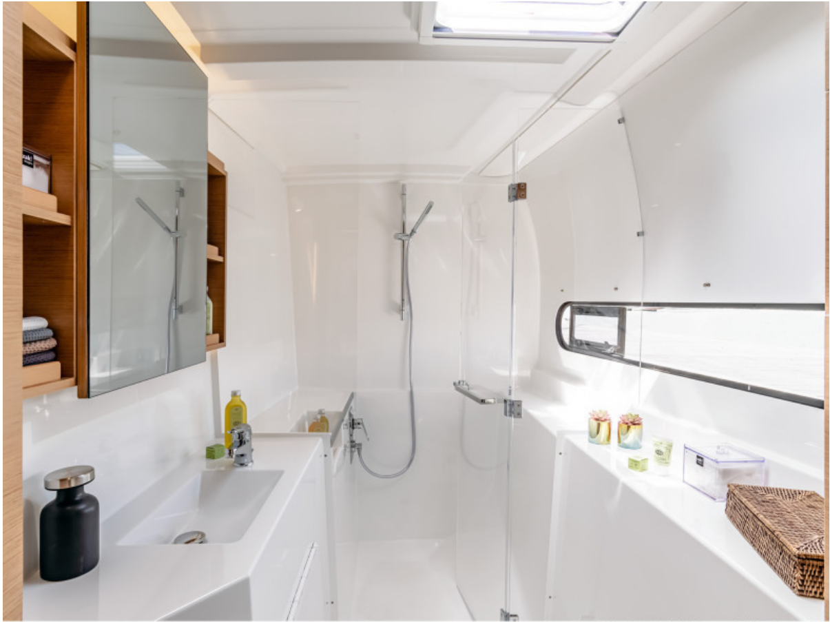
Excess 11