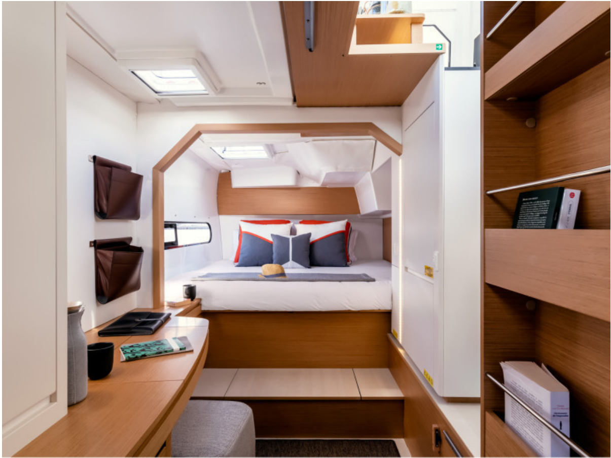
Excess 11 - Mention obligatoire/Mandatory credit: Photo Nicolas Claris