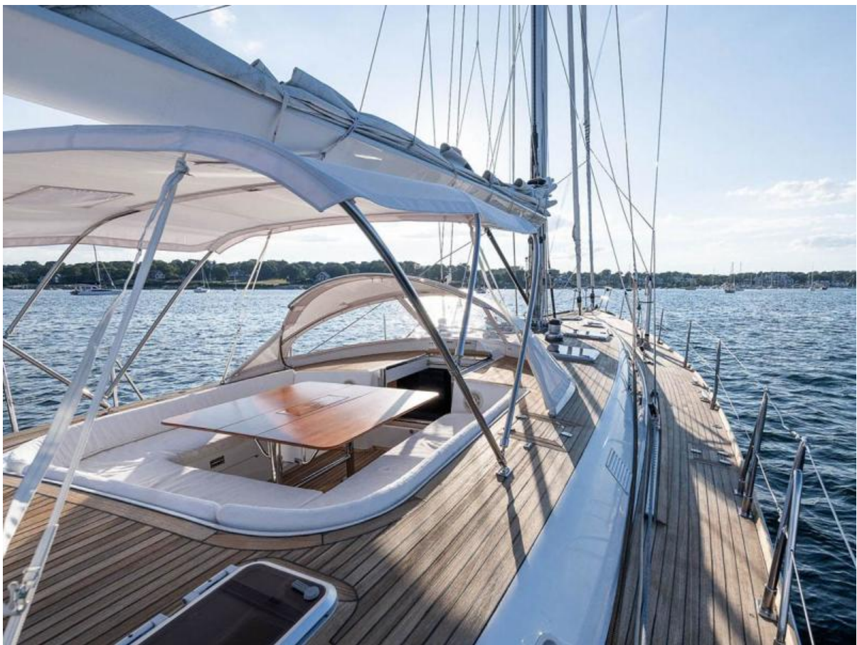
Stbd. Deck, Looking Fwd.