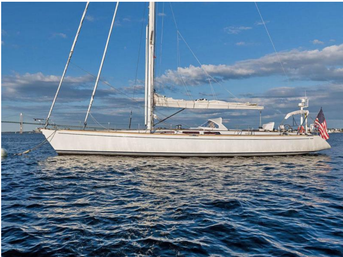
Port Profile, Mooring