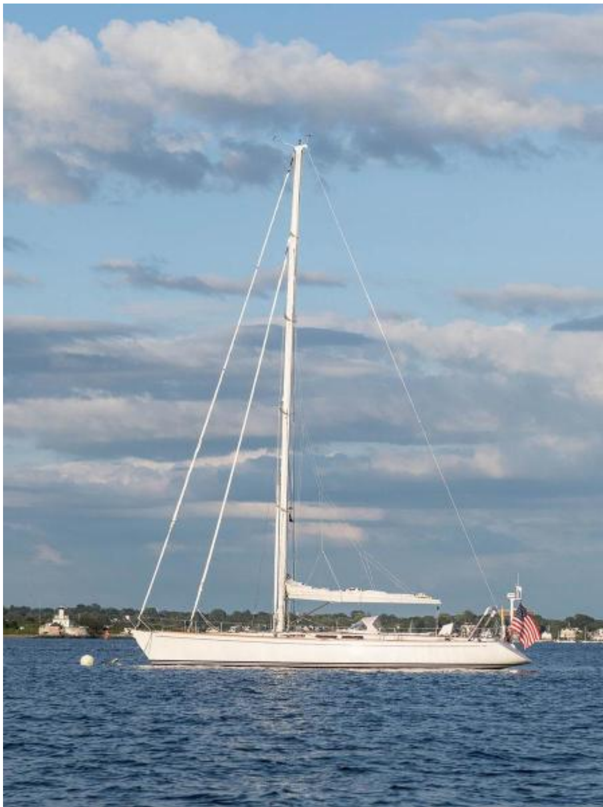
Port Profile, Mooring