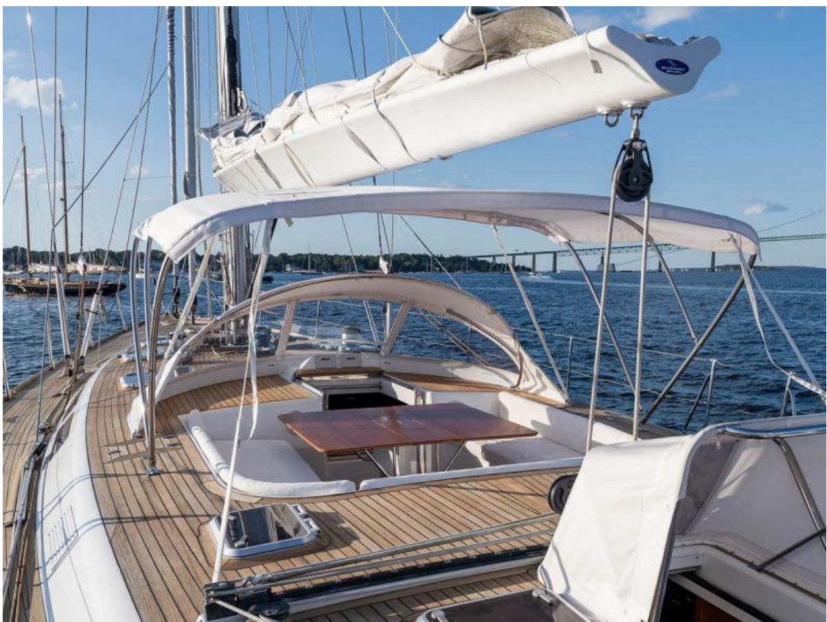
Center Cockpit, Looking Fwd.