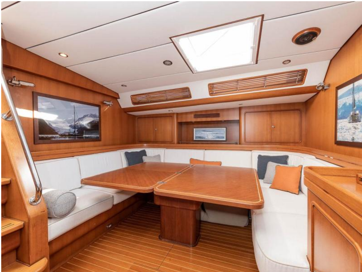
Port Salon Settee