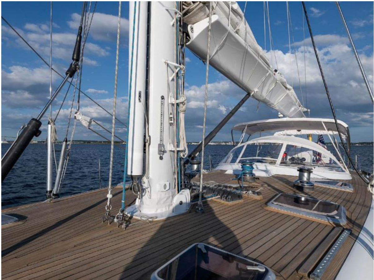
Mast Base, Looking Aft