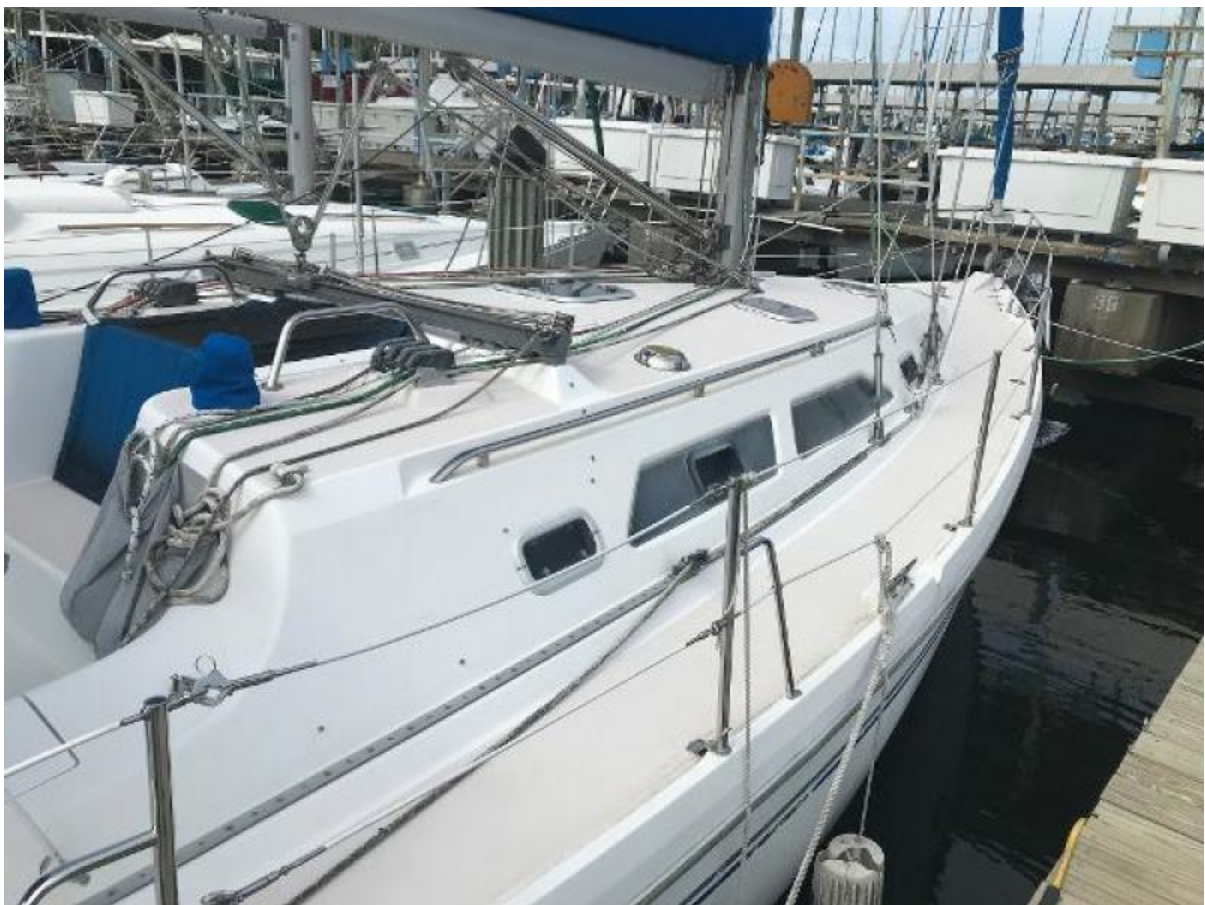
1999 Catalina 380 Deck