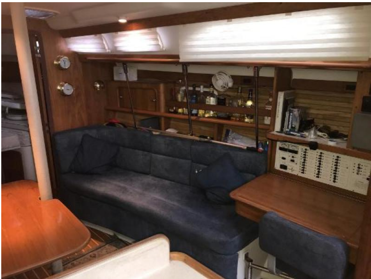
1999 Catalina 380 Settee