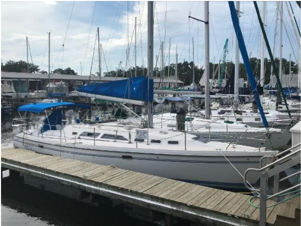
1999 Catalina 380 Profile