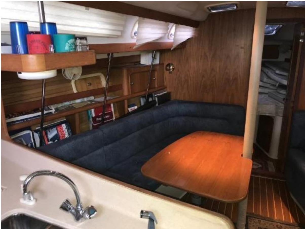
1999 Catalina 380 Dinette