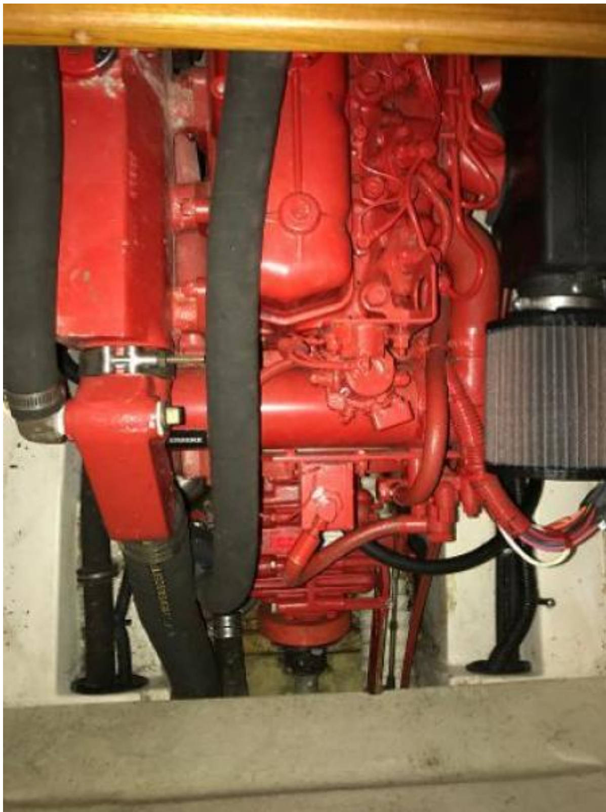
1999 Catalina 380 Engine