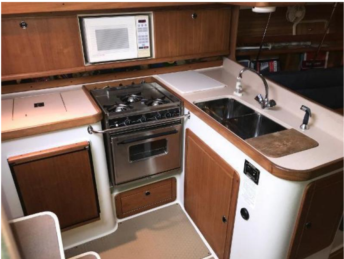
1999 Catalina 380 Galley