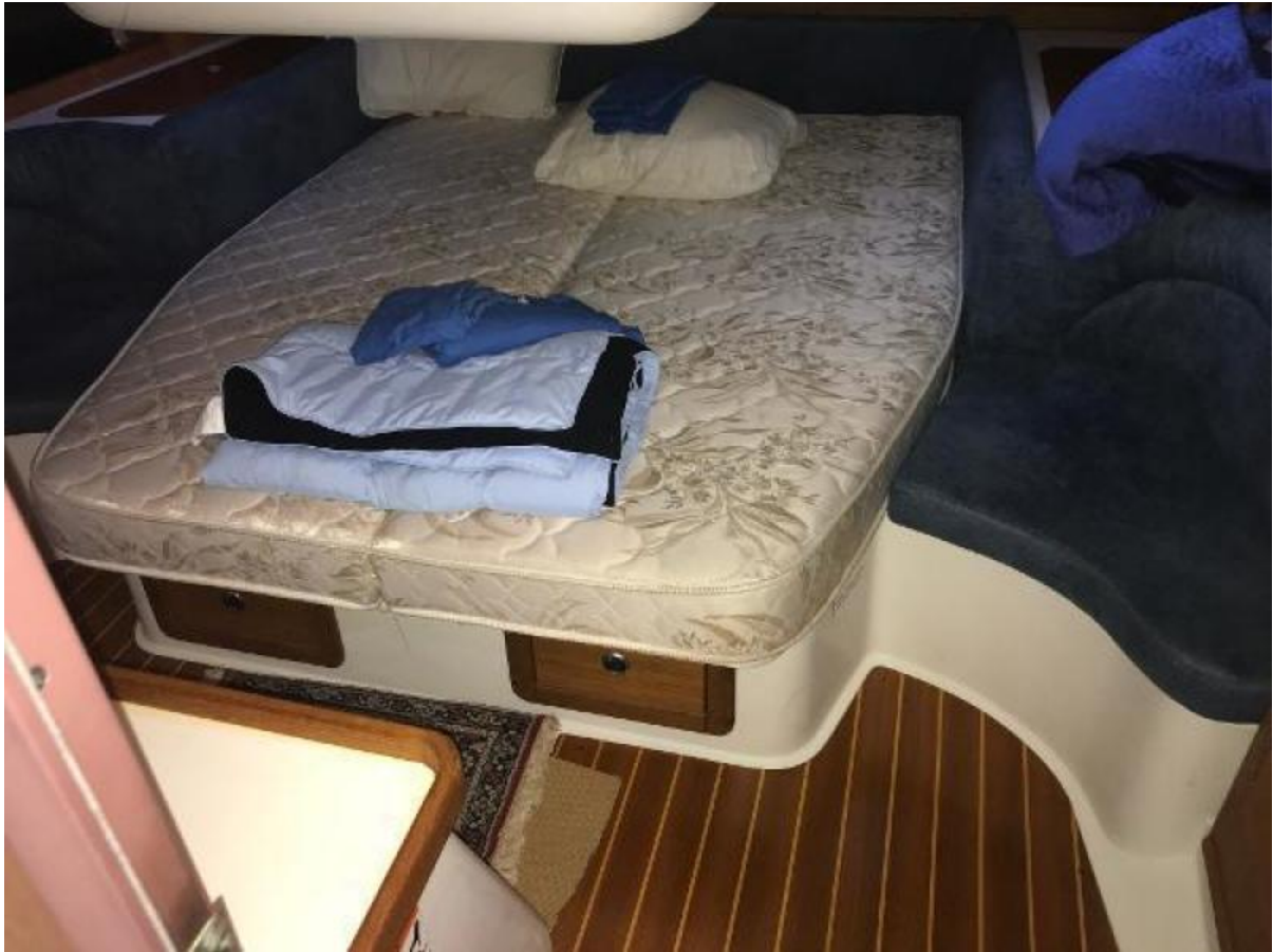
1999 Catalina 380 Master Cabin