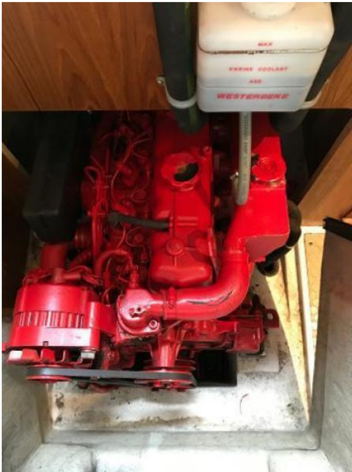
1999 Catalina 380 Engine, rear