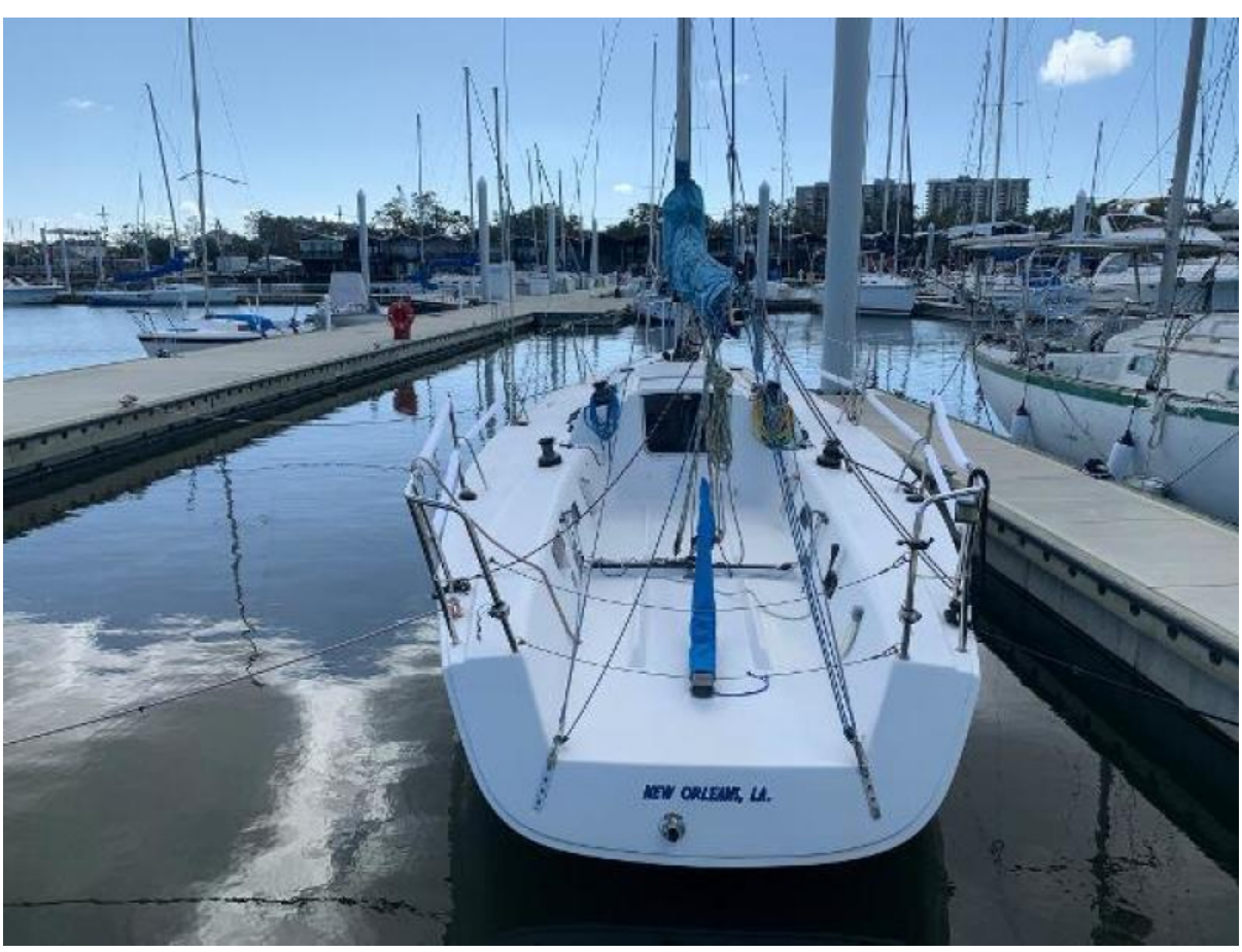
2006 J Boats J/92s Transom & Cockpit