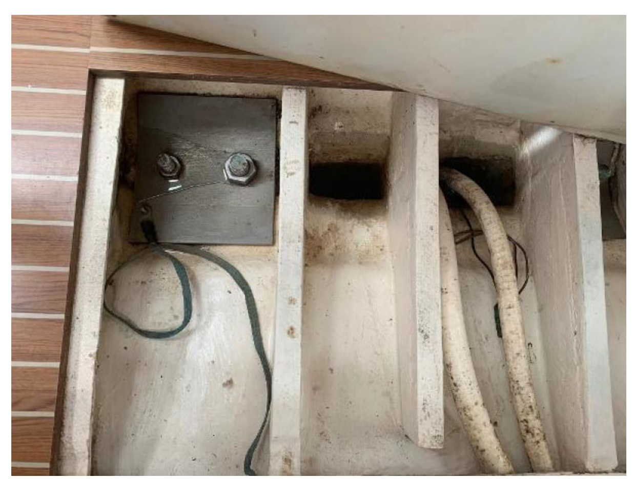
2006 J Boats J/92s Bilge