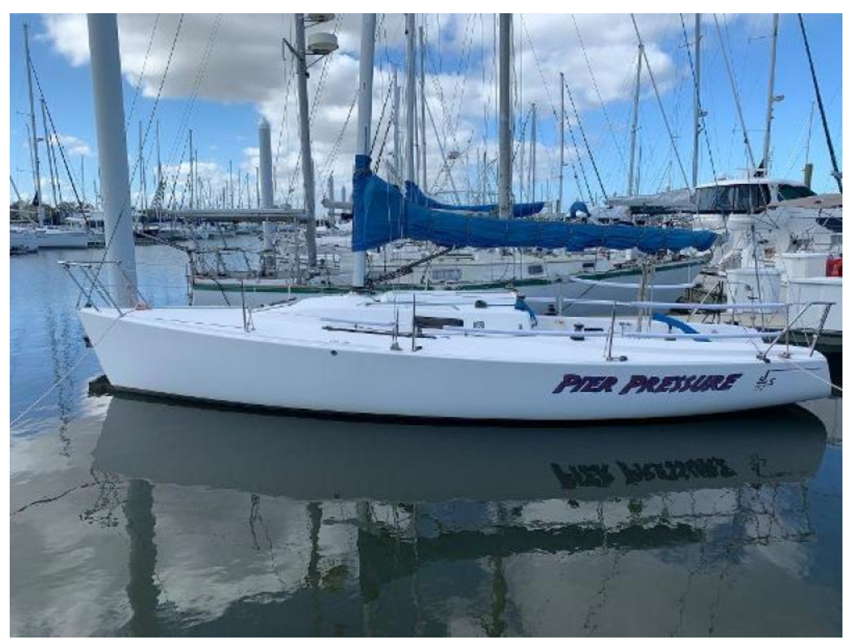
2006 J Boats J/92s Profile