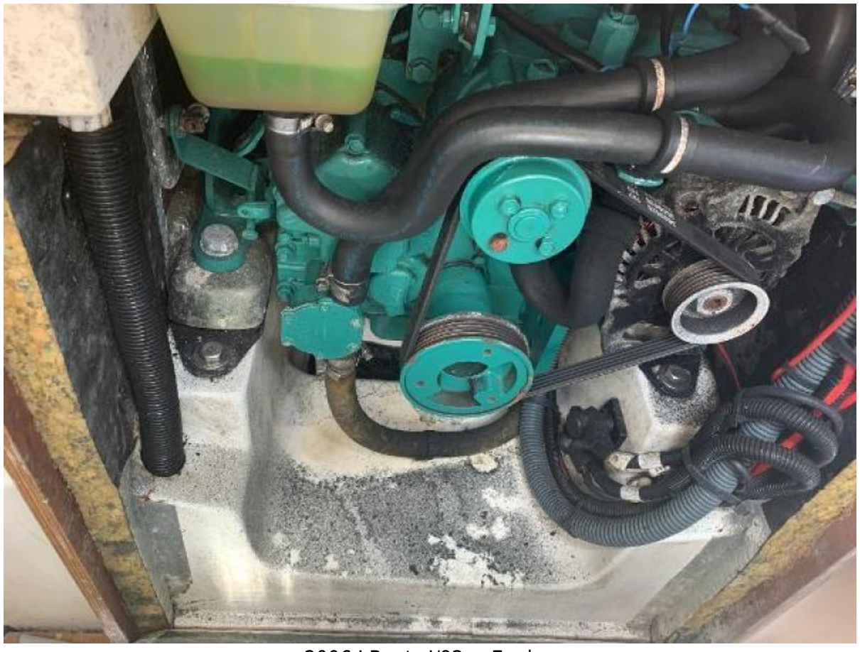
2006 J Boats J/92s Engine