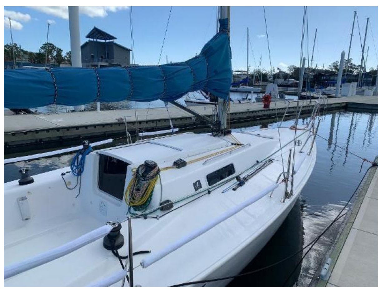
2006 J Boats J/92s Deck