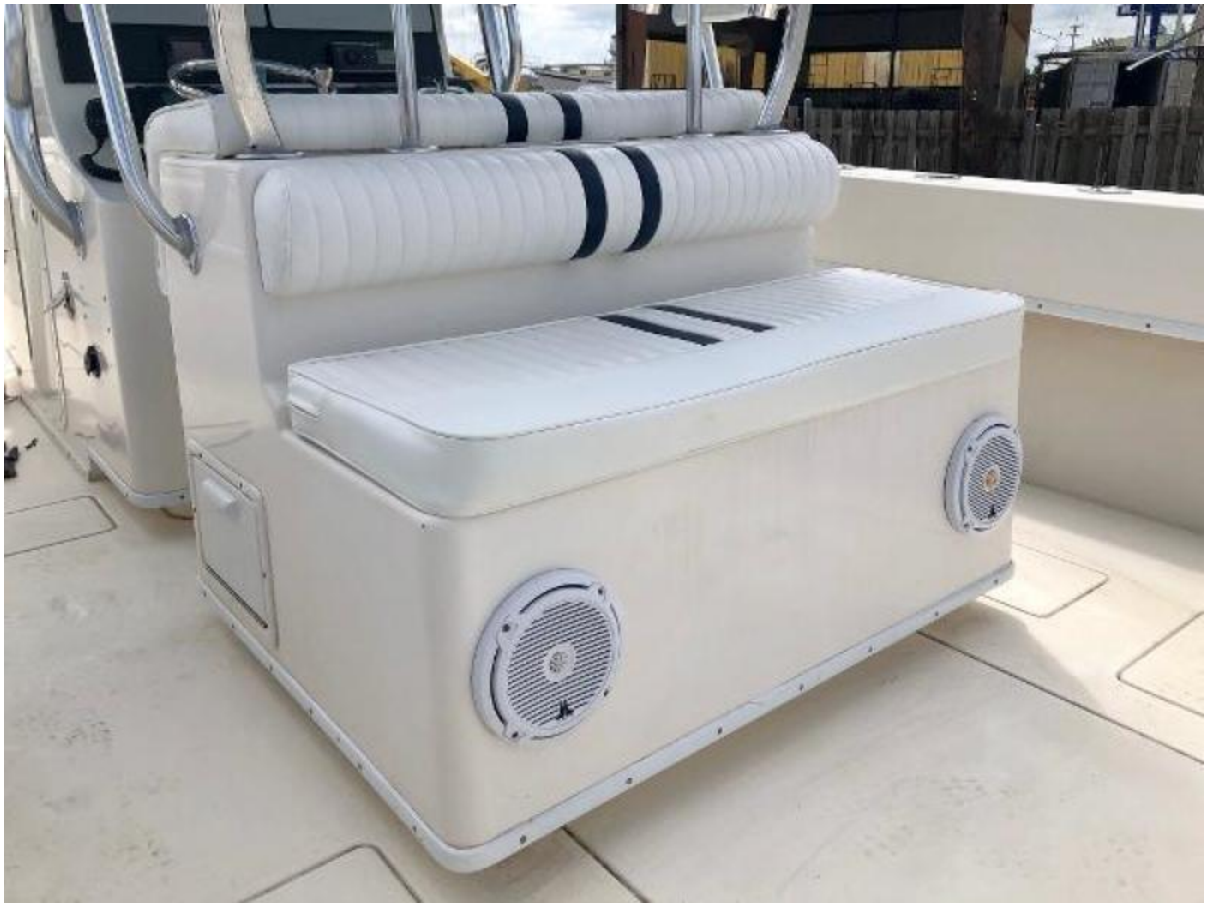
2010 Contender 32 ST