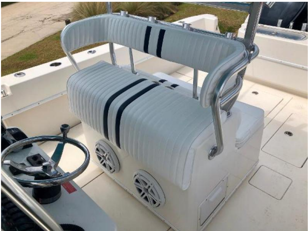
2010 Contender 32 ST