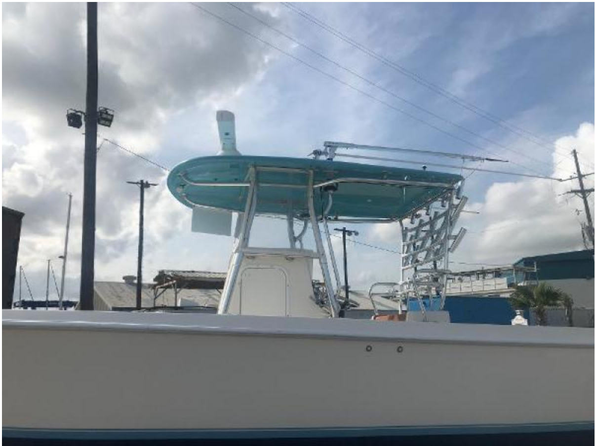
2010 Contender 32 ST