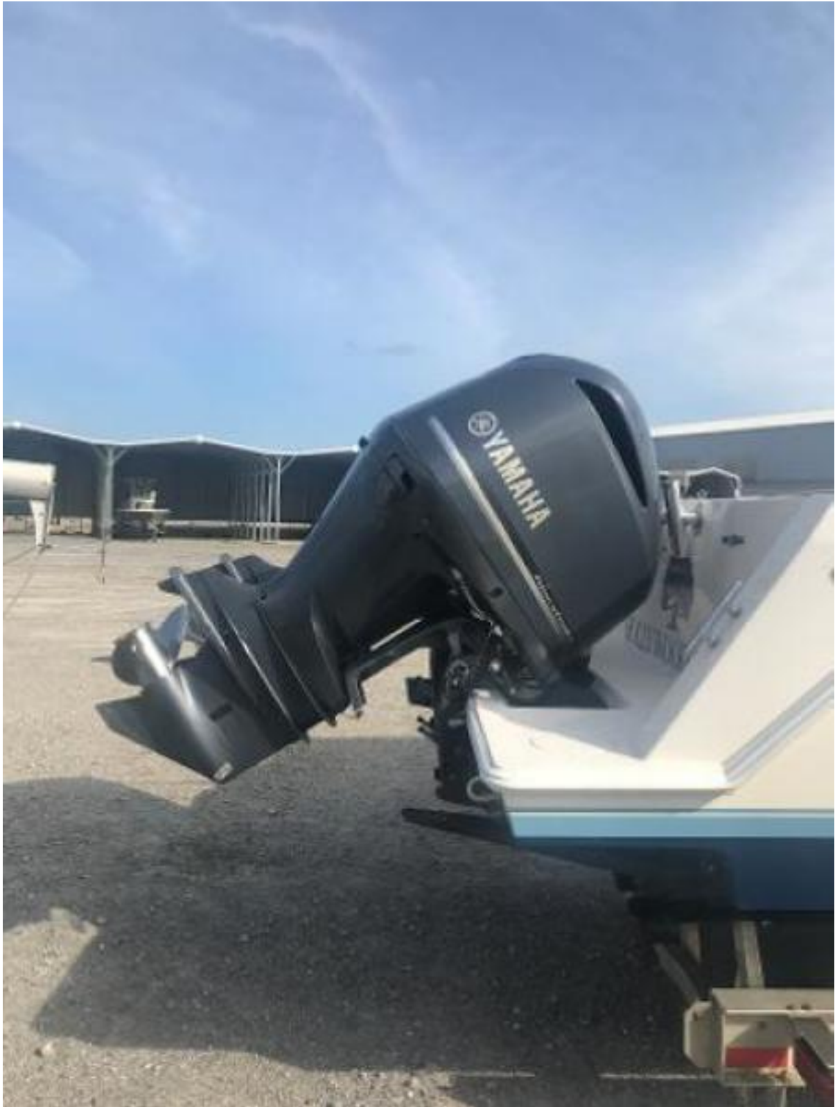
2010 Contender 32 ST