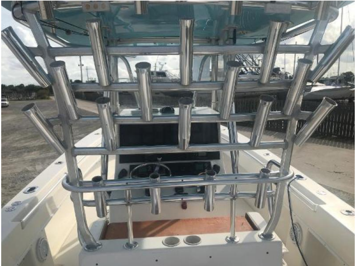
2010 Contender 32 ST