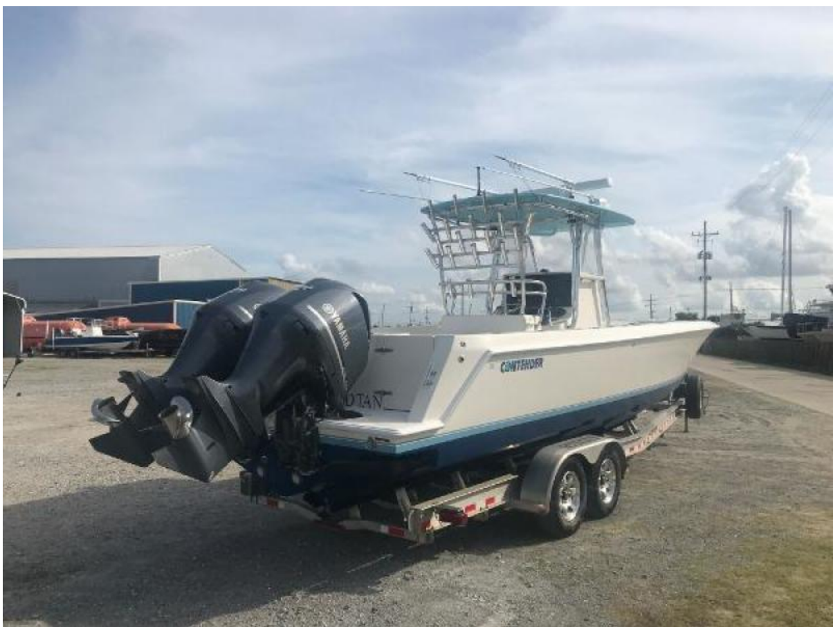
2010 Contender 32 ST