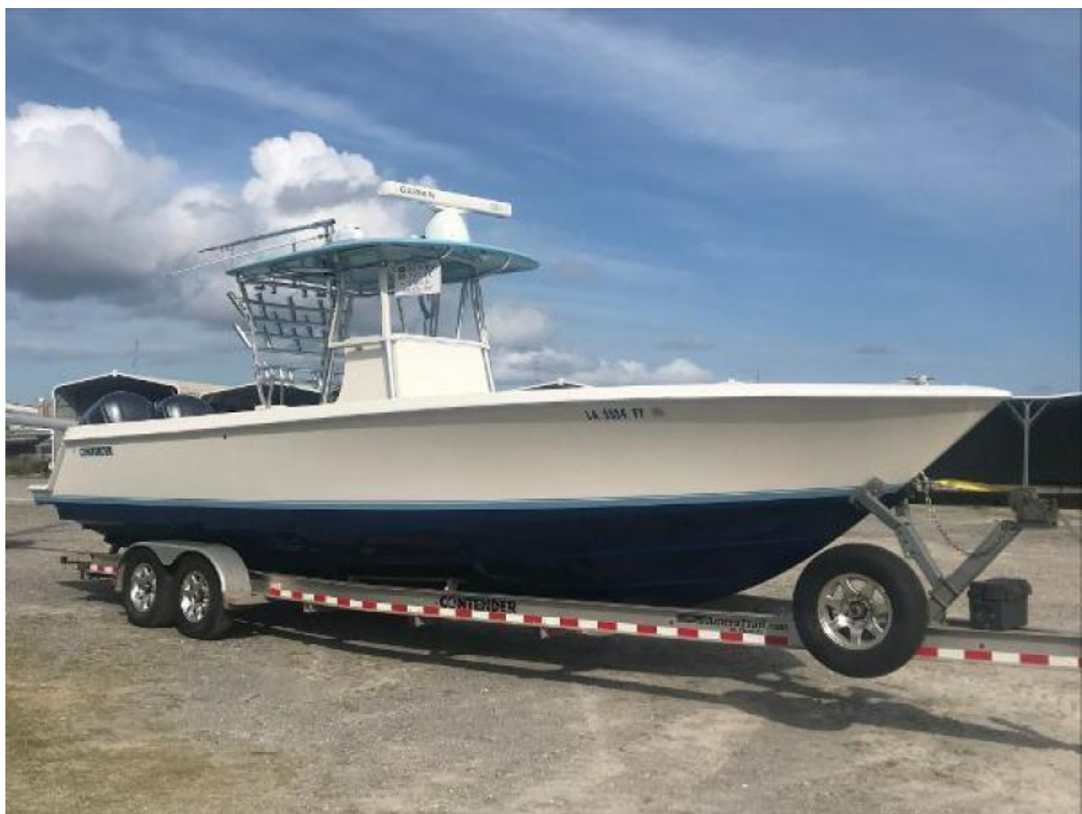
2010 Contender 32 ST