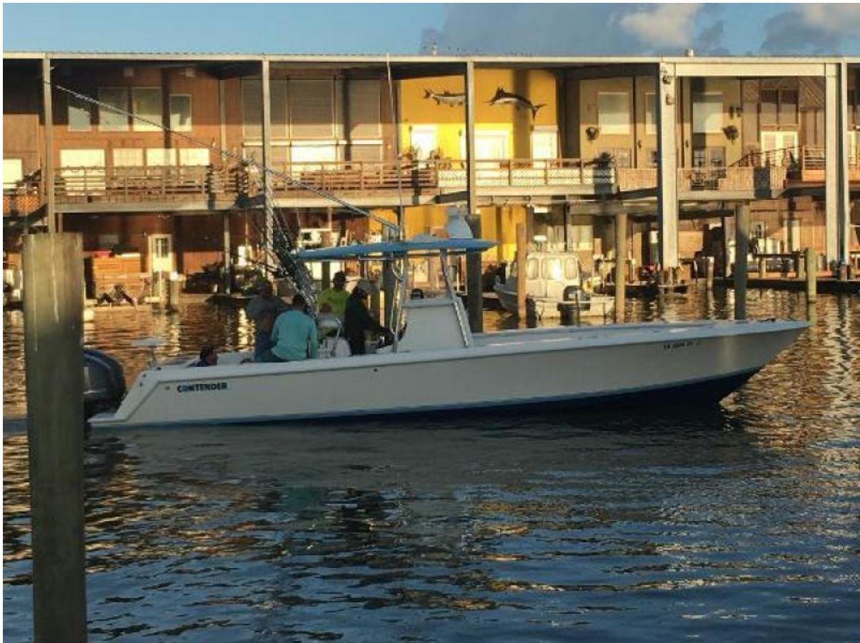
2010 Contender 32 ST