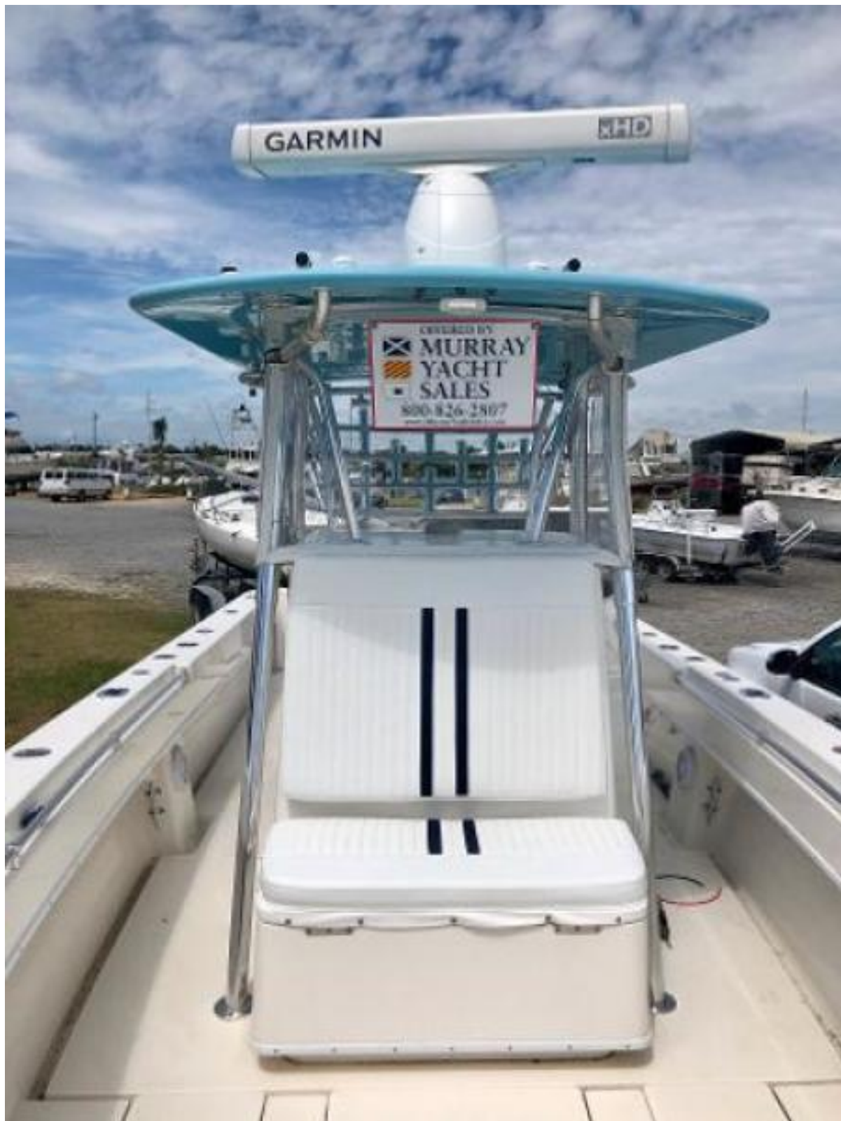
2010 Contender 32 ST