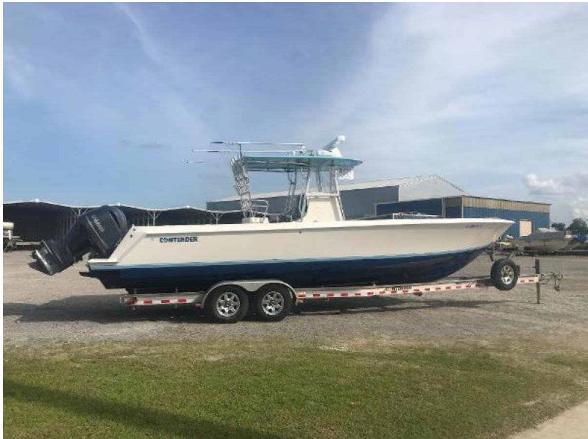
2010 Contender 32 ST