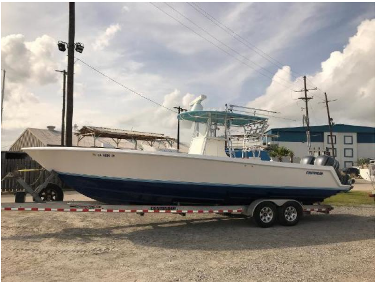
2010 Contender 32 ST