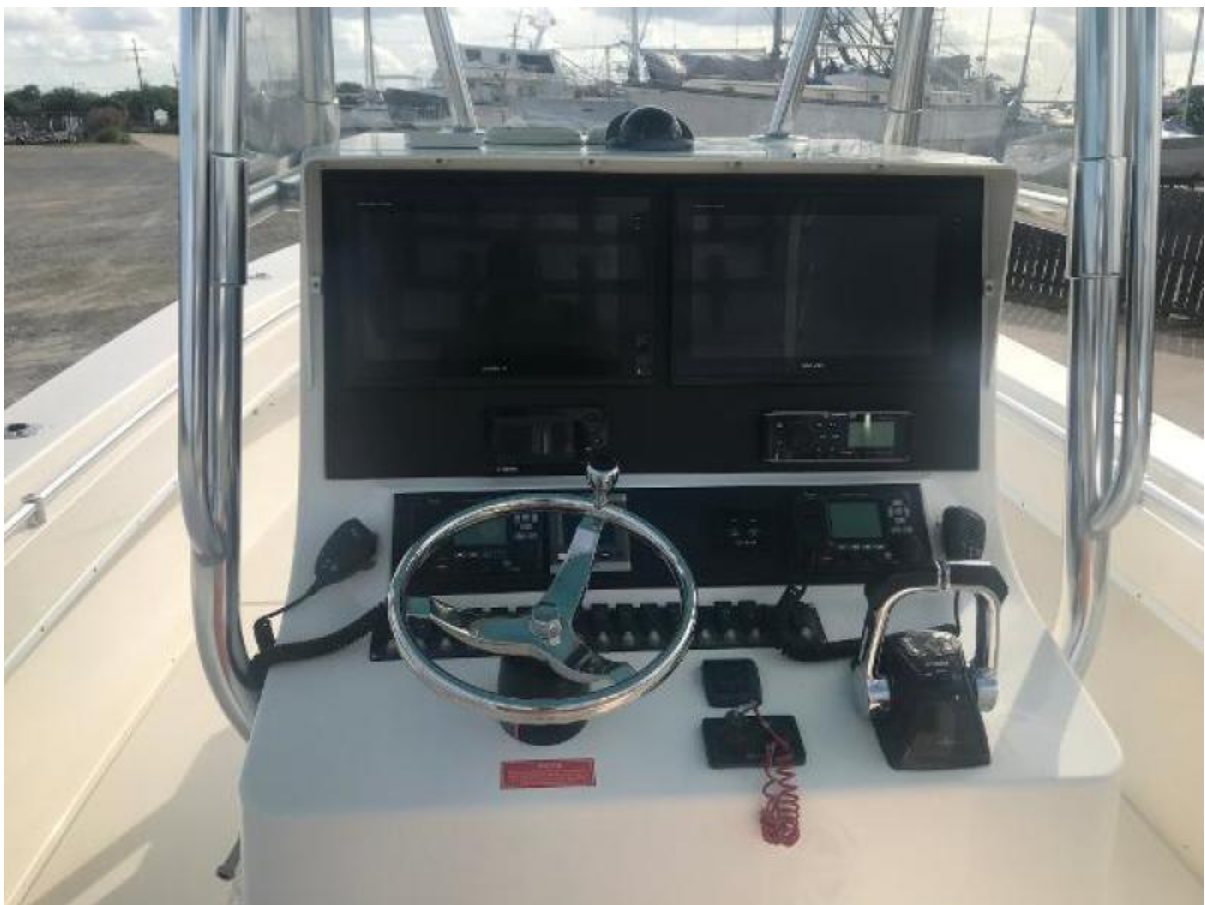
2010 Contender 32 ST