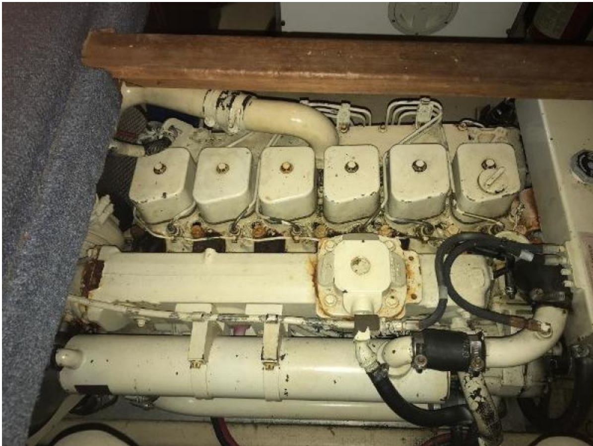
1997 Nordic Tugs 32