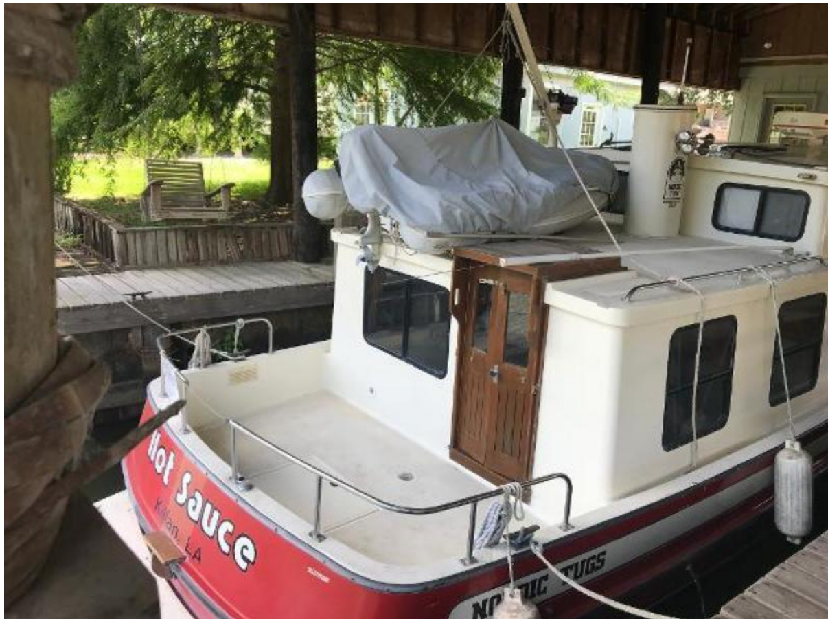
1997 Nordic Tugs 32