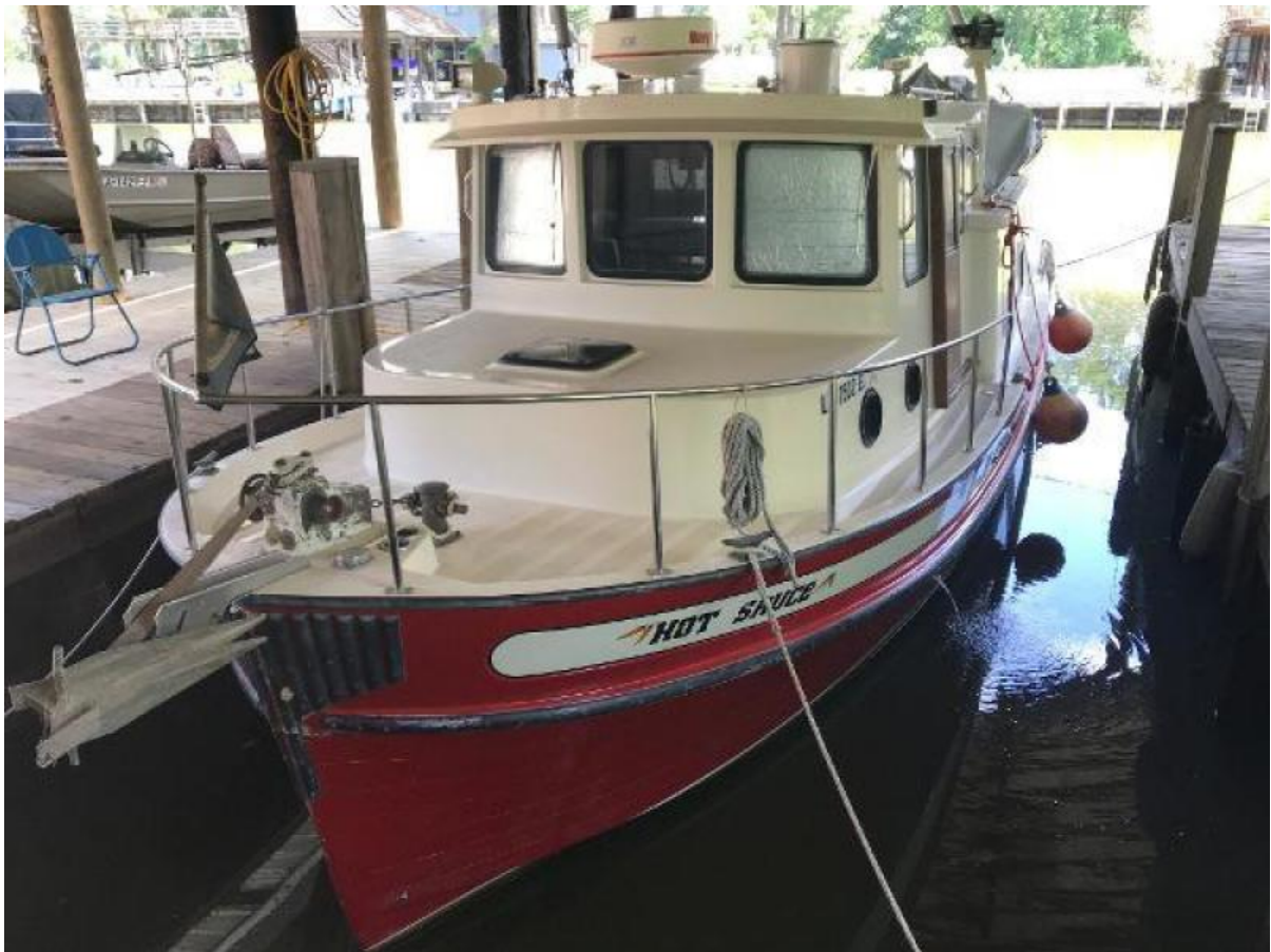
1997 Nordic Tugs 32