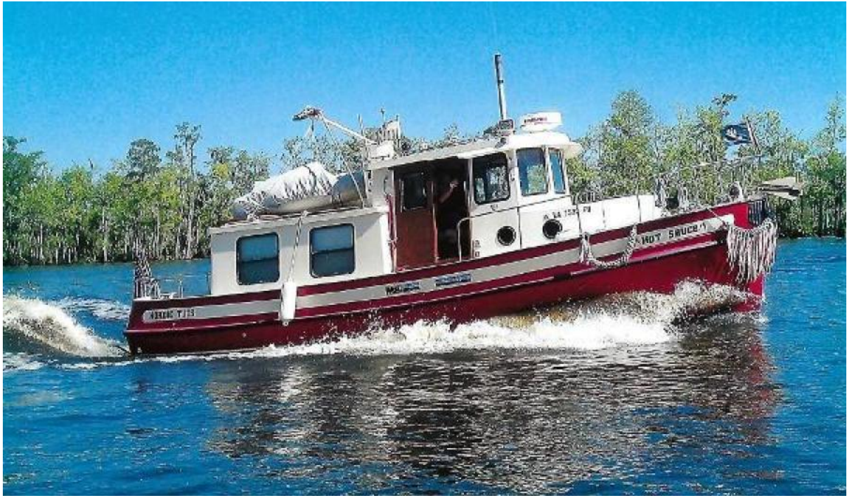
1997 Nordic Tugs 32