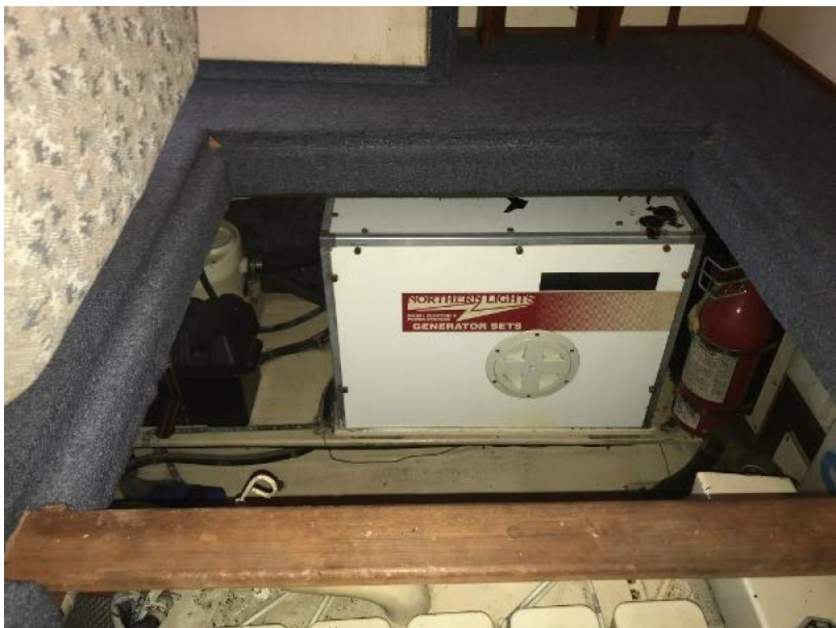
1997 Nordic Tugs 32