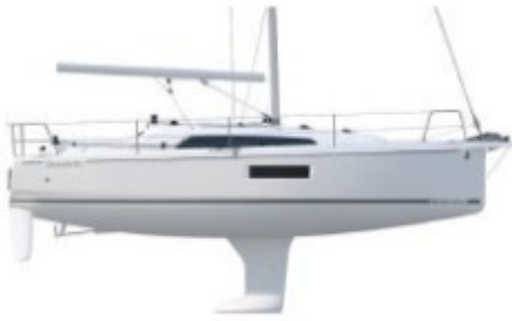
Profile - Standard