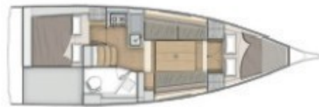
2 cabins + 1 head