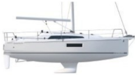
Profile - Shallow draught