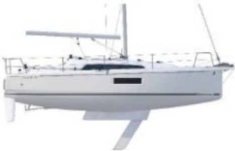
Profile - Swing keel version