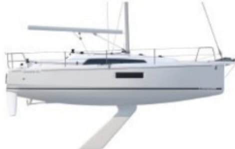
Profile - Lifting keel version