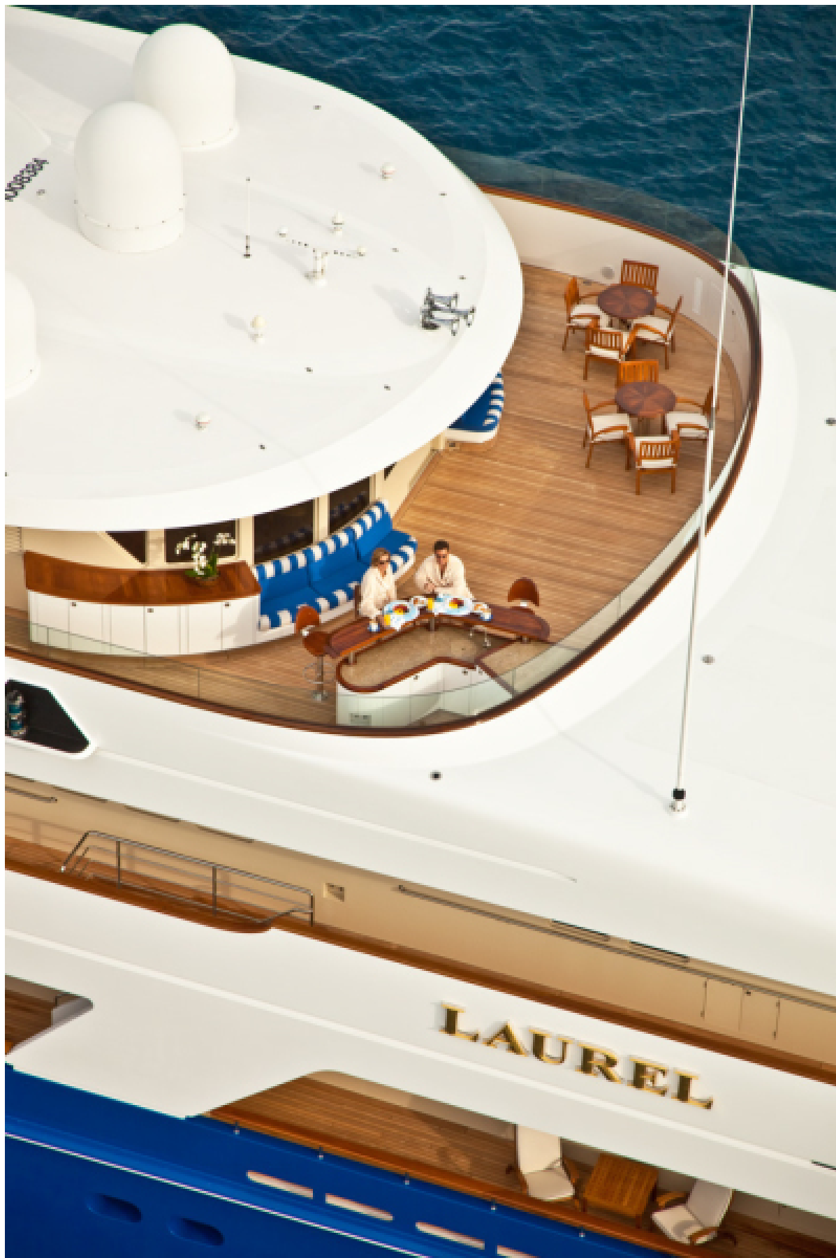
LAUREL 240'/73.15m Delta 2006/2014 Sun Deck, Forward