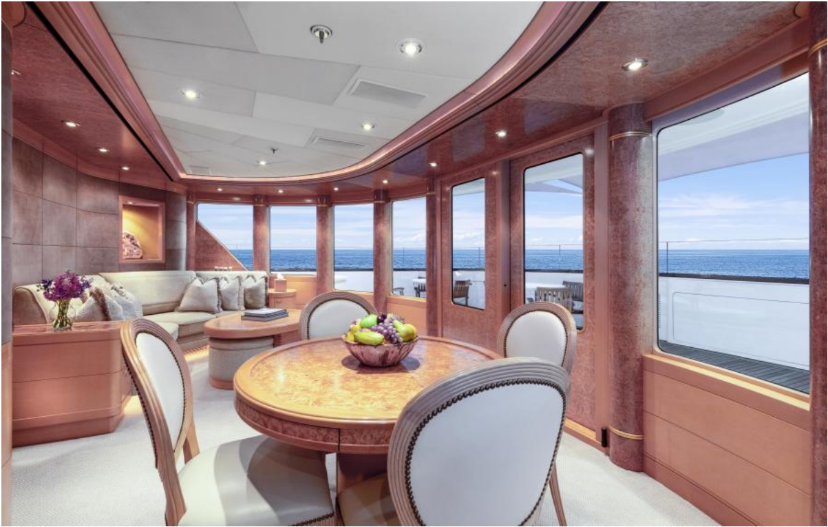
LAUREL 240'73.15m Delta 2006/2014 Observation Room, Sun Deck Forward