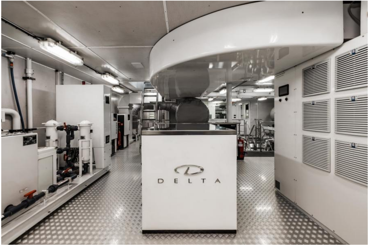
LAUREL 240'/73.15m Delta 2006/2014 Engine Room