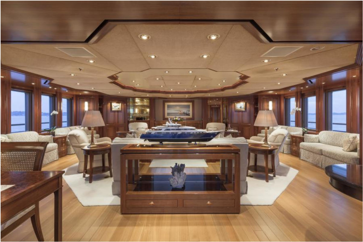
LAUREL 240'/73.15m Delta 2006/2014 Main Salon