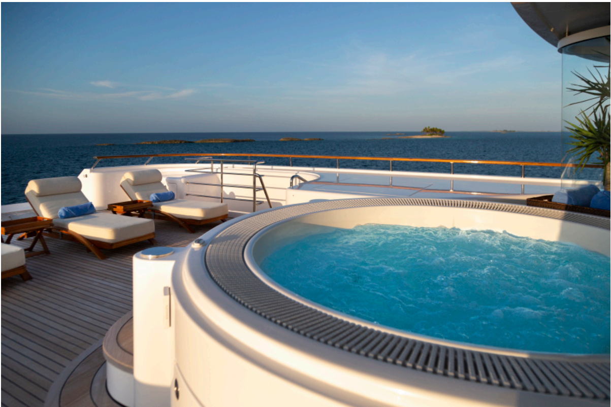
LAUREL 240'73.15m Delta 2006/2014 Jacuzzi