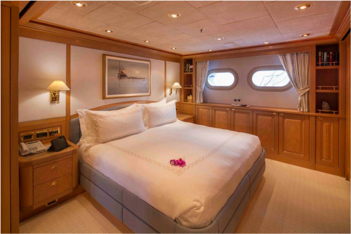
LAUREL 240'/73.15m Delta 2006/2014 Guest Stateroom