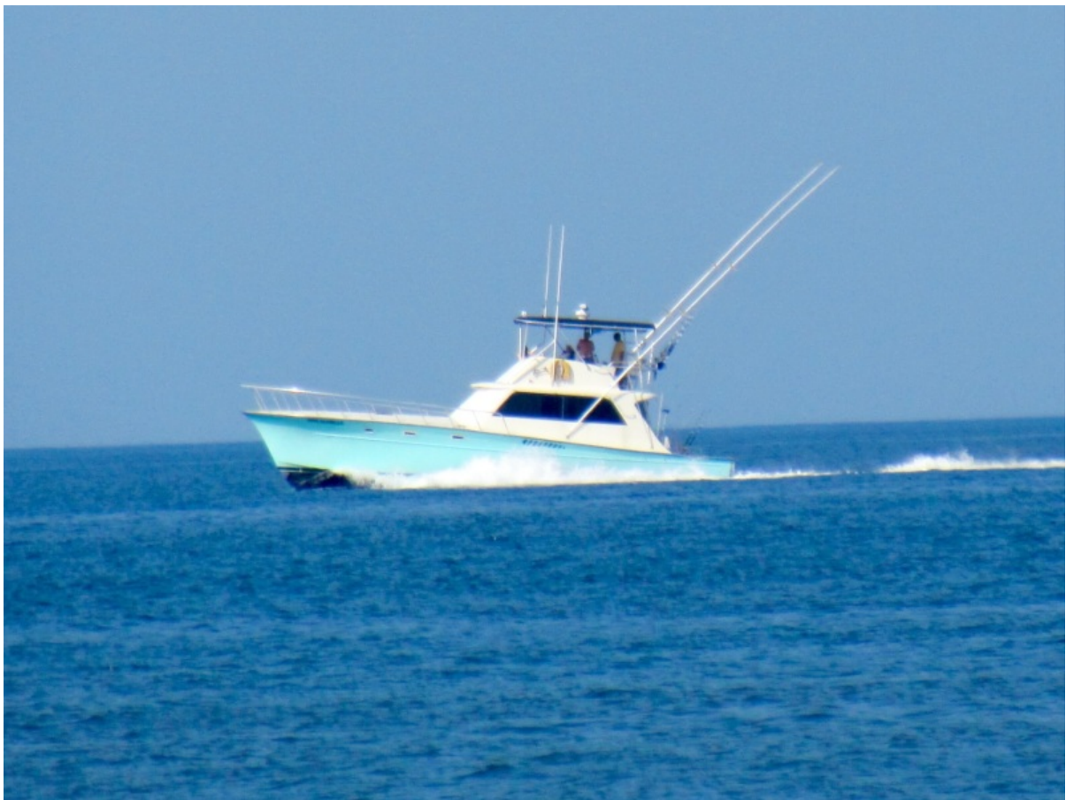
50 Daytona 1984