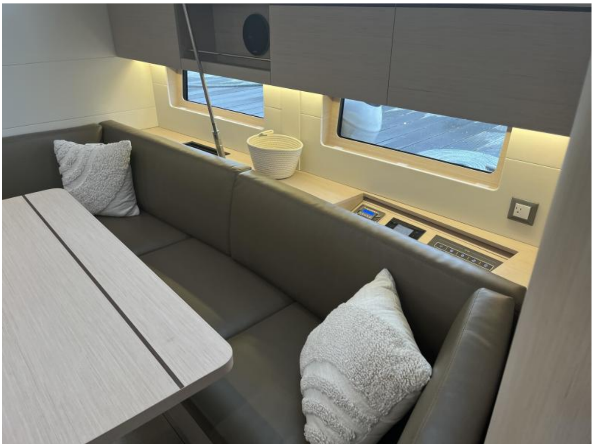
2023 Beneteau OC46.1 #400