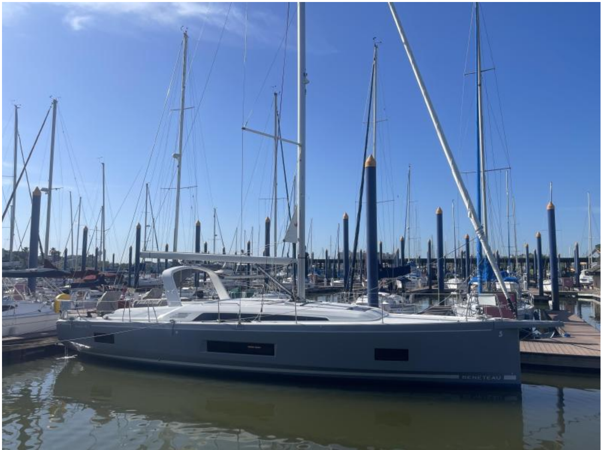
2023 Beneteau OC46.1 #400