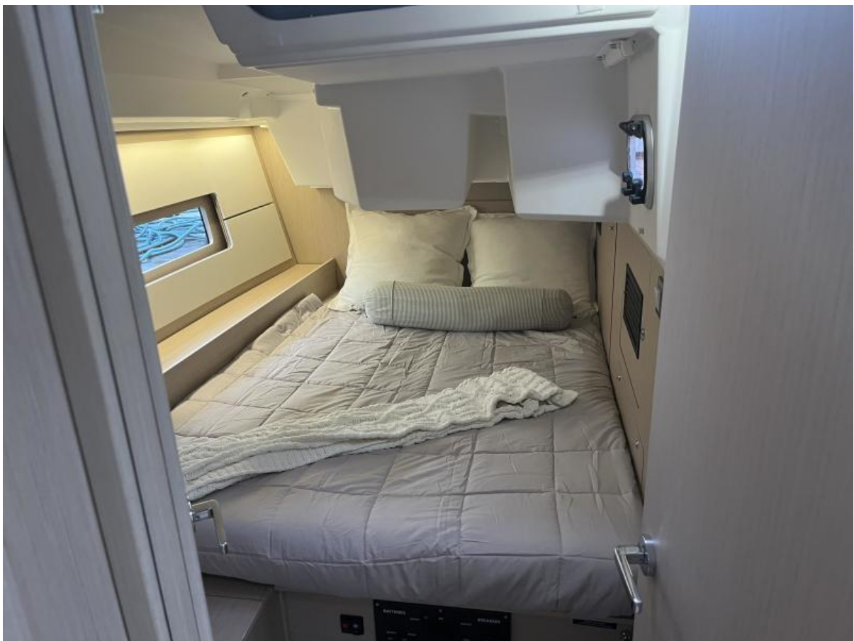
2023 Beneteau OC46.1 #400