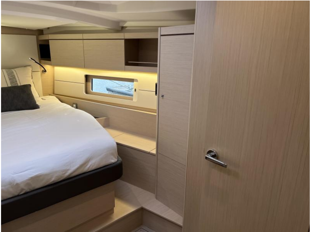
2023 Beneteau OC46.1 #400