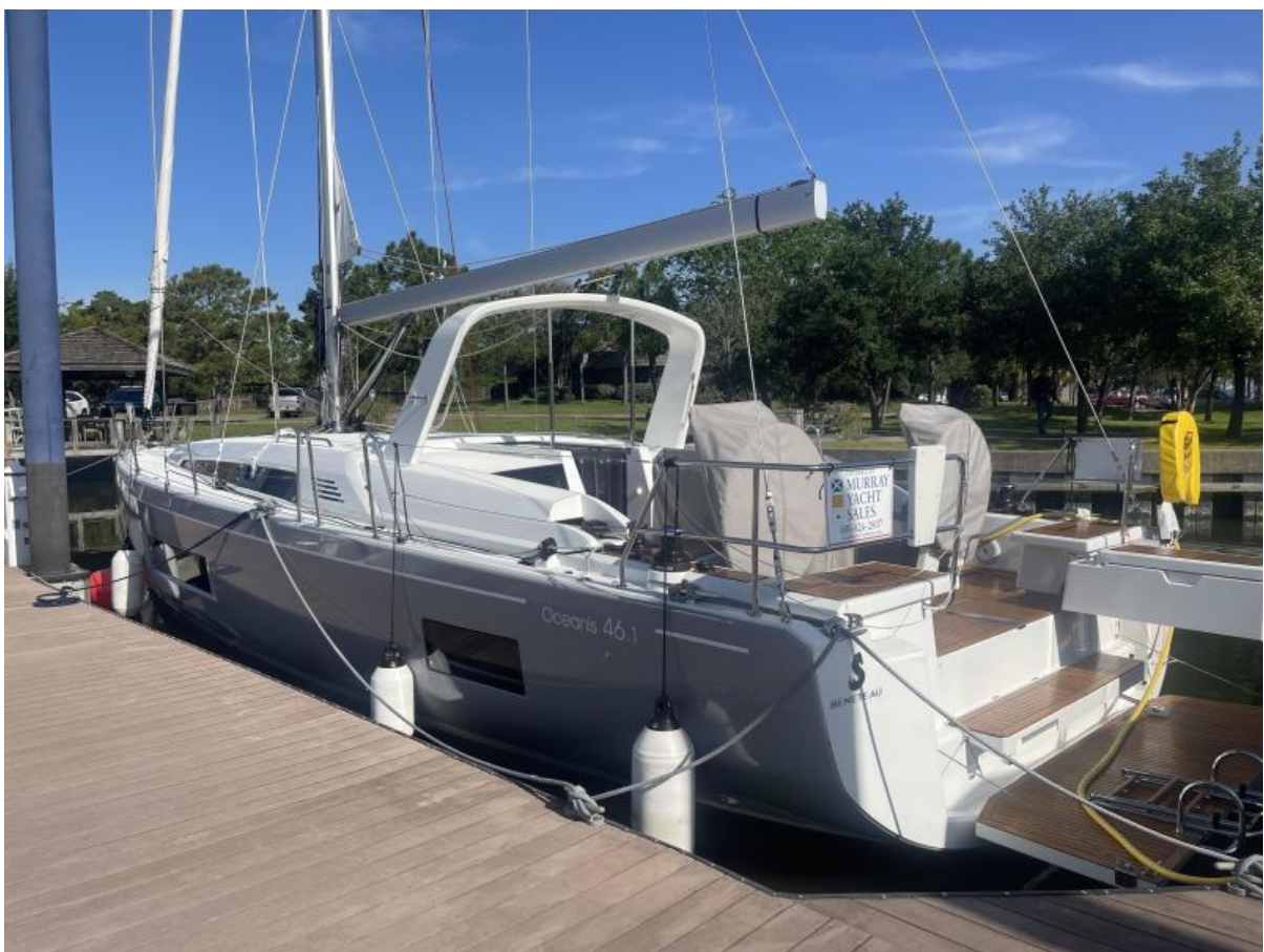
2023 Beneteau OC46.1 #400