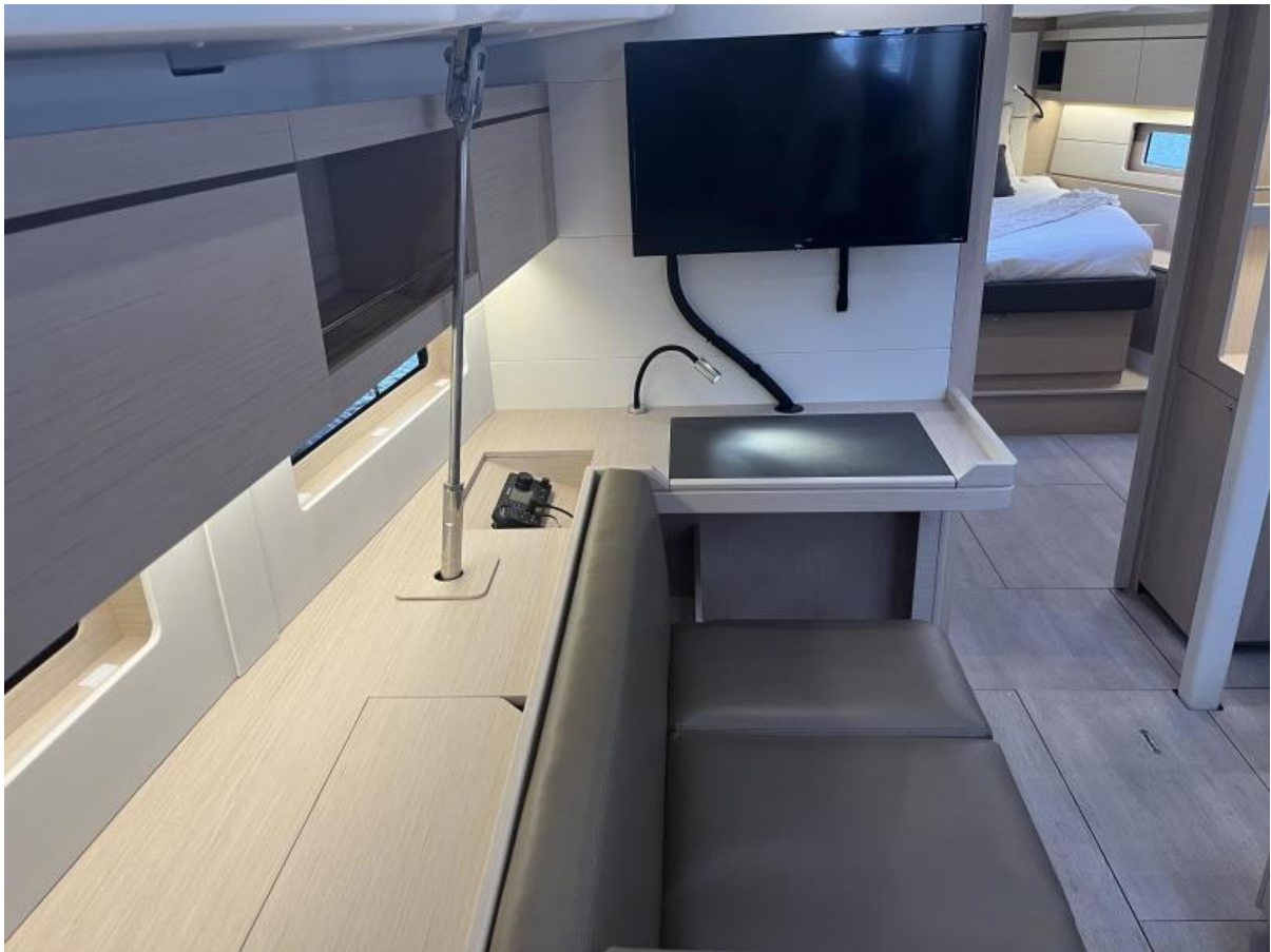
2023 Beneteau OC46.1 #400