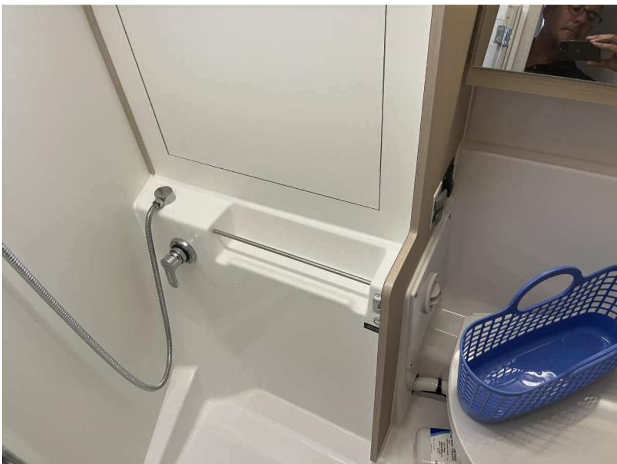
2023 Beneteau OC46.1 #400