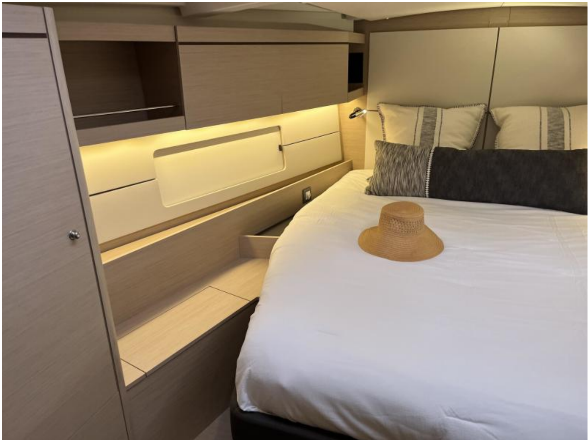
2023 Beneteau OC46.1 #400