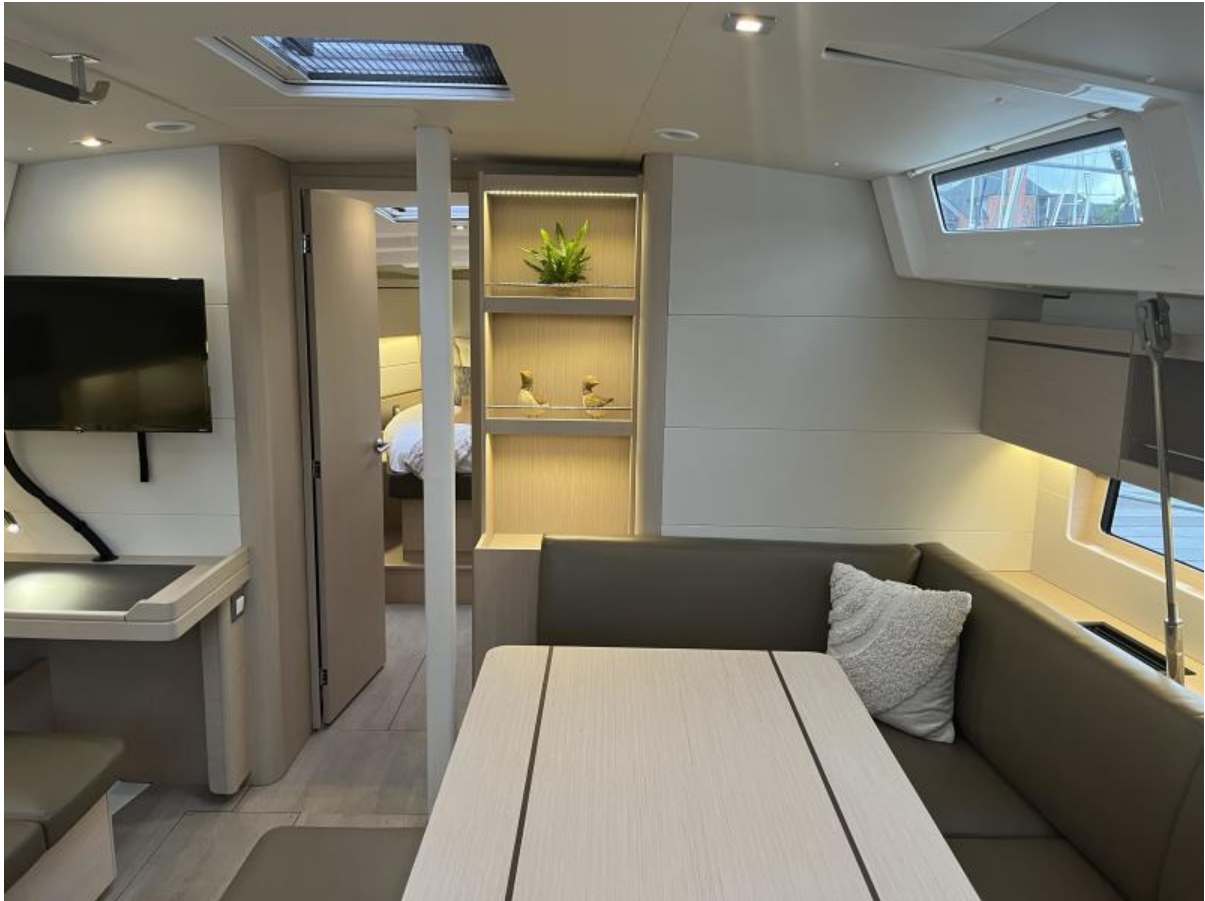
2023 Beneteau OC46.1 #400