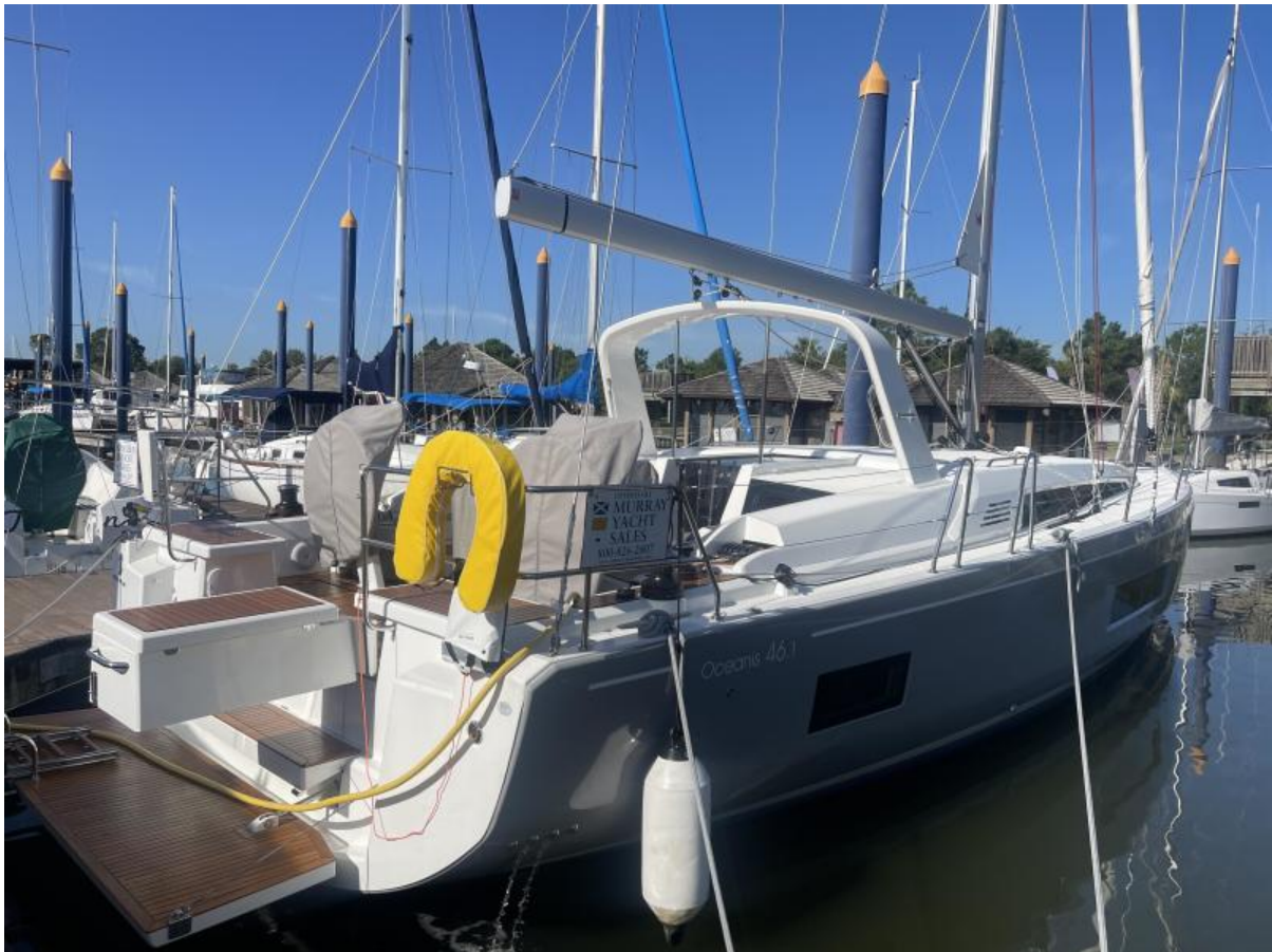
2023 Beneteau OC46.1 #400