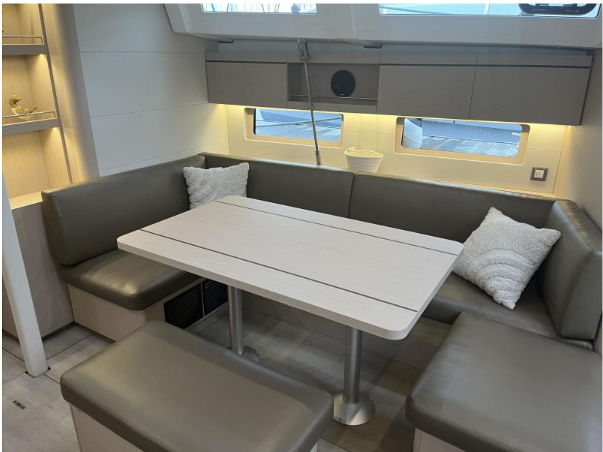
2023 Beneteau OC46.1 #400