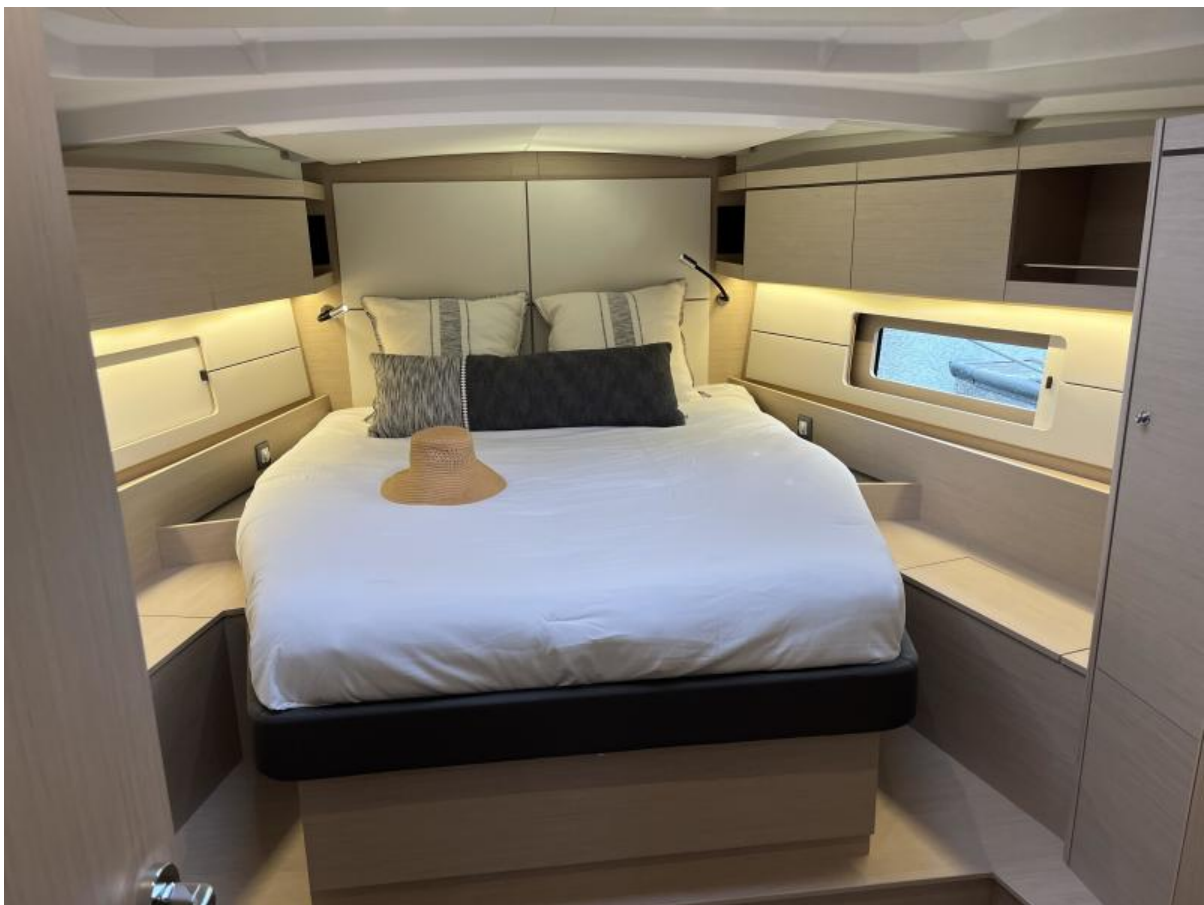
2023 Beneteau OC46.1 #400