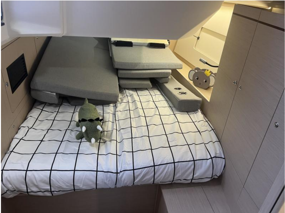
2023 Beneteau OC46.1 #400