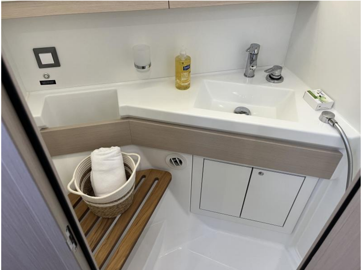
2023 Beneteau OC46.1 #400