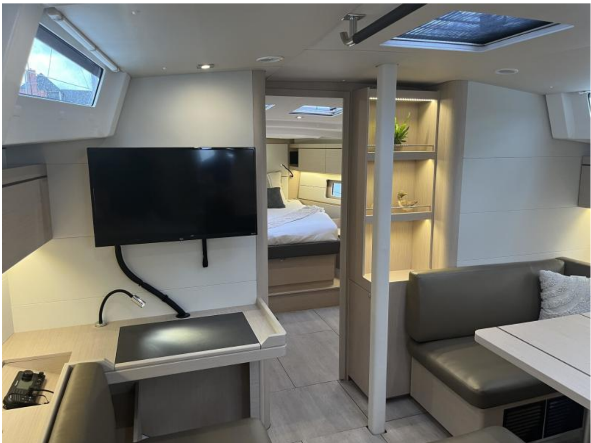
2023 Beneteau OC46.1 #400