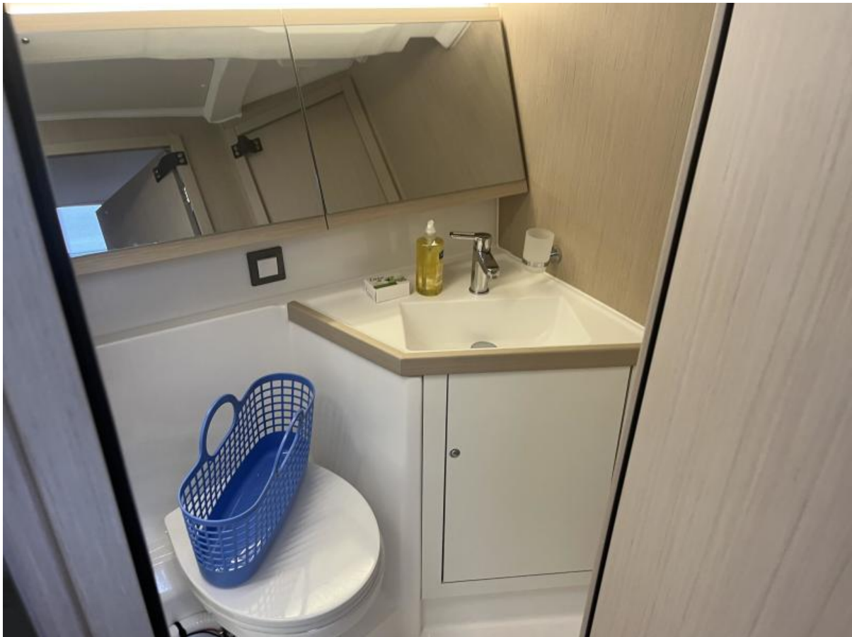
2023 Beneteau OC46.1 #400