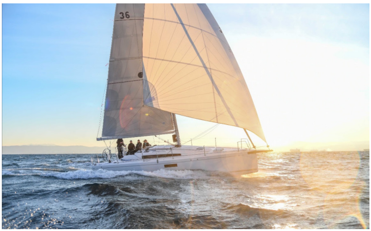
Beneteau FIRST 36 Profile Sailing Main & Code Zero Profile