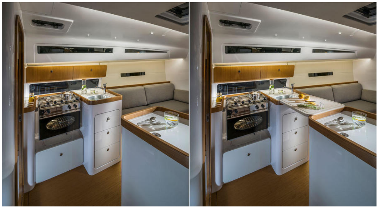
Beneteau FIRST 36 Galley Galley