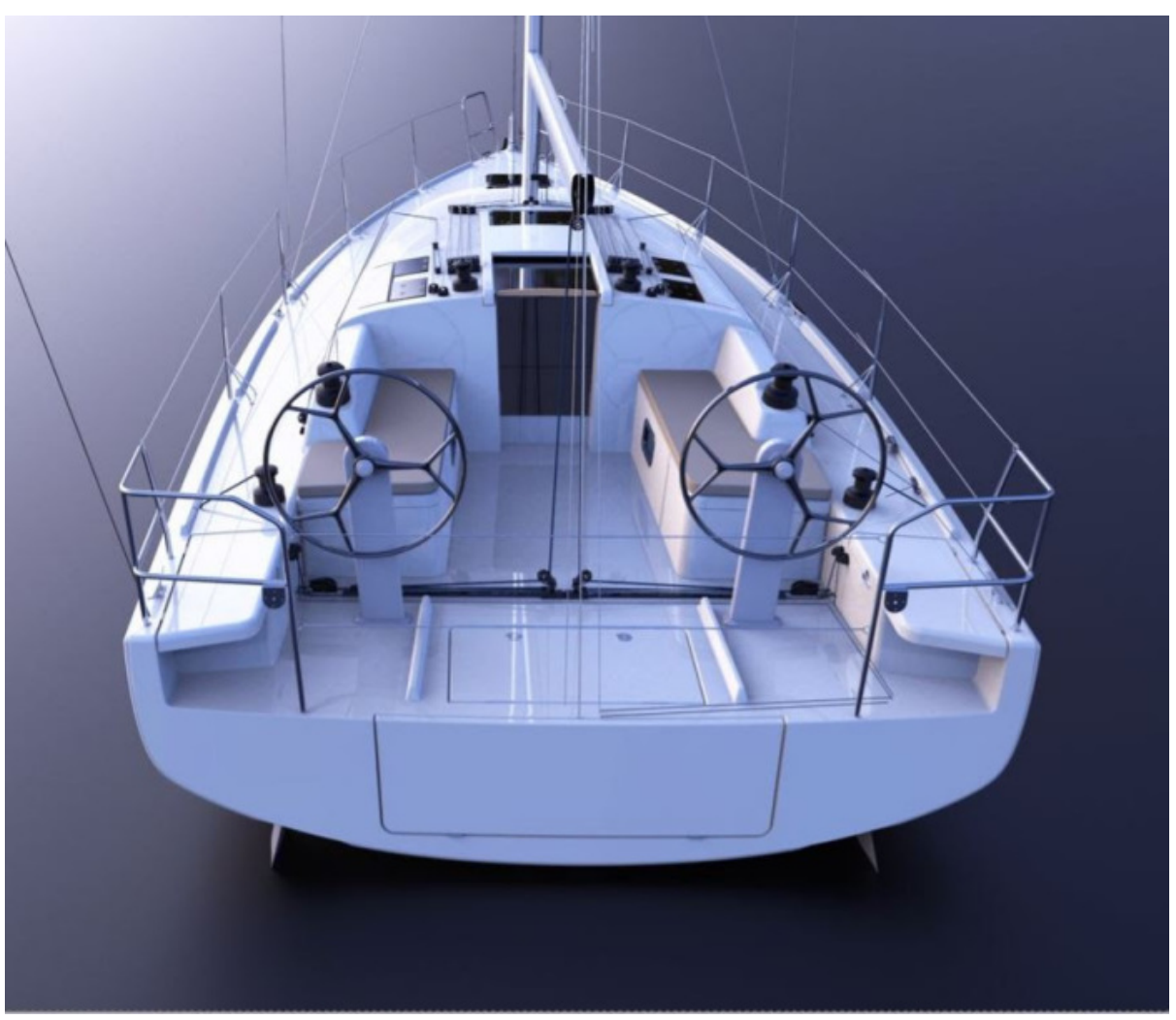
Beneteau FIRST 36 Transom Race Configured Cockpit