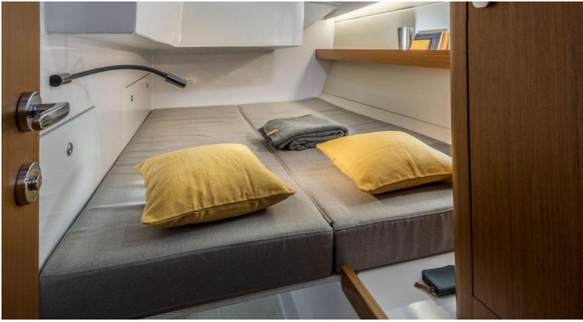
Beneteau FIRST 36 Starboard Aft Cabin Port Aft Cabin