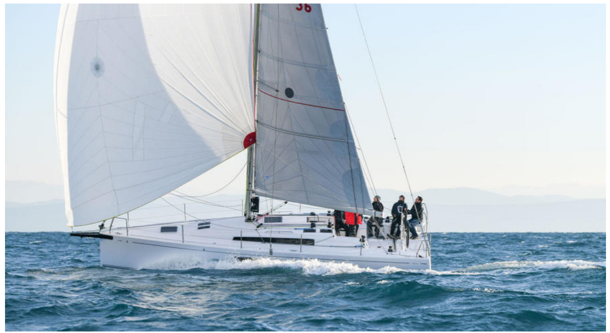
Beneteau FIRST 36 Profile under Code Zero Profile under Spinnaker