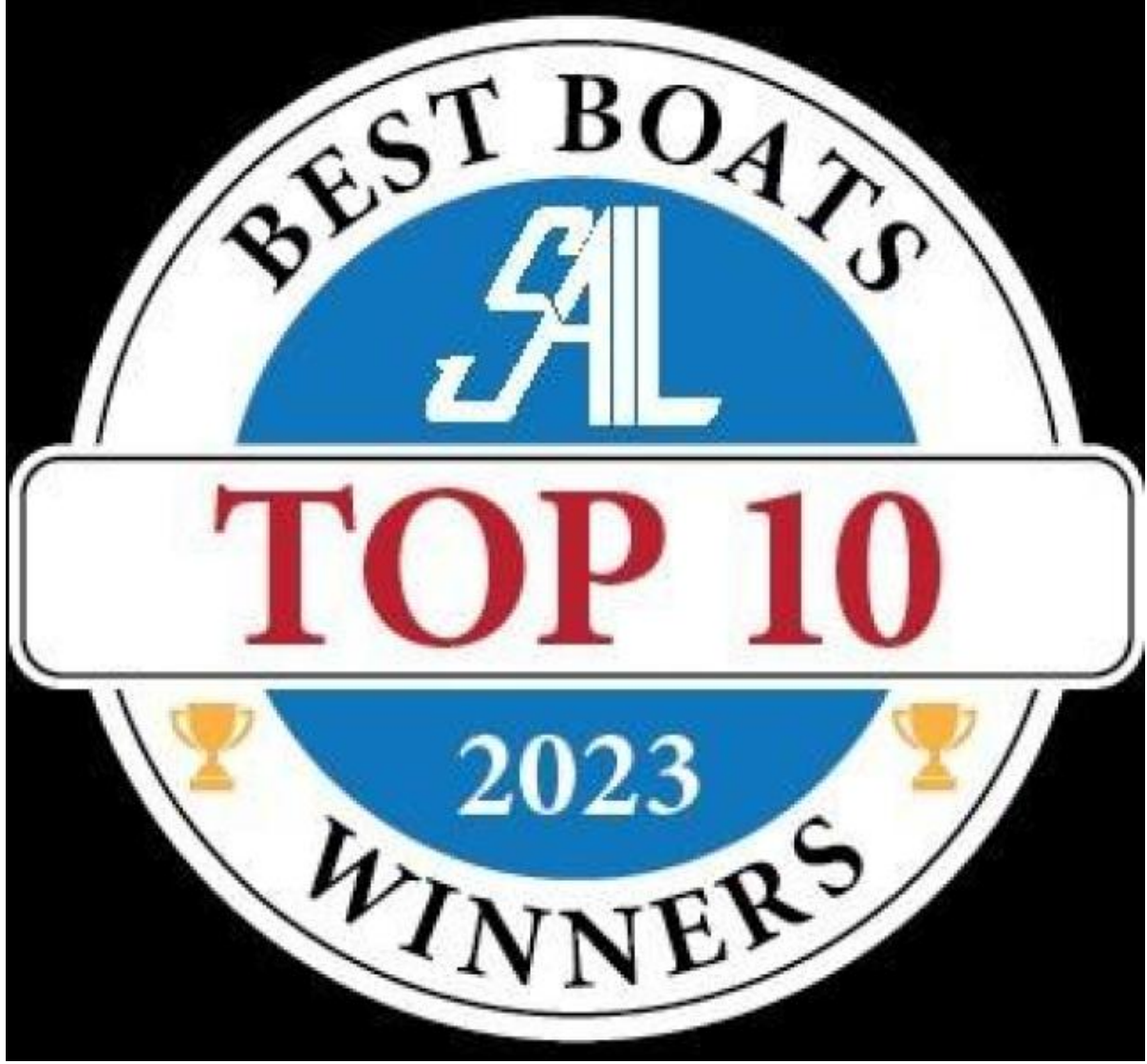
Beneteau FIRST 36 Starboard Aft Cabin Top 10 Best Boats 2023