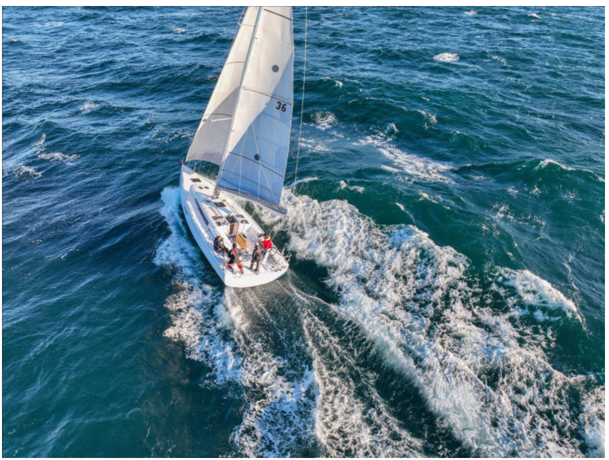
Beneteau FIRST 36 Sailing Overhead Overhead Sailing