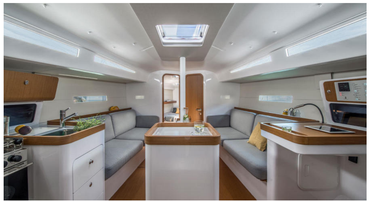
Beneteau FIRST 36 Looking Forward in Salon Salon looking forward