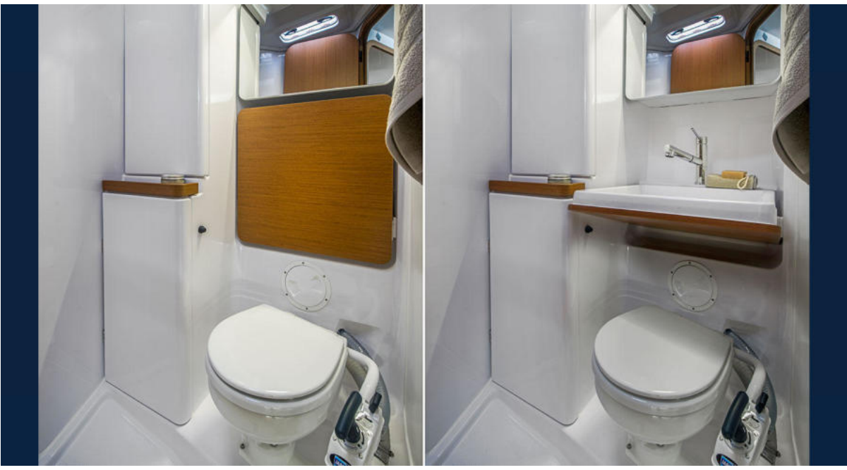
Beneteau FIRST 36 Head Convertible Head