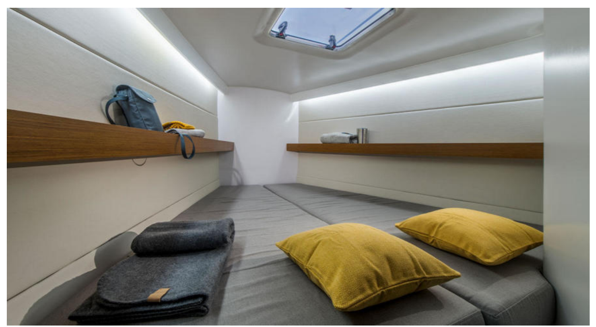
Beneteau FIRST 36 Port Aft Cabin Stb Aft Cabin