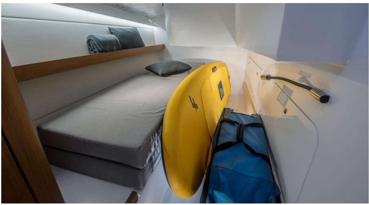
Beneteau FIRST 36 Convertible Aft Cabin Convertible Aft Cabin