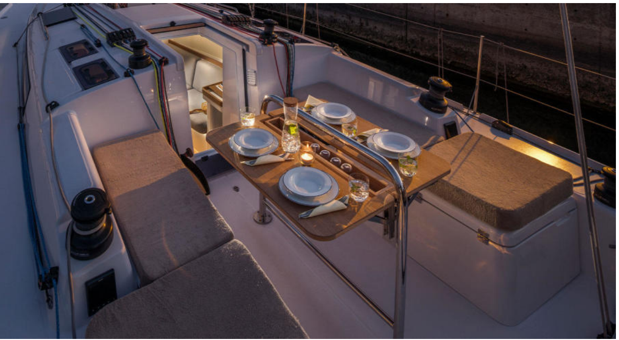
Beneteau FIRST 36 Dinner Under the Stars Dinner in the Cockpit