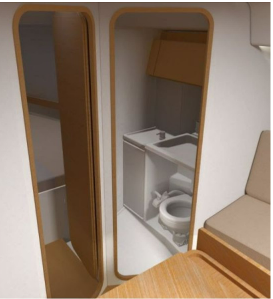
First 36 Head Drawing Convertible Head Drawing