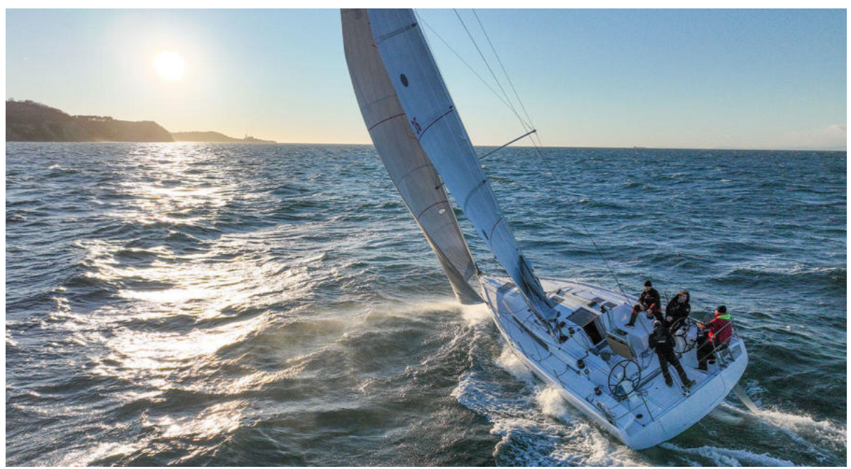
Beneteau FIRST 36 Reaching Sailing