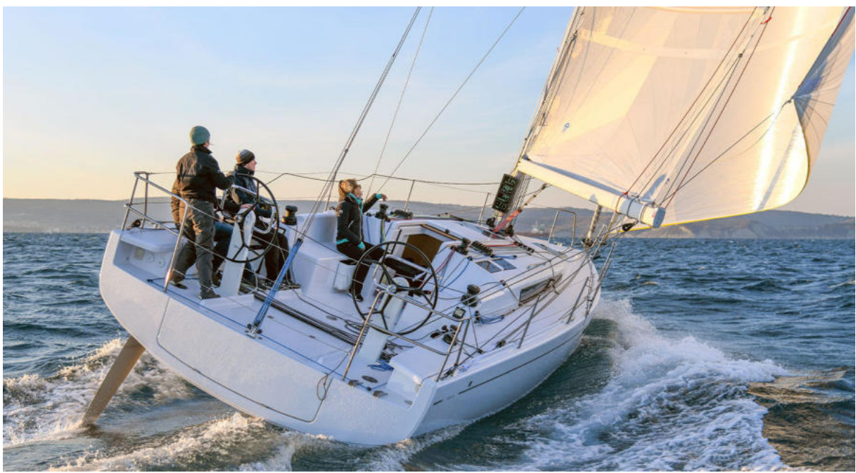
Beneteau FIRST 36 Sailing Transom Transom