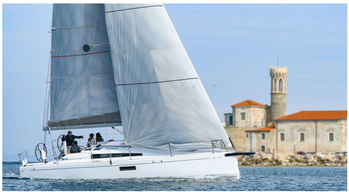
Beneteau FIRST 36 Profile Under Sail Profile under Sail