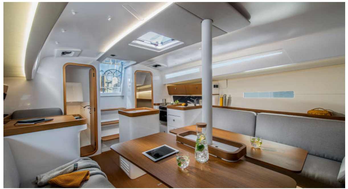
Beneteau FIRST 36 Looking Aft in Salon Salon looking aft