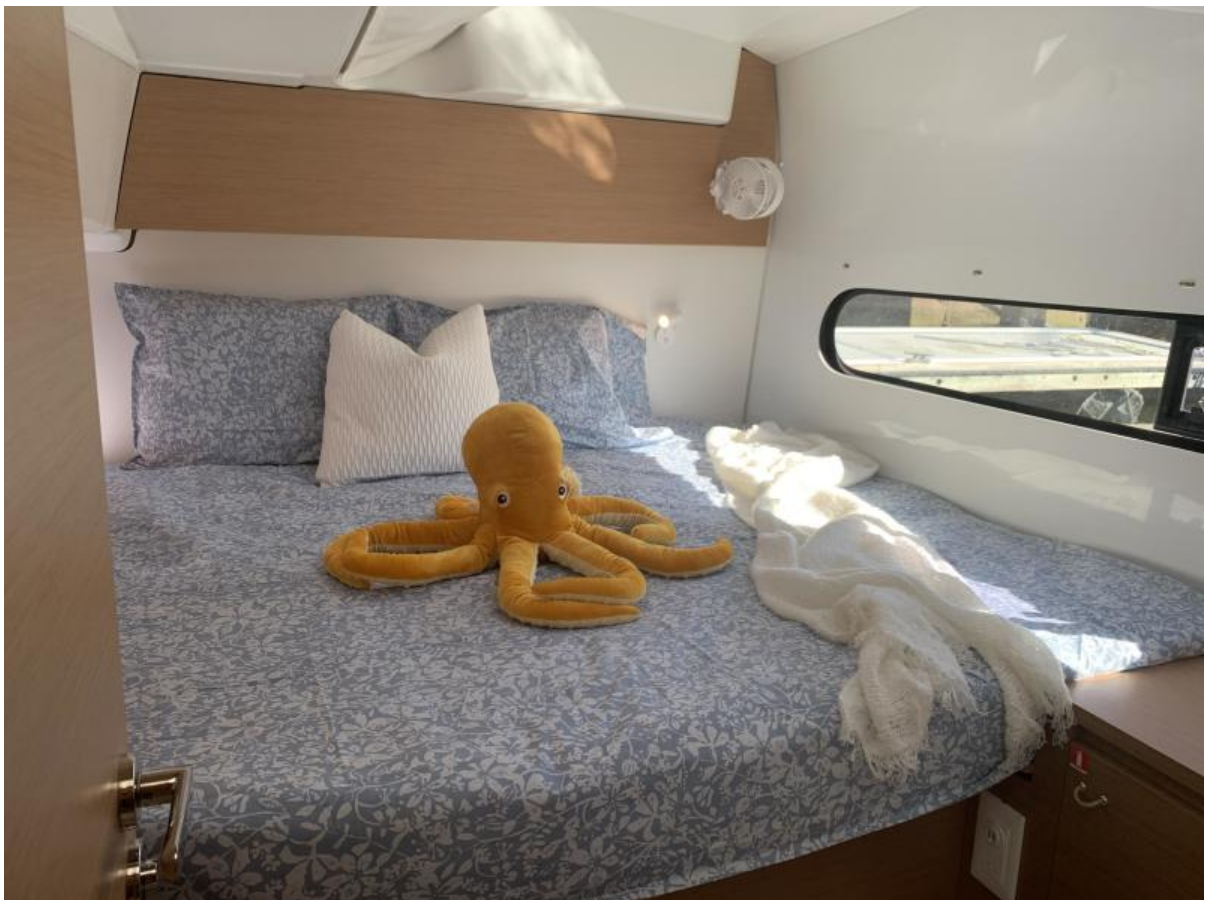
Excess 11 Cabin