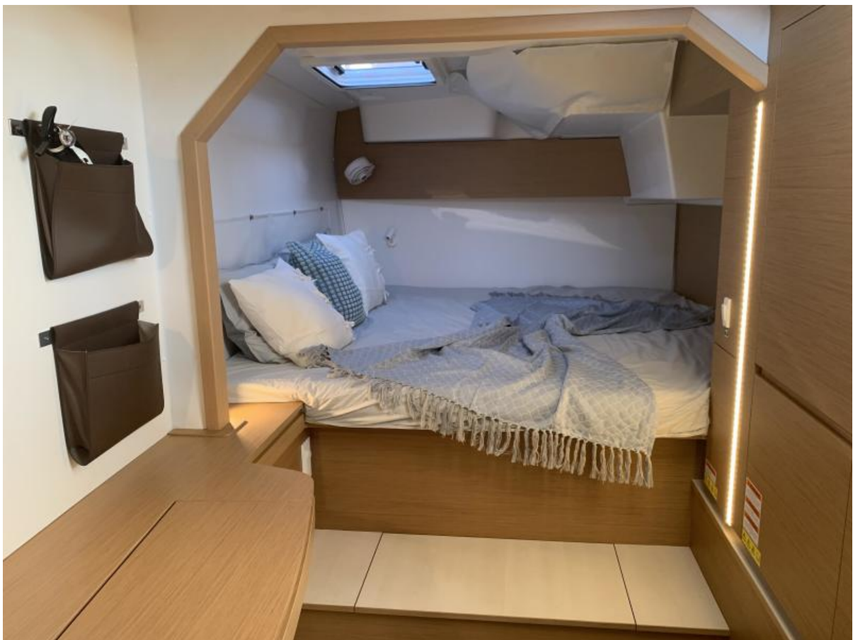
Excess 11 Cabin