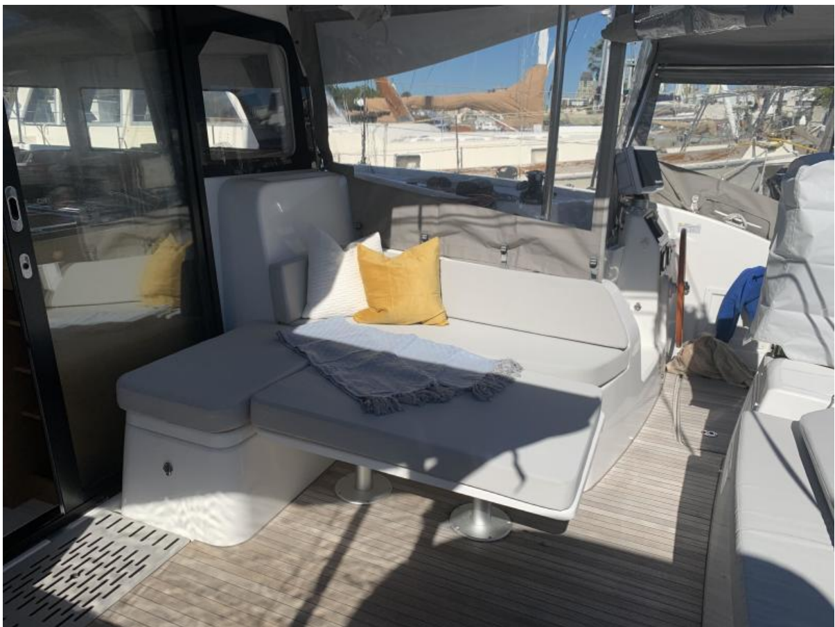
Excess 11 Convertible Table Option