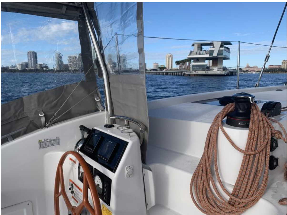
Excess 11 For Sale St Petersburg, Florida