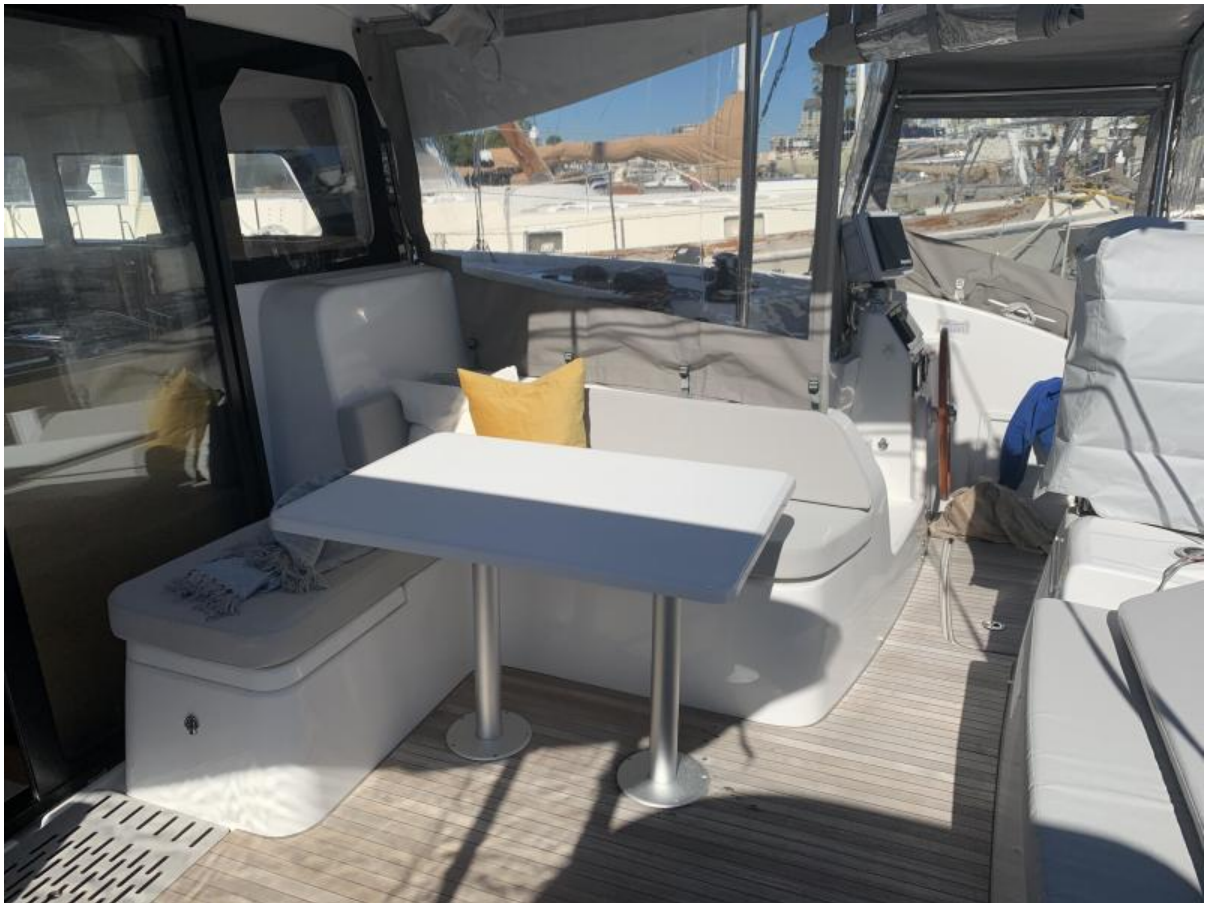
Excess 11 Convertible Table Cockpit Table