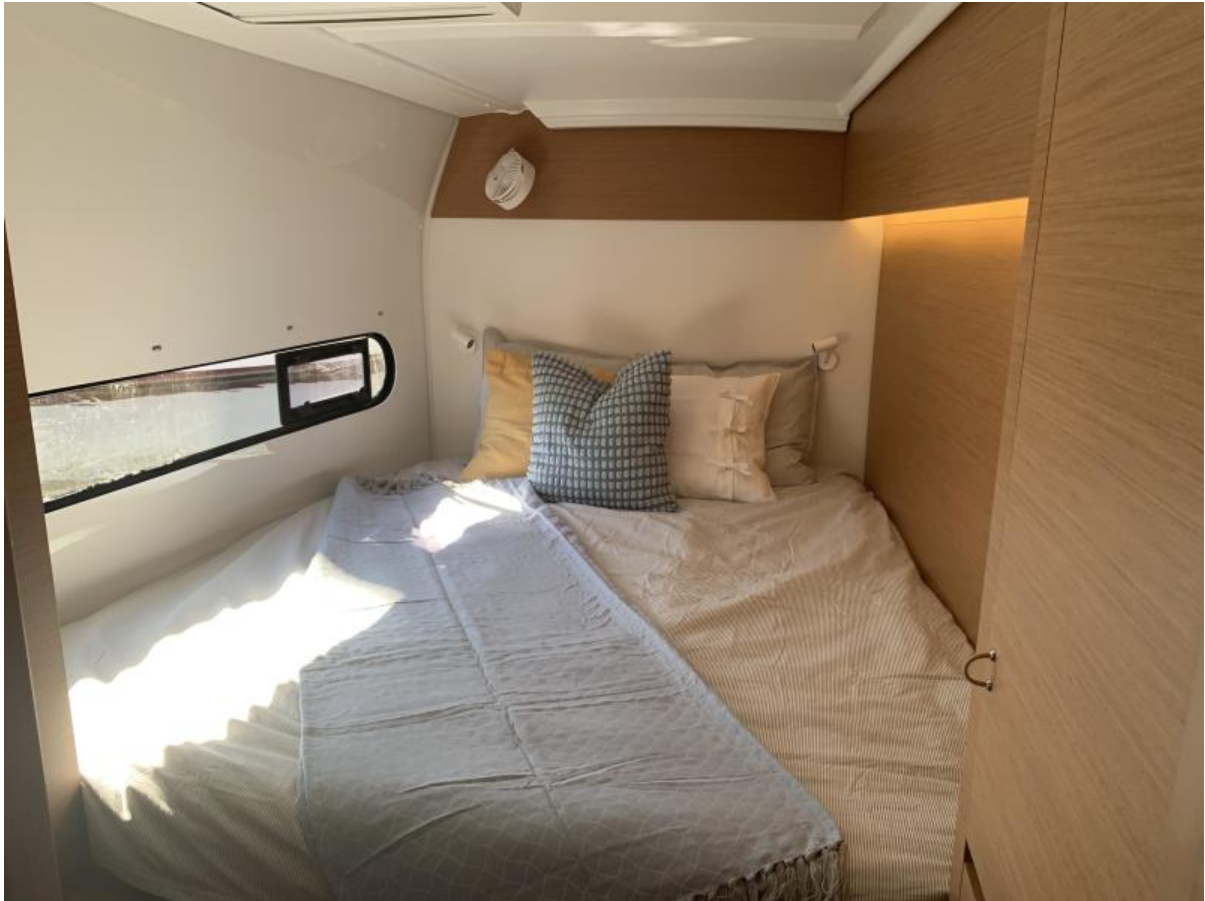
Excess 11 Cabin