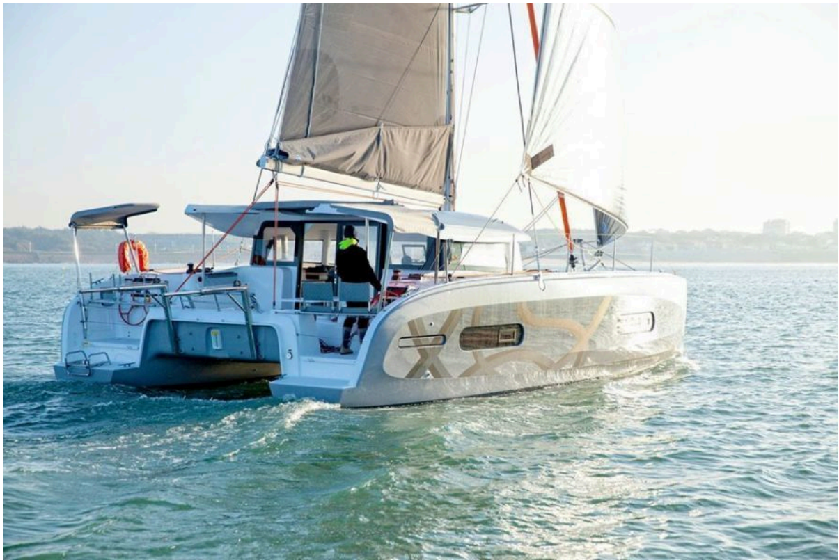
Excess 11 Catamaran