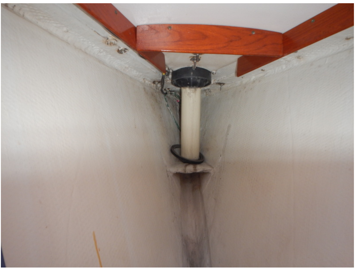
Dislocated Hoyt Boom Interior Bushing