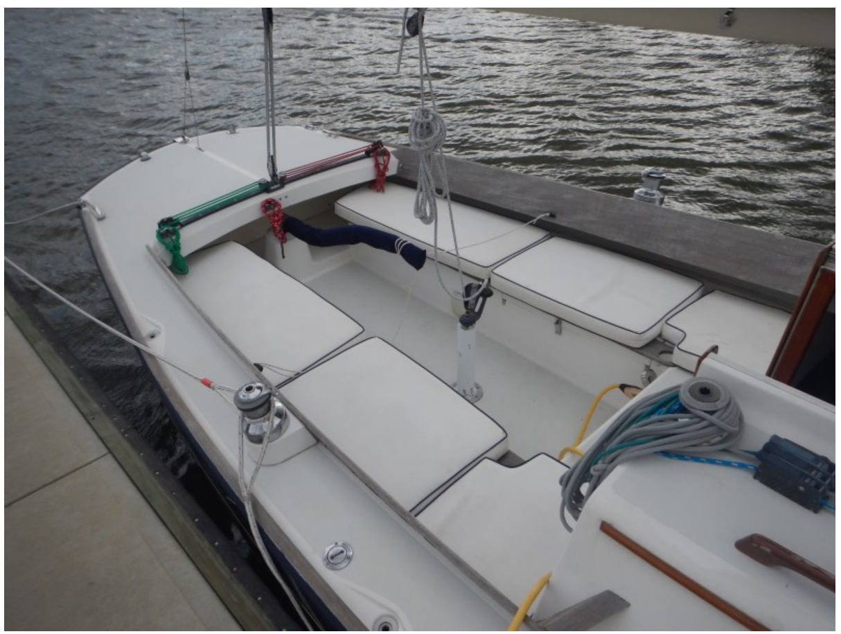
Expansive Cockpit w Cushions