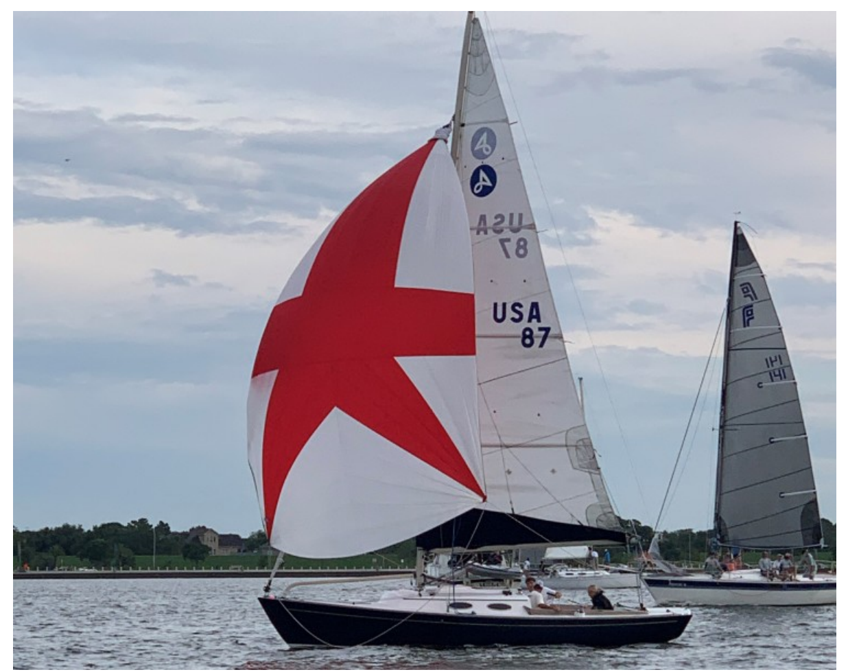
Under Sail Notice the Asymmetrical Cruising Spinnaker w/ Snuffer made by North Sails