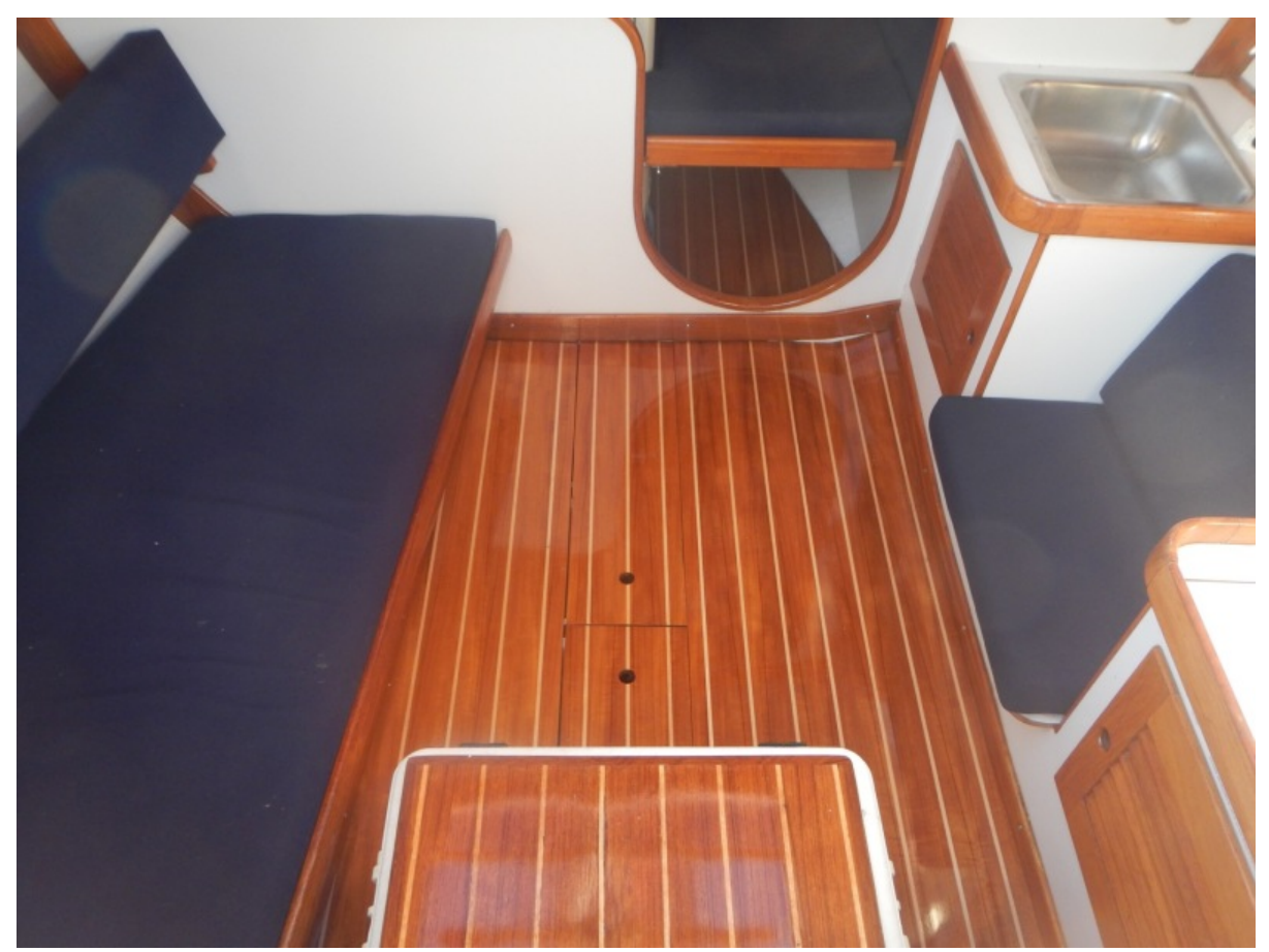
Beautiful 2020 Cabin Sole