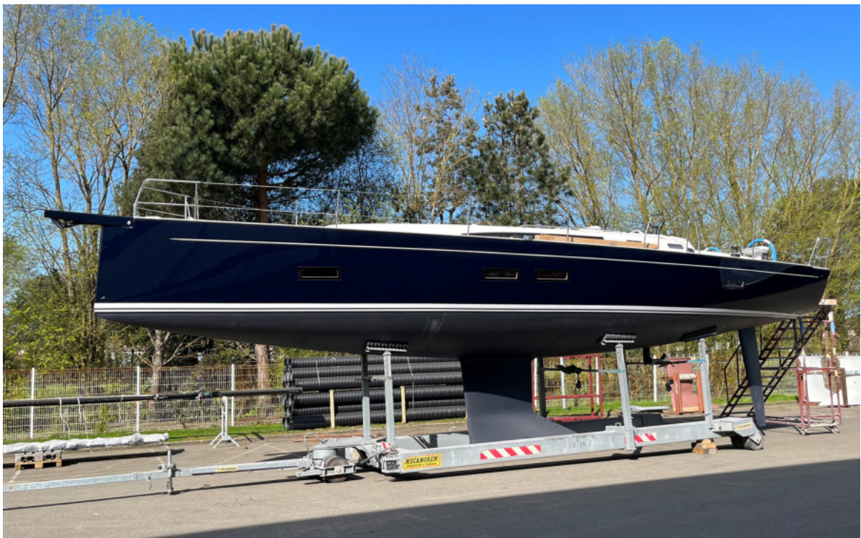
New J/45 Profile out of the Water II