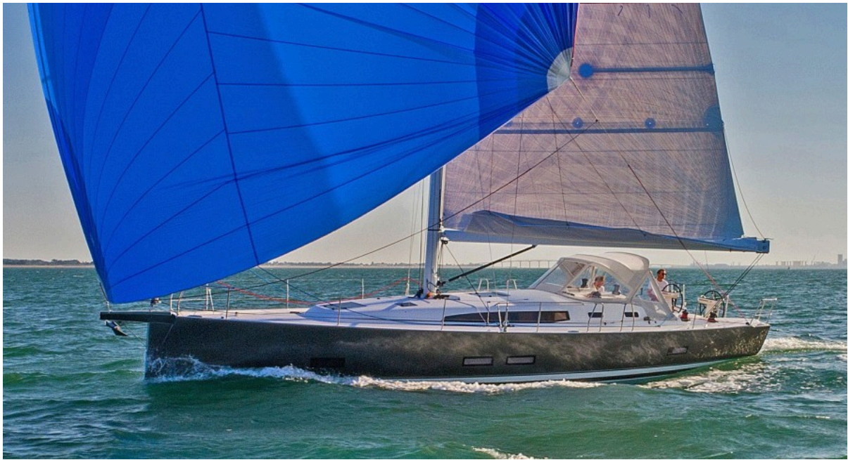
New J/45 Profile under Spinnaker