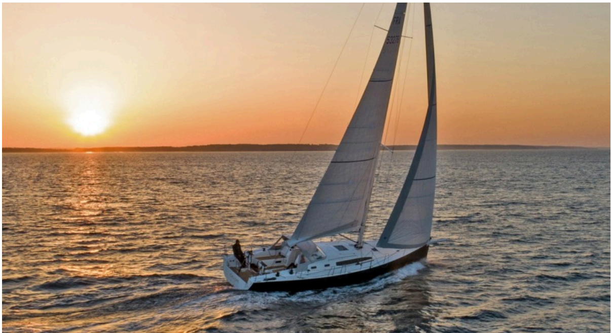
New J/45 Sunset Sailing