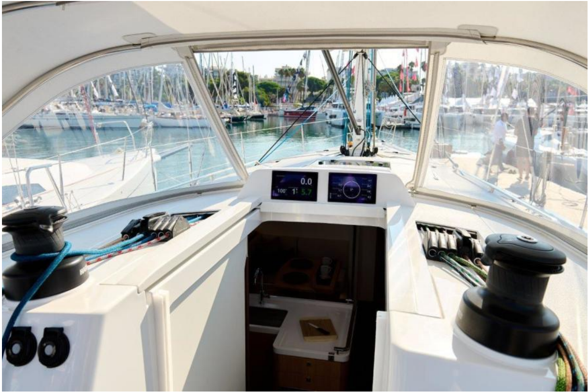
New J/45 Seahood