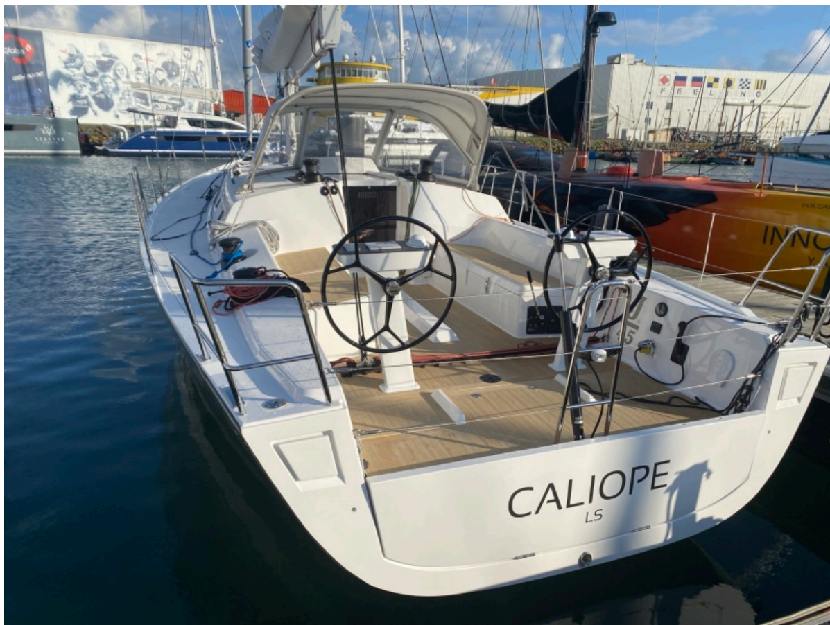
New J/45 Transom