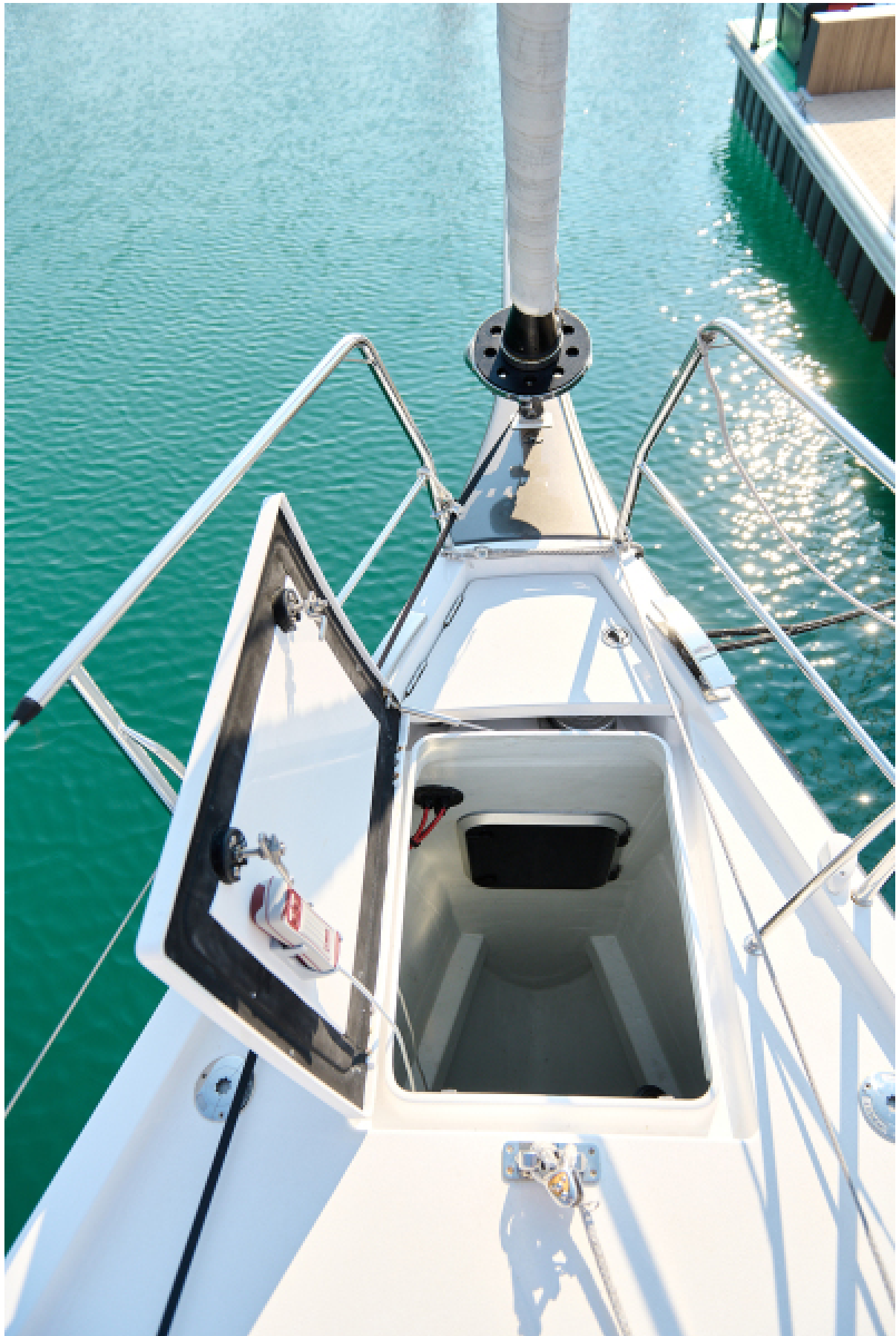
New J/45 Anchor Locker