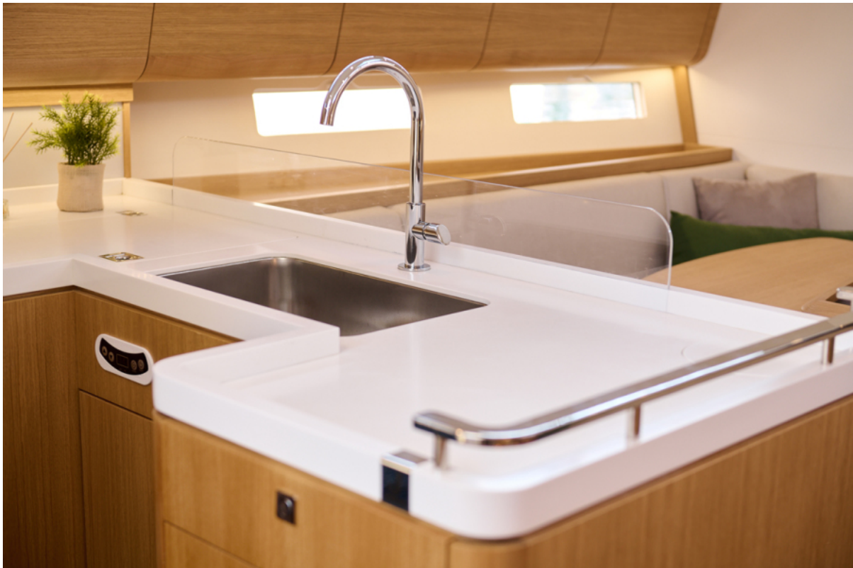
New J/45 Galley II