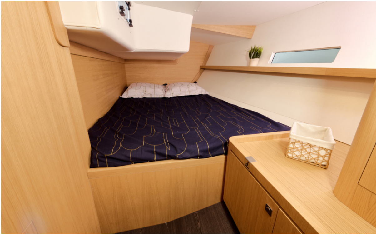
New J/45 Aft Cabin