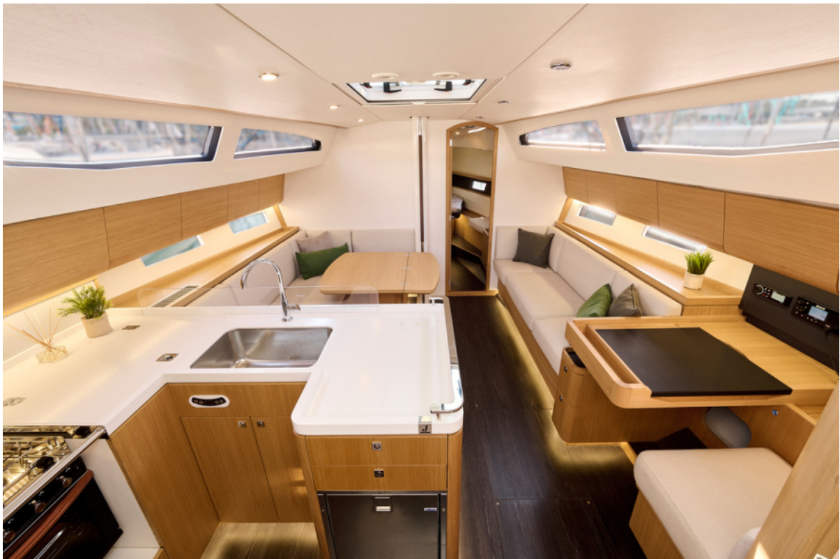
New J/45 Salon