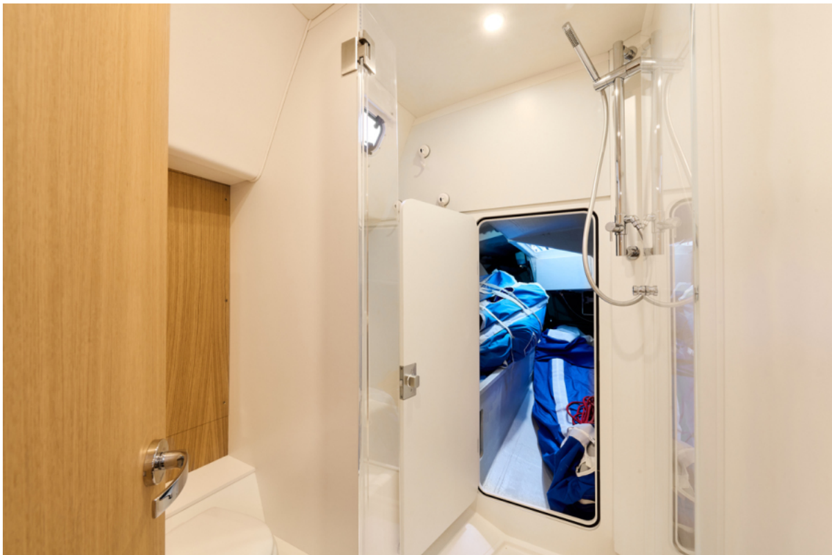
New J/45 Head & Shower