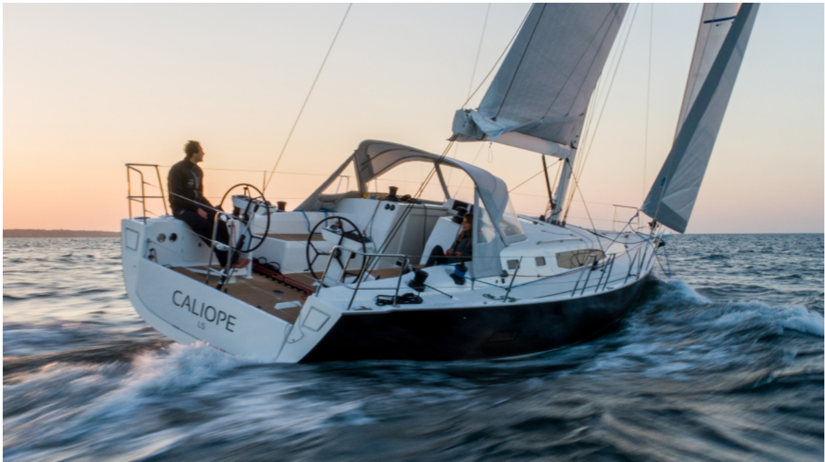
New J/45 Reaching