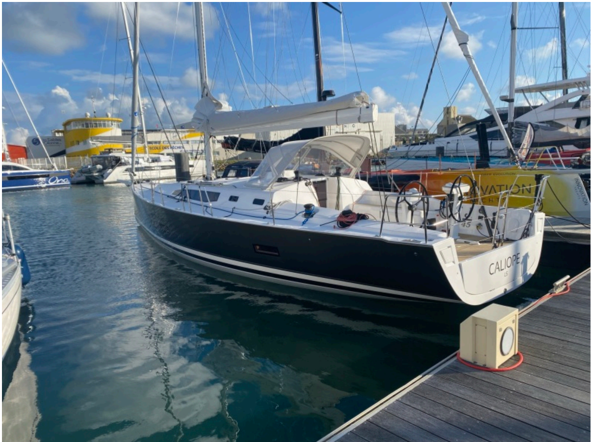
New J/45 at the dock