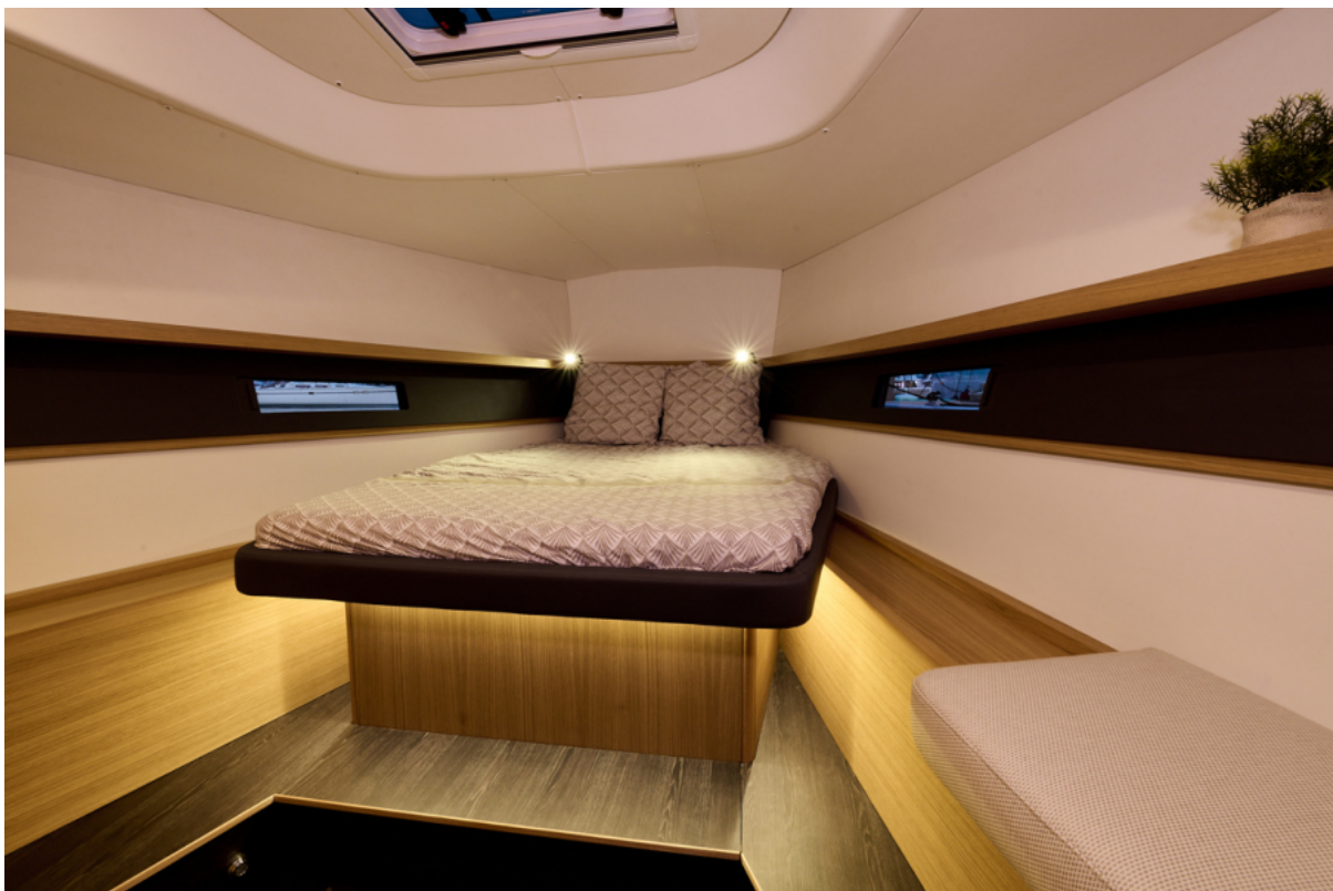
New J/45 Master Cabin