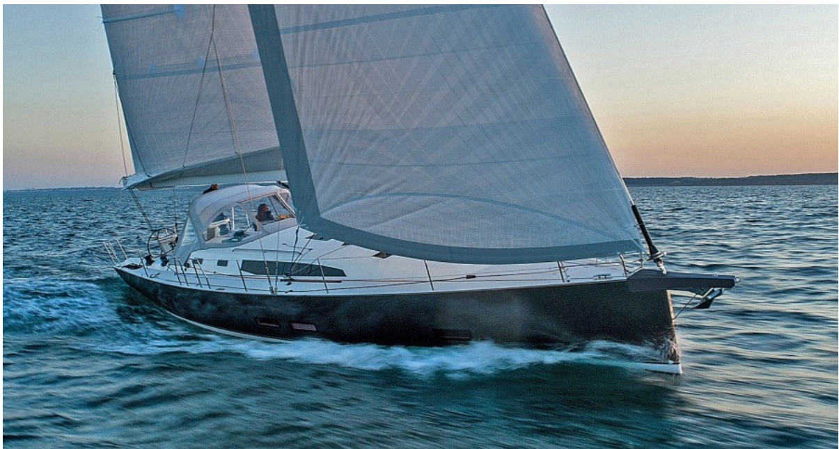
New J/45 Sailing