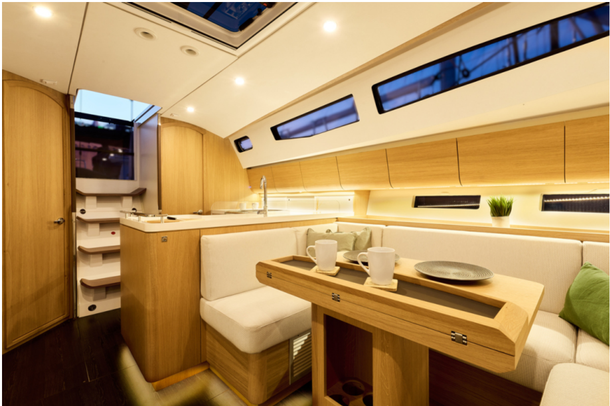
New J/45 Dinette