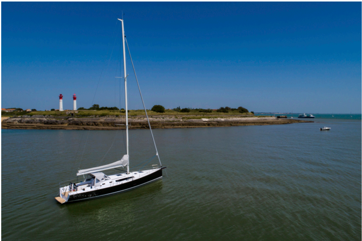
New J/45 Profile