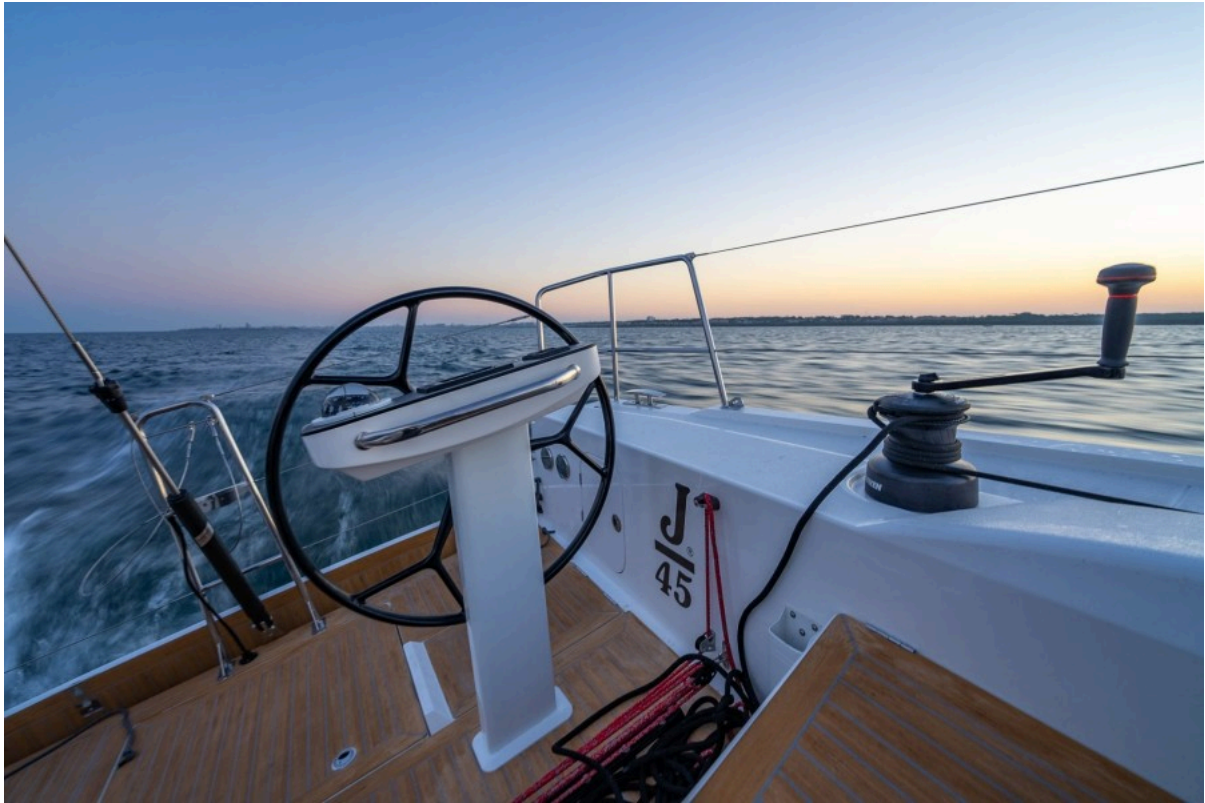
New J/45 Helm