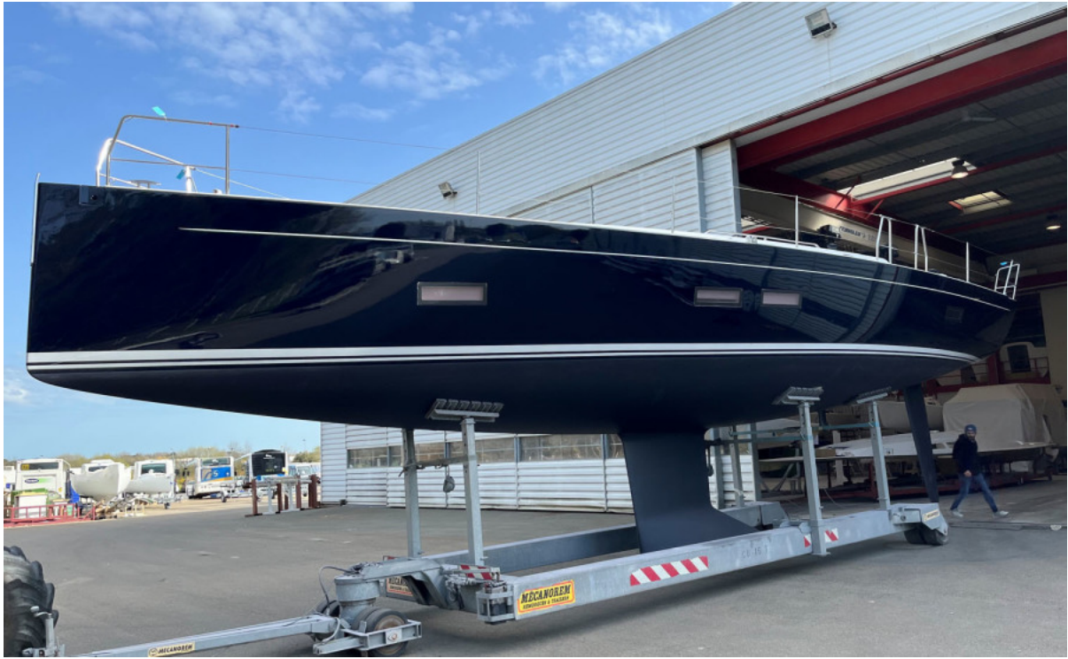
New J/45 Profile out of the Water