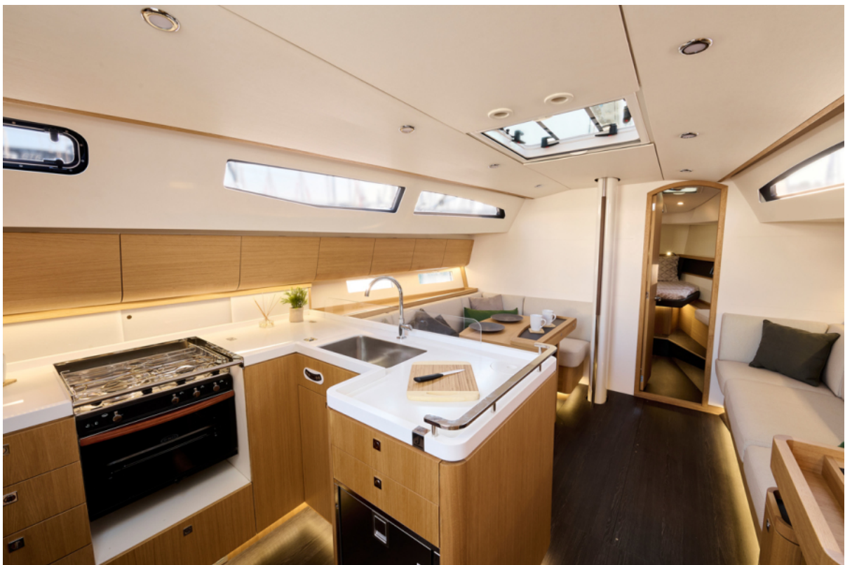
New J/45 Galley