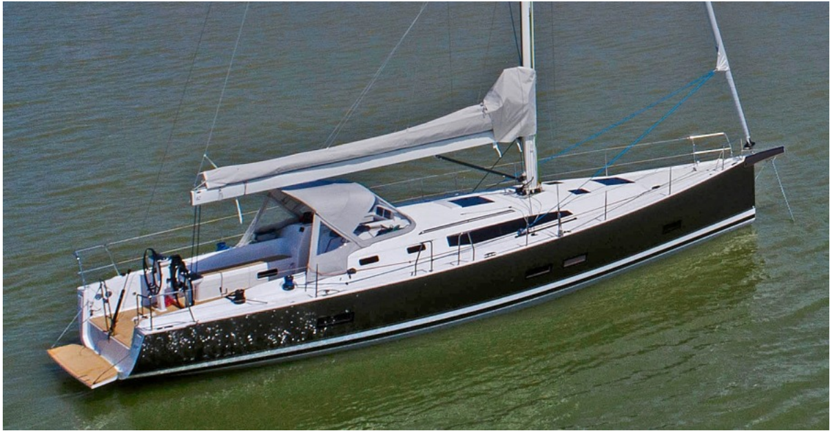
New J/45 Profile