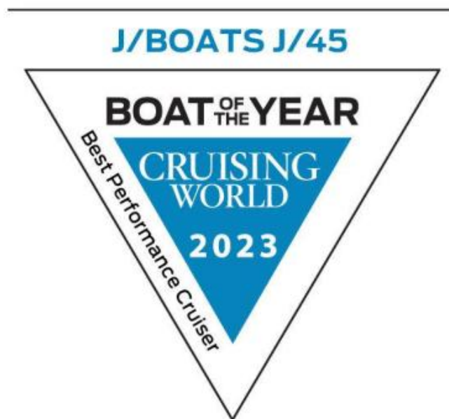
Cruising World's Boat of the Year