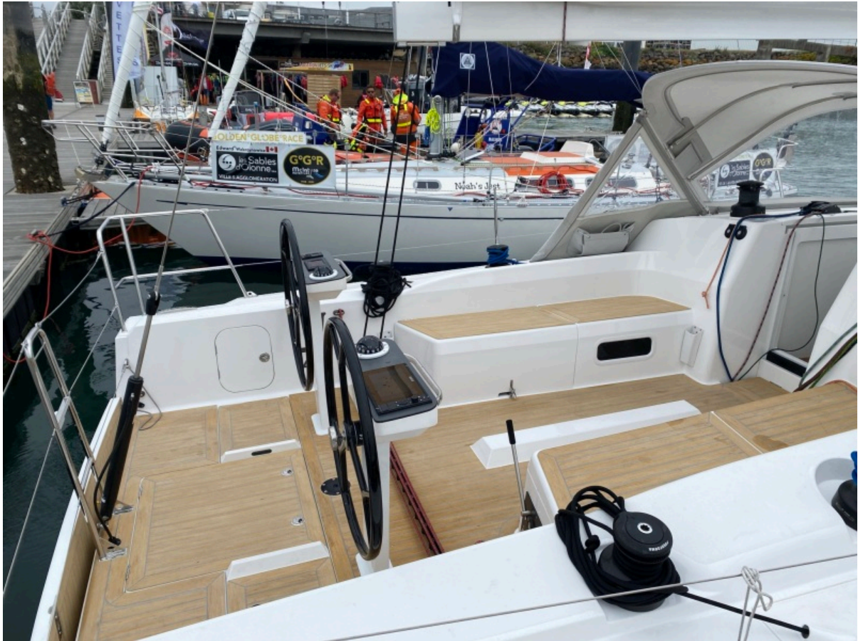
New J/45 Cockpit