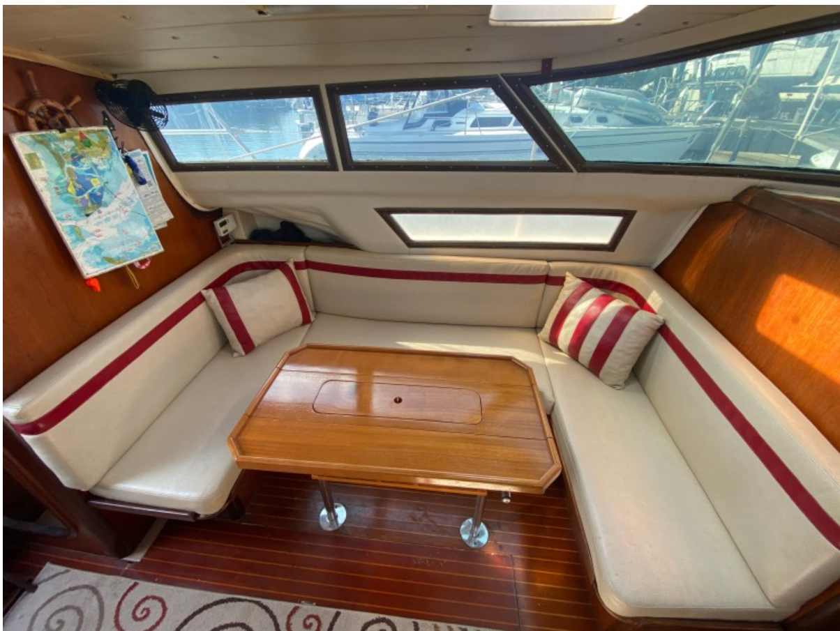
08 Salon Port