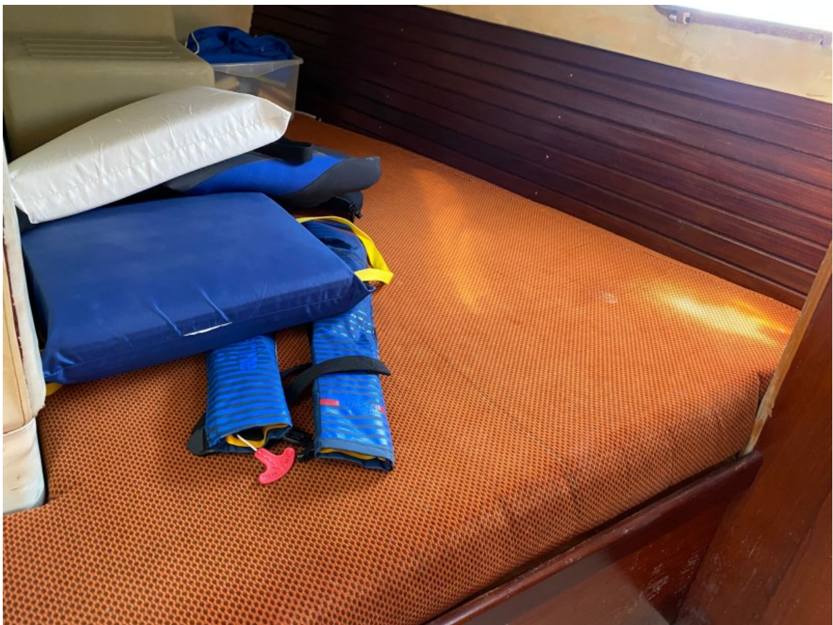
10 Aft Cabin