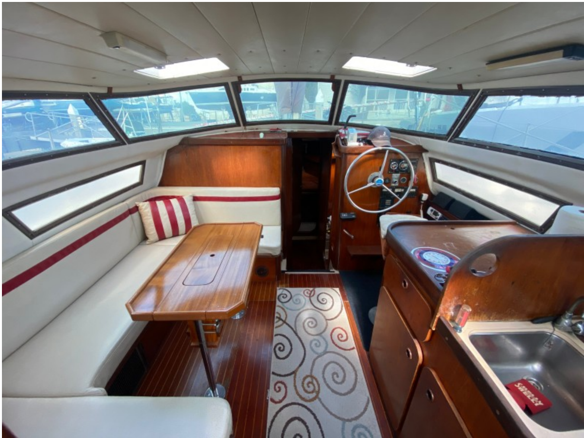
05 Salon Fwd