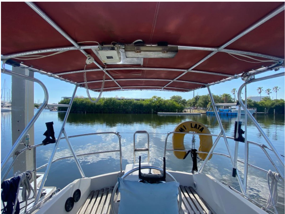
04 Cockpit Aft