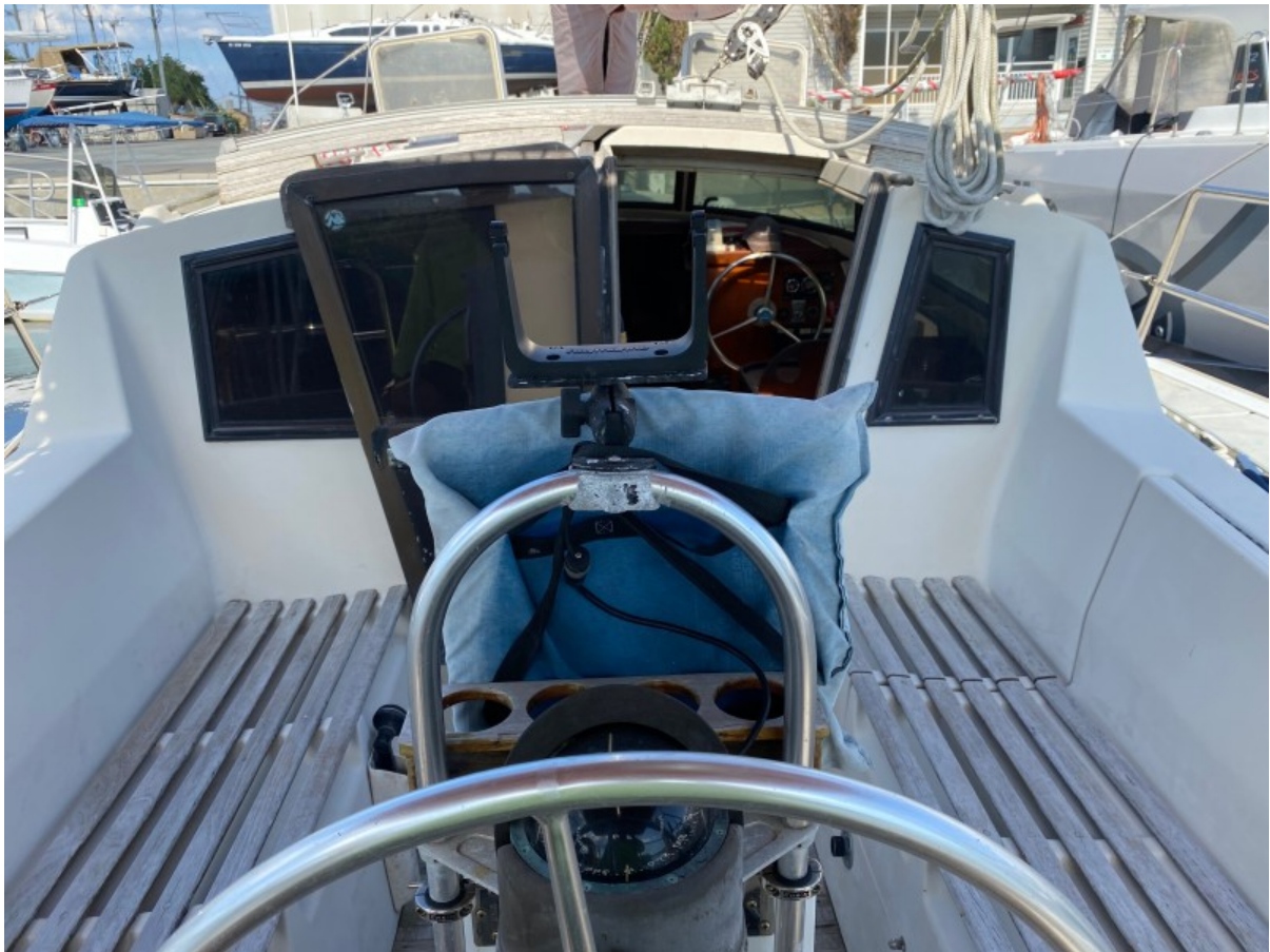
03 Cockpit Fwd