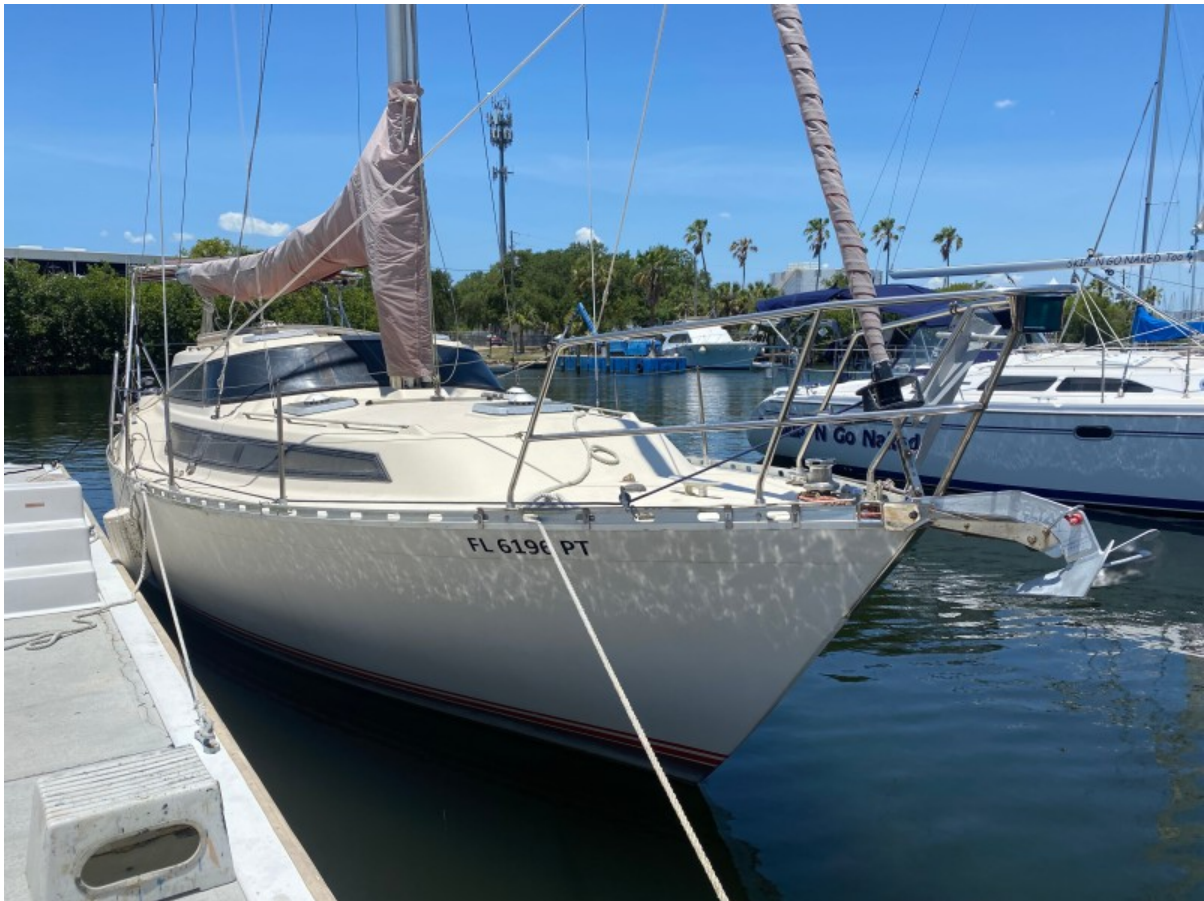
01 Starboard Bow