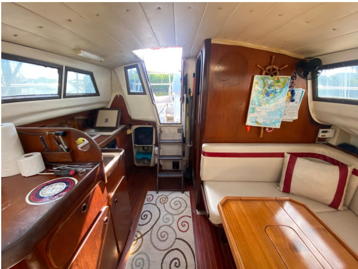
06 Salon Aft