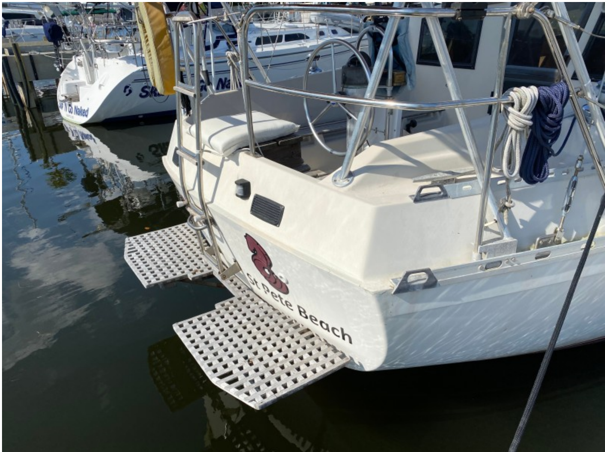
13 Swim Platform