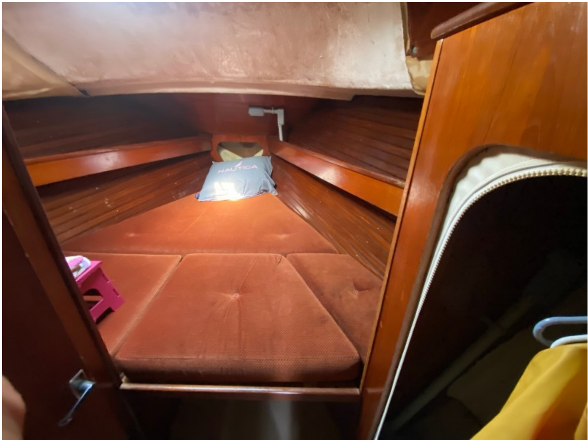
09 Fwd Cabin