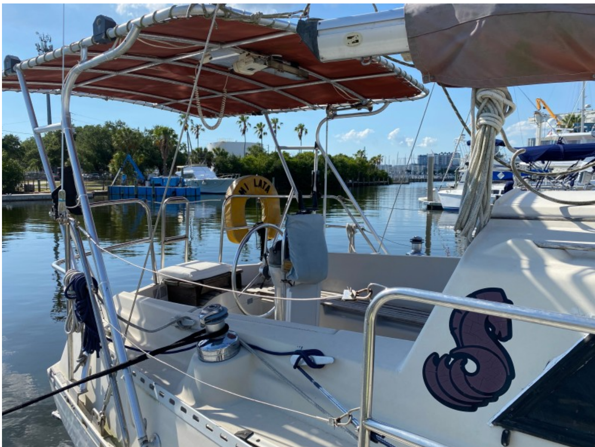
14 Swim Platform