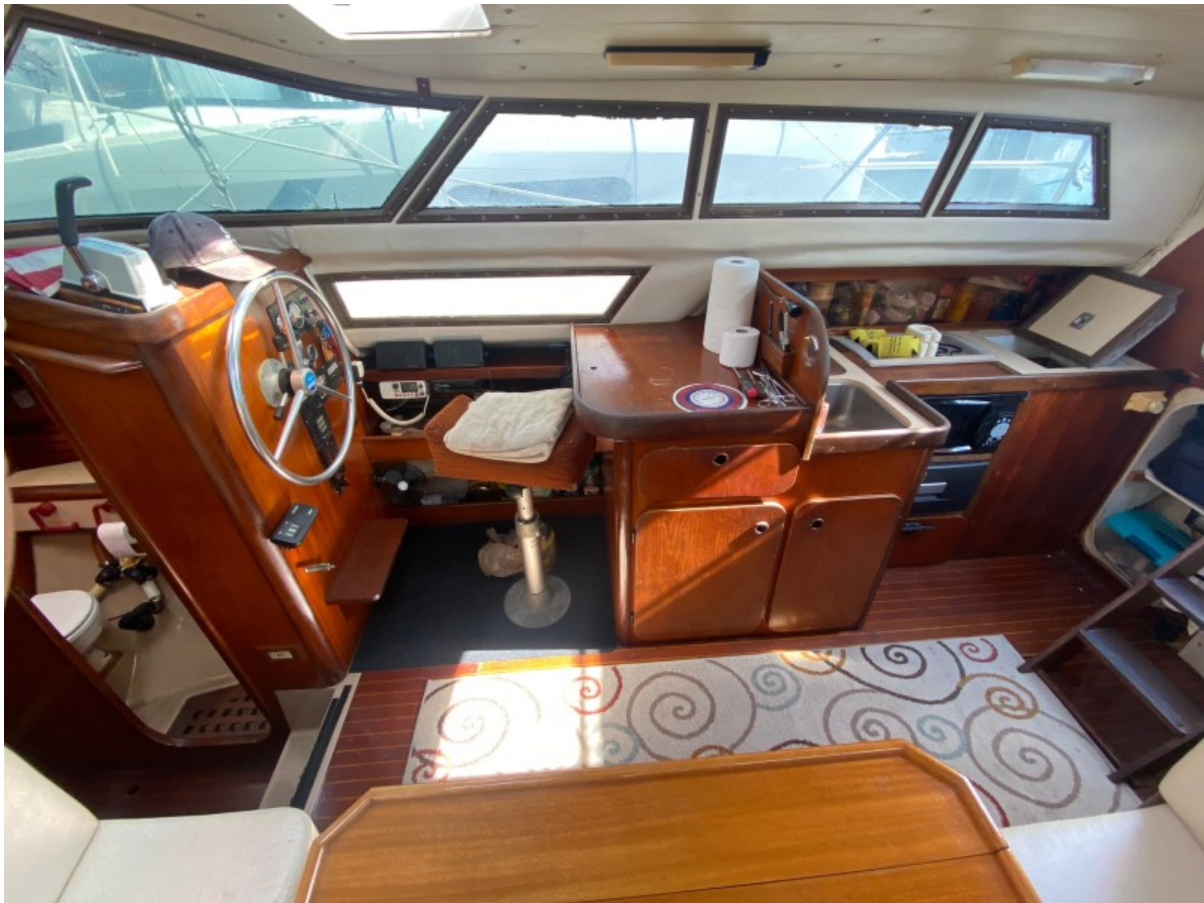
07 Salon Stbd