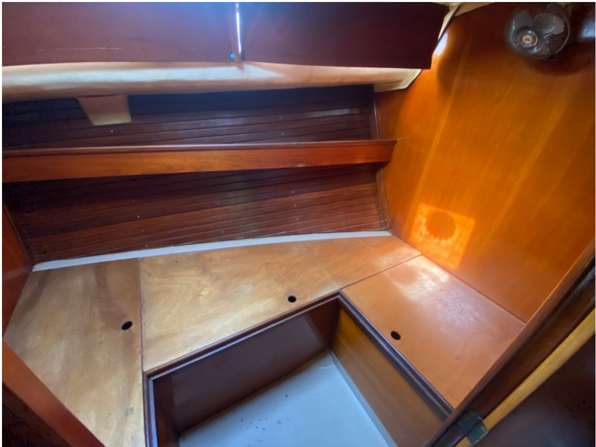
11 Midship Cabin