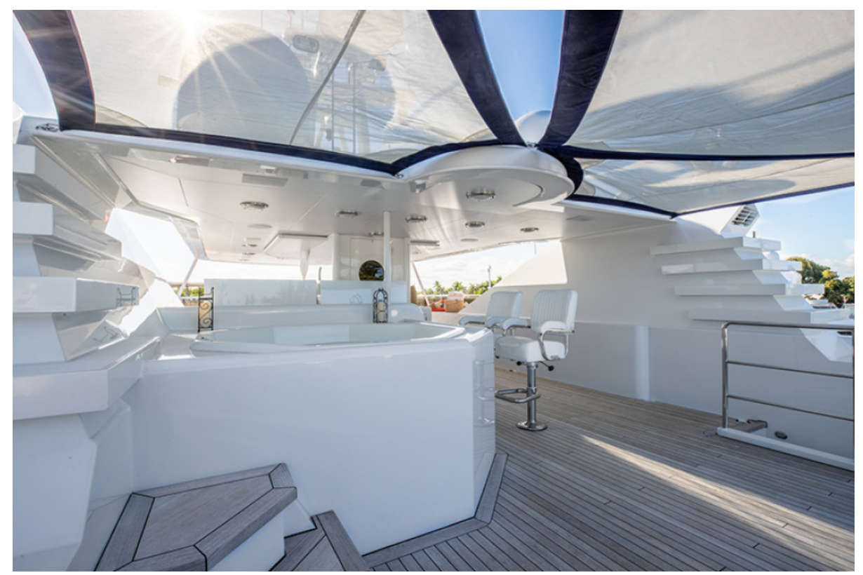
Flybridge Jacuzzi and Bar