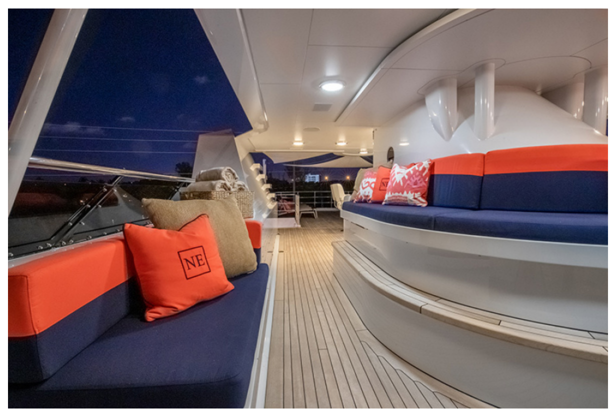
Forward Sundeck Seating