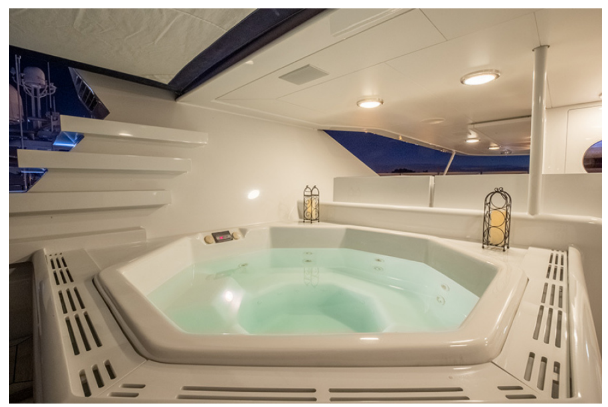
Jacuzzi at Night