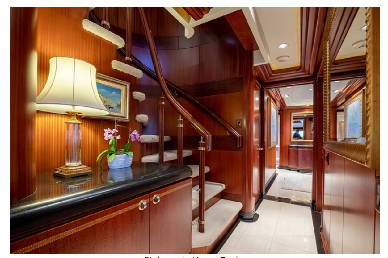
Stairway to Upper Deck