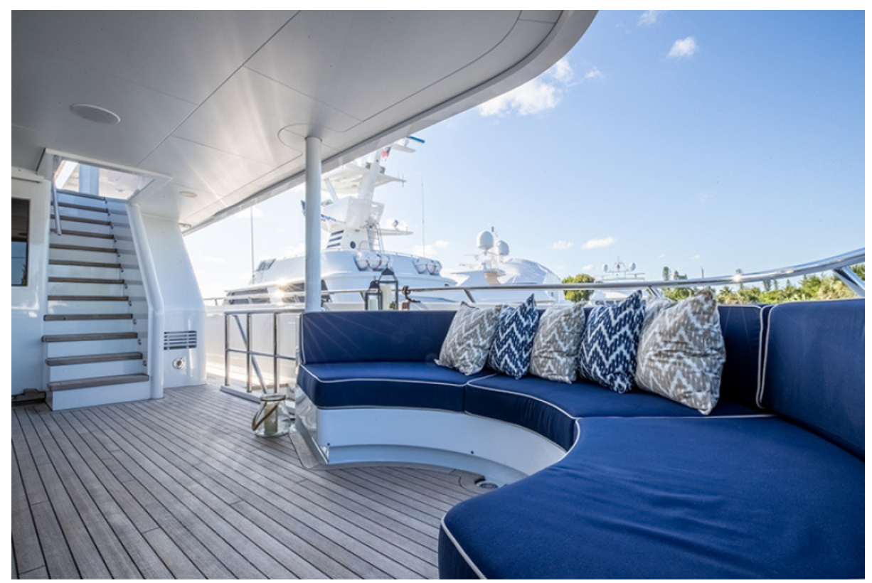
Bridge Deck Seating