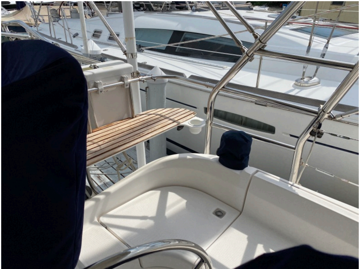
Port Stern Seat