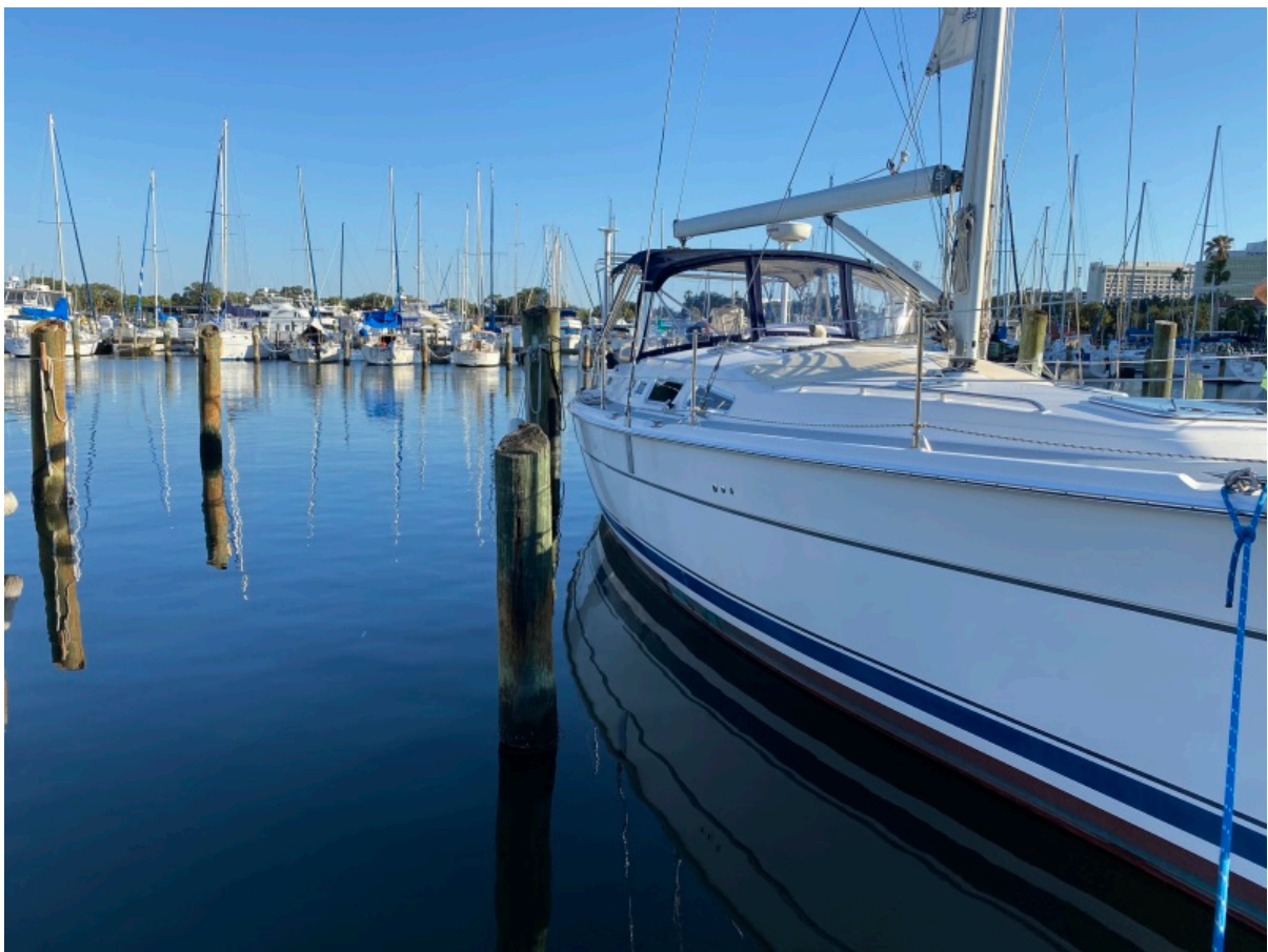
Stbd Forward Quarter