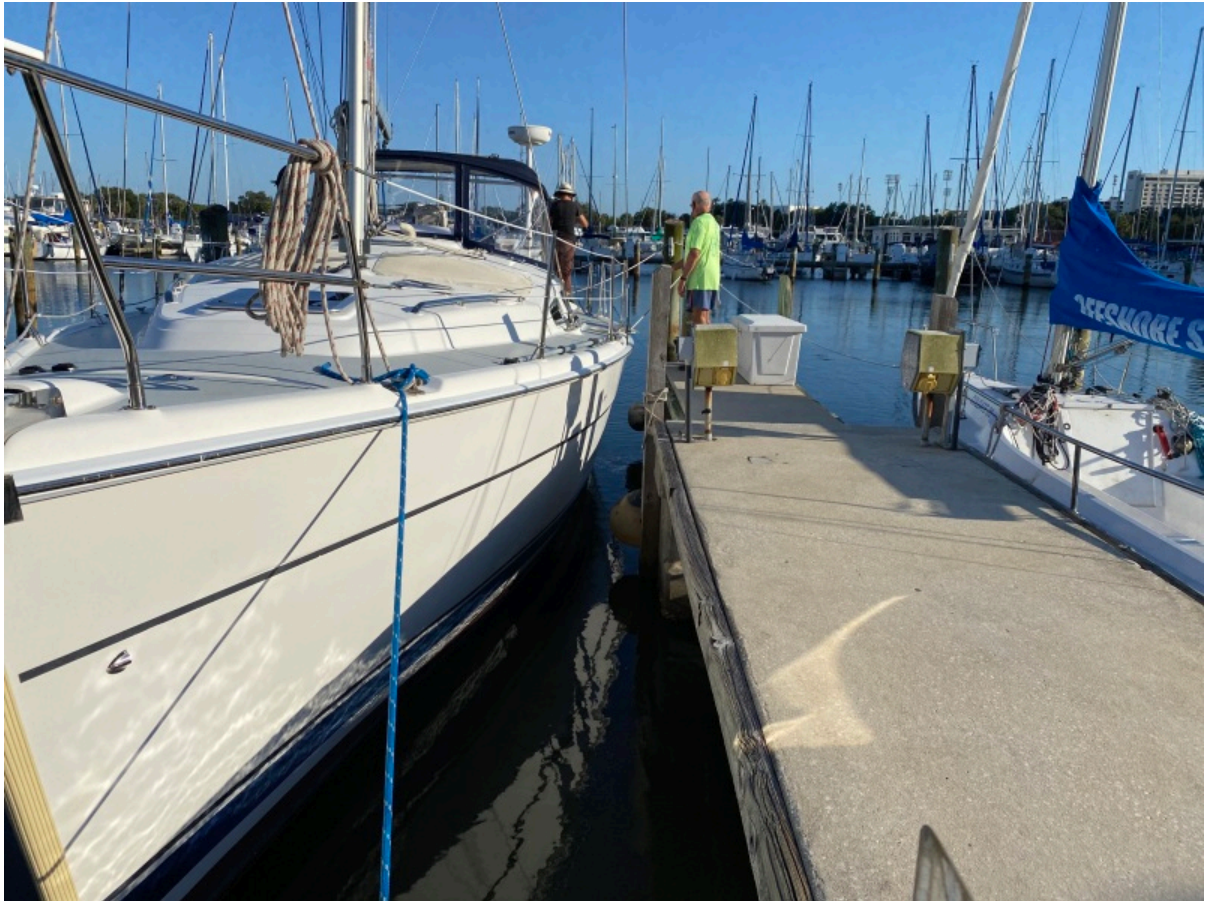
Port Forward Quarter