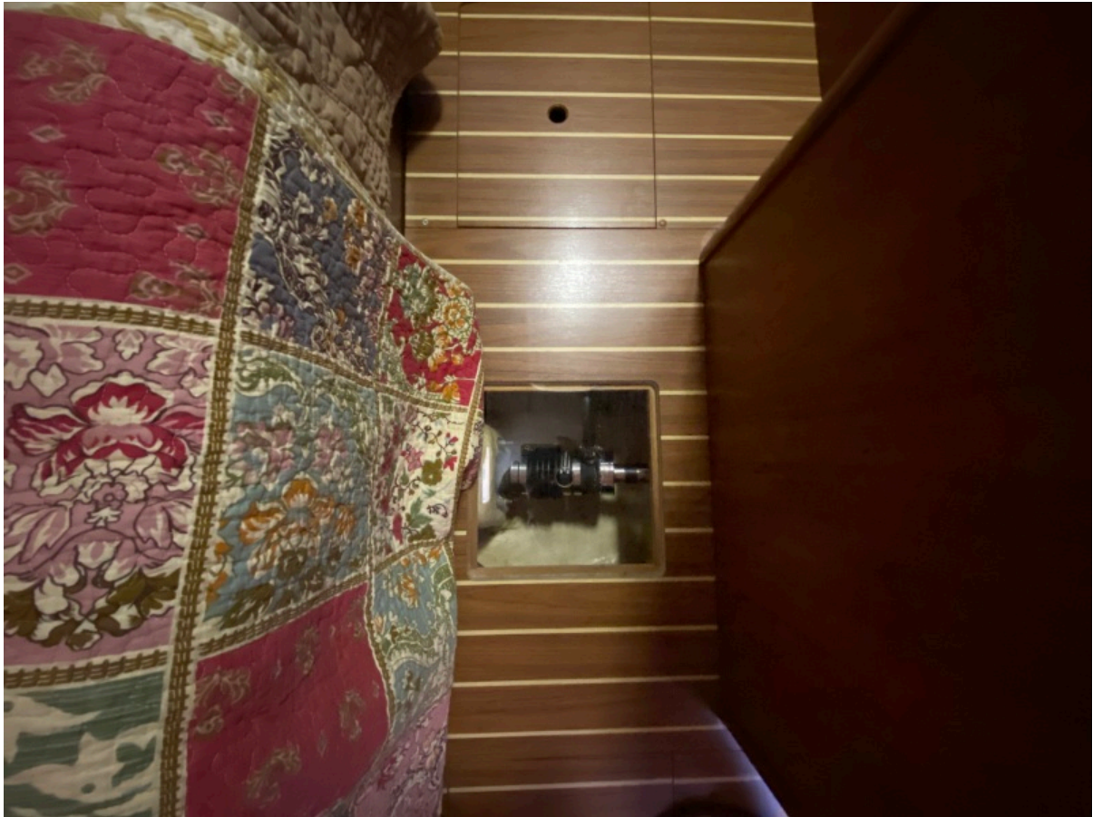
Shaft Inspection Clear Cover