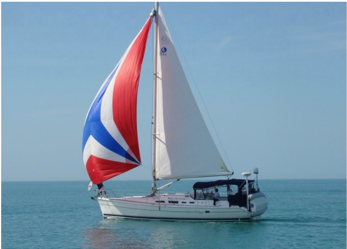
Sailing With Spinnaker