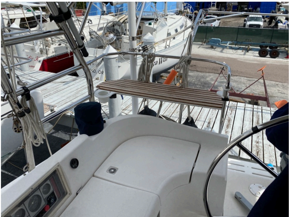
Stbd Stern Seat