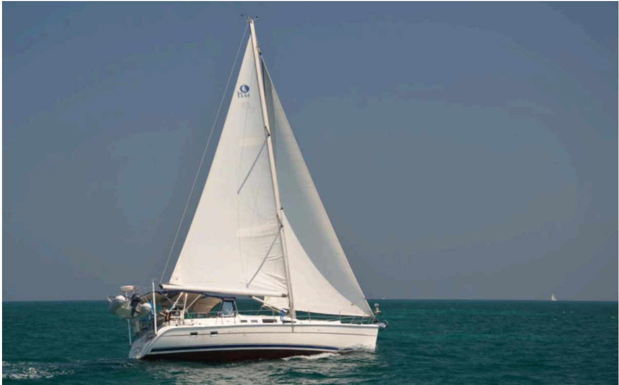
Sailing On Starboard