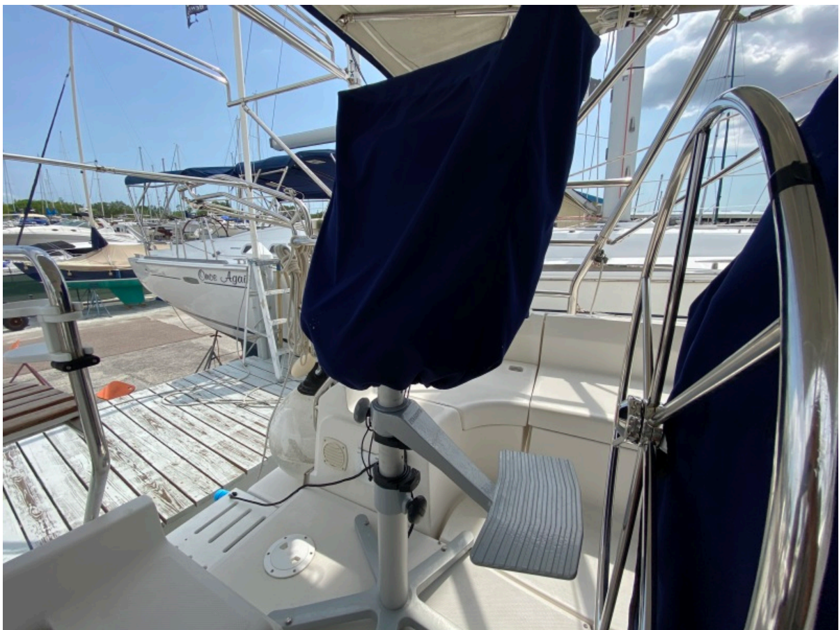
ZWAARDVIS Helm Seat