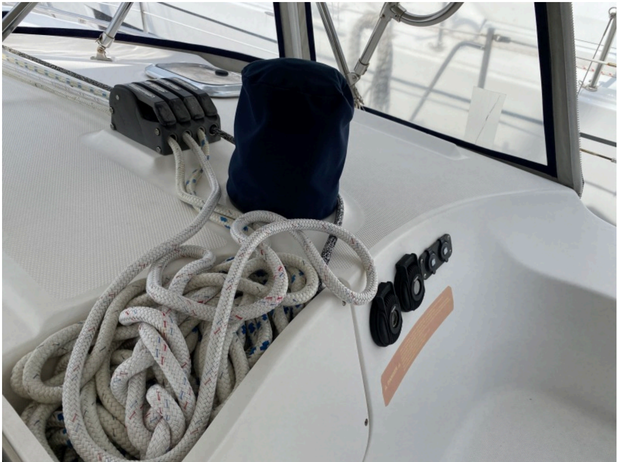
Electric Cabin Top Winch