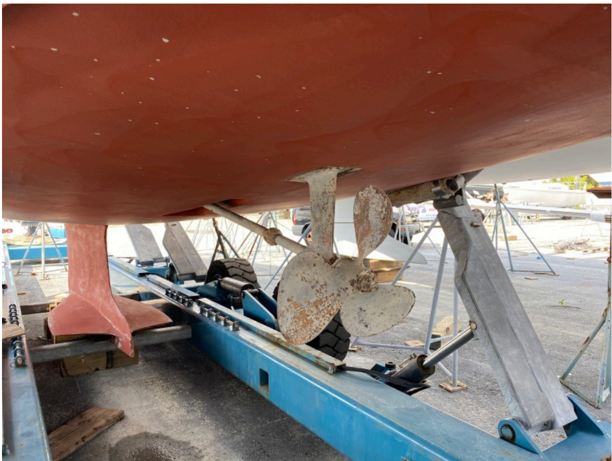
Prop And Keel