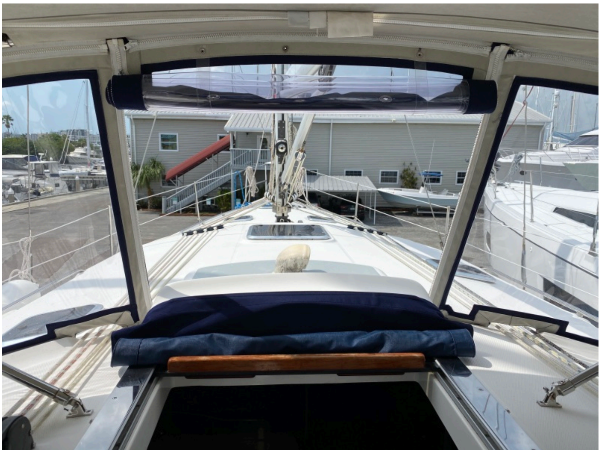
Cockpit Looking Fwd