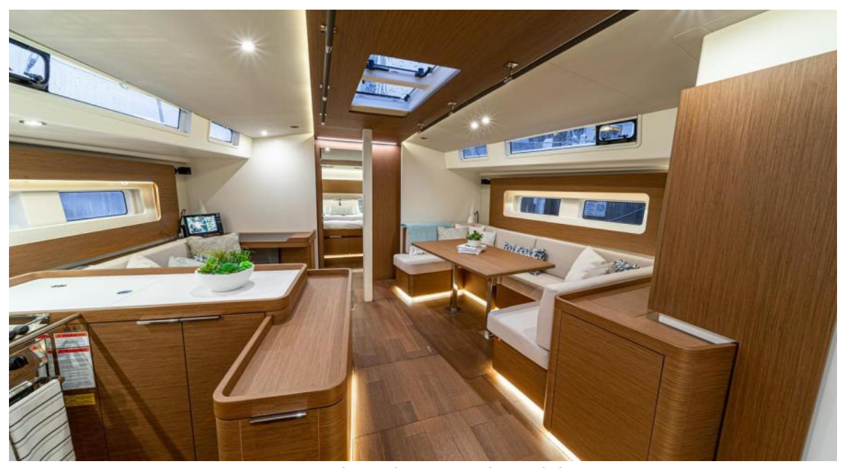
Oceanis Yacht 54 Walnut Alpi