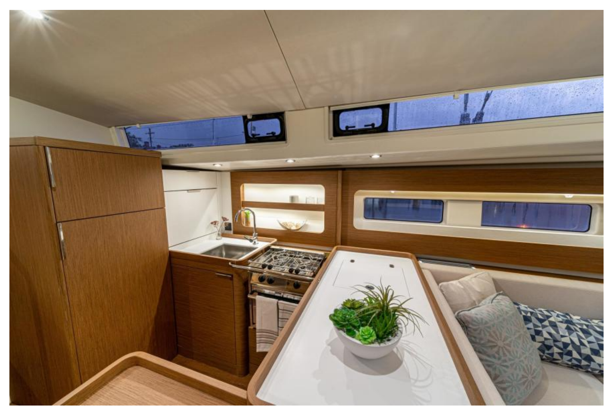
Oceanis Yacht 54 Walnut Alpi