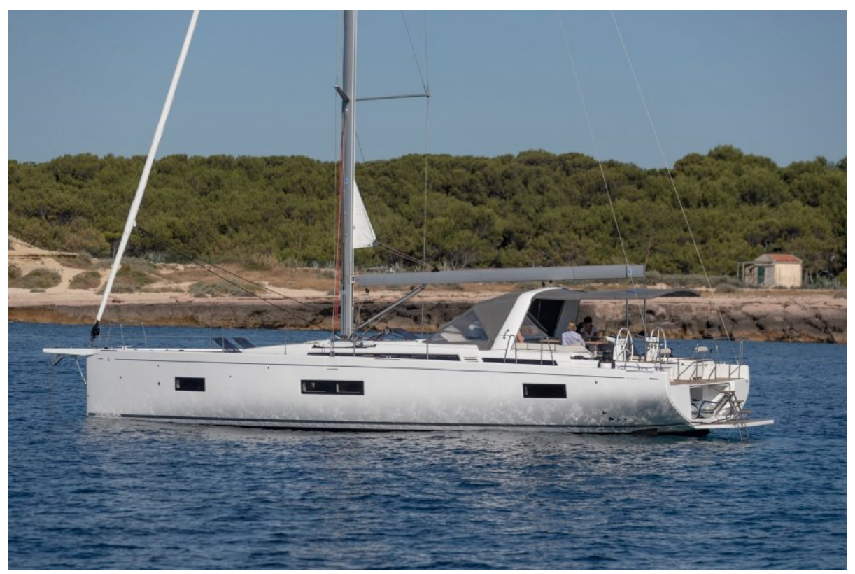
Oceanis Yacht 54