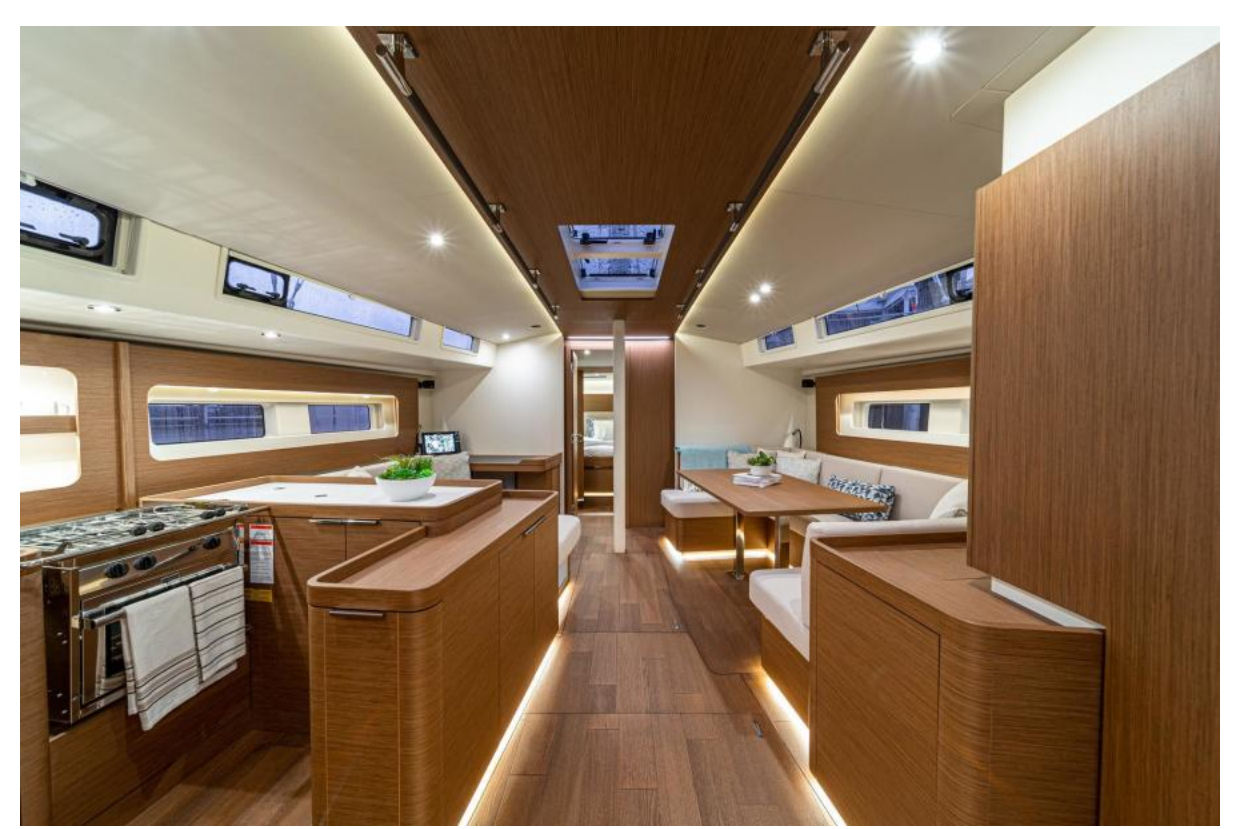
Oceanis Yacht 54 Walnut Alpi