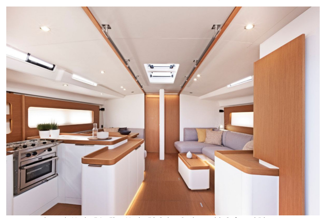
Oceanis Yacht 54 First Yacht 53 Salon Options with Sofa and Dinette