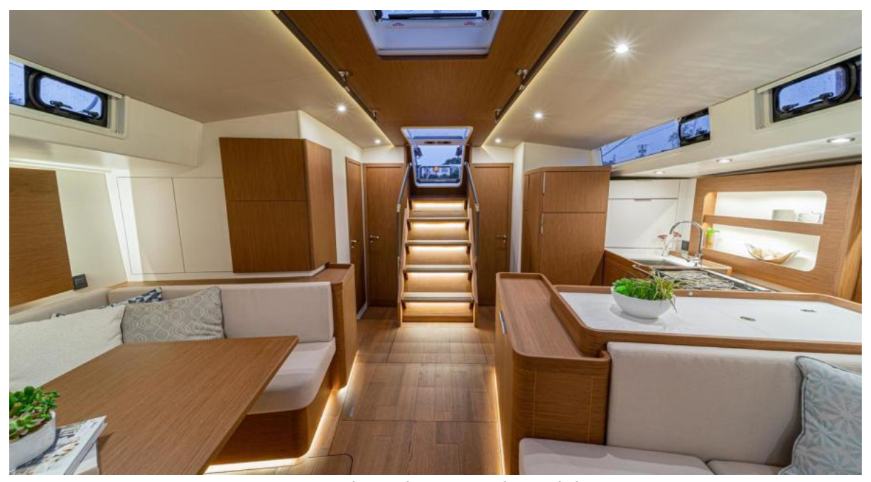
Oceanis Yacht 54 Walnut Alpi