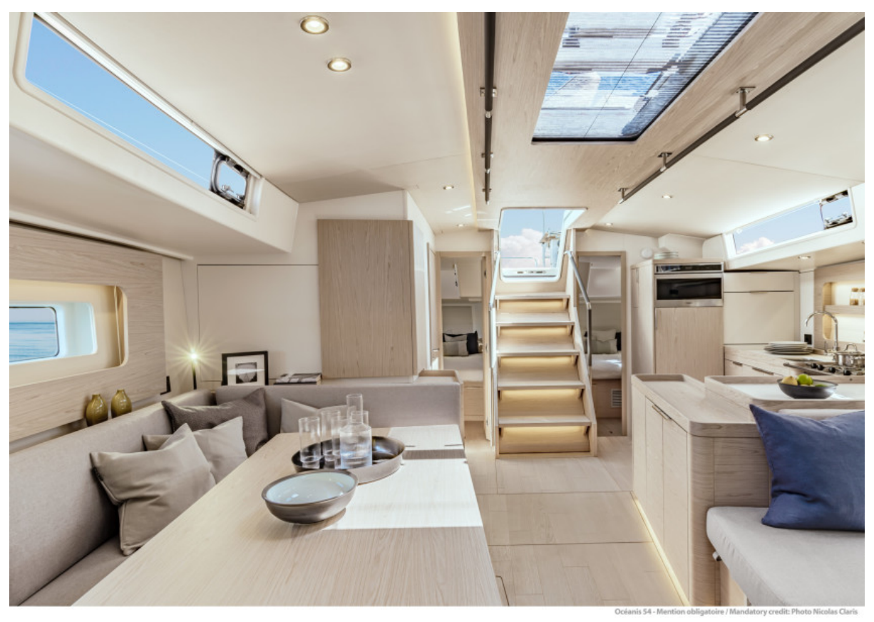
Oceanis Yacht 54 3 Gloss Oak Alpi