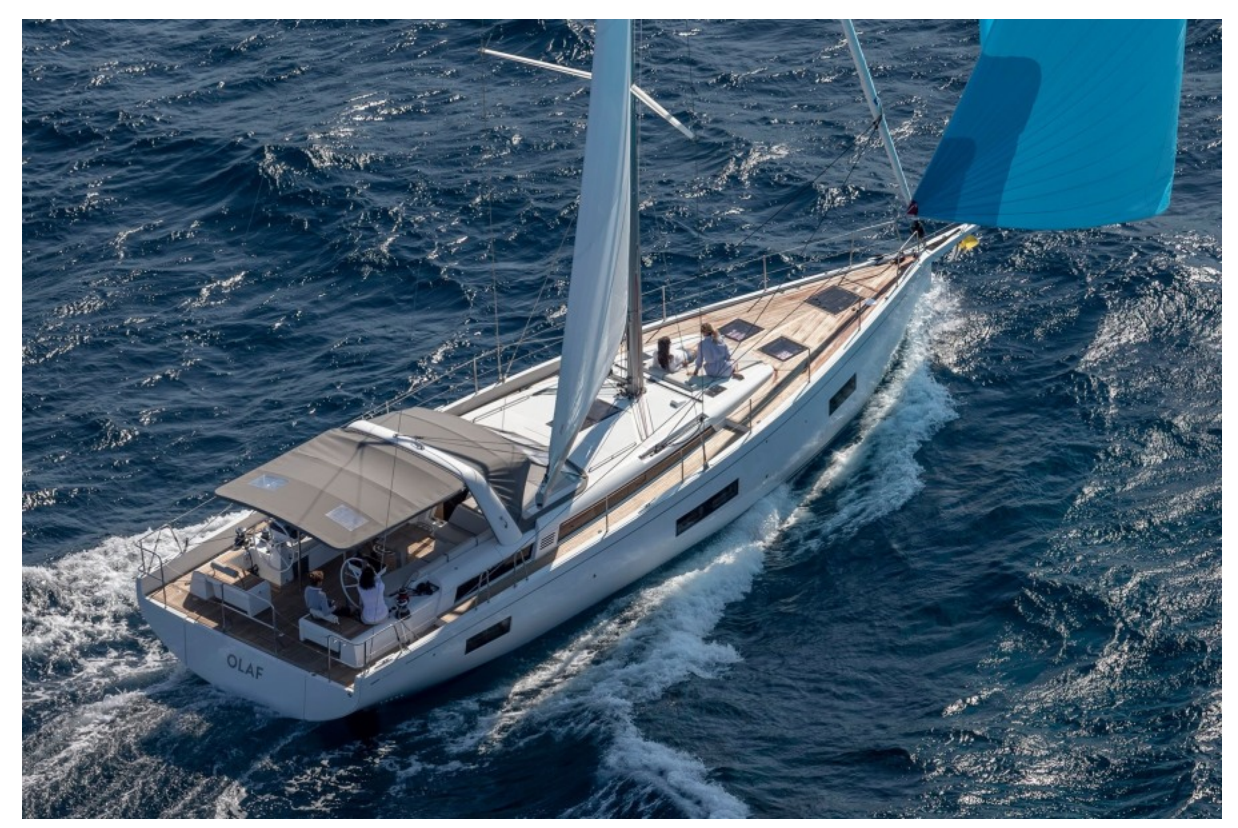
Oceanis Yacht 54