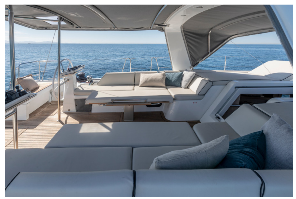
Oceanis Yacht 54