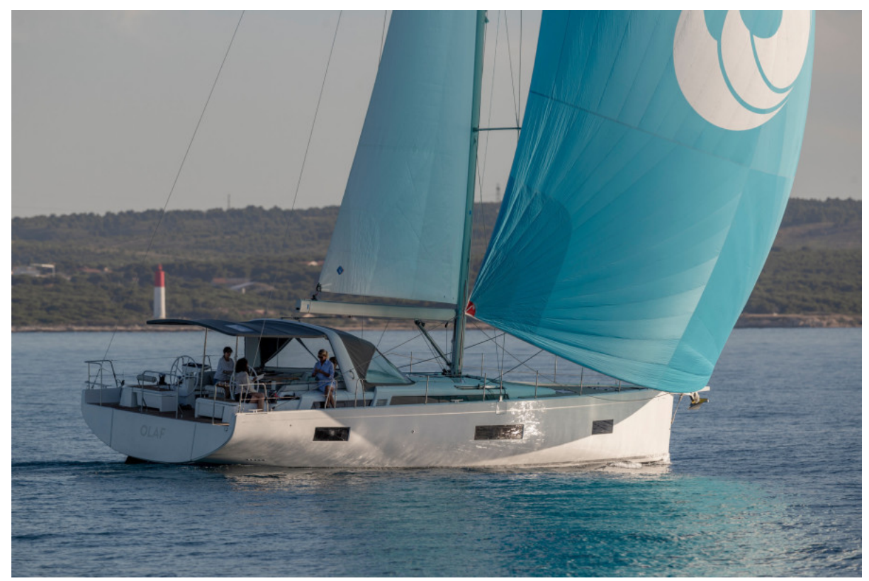
Oceanis Yacht 54