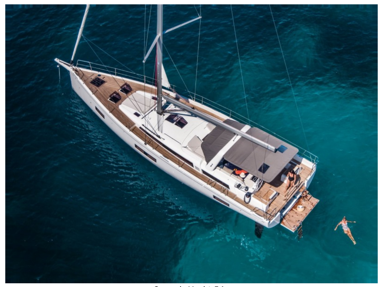
Oceanis Yacht 54