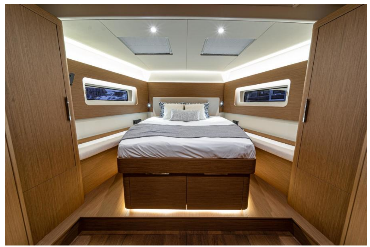
Oceanis Yacht 54 Walnut Alpi