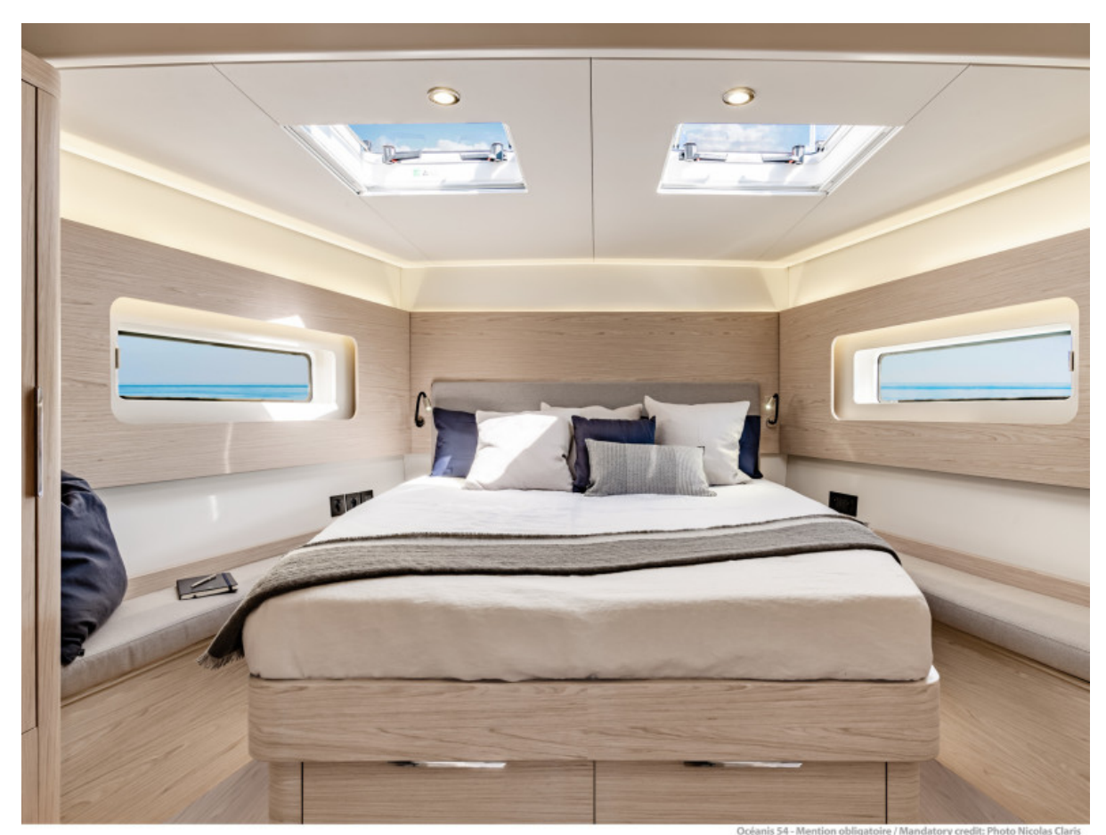
Oceanis Yacht 54 3 Gloss Oak Alpi