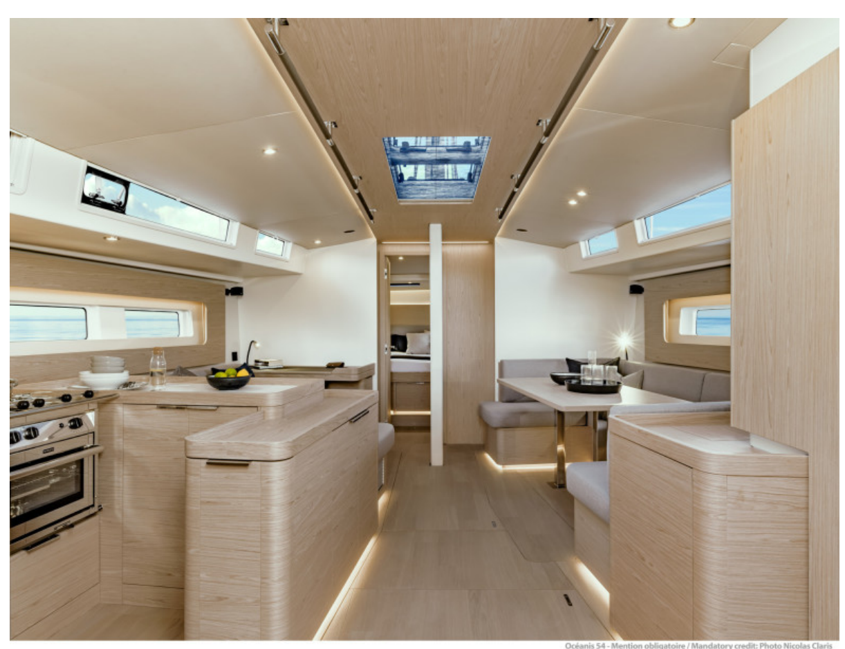
Oceanis Yacht 54 3 Gloss Oak Alpi