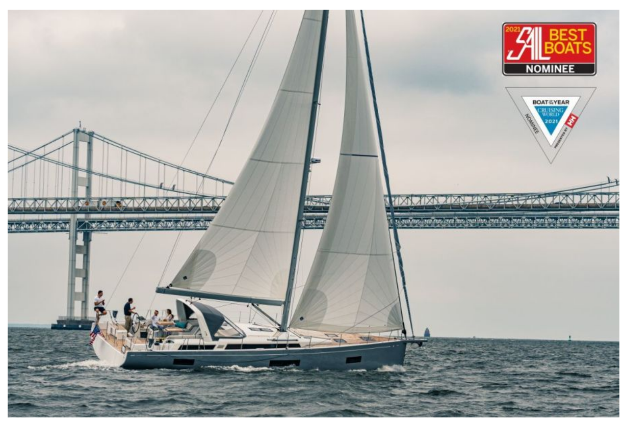
Oceanis Yacht 54