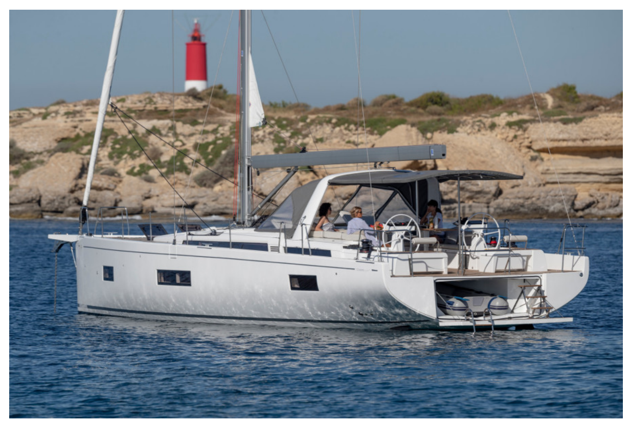
Oceanis Yacht 54