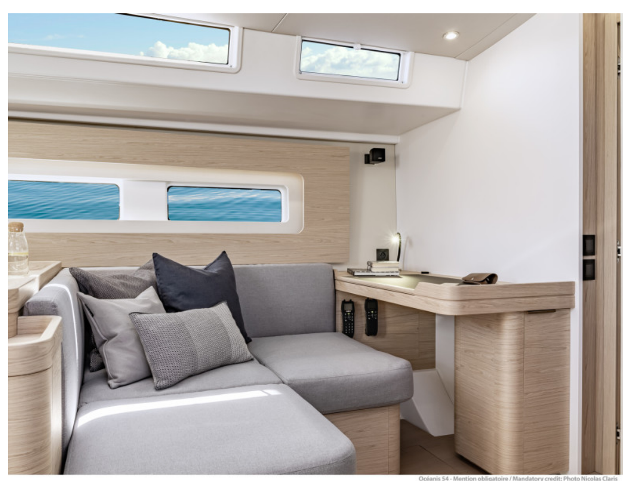
Oceanis Yacht 54 3 Gloss Oak Alpi