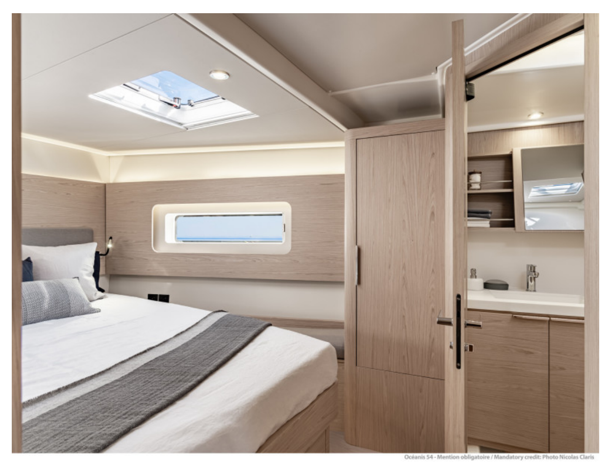
Oceanis Yacht 54 3 Gloss Oak Alpi