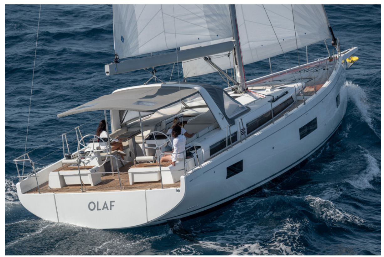
Oceanis Yacht 54