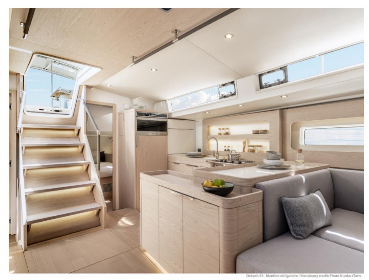
Oceanis Yacht 54 3 Gloss Oak Alpi