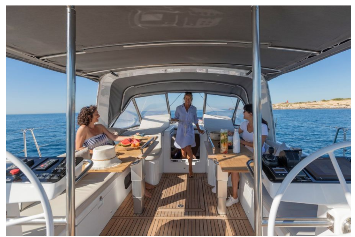
Oceanis Yacht 54