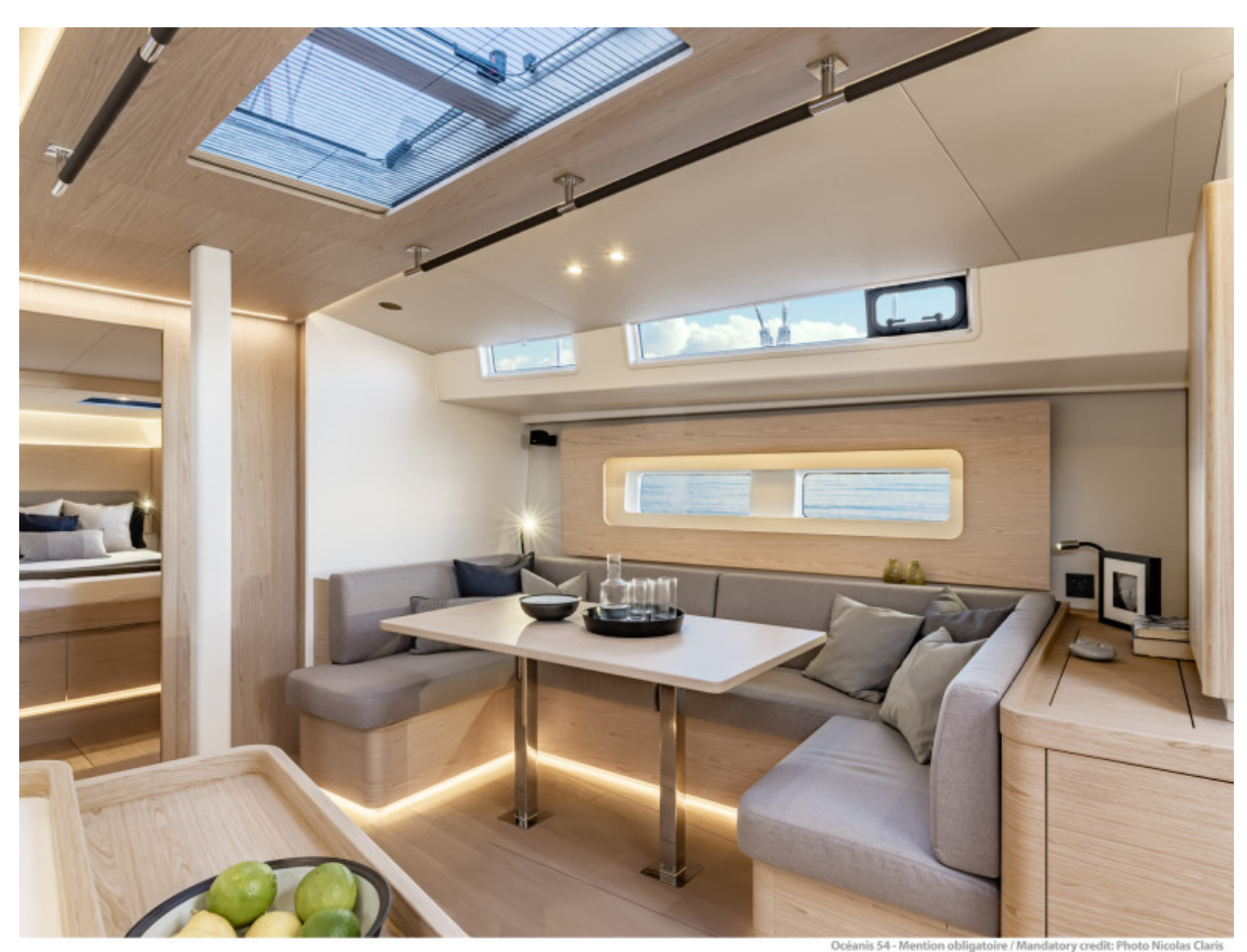
Oceanis Yacht 54 3 Gloss Oak Alpi