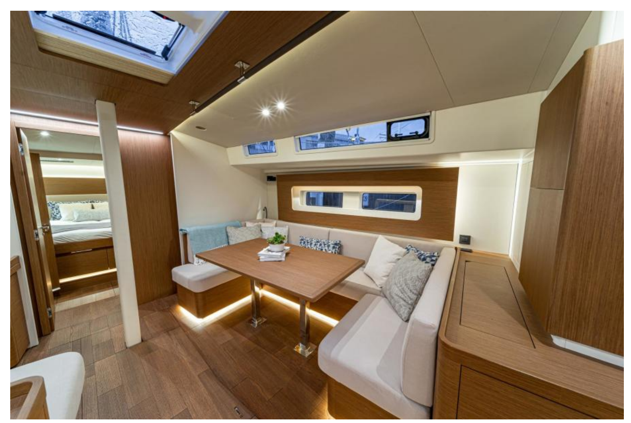
Oceanis Yacht 54 Walnut Alpi