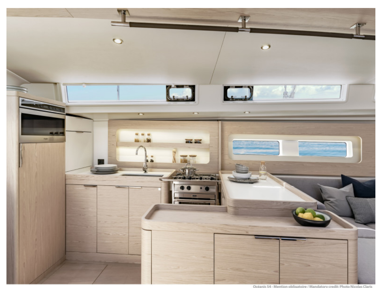
Oceanis Yacht 54 3 Gloss Oak Alpi