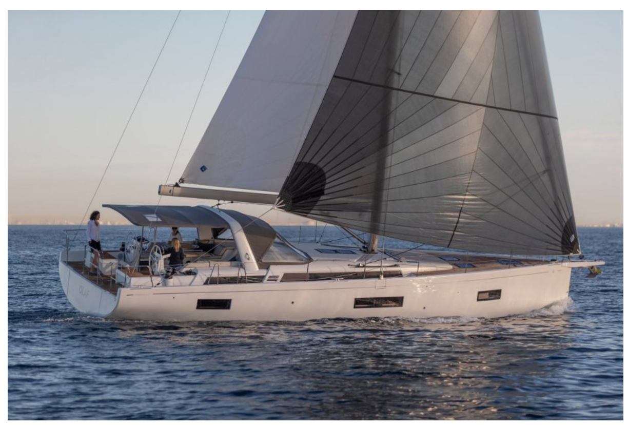
Oceanis Yacht 54