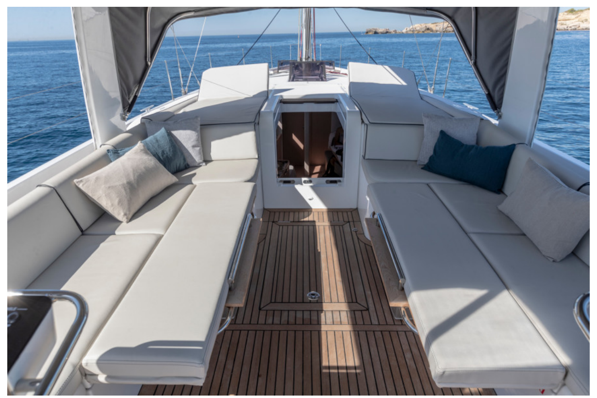
Oceanis Yacht 54