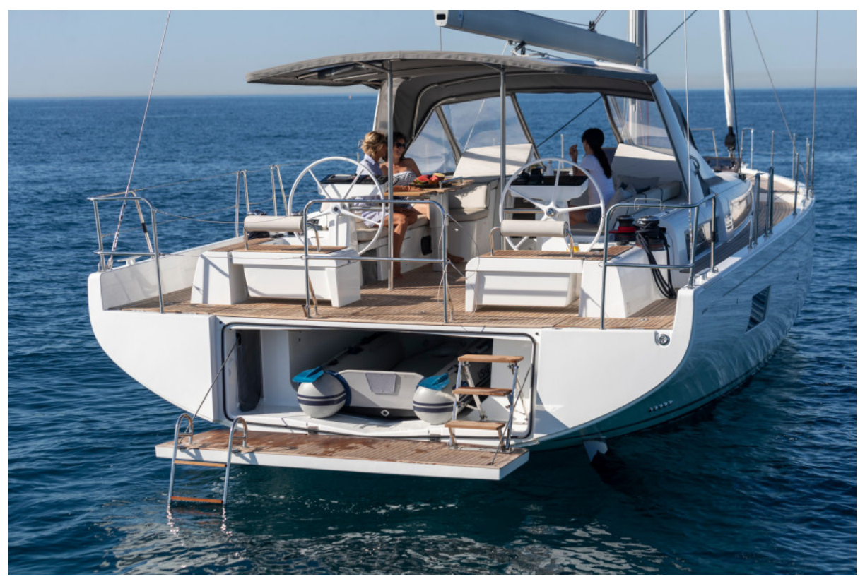
Oceanis Yacht 54