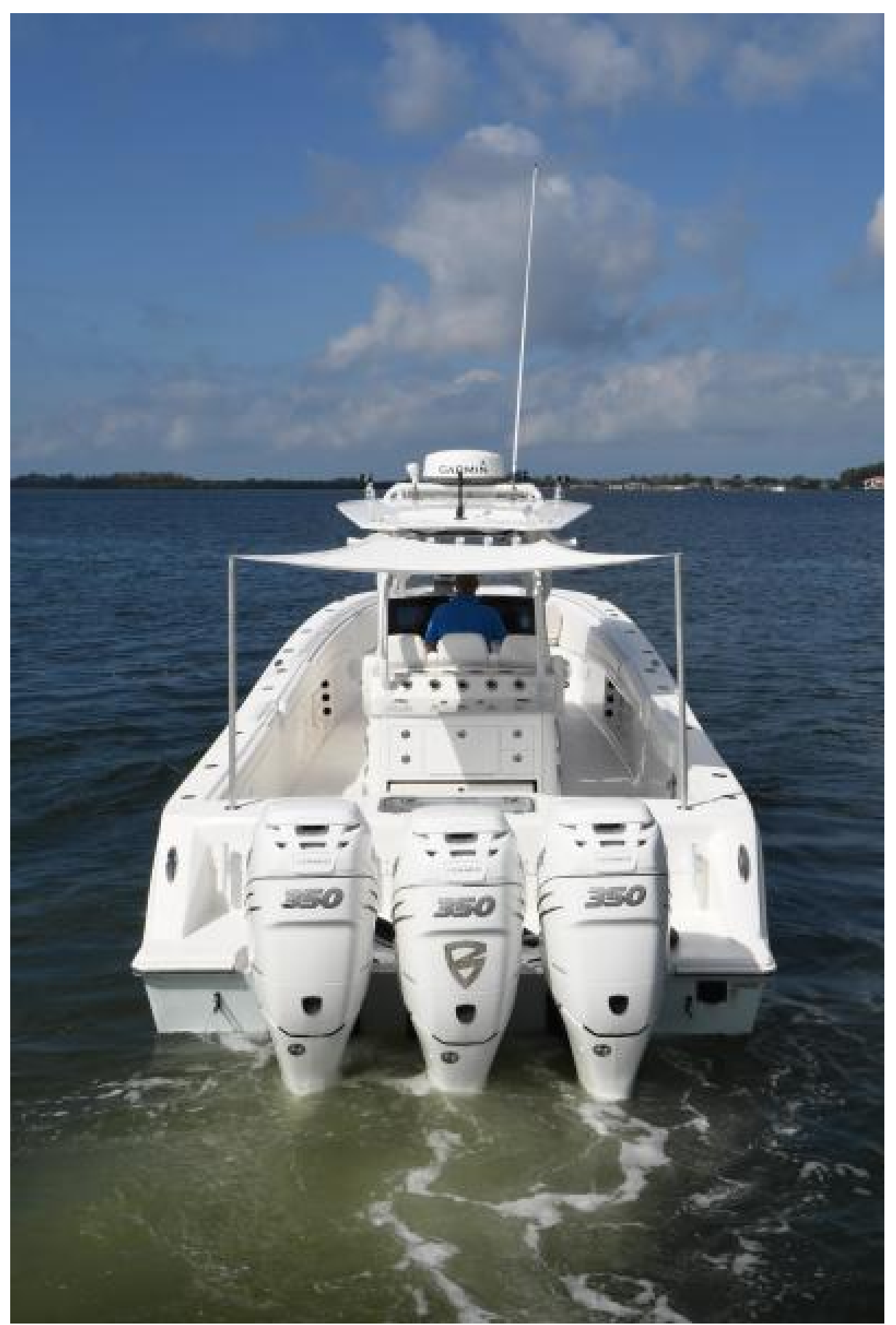
2017 Barker Boatworks 400 FS7 - Triple Mercury Verado