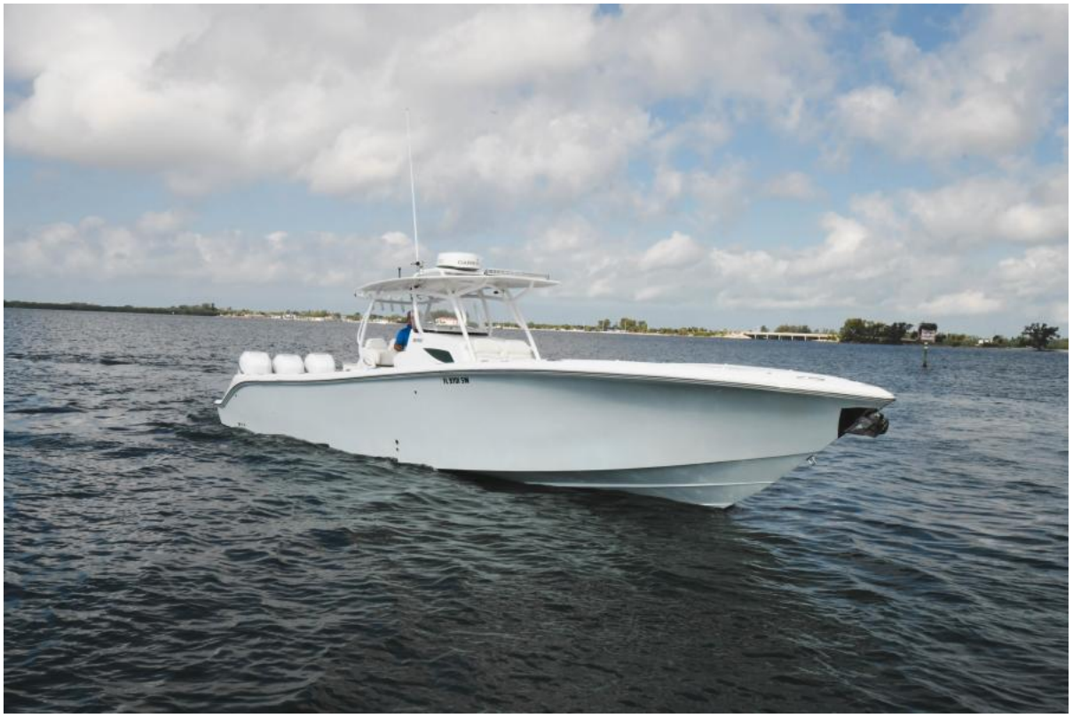
2017 Barker Boatworks 400 FS7 - Profile