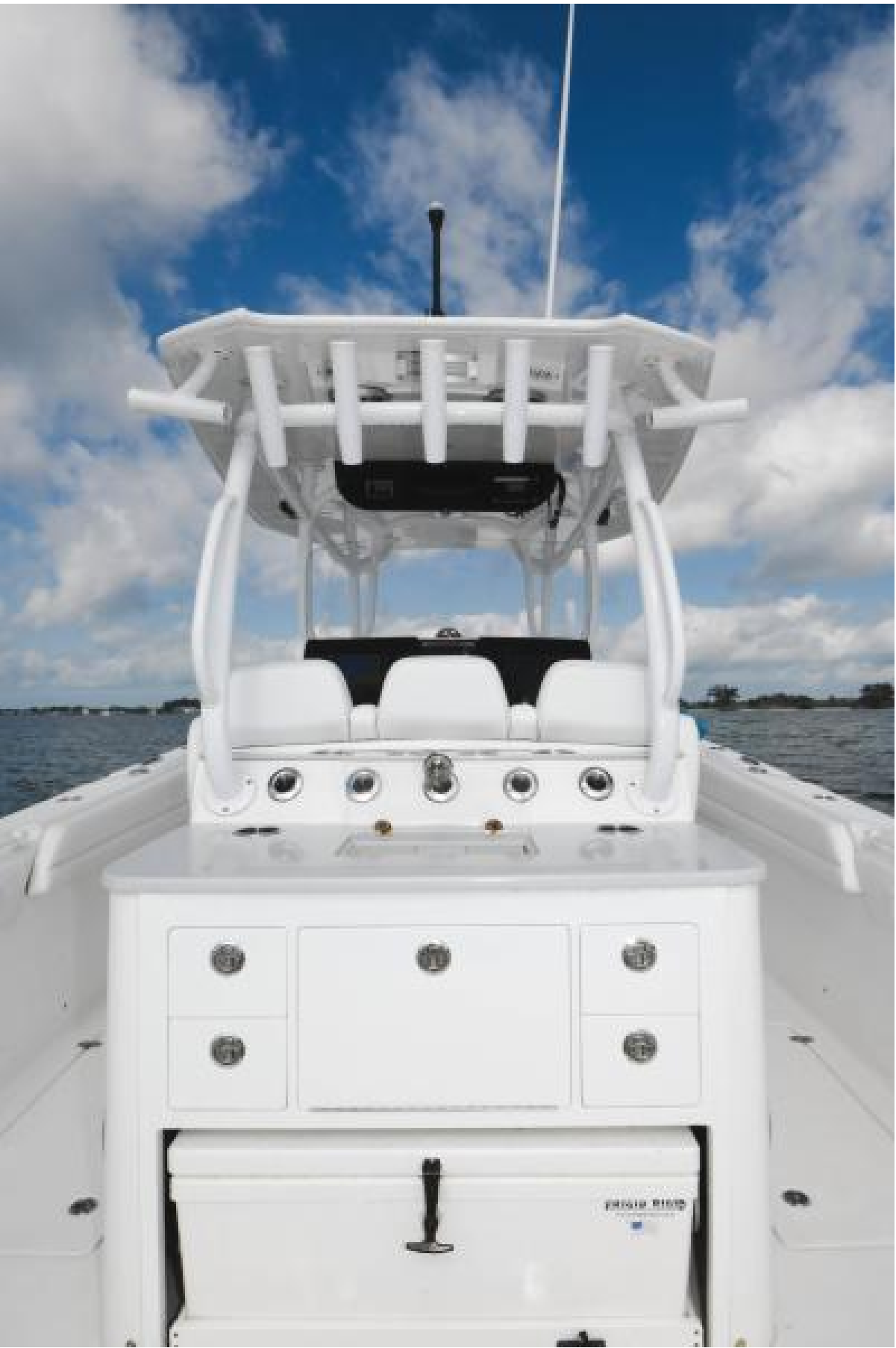
2017 Barker Boatworks 400 FS7 - Cockpit