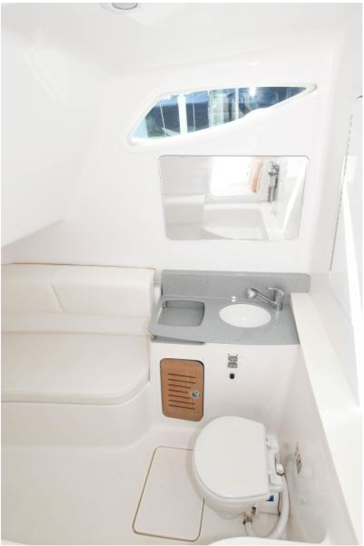
2017 Barker Boatworks 400 FS7 - Cabin