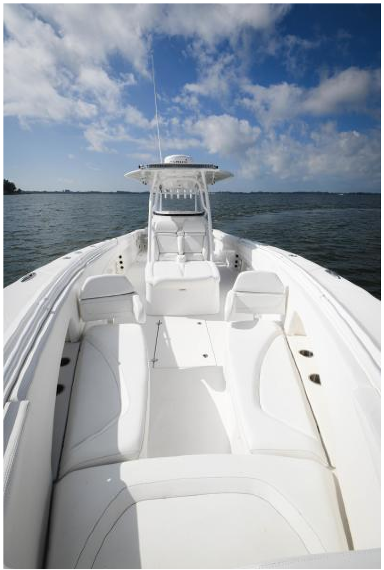
2017 Barker Boatworks 400 FS7 - Bow