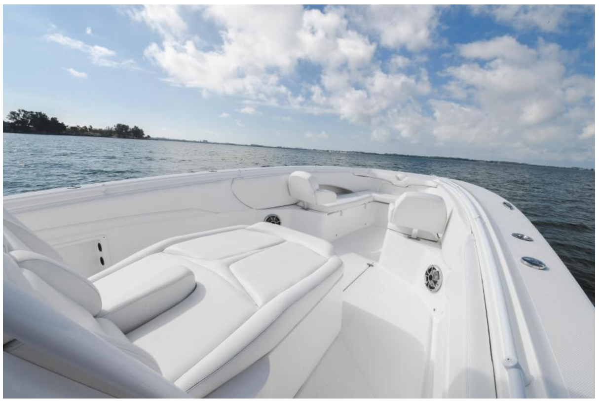
2017 Barker Boatworks 400 FS7 - Bow