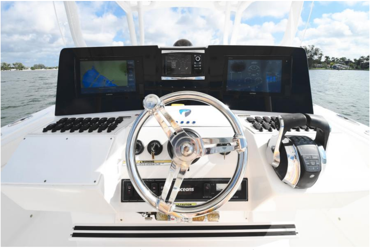
2017 Barker Boatworks 400 FS7 - Helm