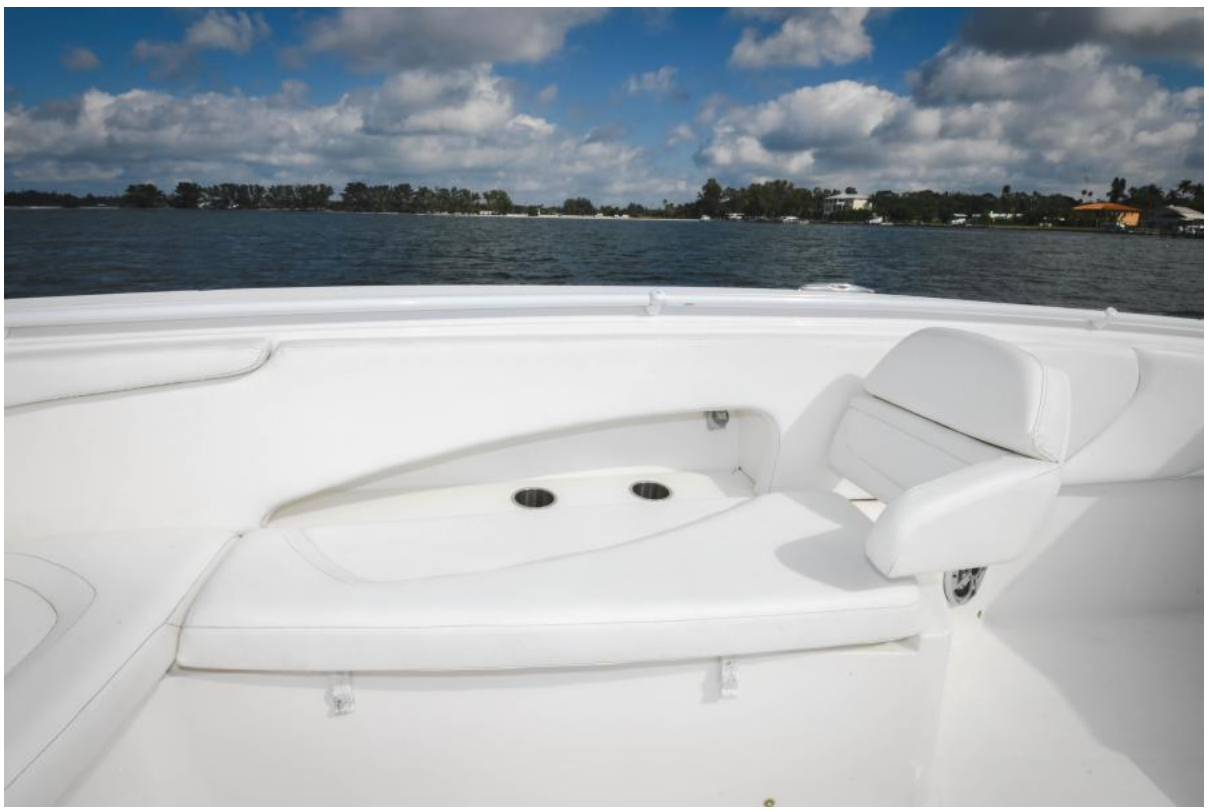
2017 Barker Boatworks 400 FS7 - Bow