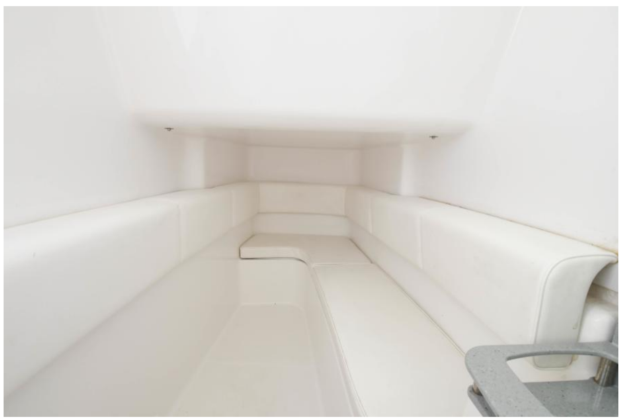
2017 Barker Boatworks 400 FS7 - Cabin