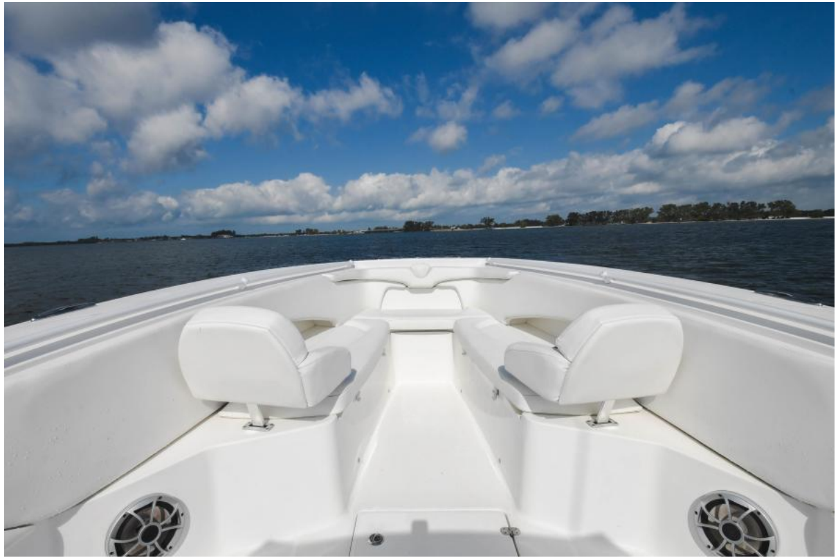
2017 Barker Boatworks 400 FS7 - Bow