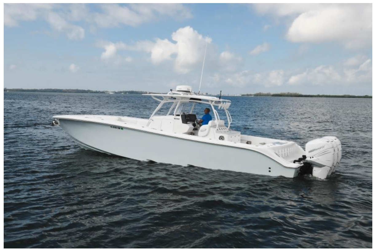
2017 Barker Boatworks 400 FS7 - Profile