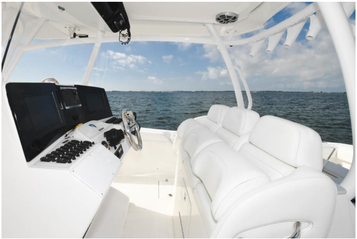
2017 Barker Boatworks 400 FS7 - Helm