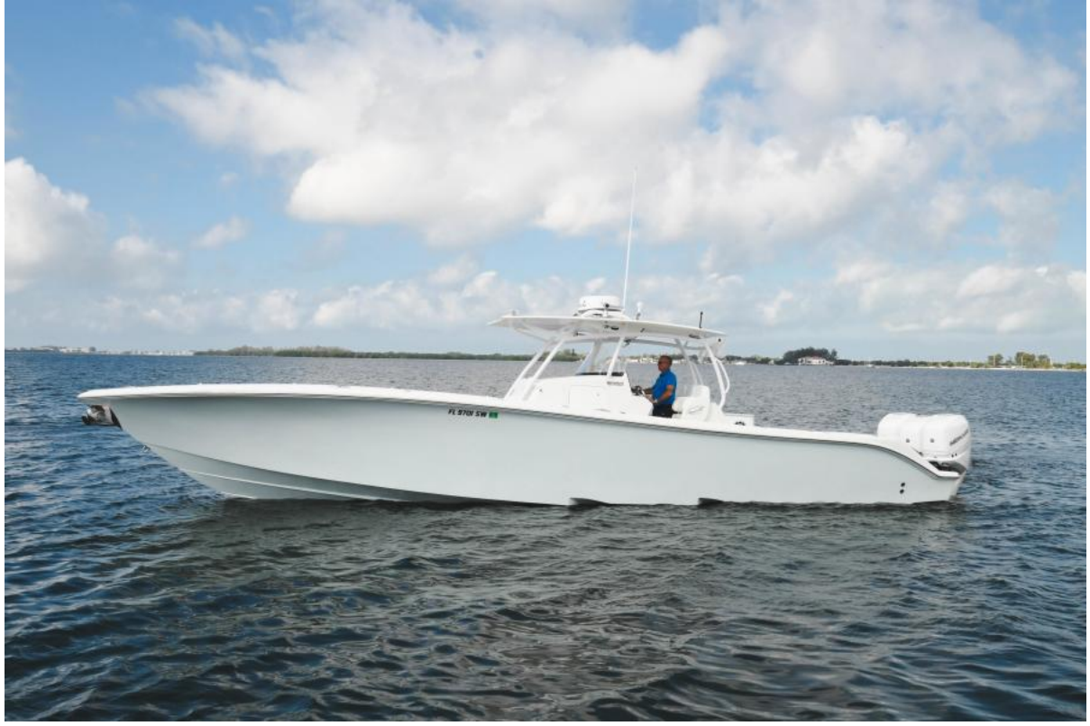
2017 Barker Boatworks 400 FS7 - Profile