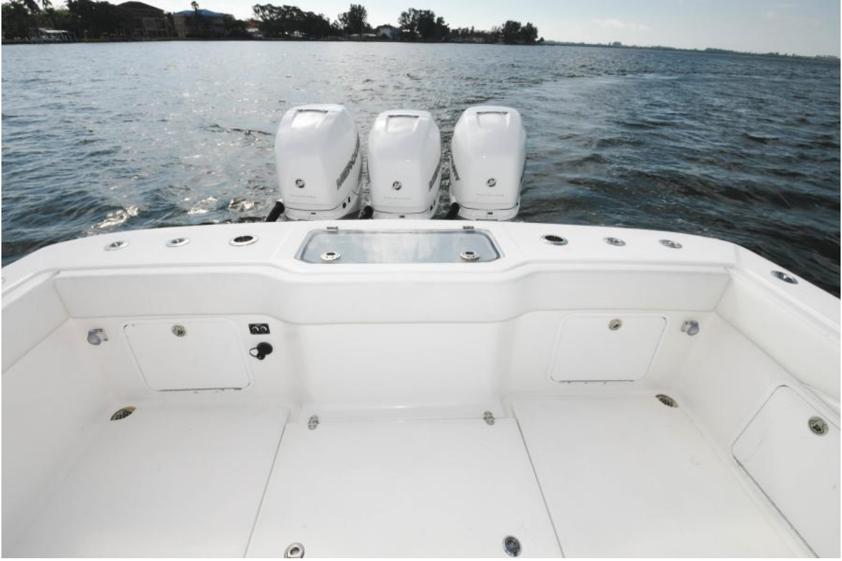
2017 Barker Boatworks 400 FS7 - Cockpit