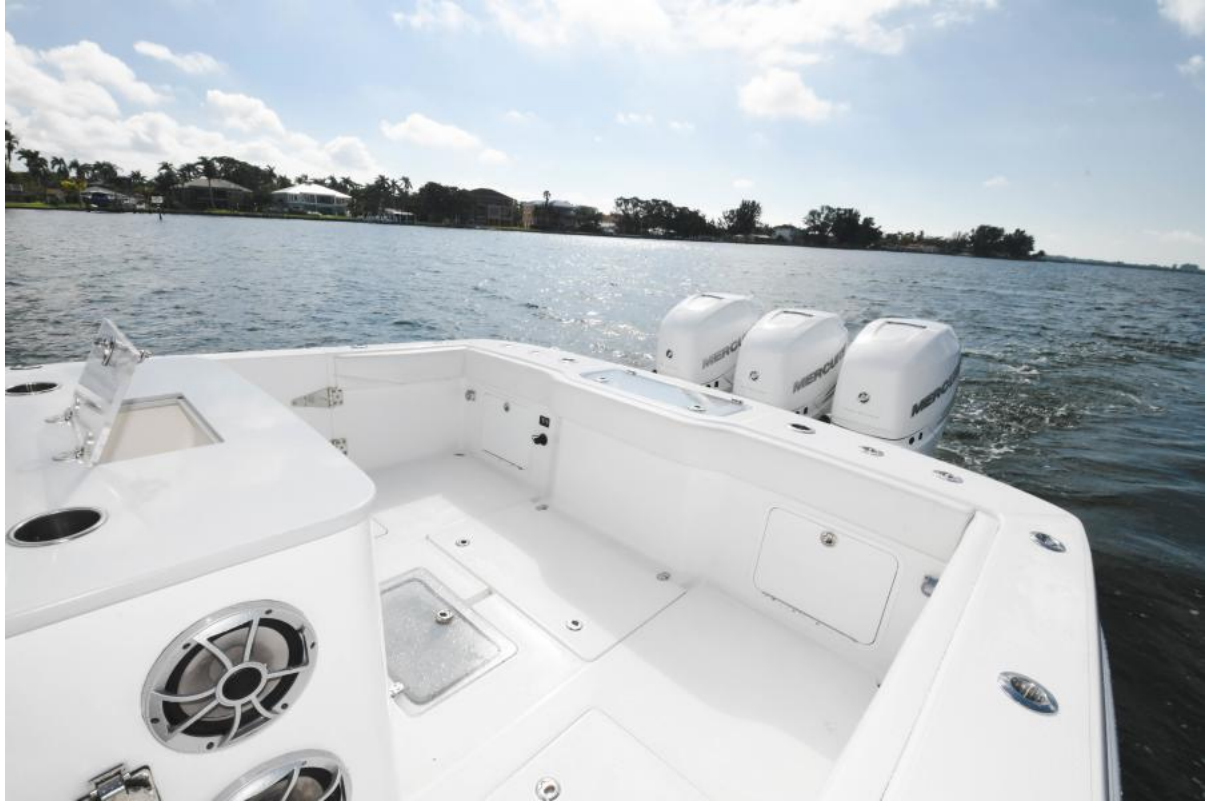
2017 Barker Boatworks 400 FS7 - Cockpit