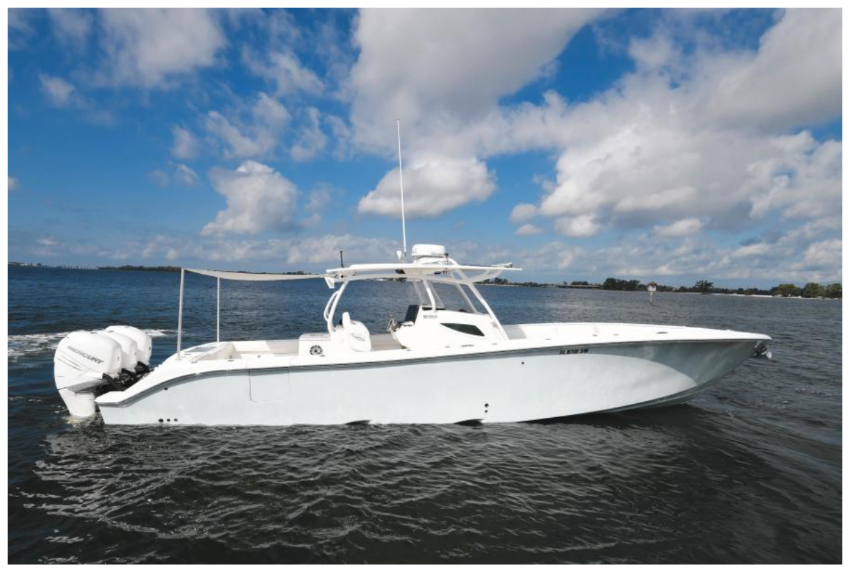
2017 Barker Boatworks 400 FS7 - Bimini Top