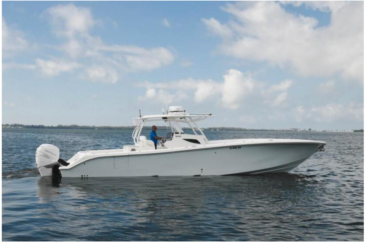
2017 Barker Boatworks 400 FS7 - Profile