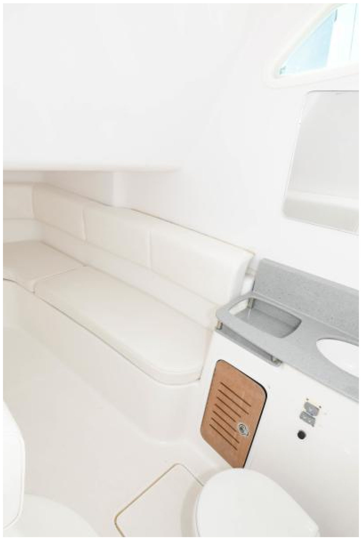
2017 Barker Boatworks 400 FS7 - Cabin