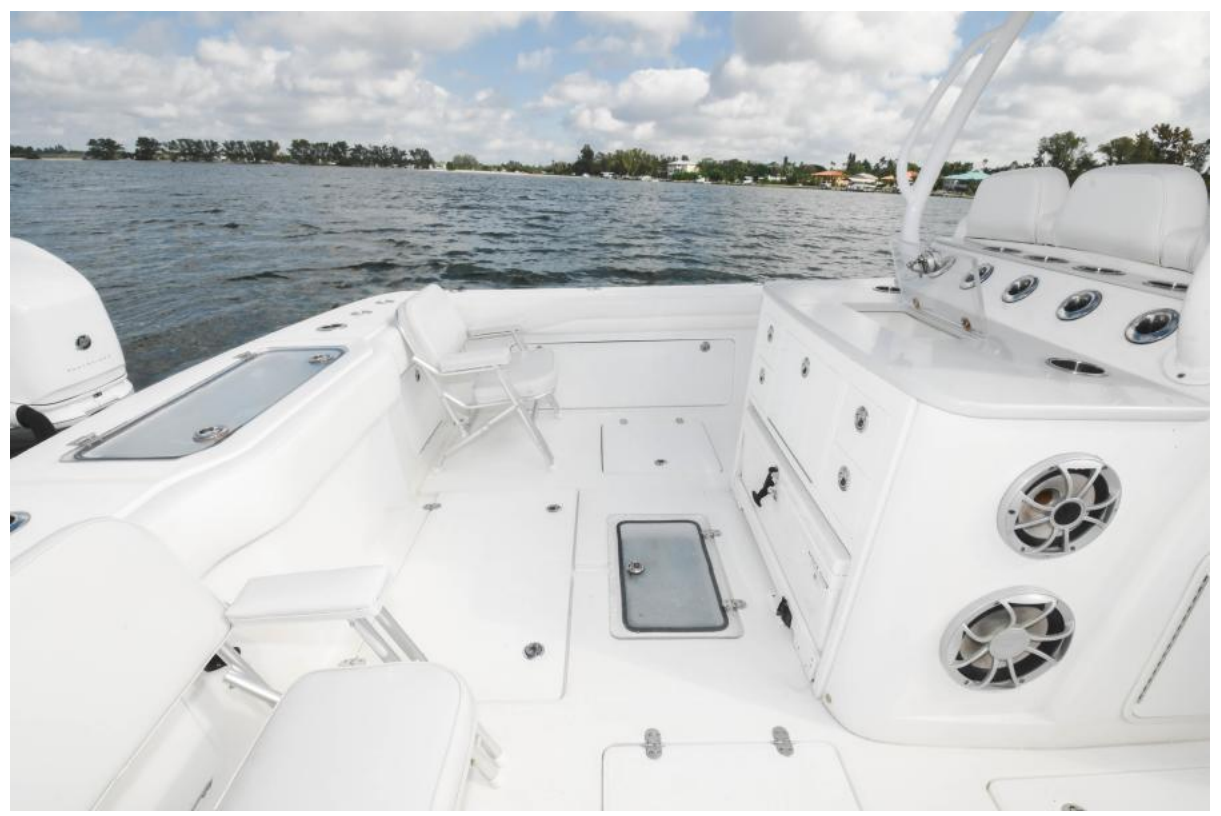
2017 Barker Boatworks 400 FS7 - Cockpit