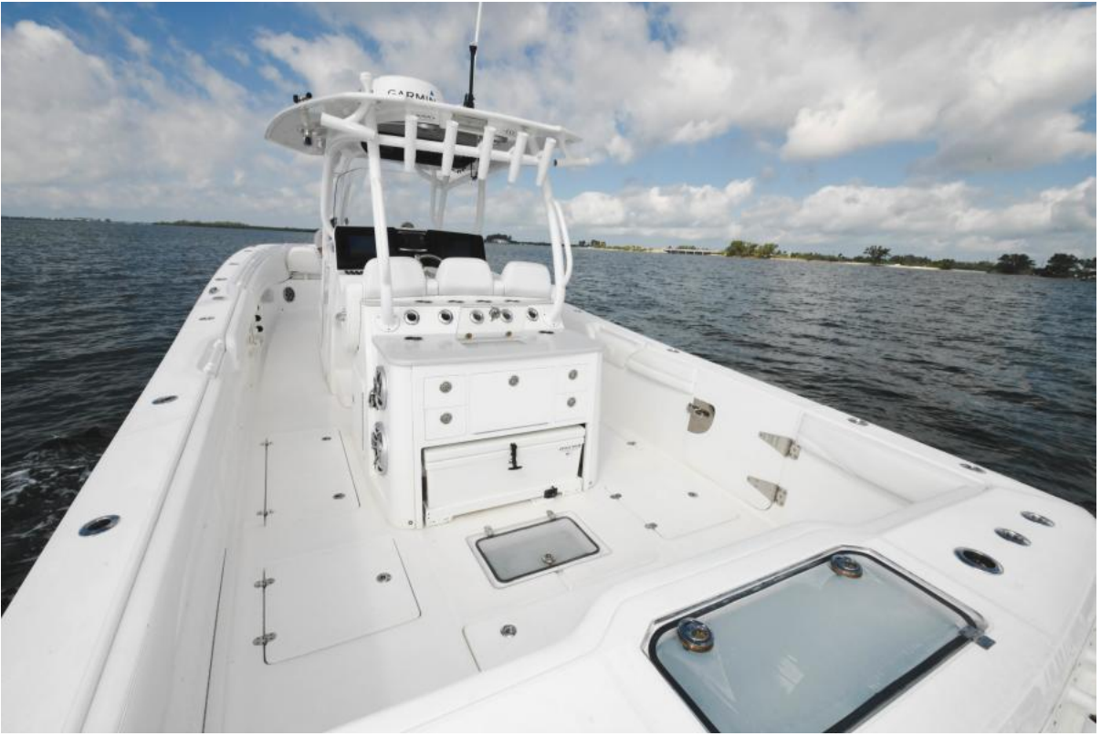
2017 Barker Boatworks 400 FS7 - Cockpit