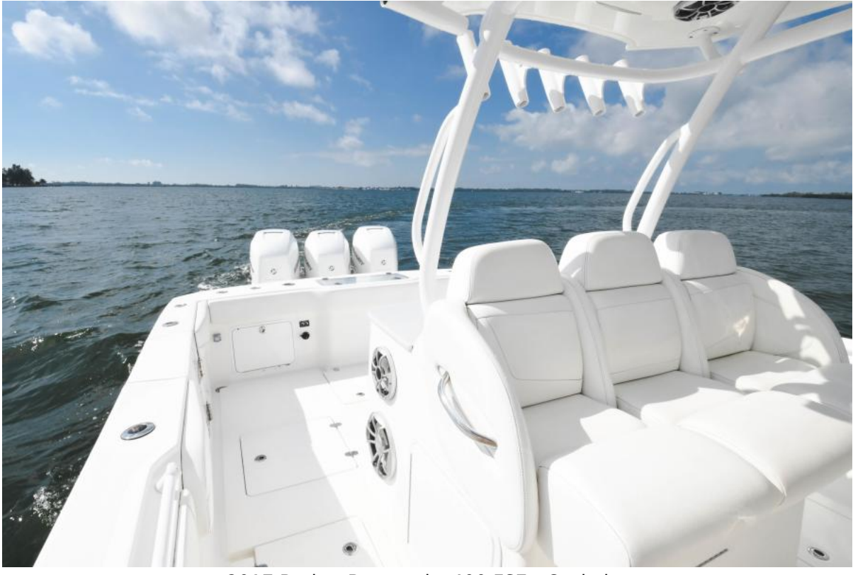
2017 Barker Boatworks 400 FS7 - Cockpit