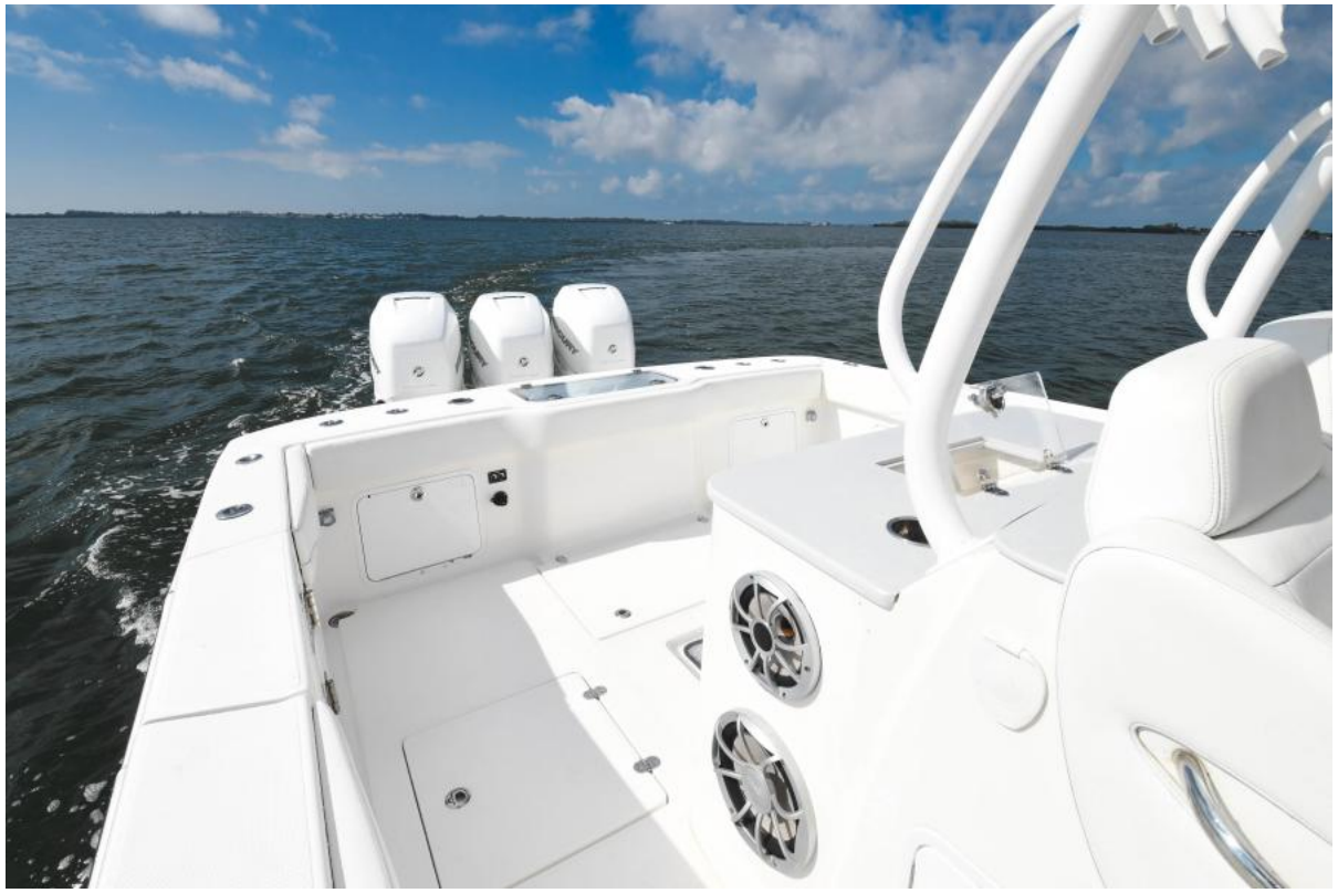
2017 Barker Boatworks 400 FS7 - Cockpit