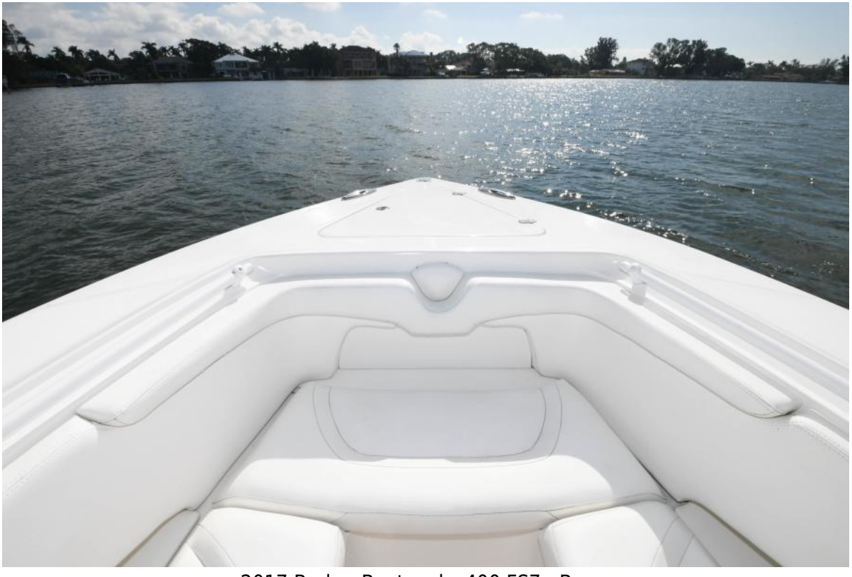
2017 Barker Boatworks 400 FS7 - Bow