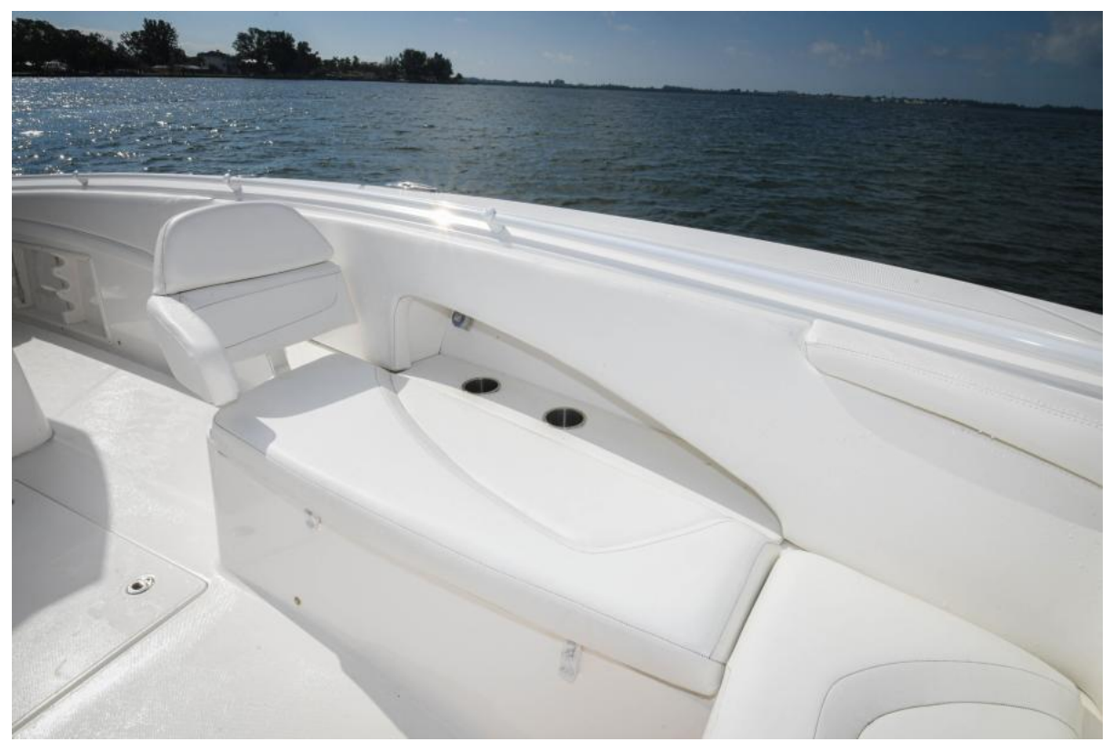
2017 Barker Boatworks 400 FS7 - Bow