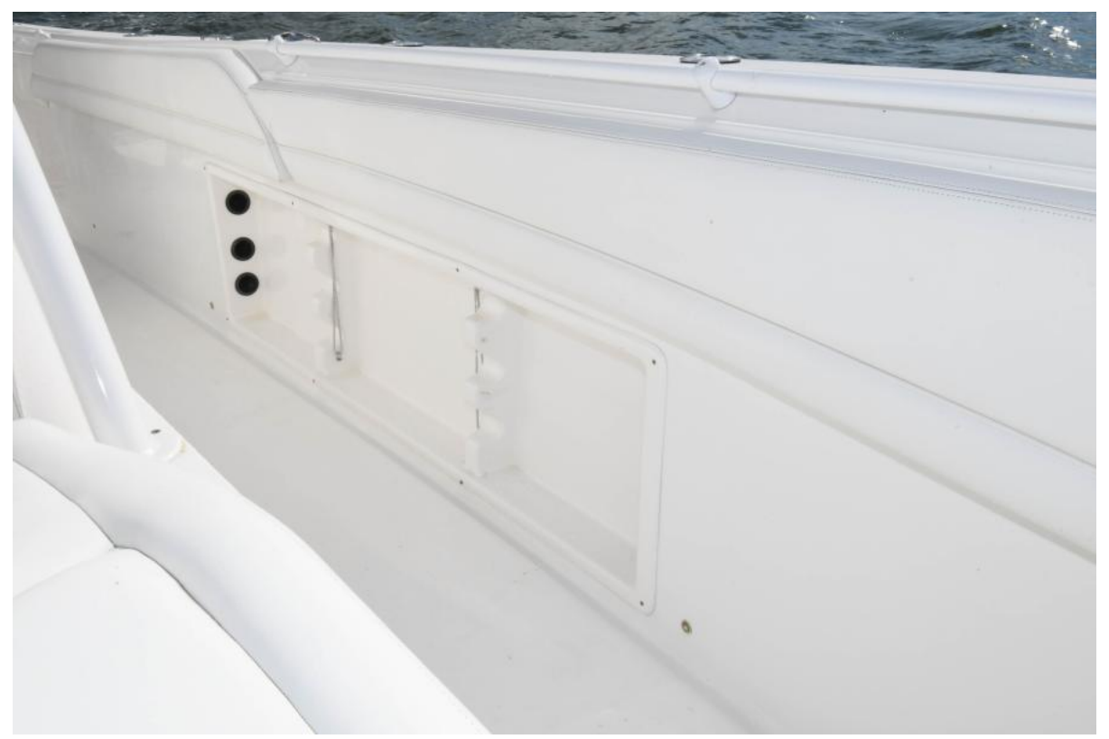
2017 Barker Boatworks 400 FS7 - Walkway/ Rodholders