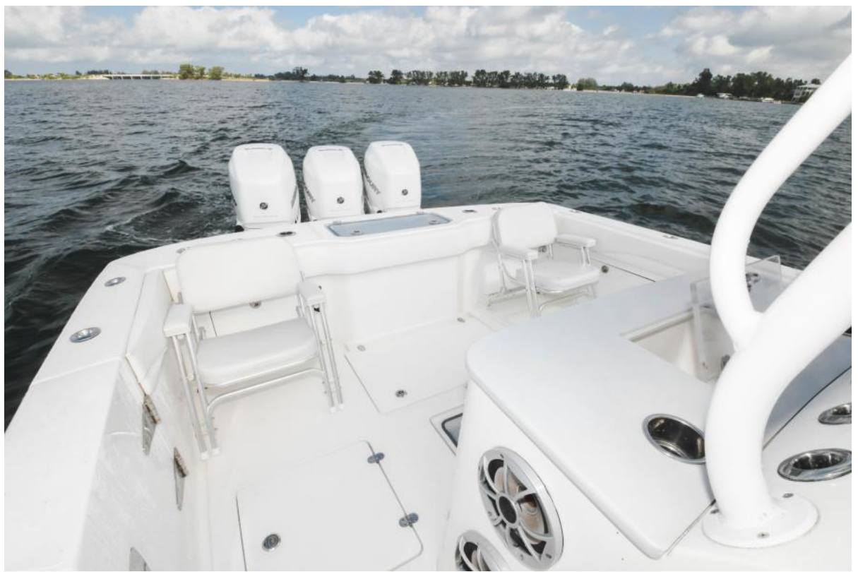
2017 Barker Boatworks 400 FS7 - Cockpit