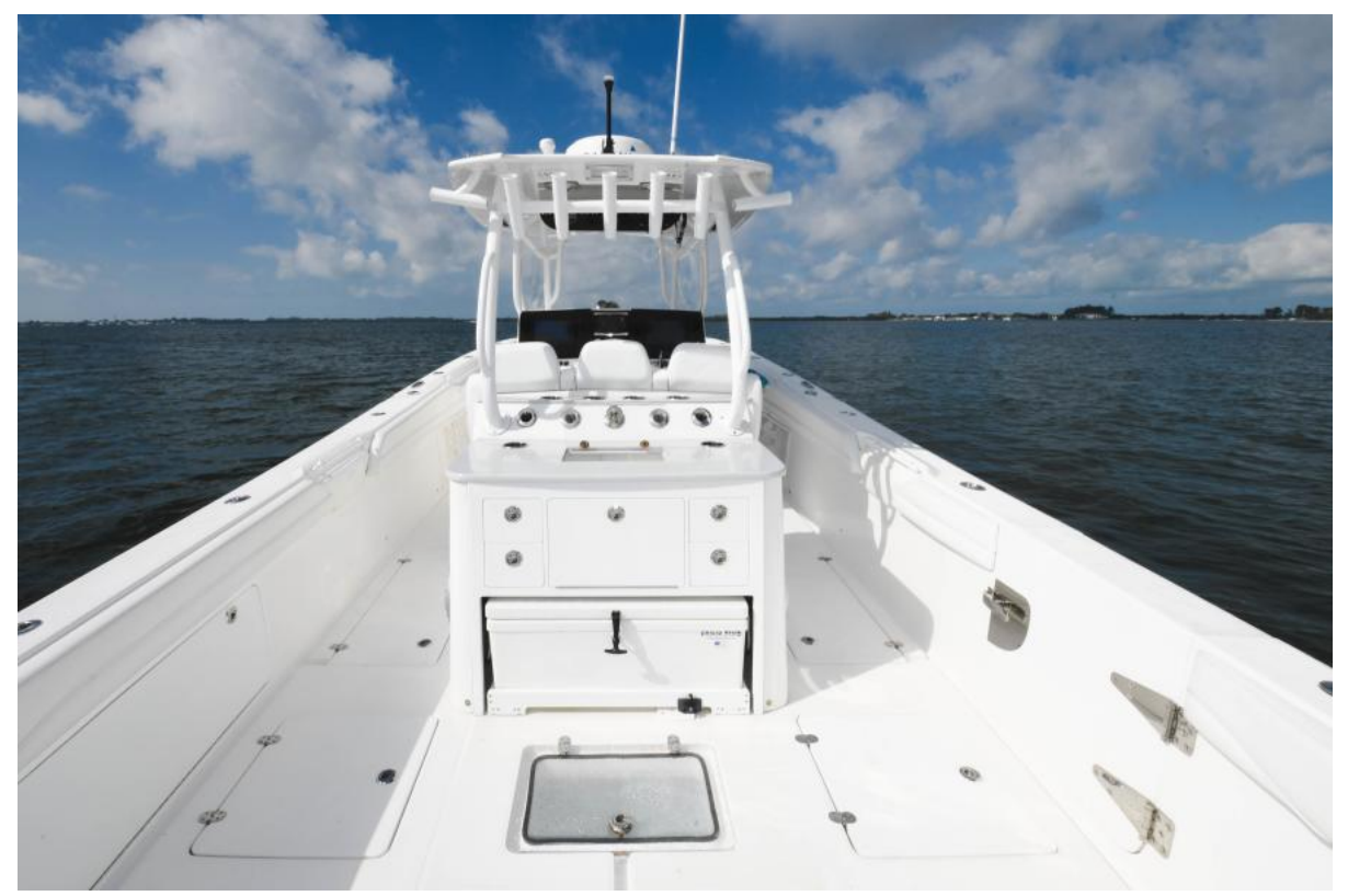
2017 Barker Boatworks 400 FS7 - Cockpit