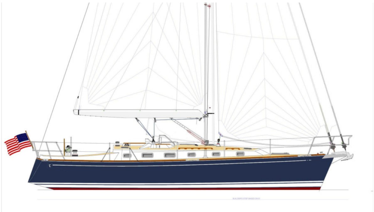
2019 Tartan Profile