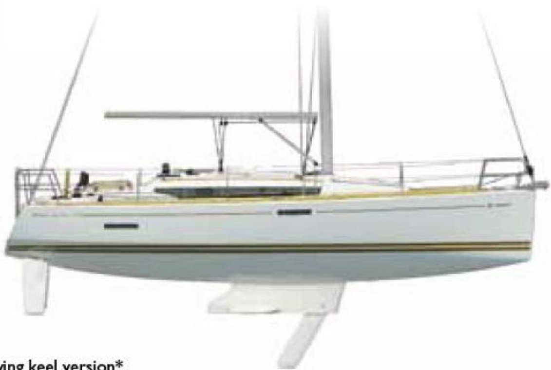
Swing keel version*