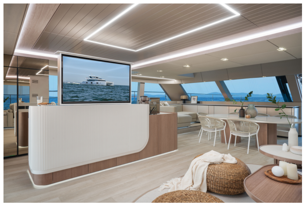
80 Sunreef Power Kokomo (14)