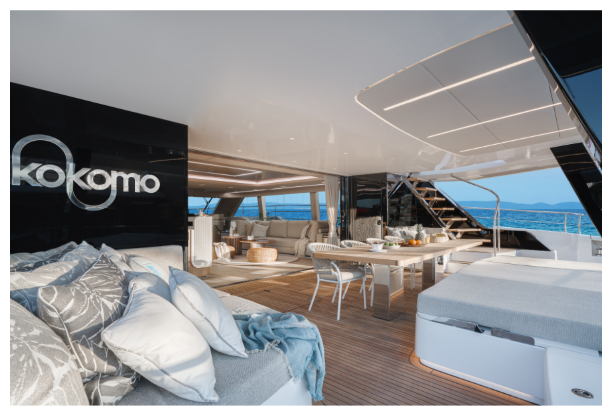
80 Sunreef Power Kokomo (15)