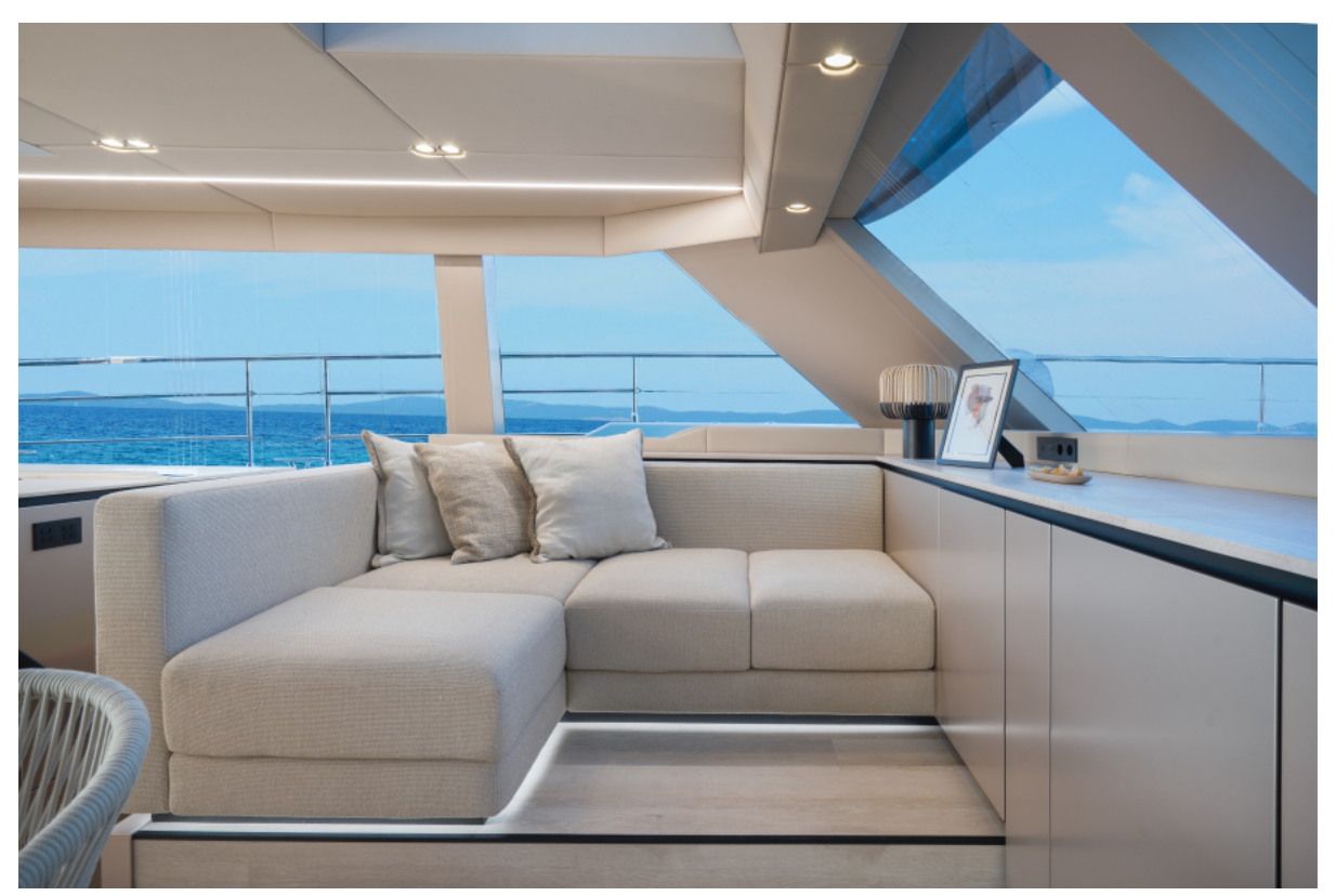
80 Sunreef Power Kokomo (13)