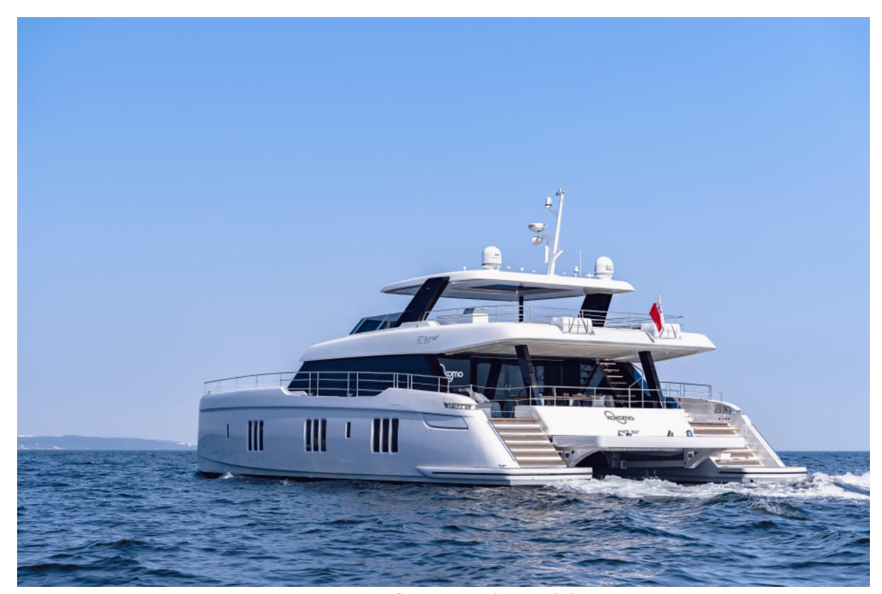
80 Sunreef Power Kokomo (3)