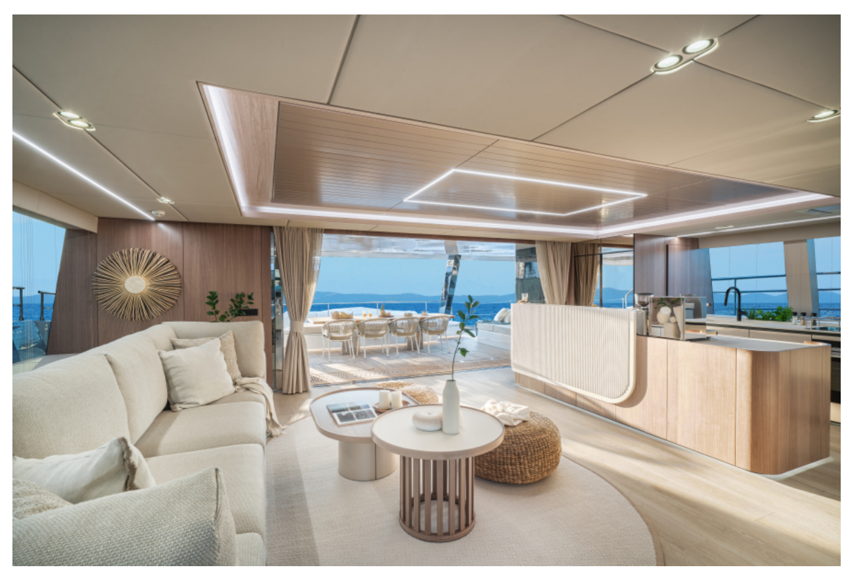
80 Sunreef Power Kokomo (11)