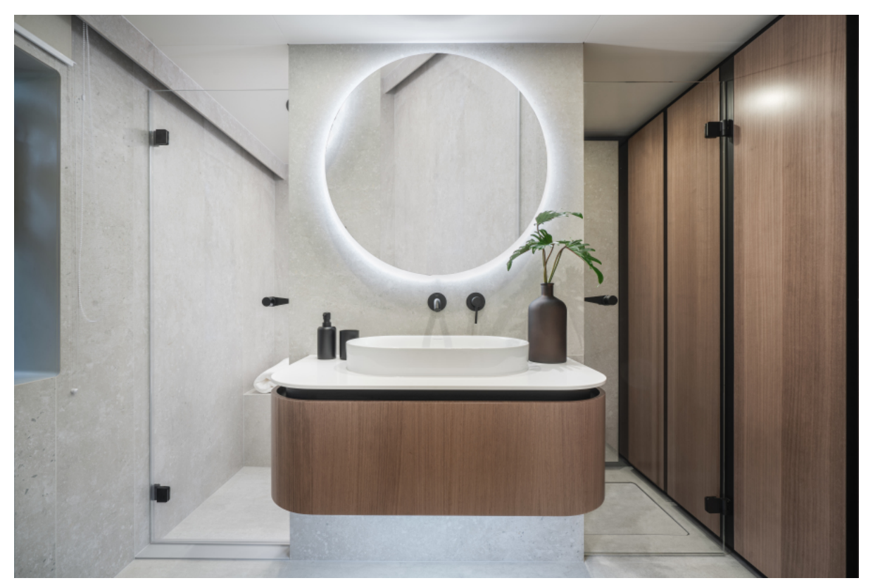
80 Sunreef Power Kokomo (20)