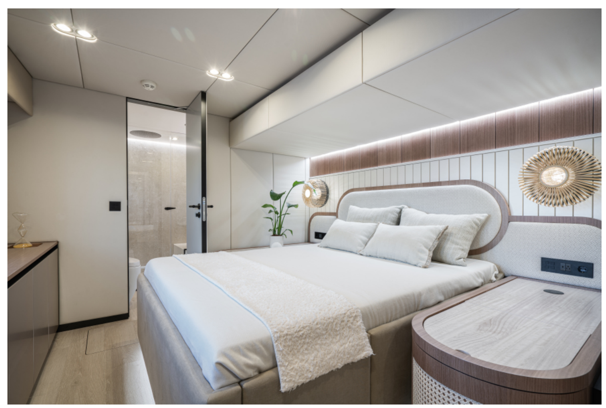
80 Sunreef Power Kokomo (7)