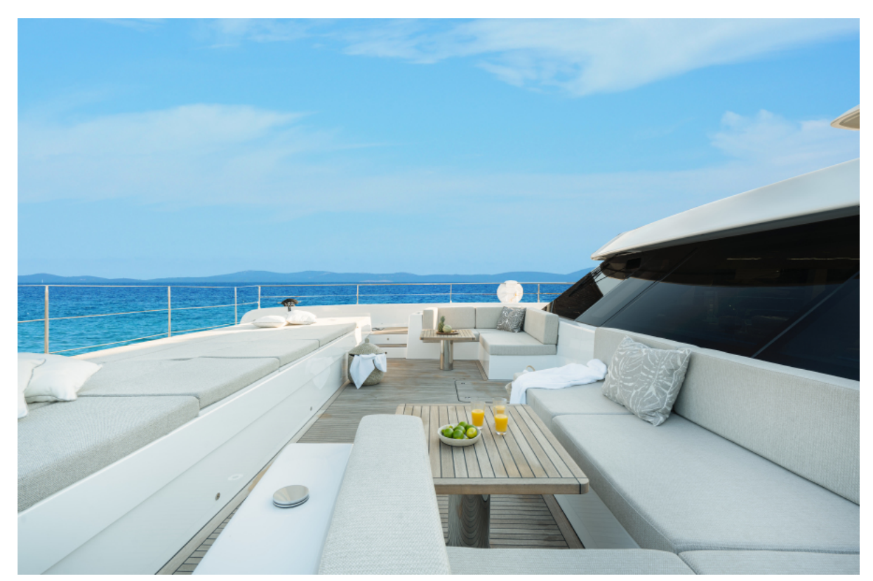
80 Sunreef Power Kokomo (18)