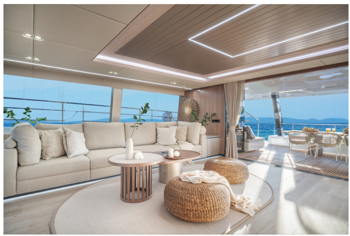
80 Sunreef Power Kokomo (10)