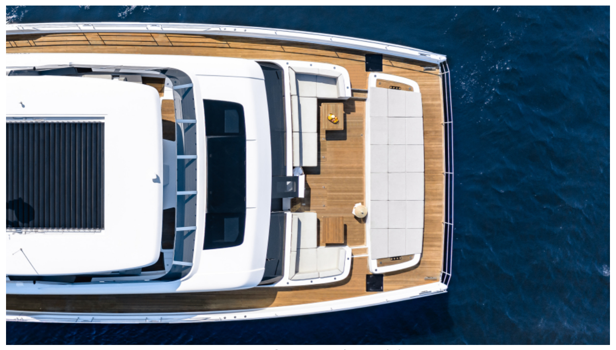
80 Sunreef Power Kokomo (1)