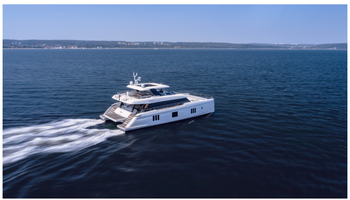
80 Sunreef Power Kokomo (4)