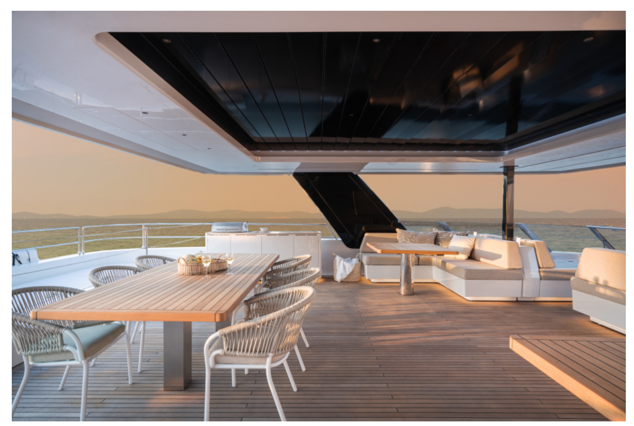
80 Sunreef Power Kokomo (16)