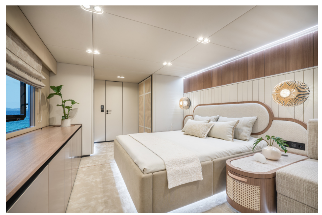
80 Sunreef Power Kokomo (22)