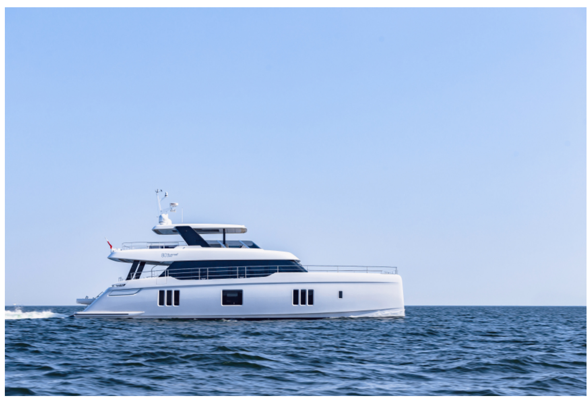
80 Sunreef Power Kokomo (5)