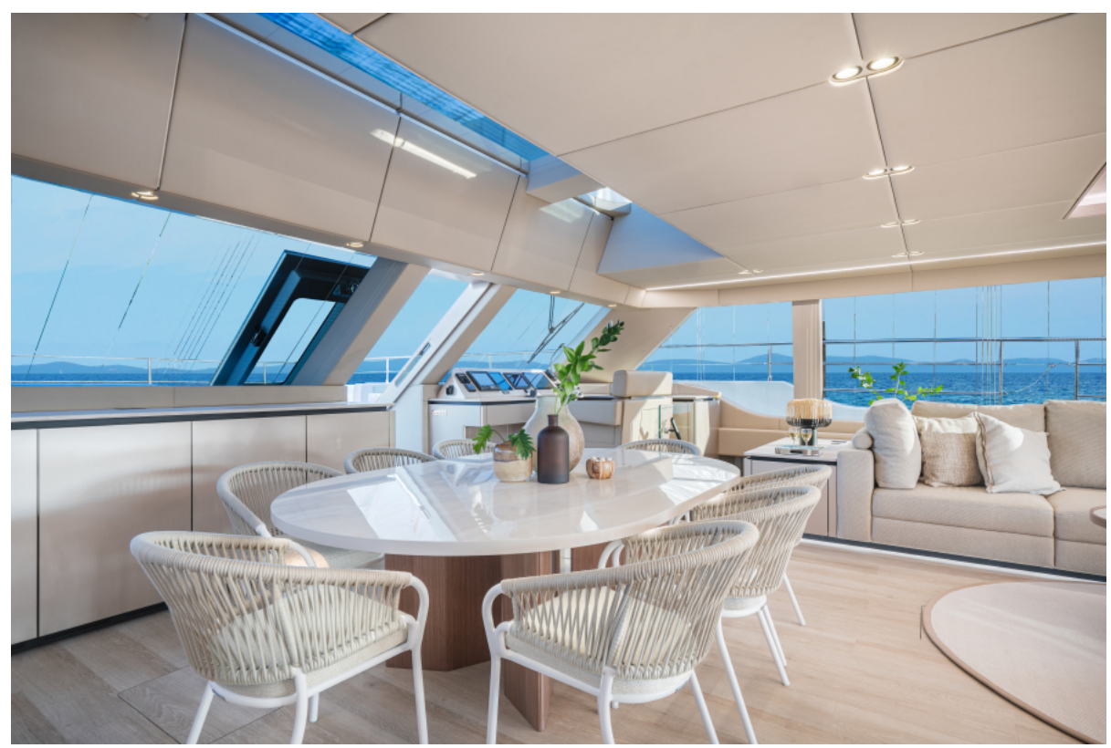
80 Sunreef Power Kokomo (12)