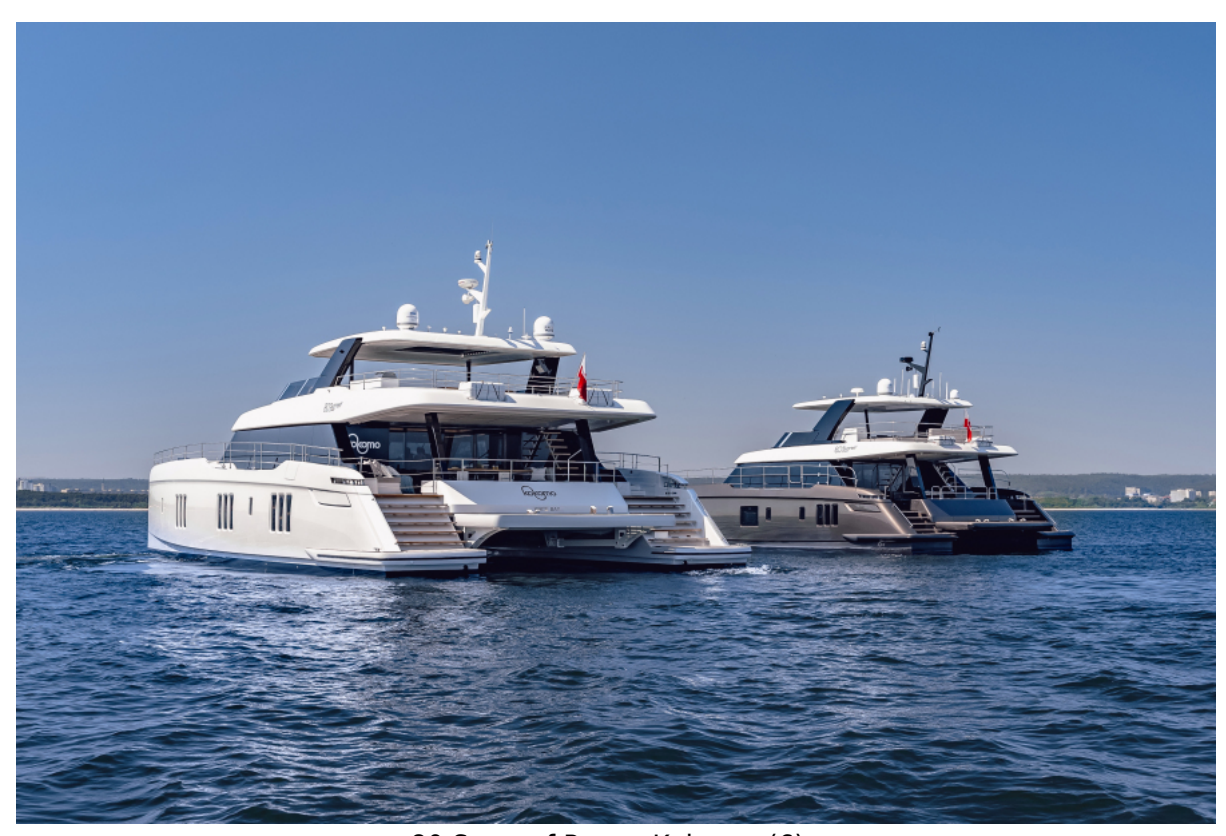
80 Sunreef Power Kokomo (6)