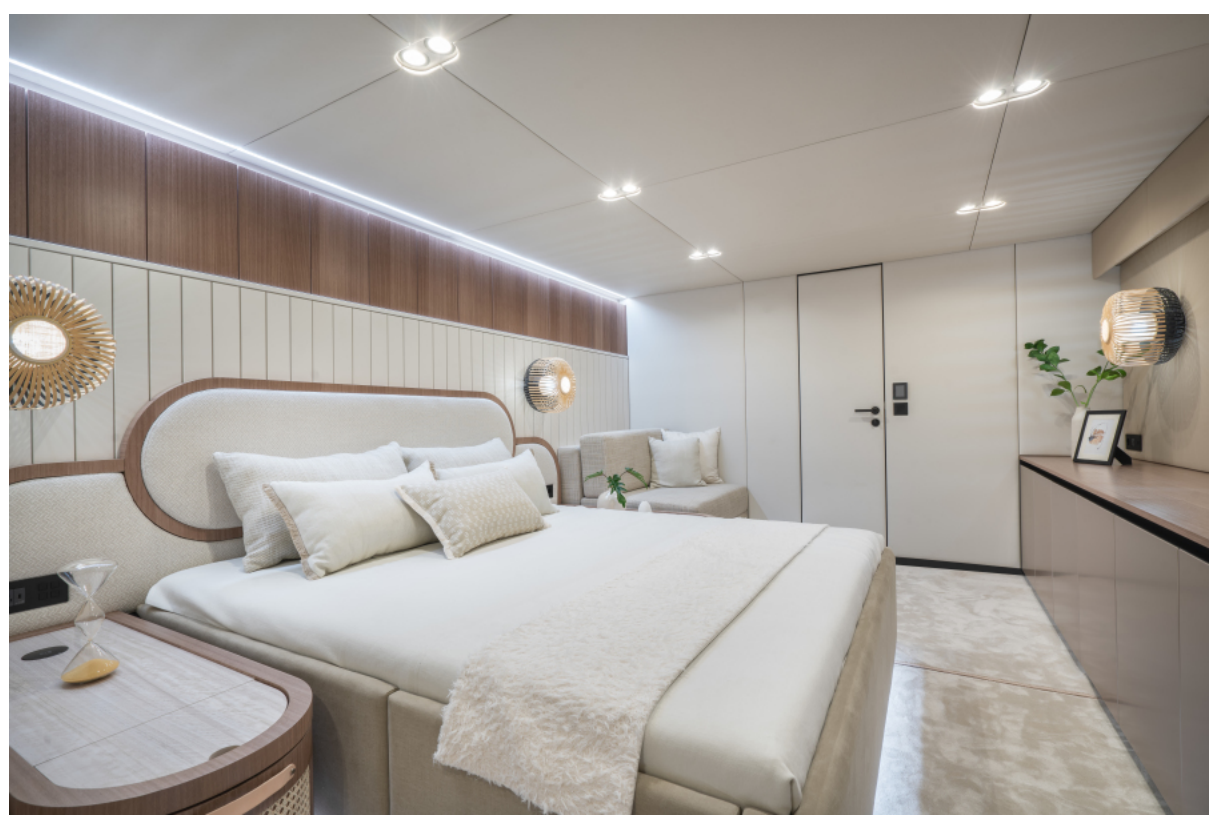
80 Sunreef Power Kokomo (19)