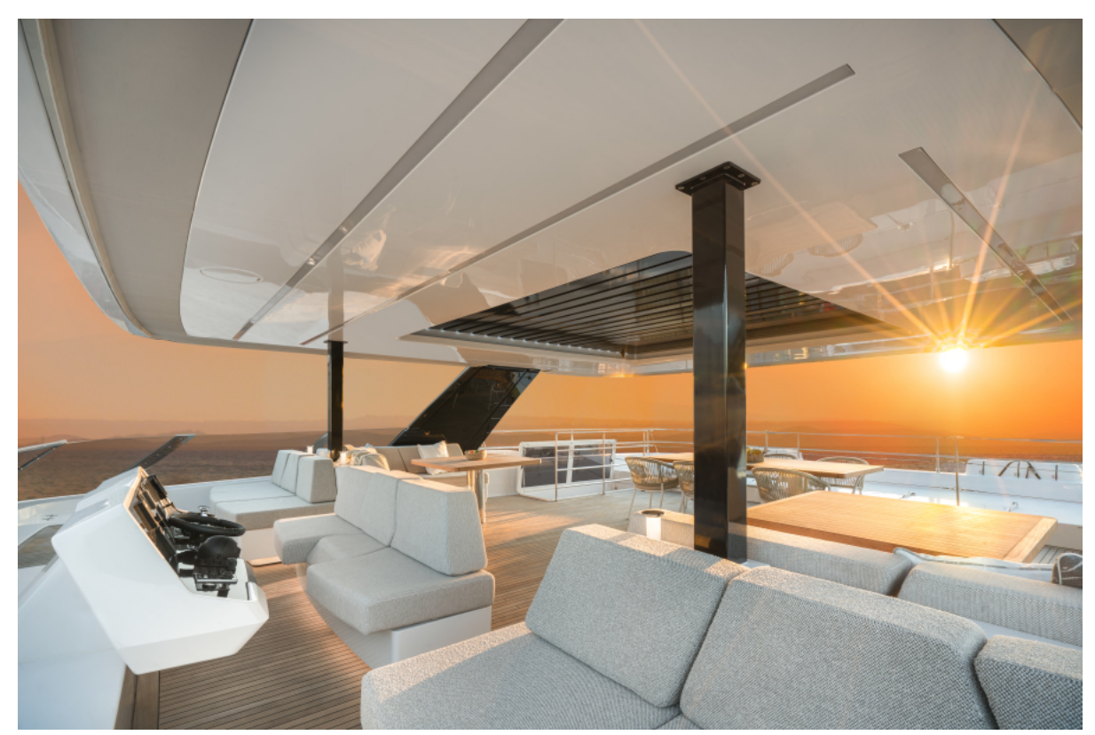
80 Sunreef Power Kokomo (17)