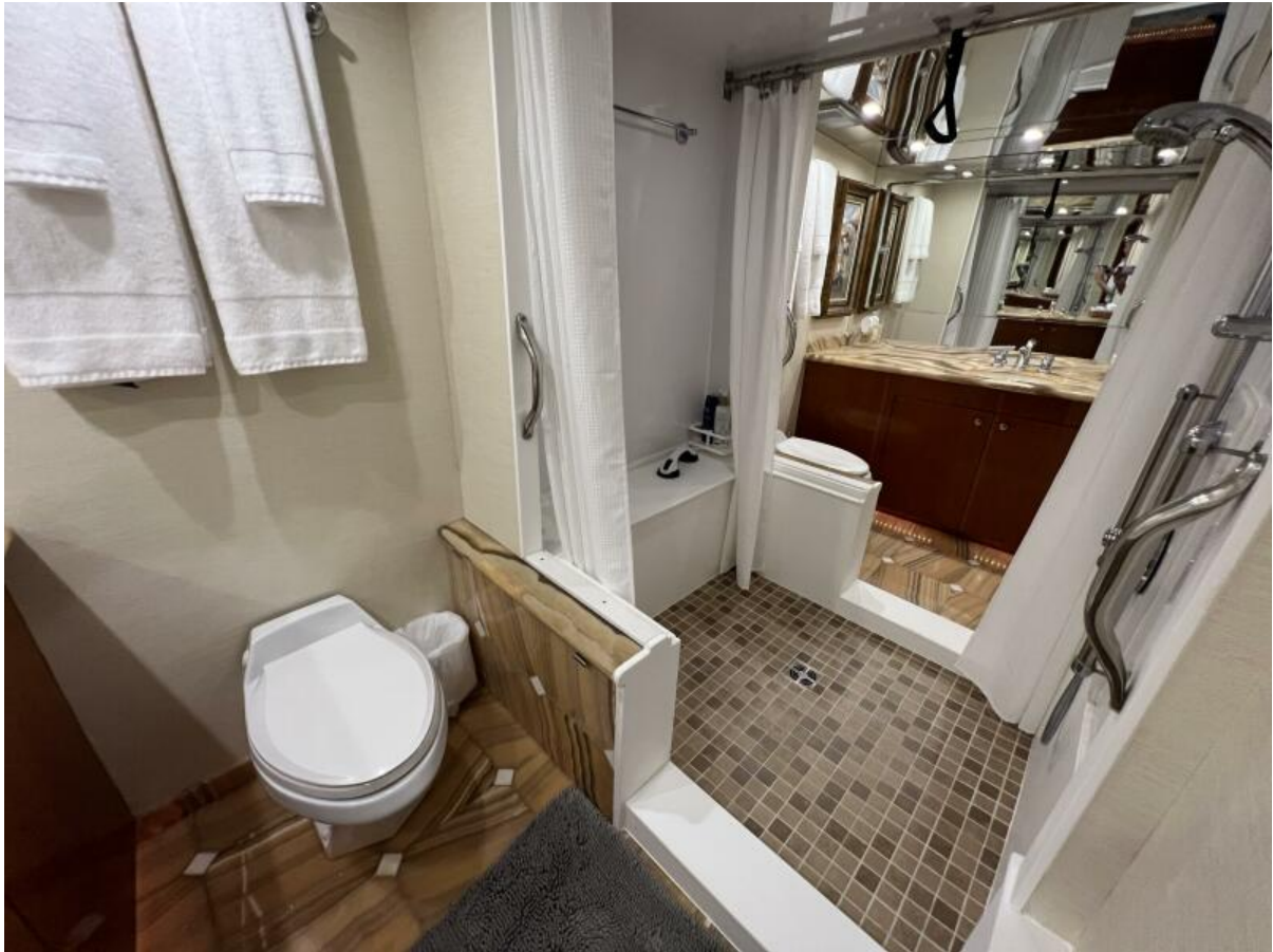
49. Master Head