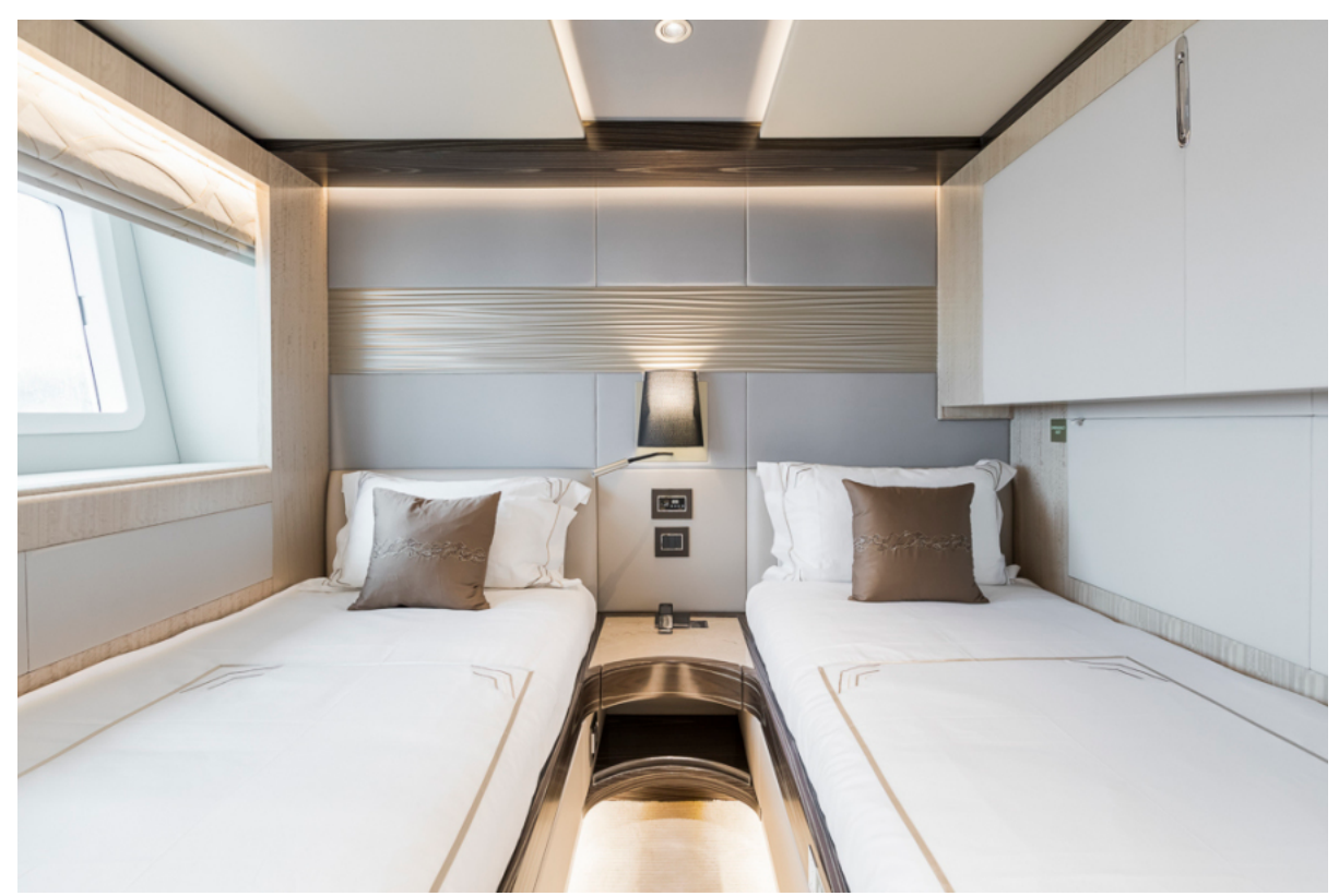
Twin Guest Stateroom