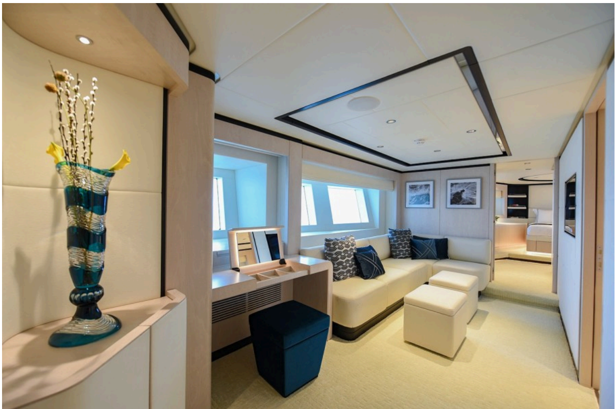
Lower Deck Foyer