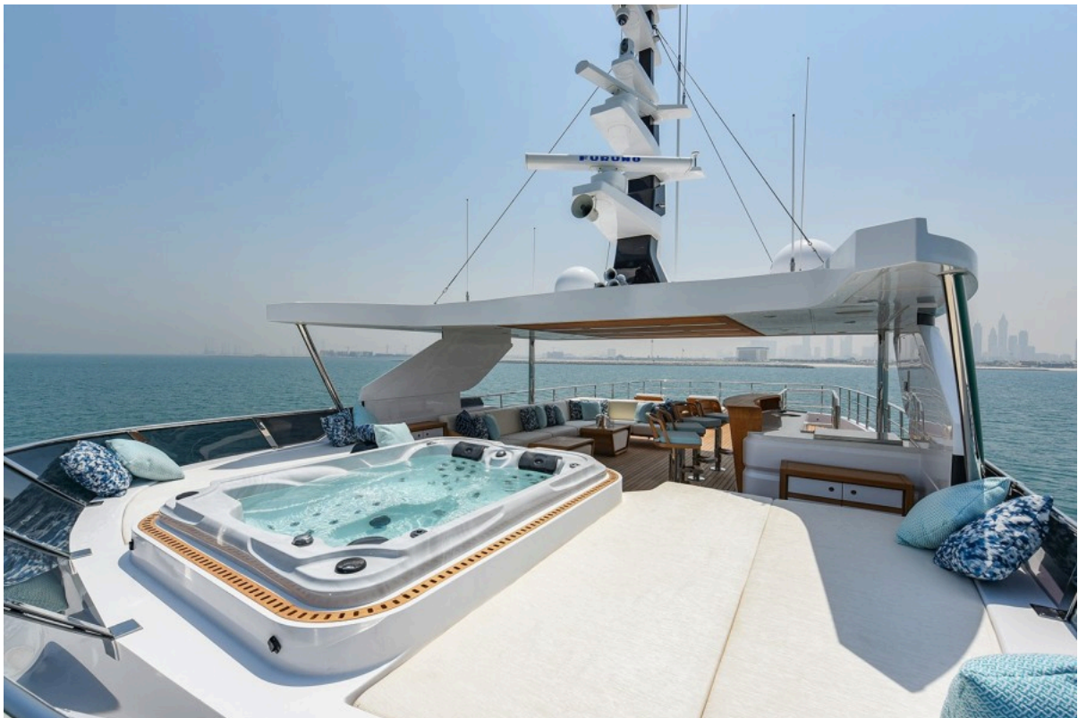
Flybridge - Jacuzzi