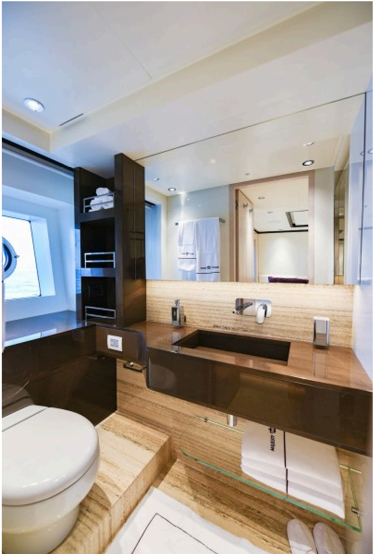
Twin Guest Head