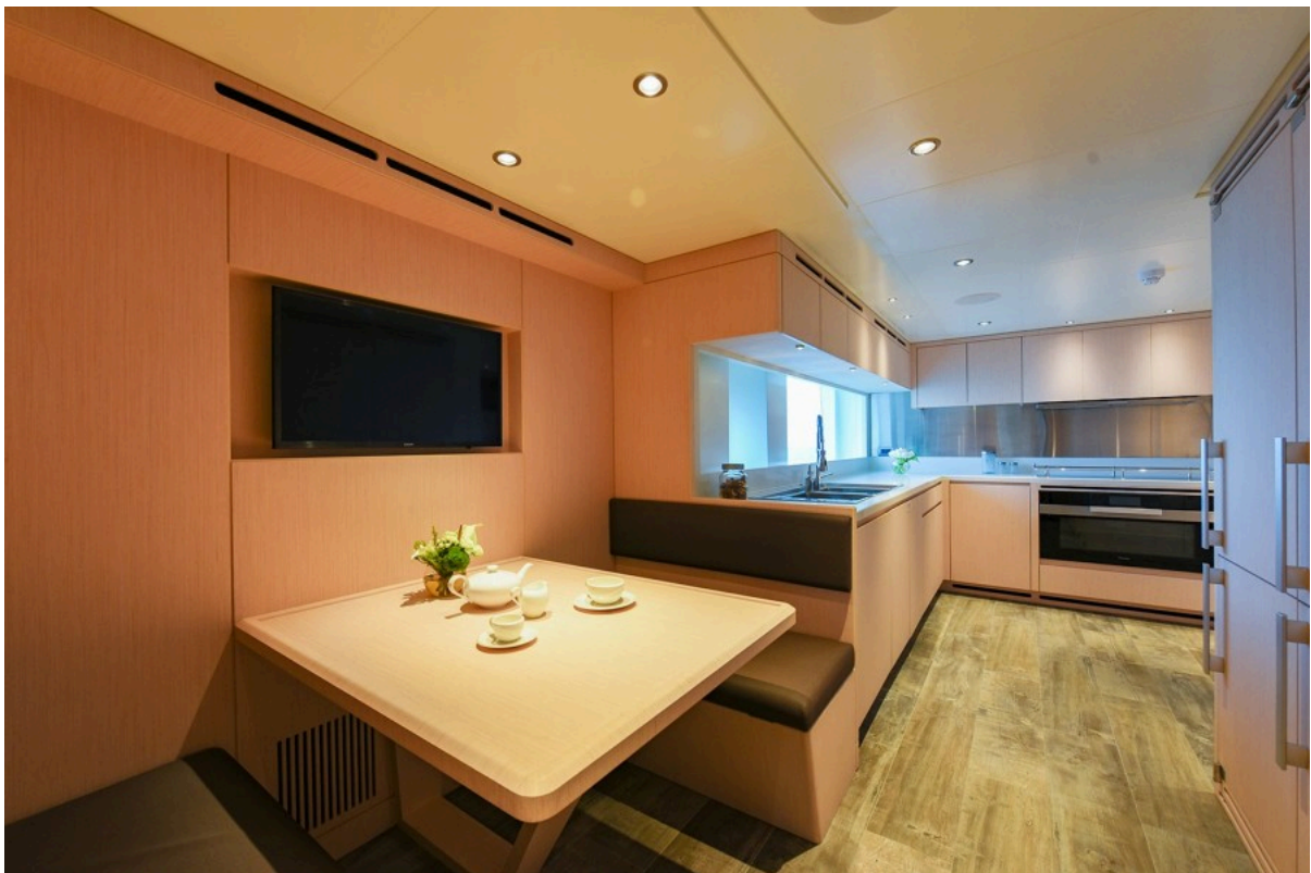
Galley / Settee