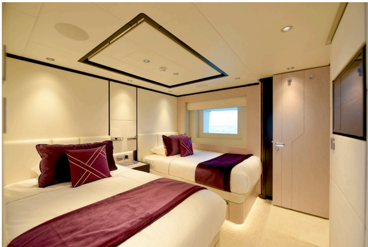
Twin Guest Stateroom