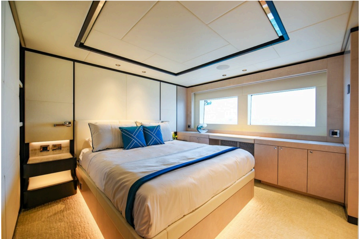
Double Guest Stateroom