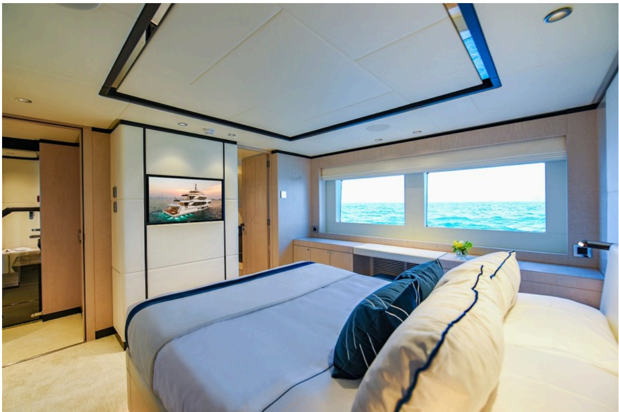
Double Guest Stateroom