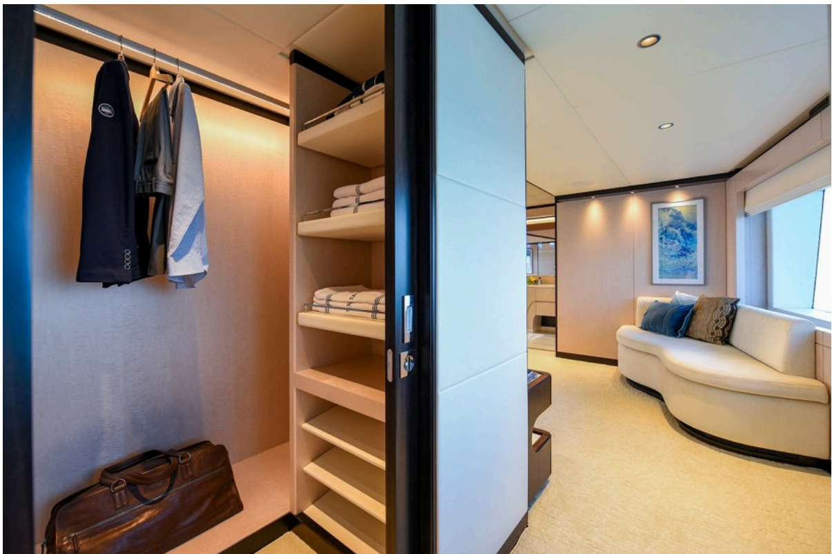
Master Stateroom - Walk In Closet