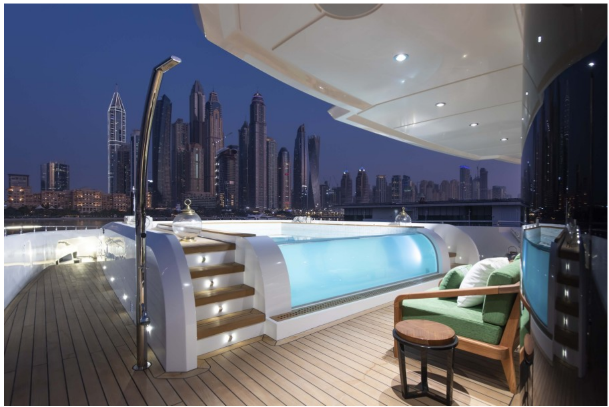
Infinity Pool - Forward