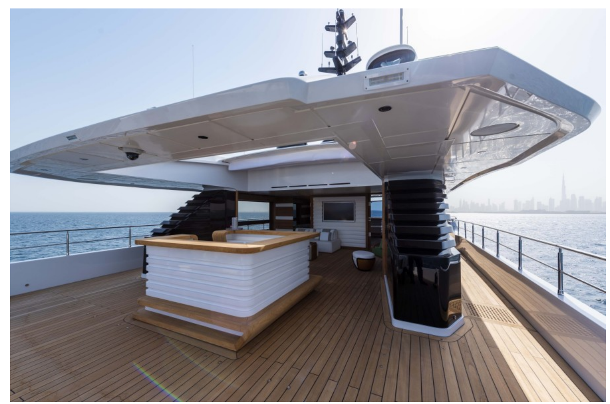
Skylounge - Aft Deck