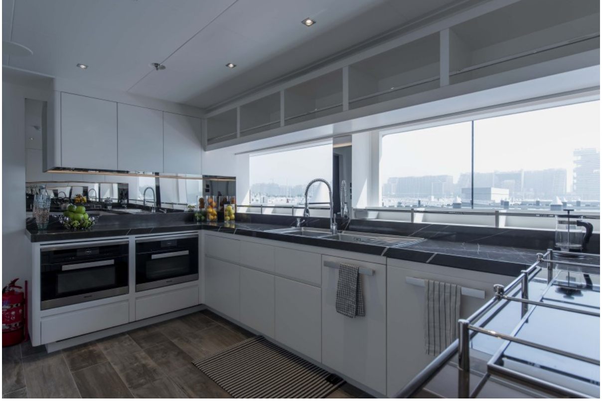
Galley - Main Deck