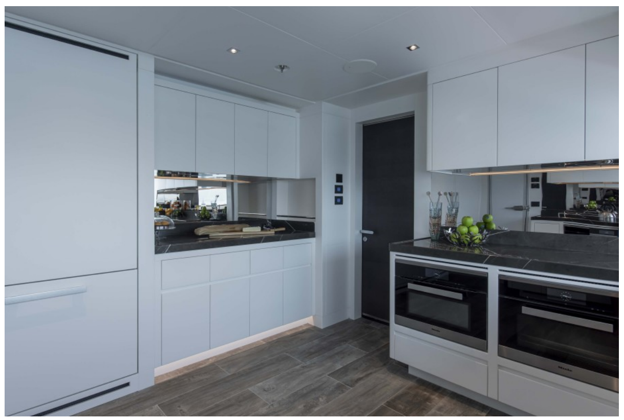
Galley - Main Deck