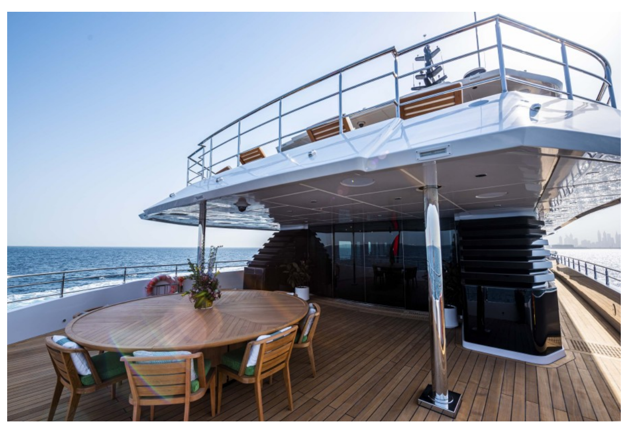
Owner's Aft Deck