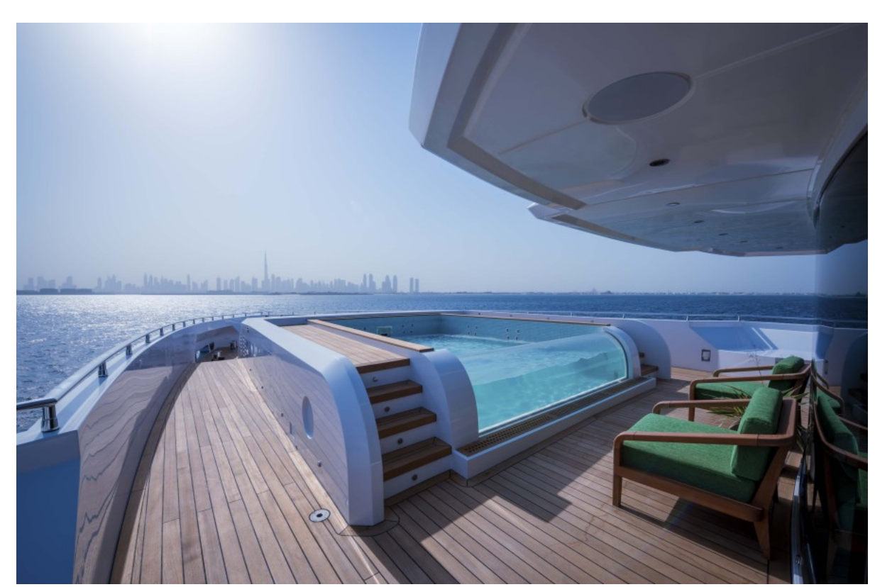
Infinity Pool - Forward