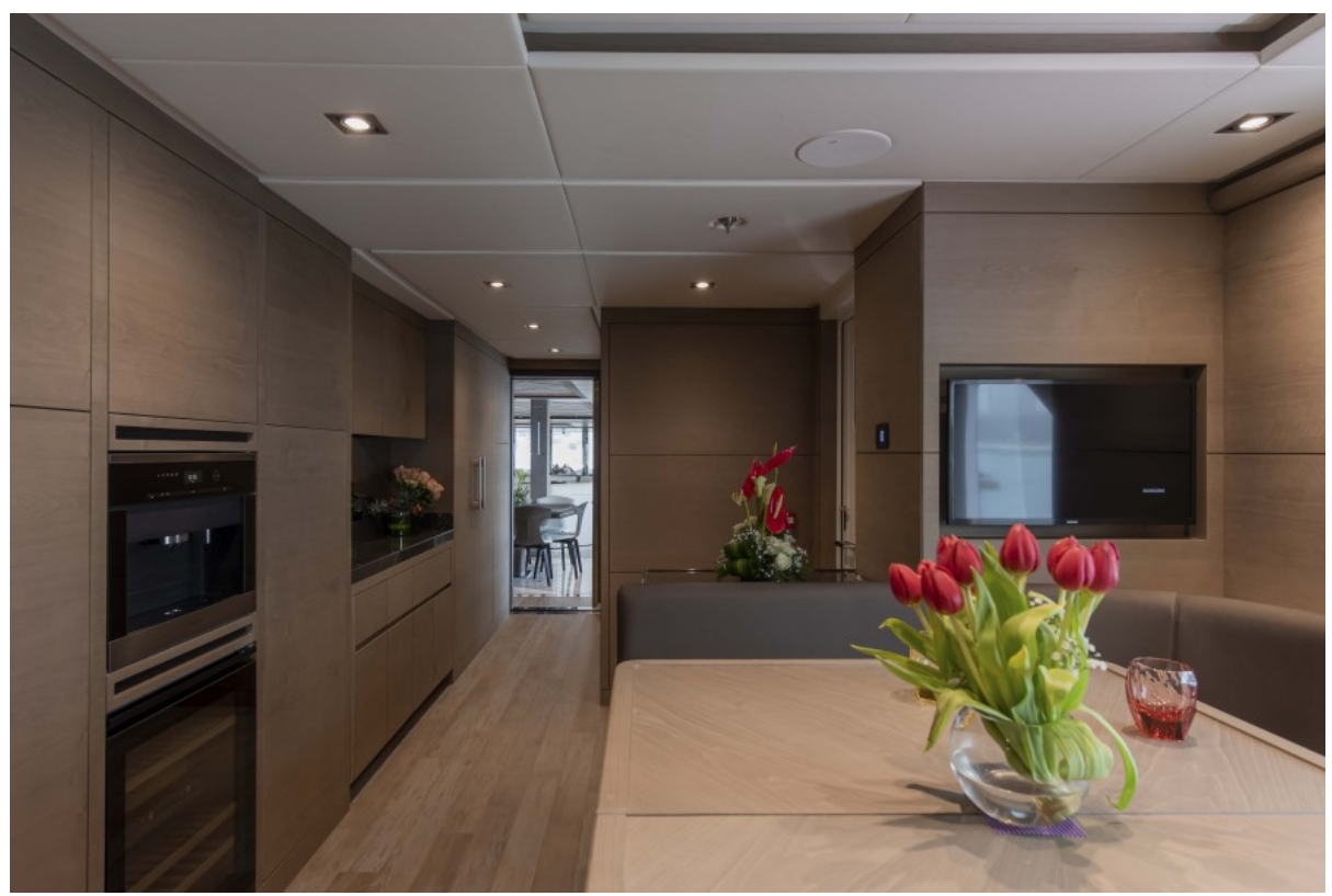
Pantry / Galley