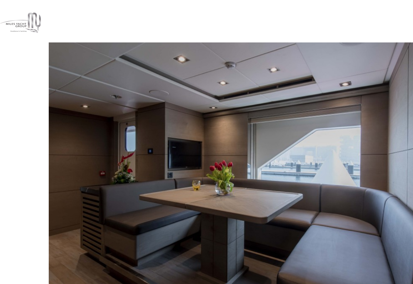
Galle / Settee