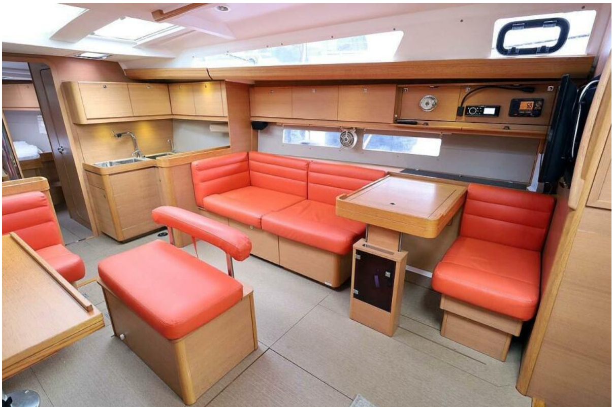
Stbd Salon Galley Fwd