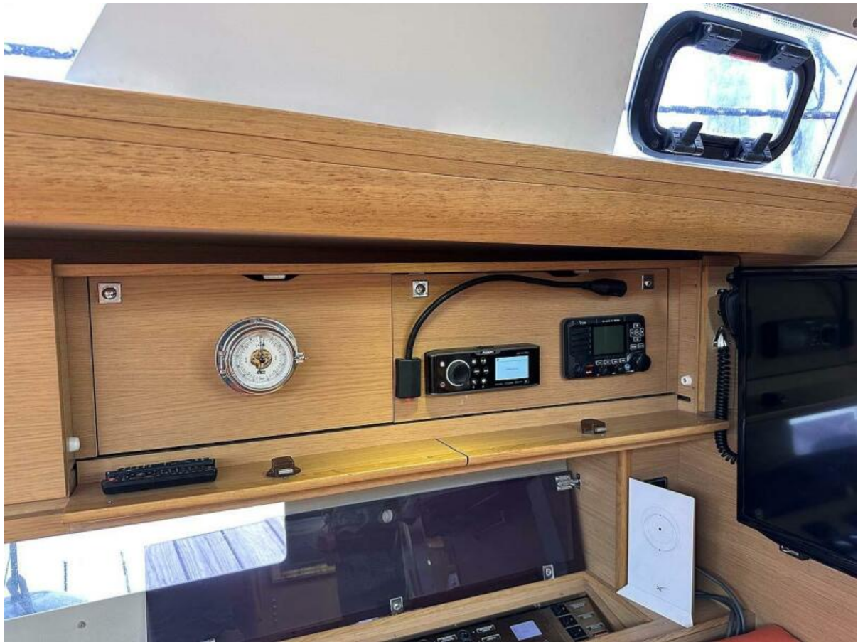
Nav Station Detail