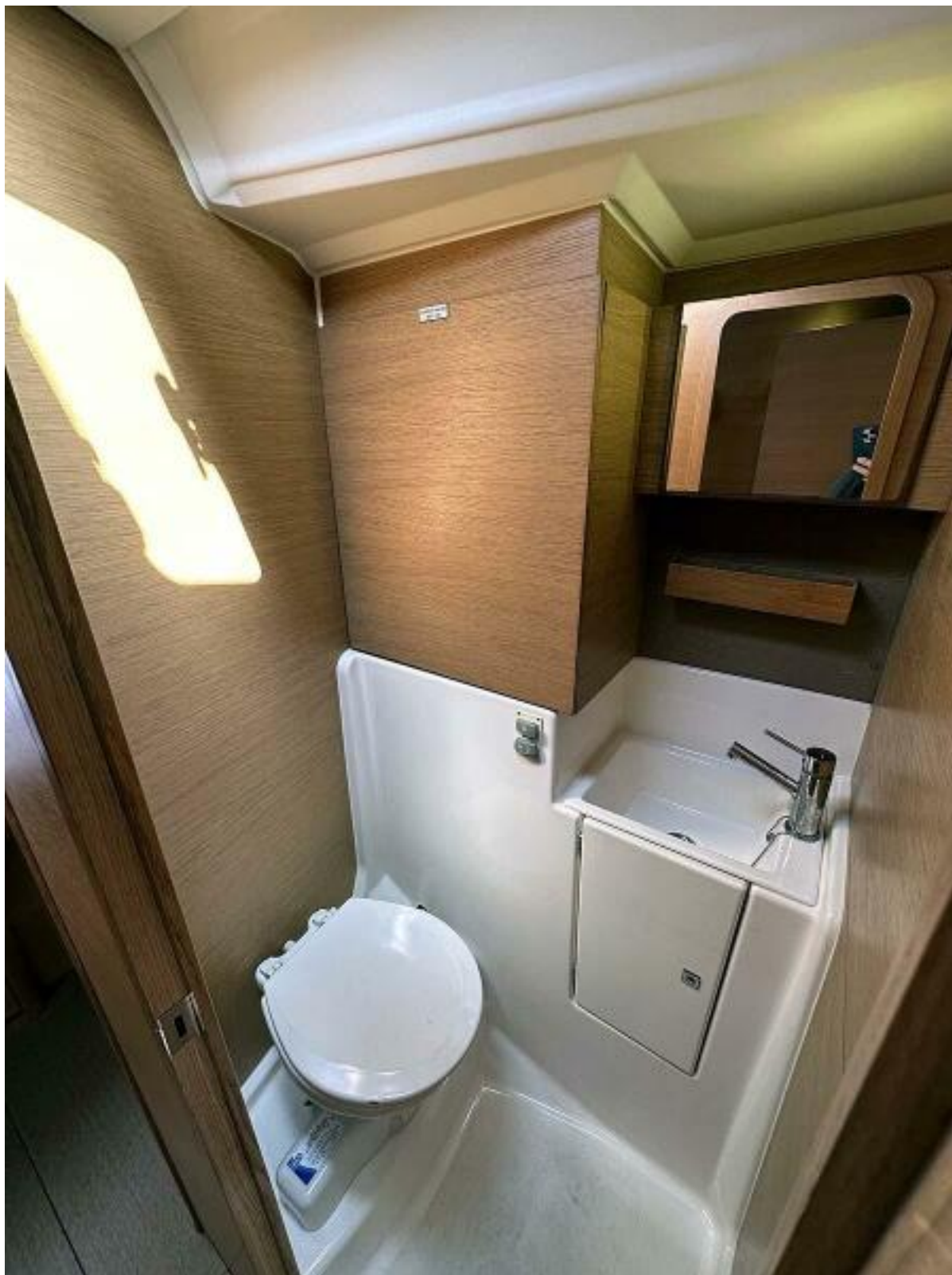
Fwd Head to Stbd