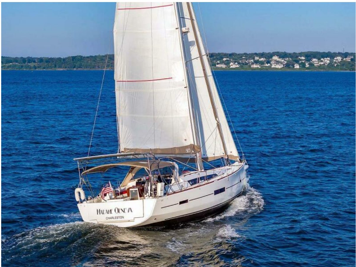
Stbd Quarter from Above