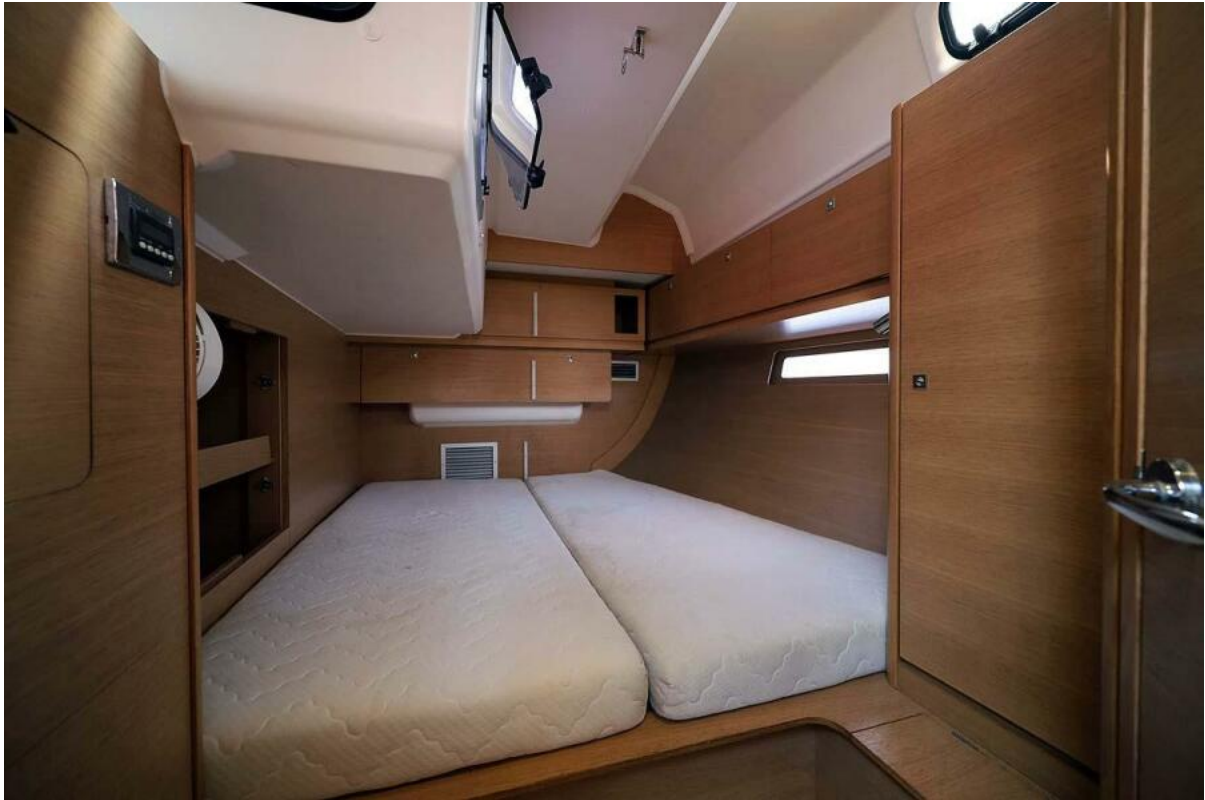
Port Cabin Double Berth