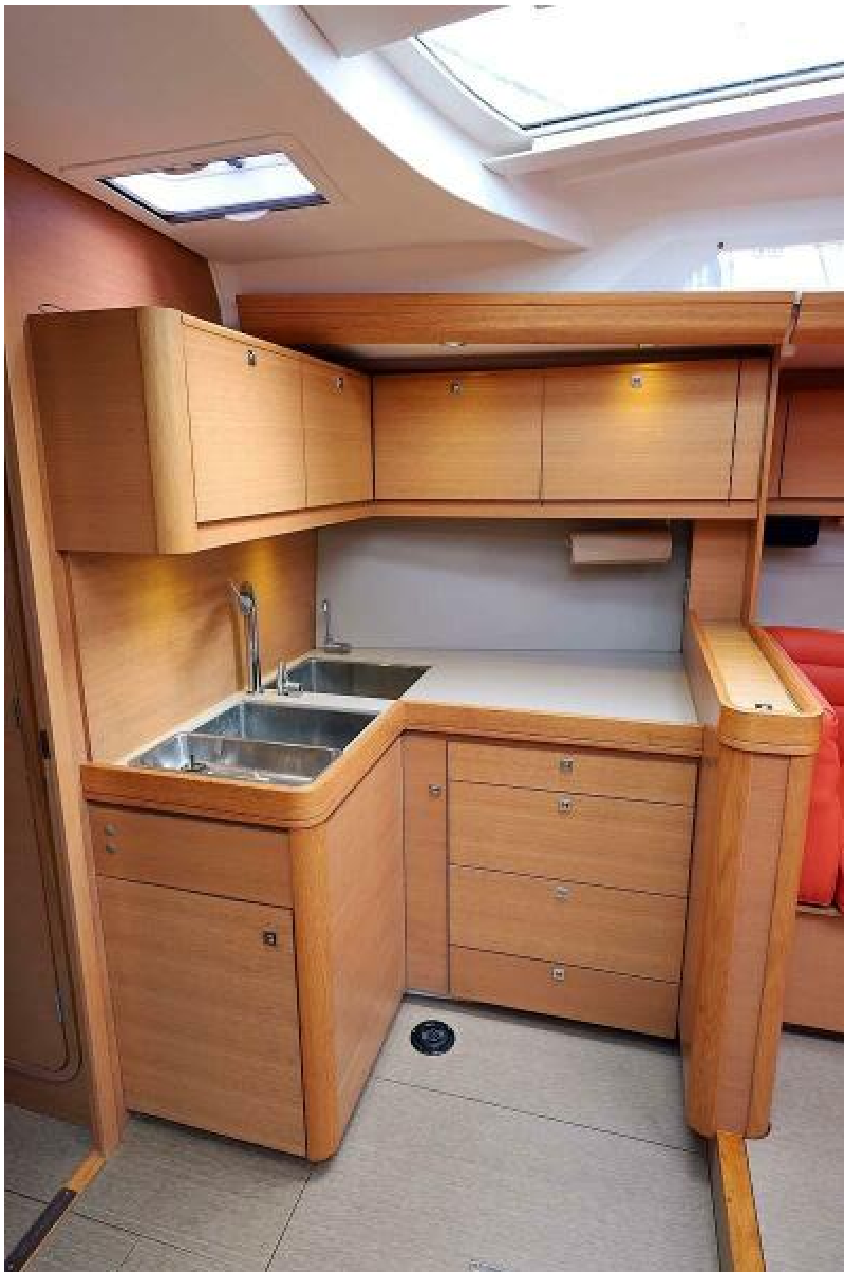
Galley to Stbd