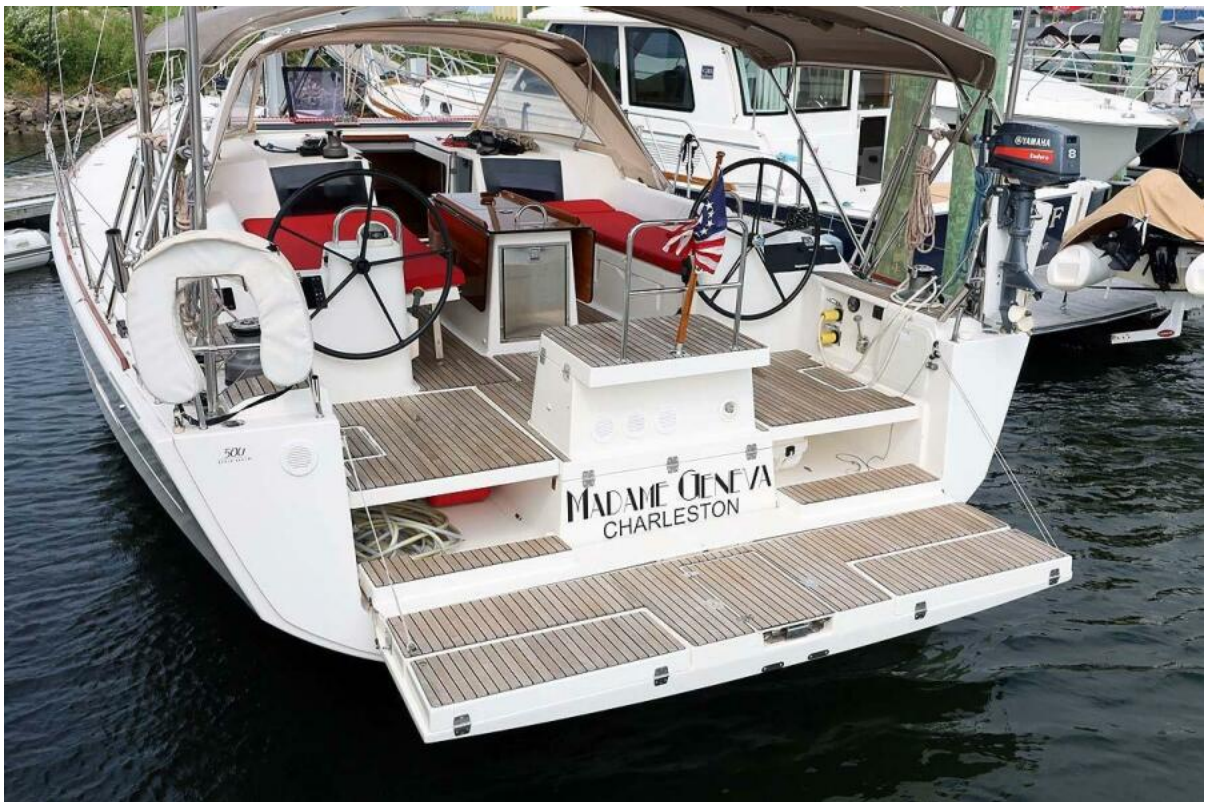
Folding Transom and Aft Cockpit