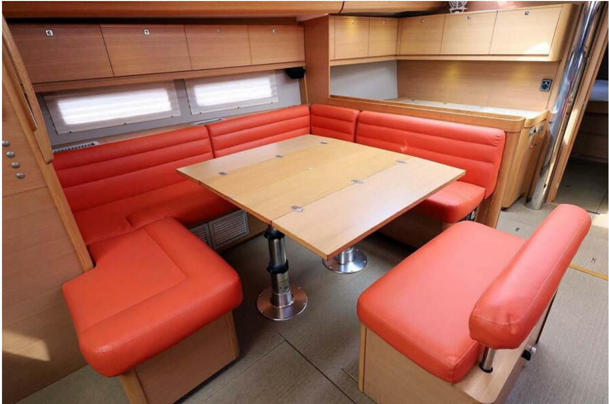
Full Salon Table