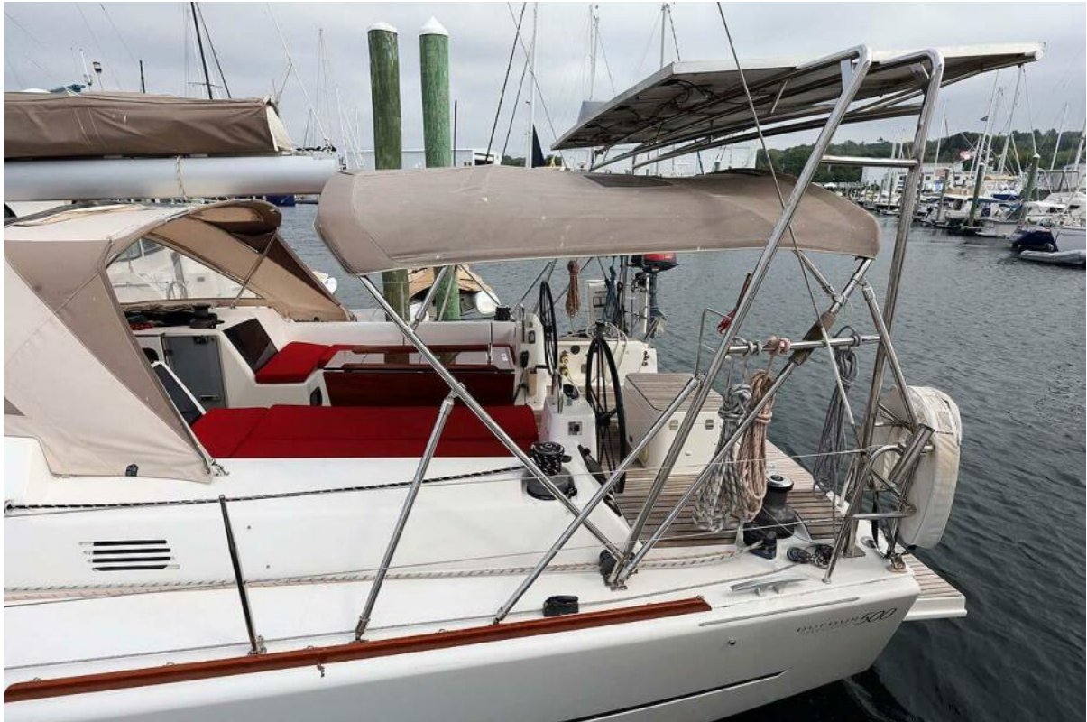
Cockpit Awning Side View