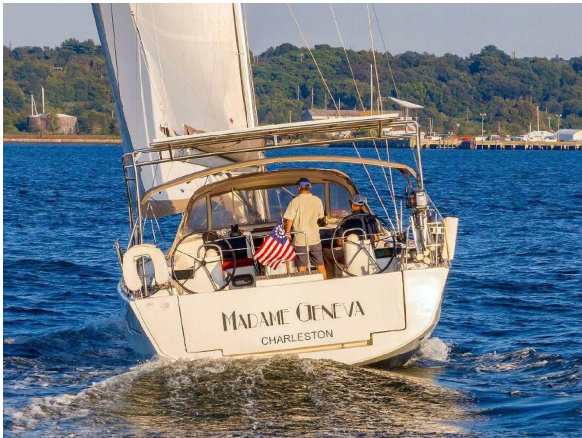
Sailing from Behind