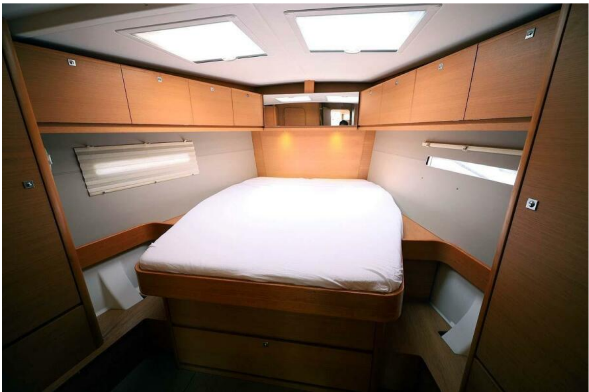
Fwd Cabin and Berth