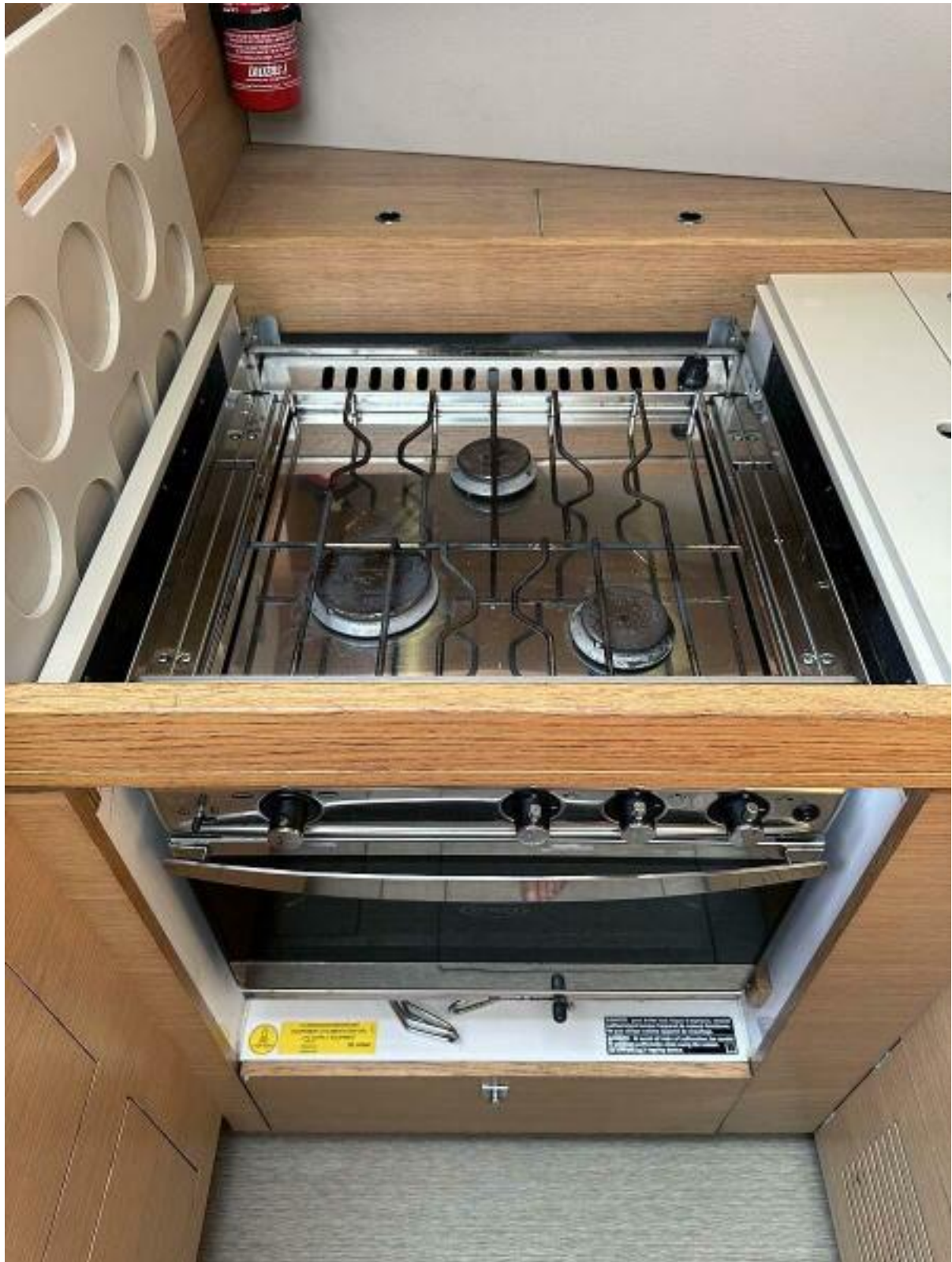
Stove and Oven Detail