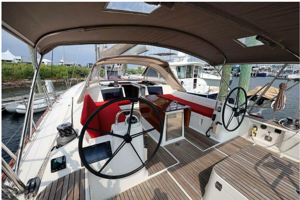
Twin Wheels Looking Fwd