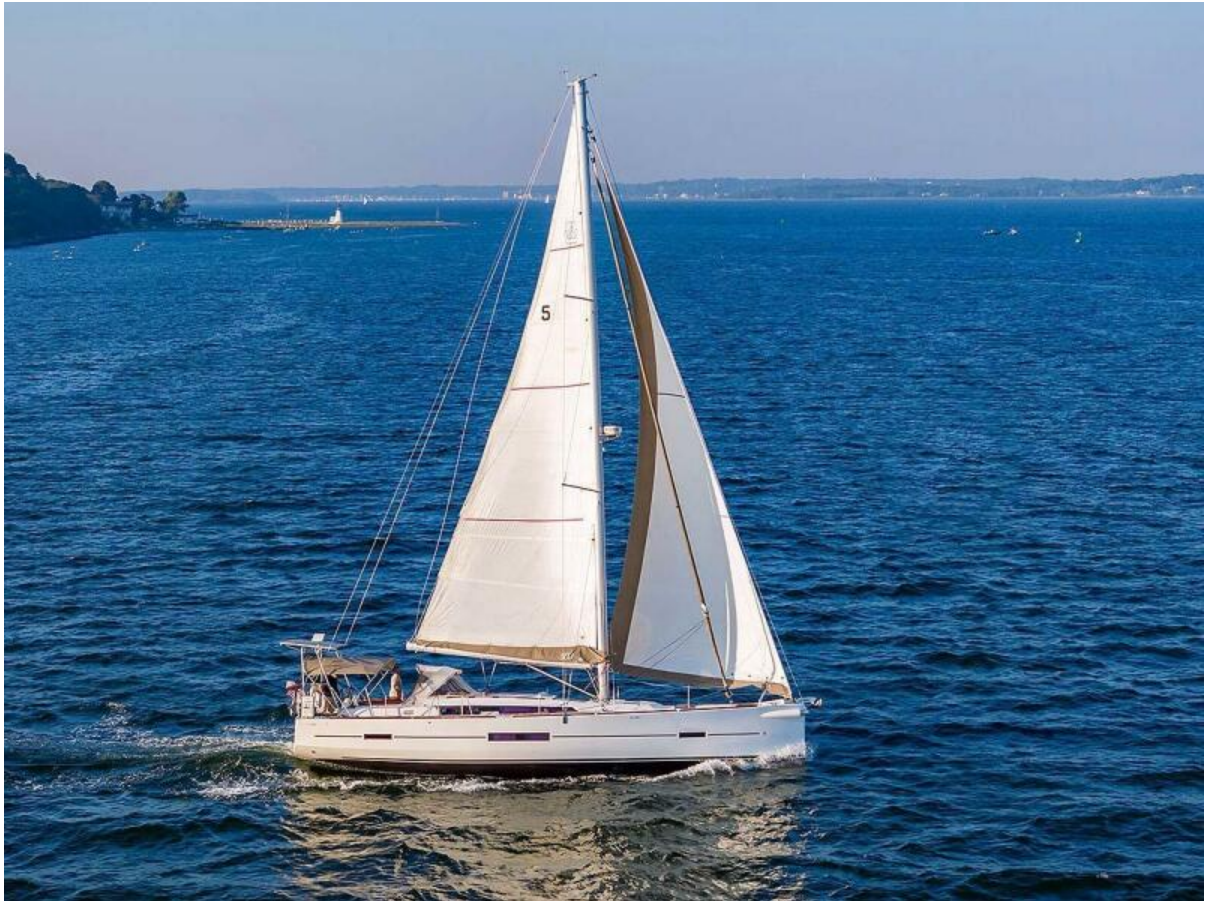
Stbd Beam Aerial View