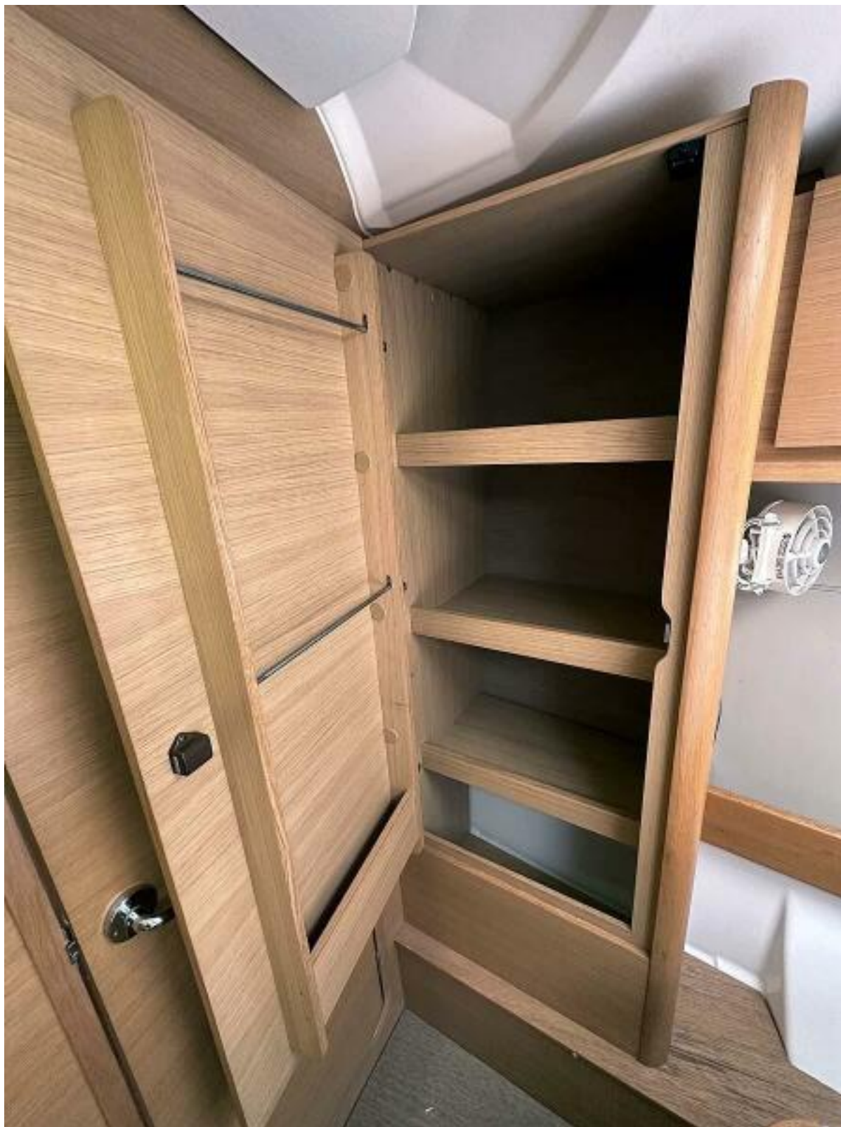
Locker Shelving Fwd Cabin