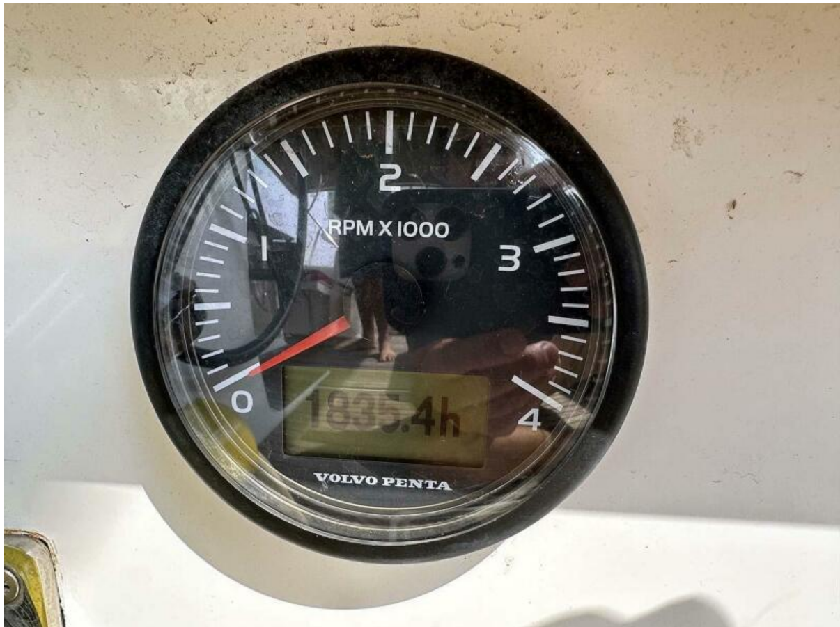
Engine Hours 9-23