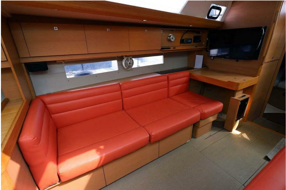
Convertible Nav Station Aft