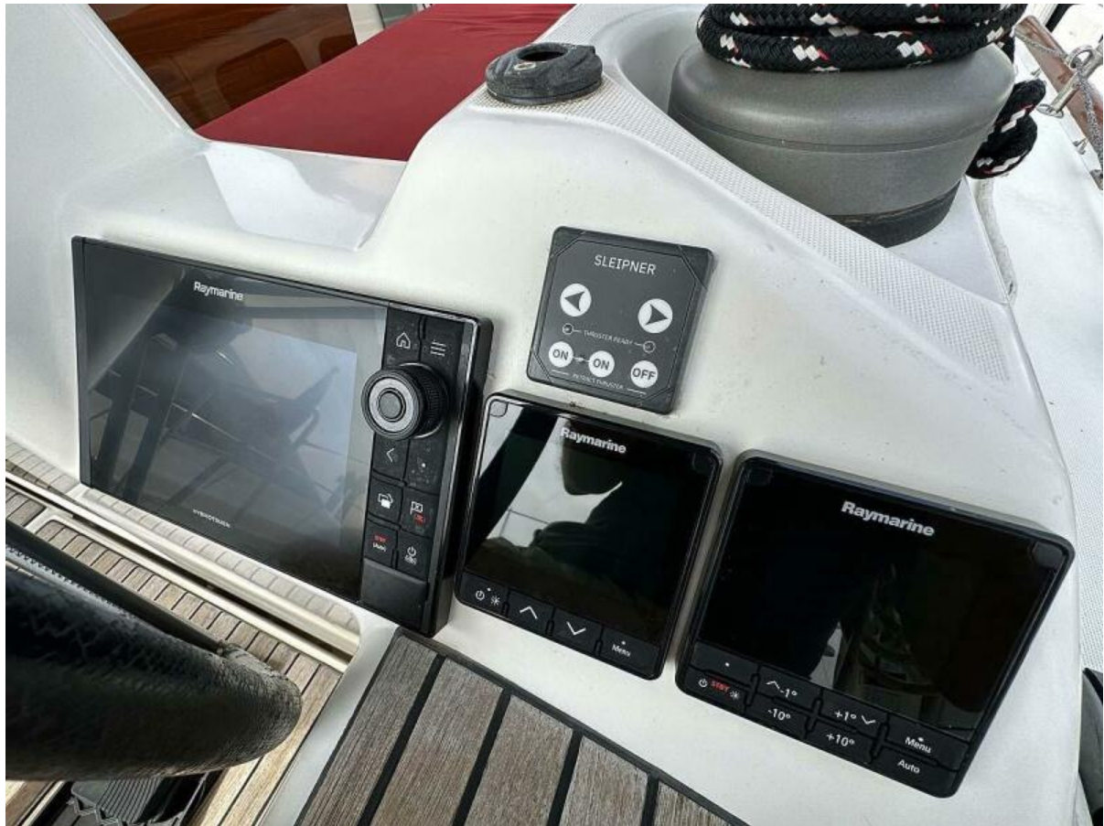
Stbd Helm Electronics