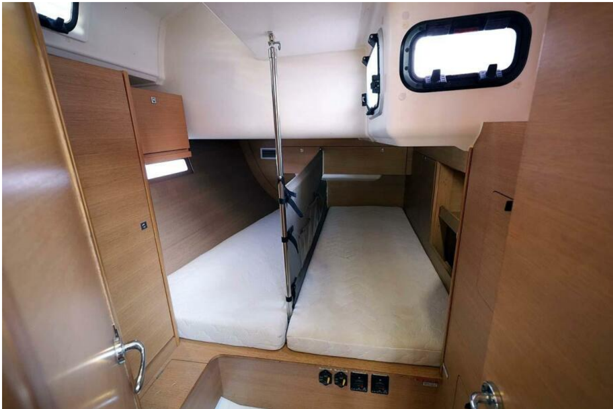
Stbd Cabin Convertible Double