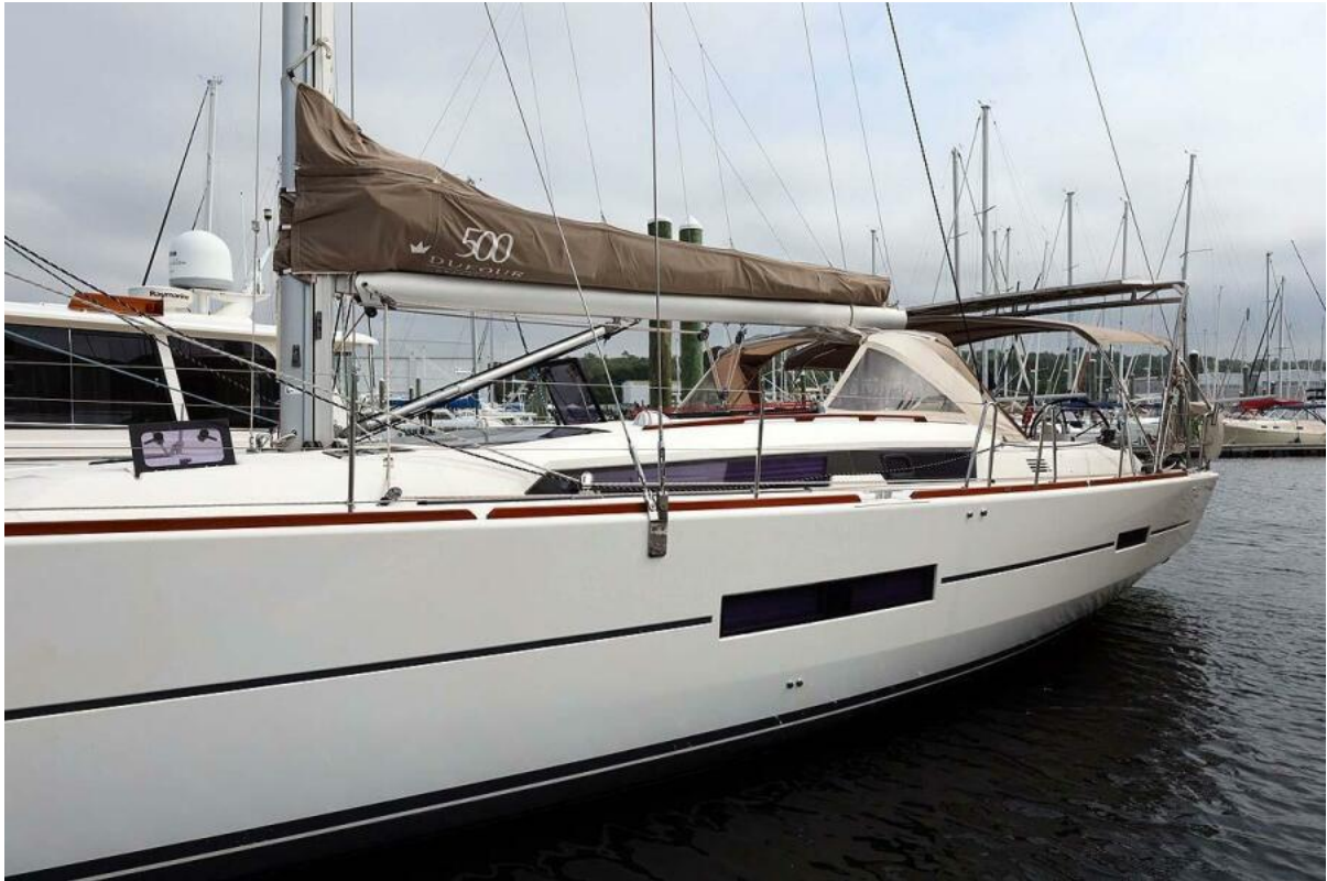
Hull Hard Chine