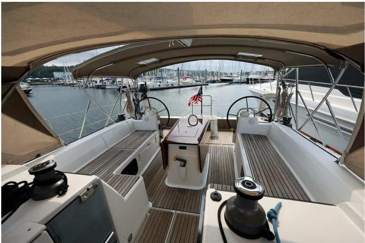
Cockpit from Dodger