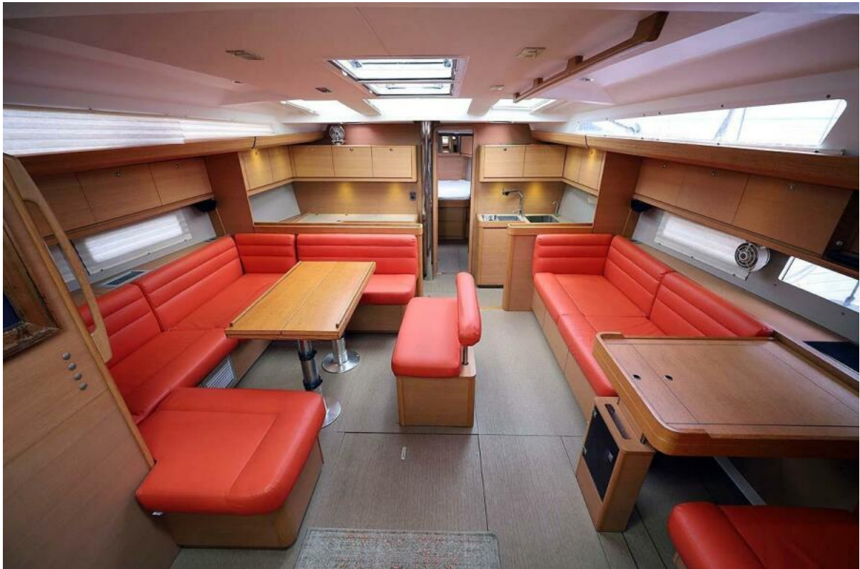
Salon from Companionway