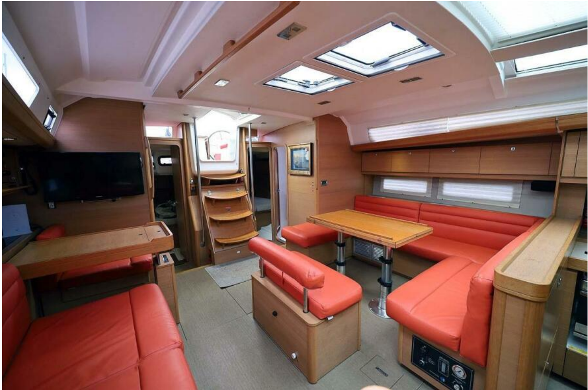
Salon Looking Aft to Port