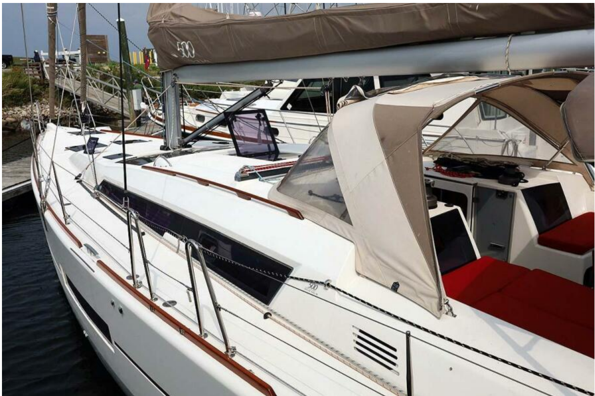
Deck House Profile