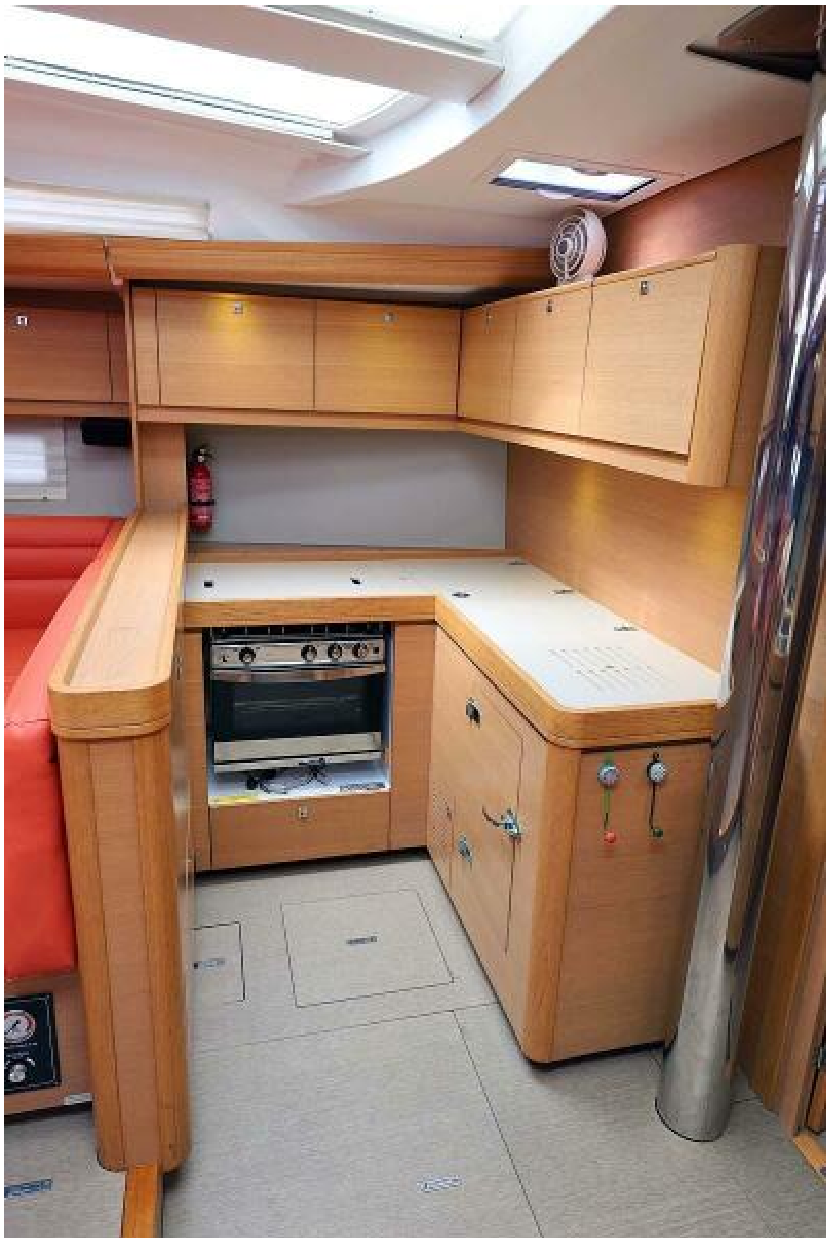
Galley to Port