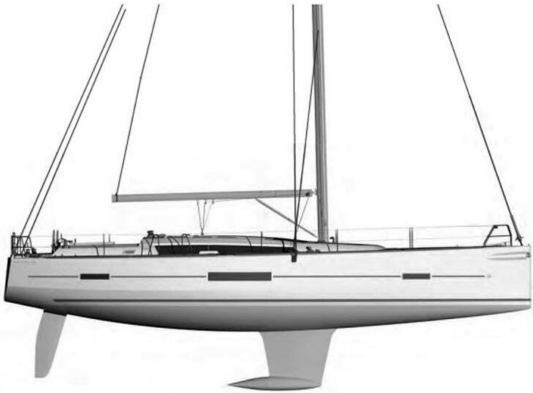
Hull / Keel