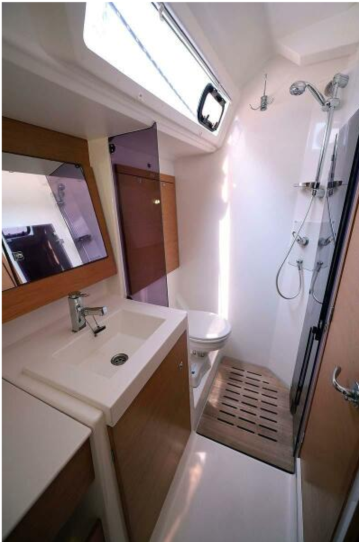
Aft Head and Shower