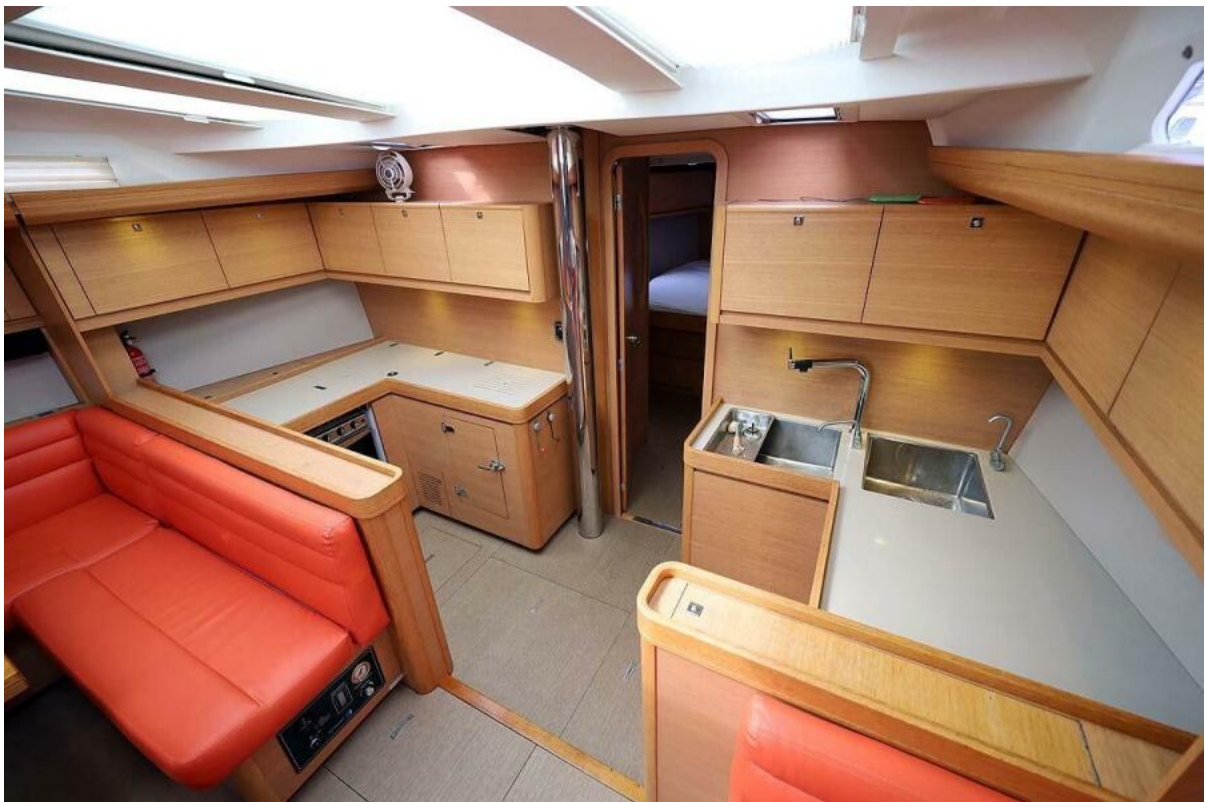
Galley Wide View