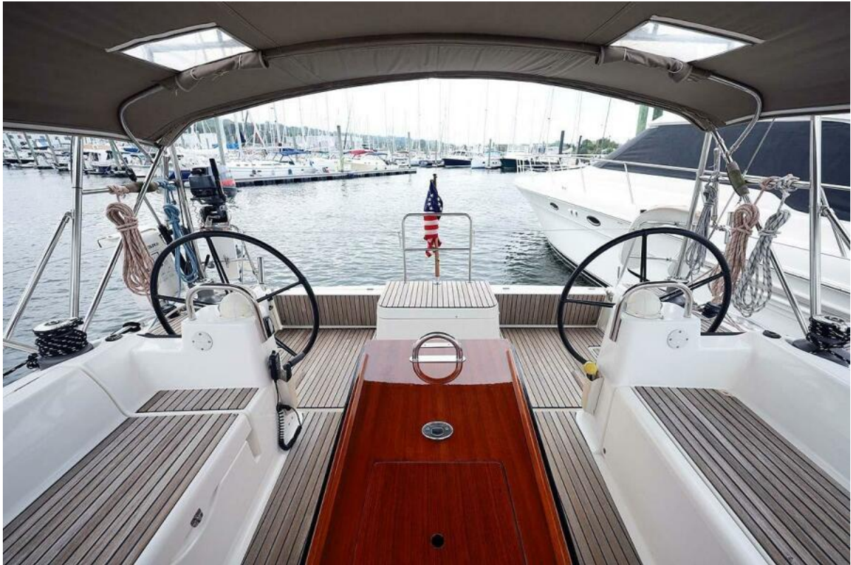
Twin Wheels Looking Aft