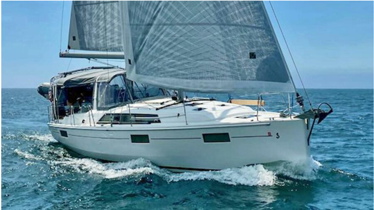
TRUE NORTH 2018 Beneteau Oceanis 41.1