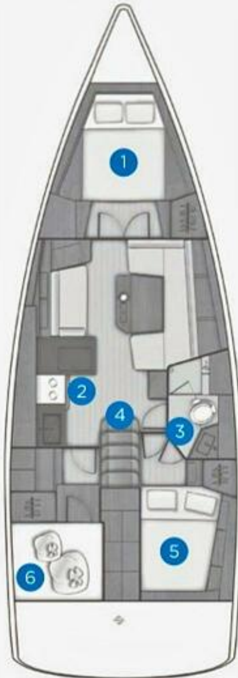
2 CABINS + 1 TOILET