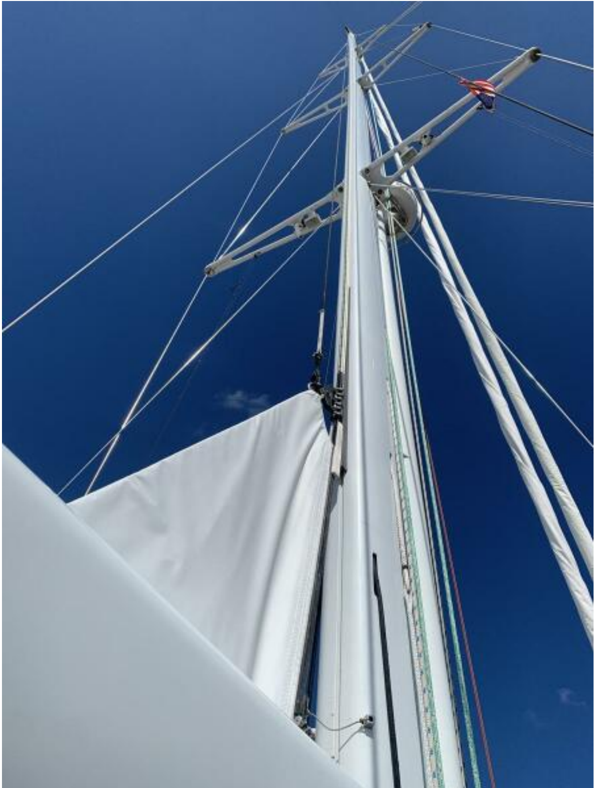
Gooseneck and Mast