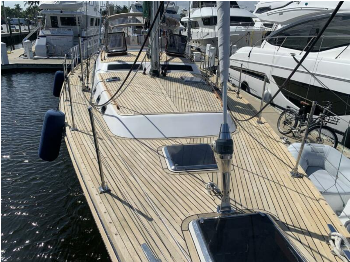
Foredeck Looking Aft