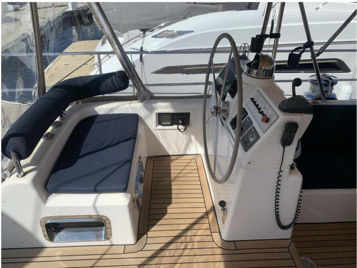
Port Helm Seat