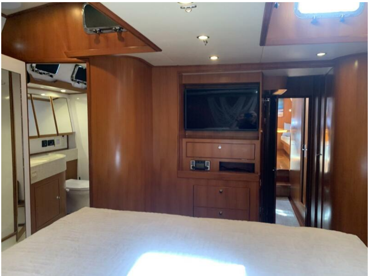
Owner's Cabin Looking Fwd