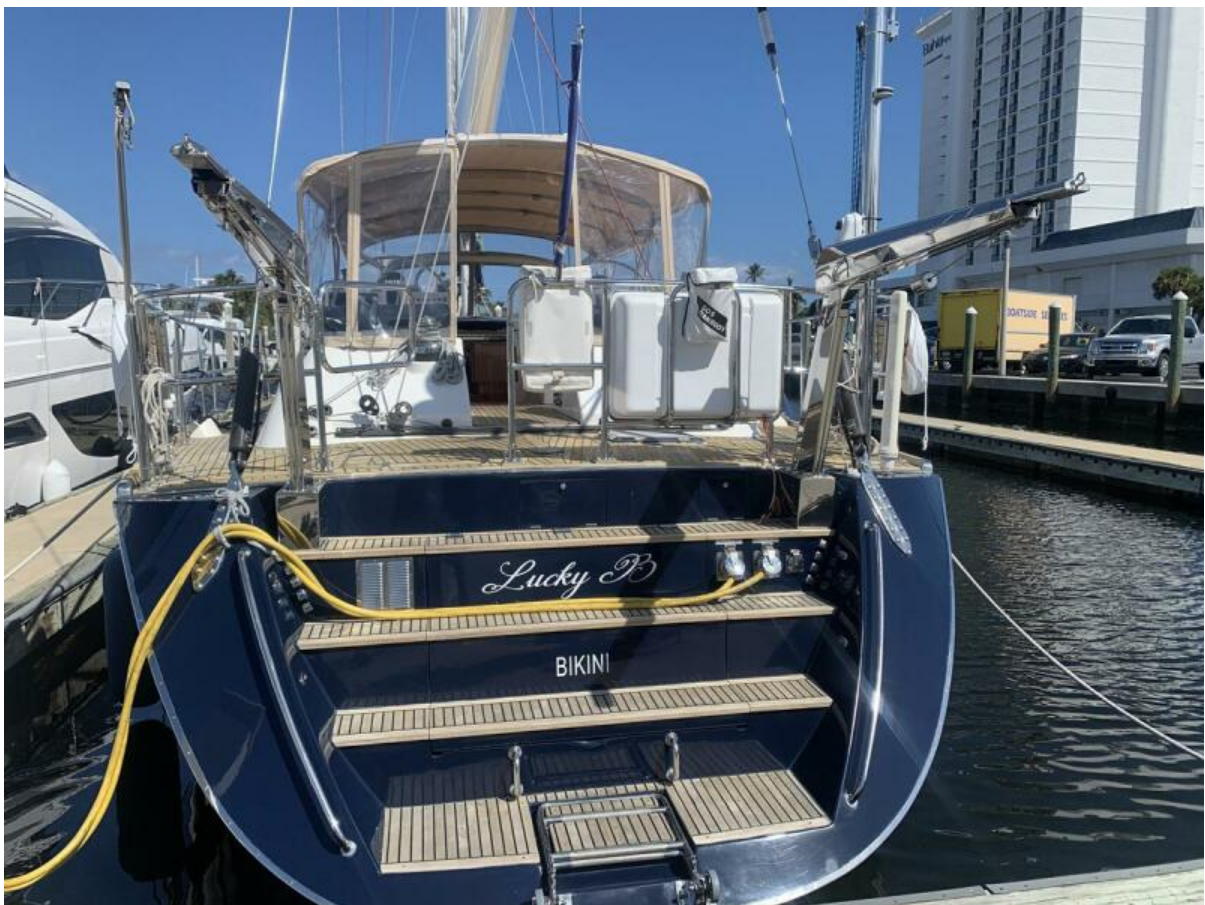
Sugarscoop Transom Stairs