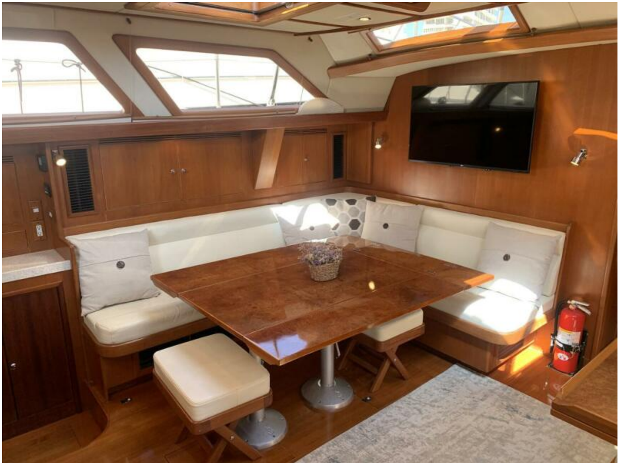
Salon Dining Area