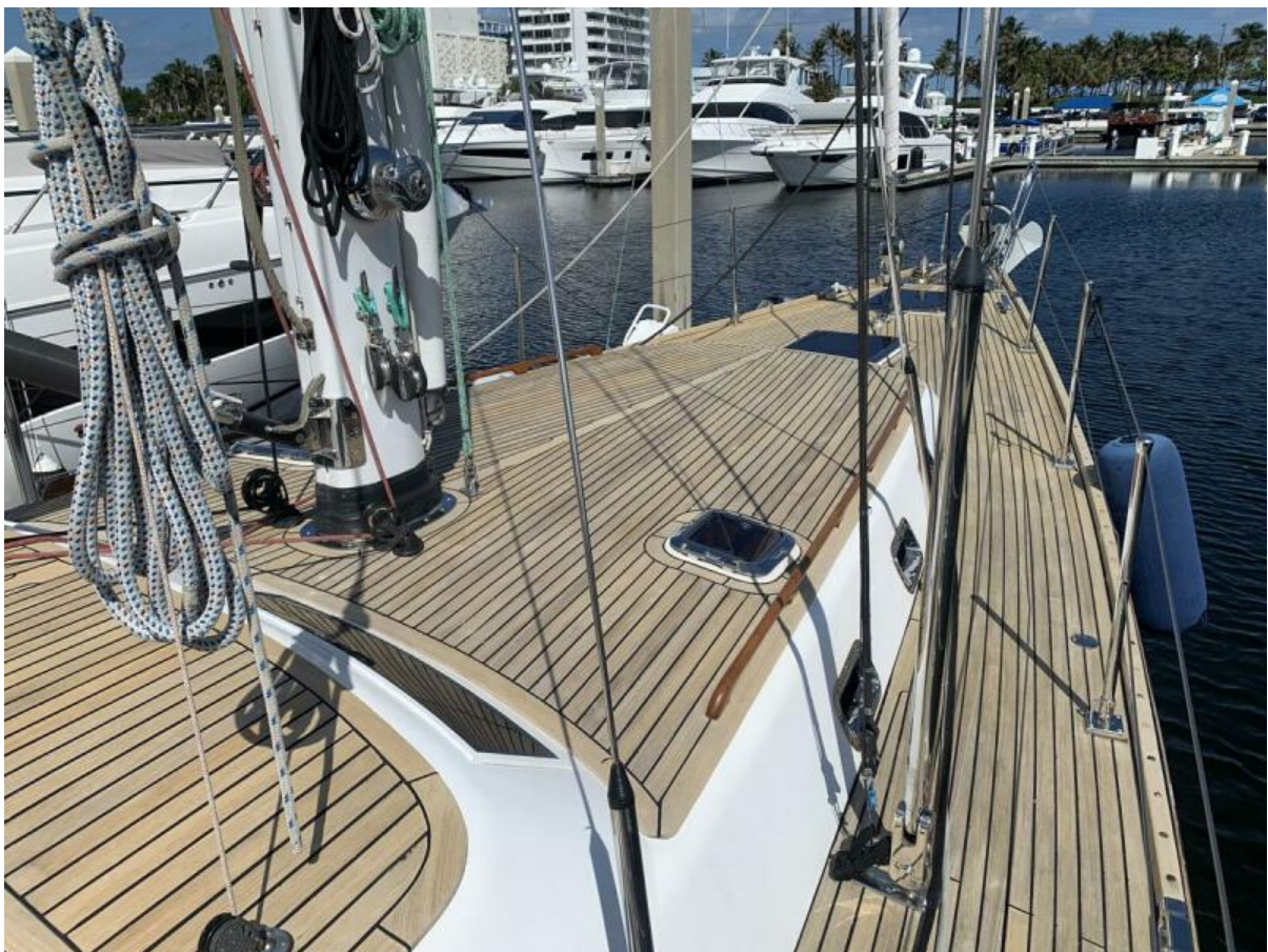
Foredeck Looking Forward