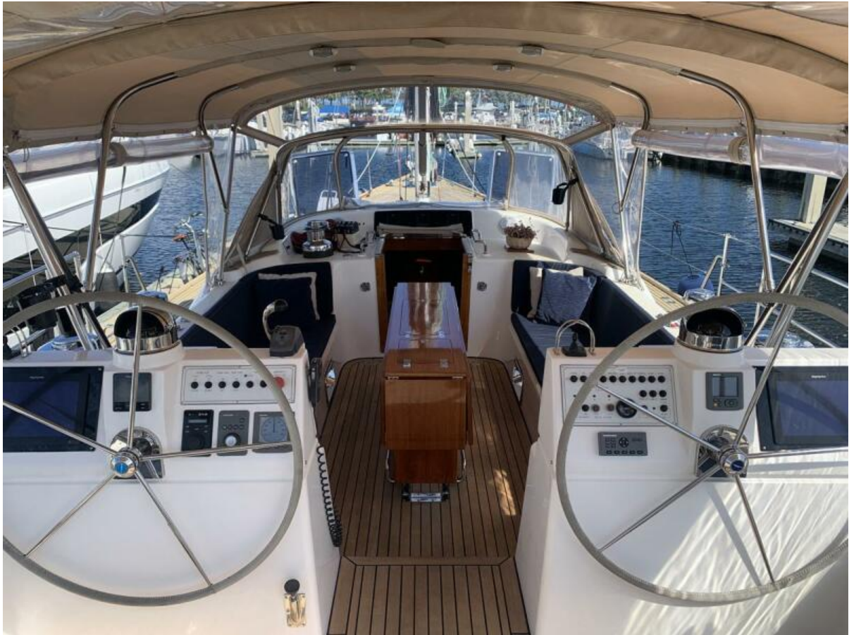
Helm Pedestals And Cockpit