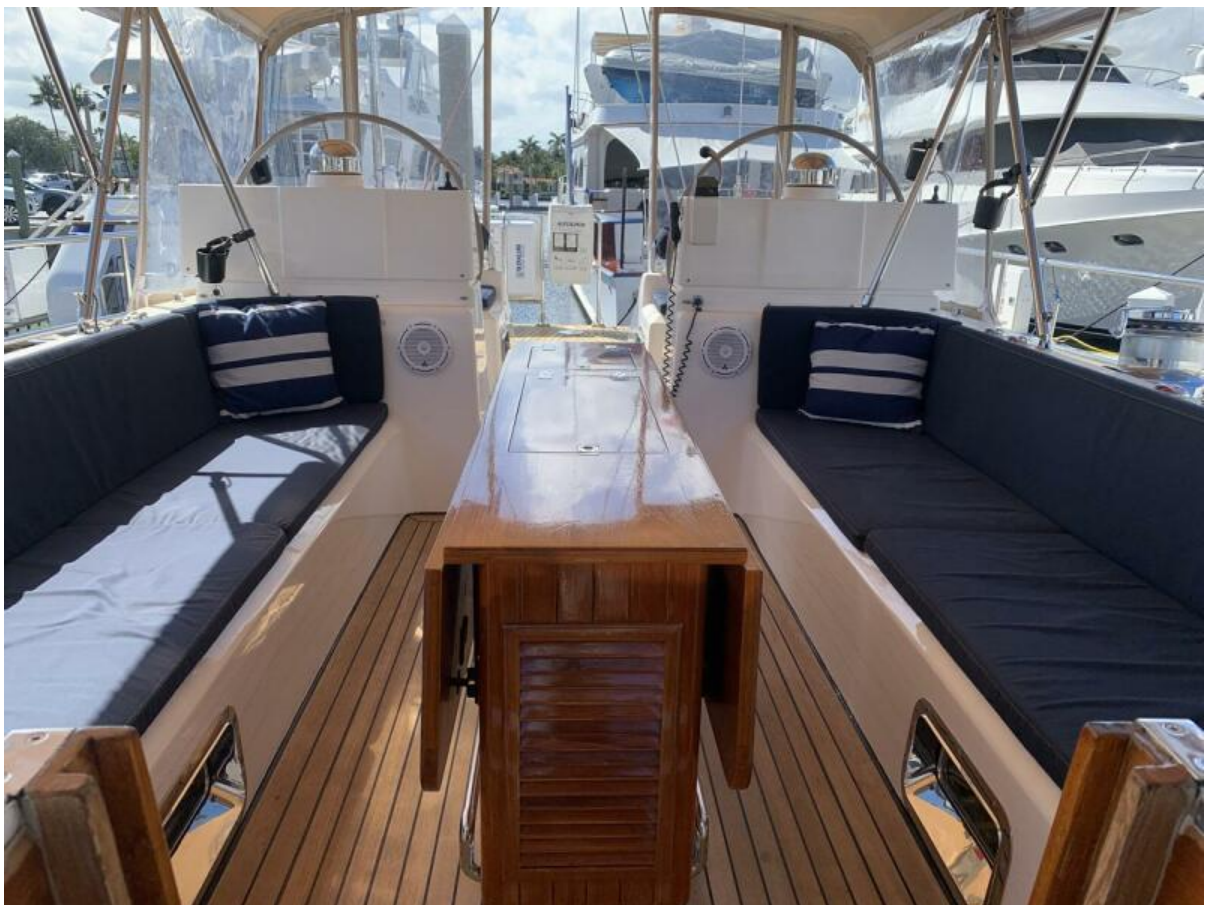
Cockpit Looking Aft