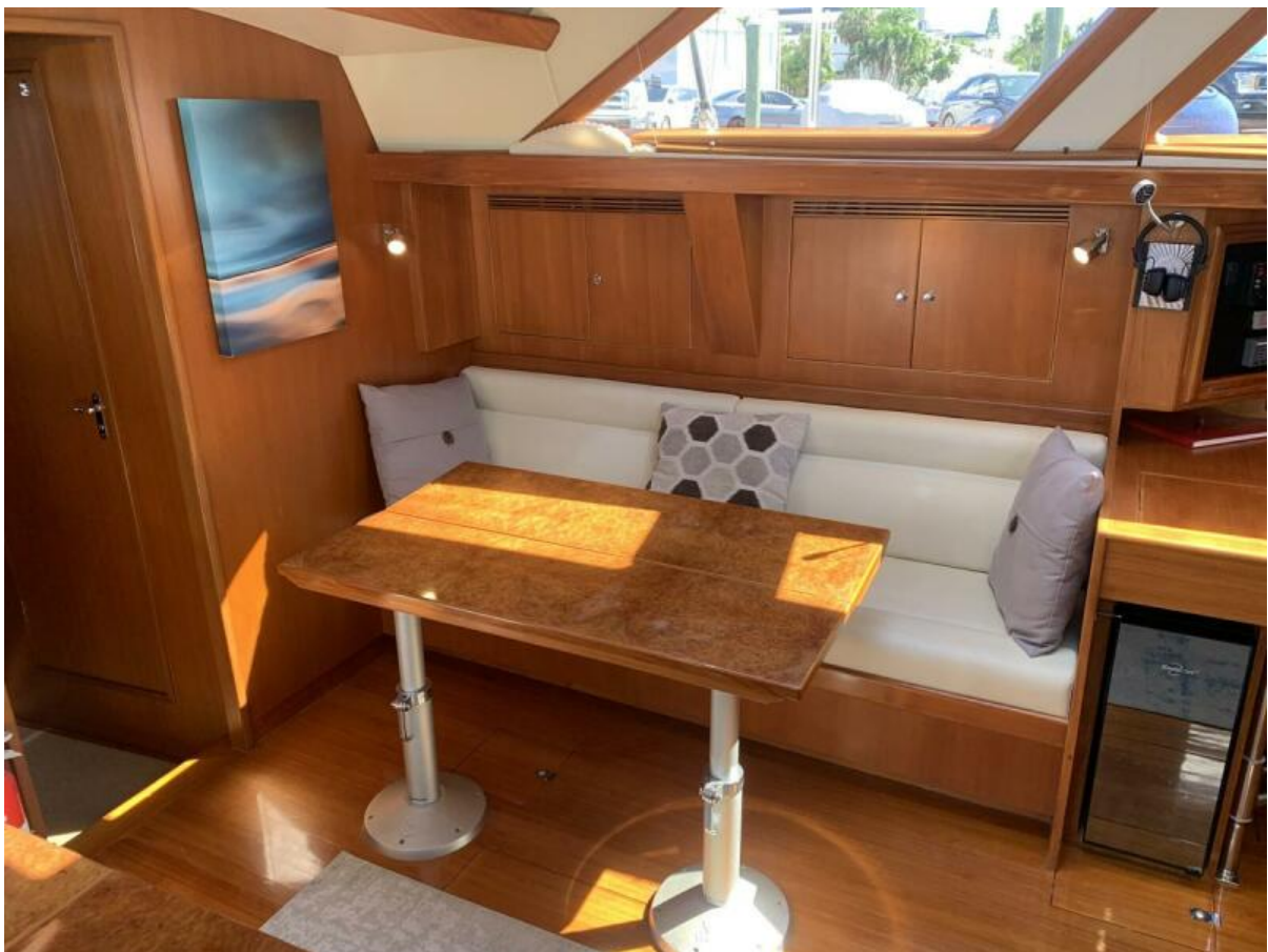
Stbd Salon Settee