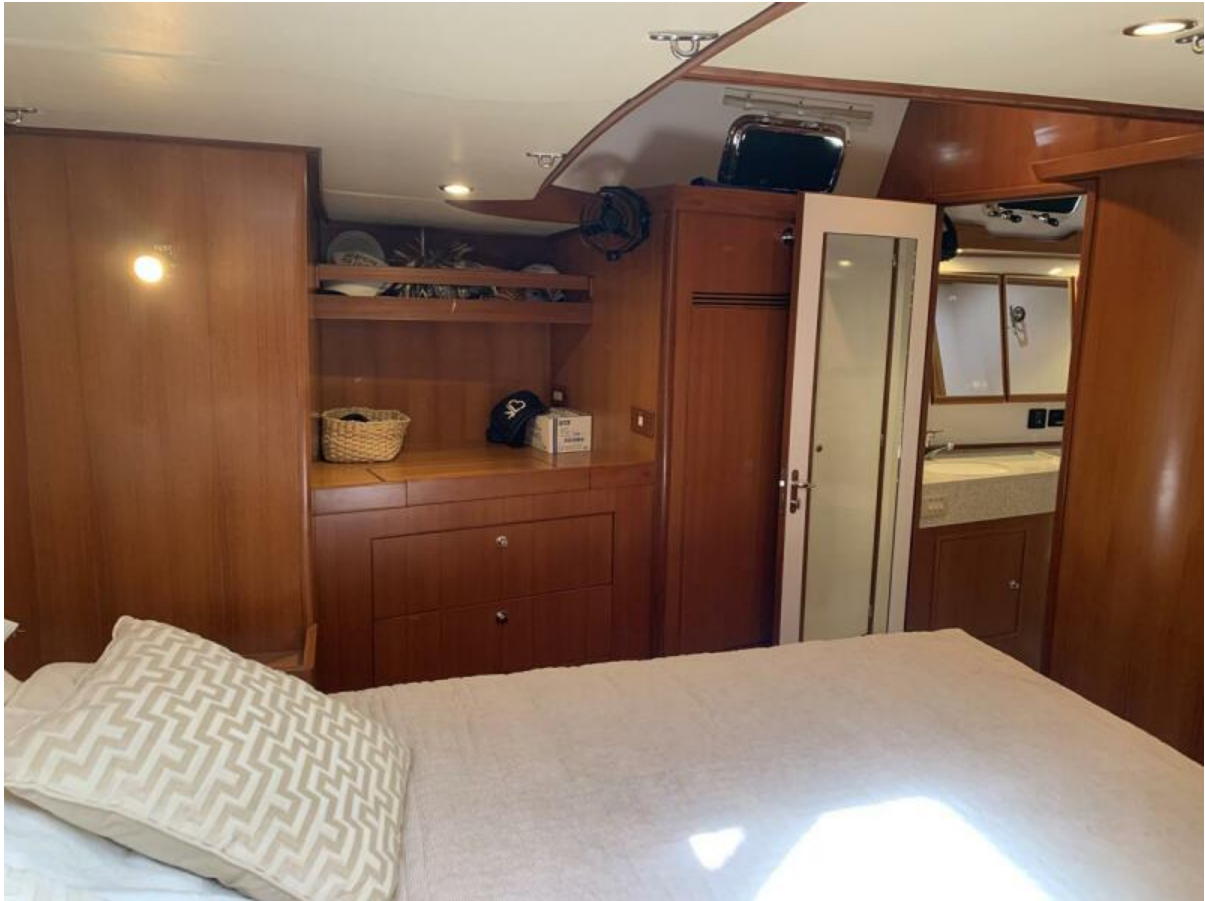
Owner's Berth Port