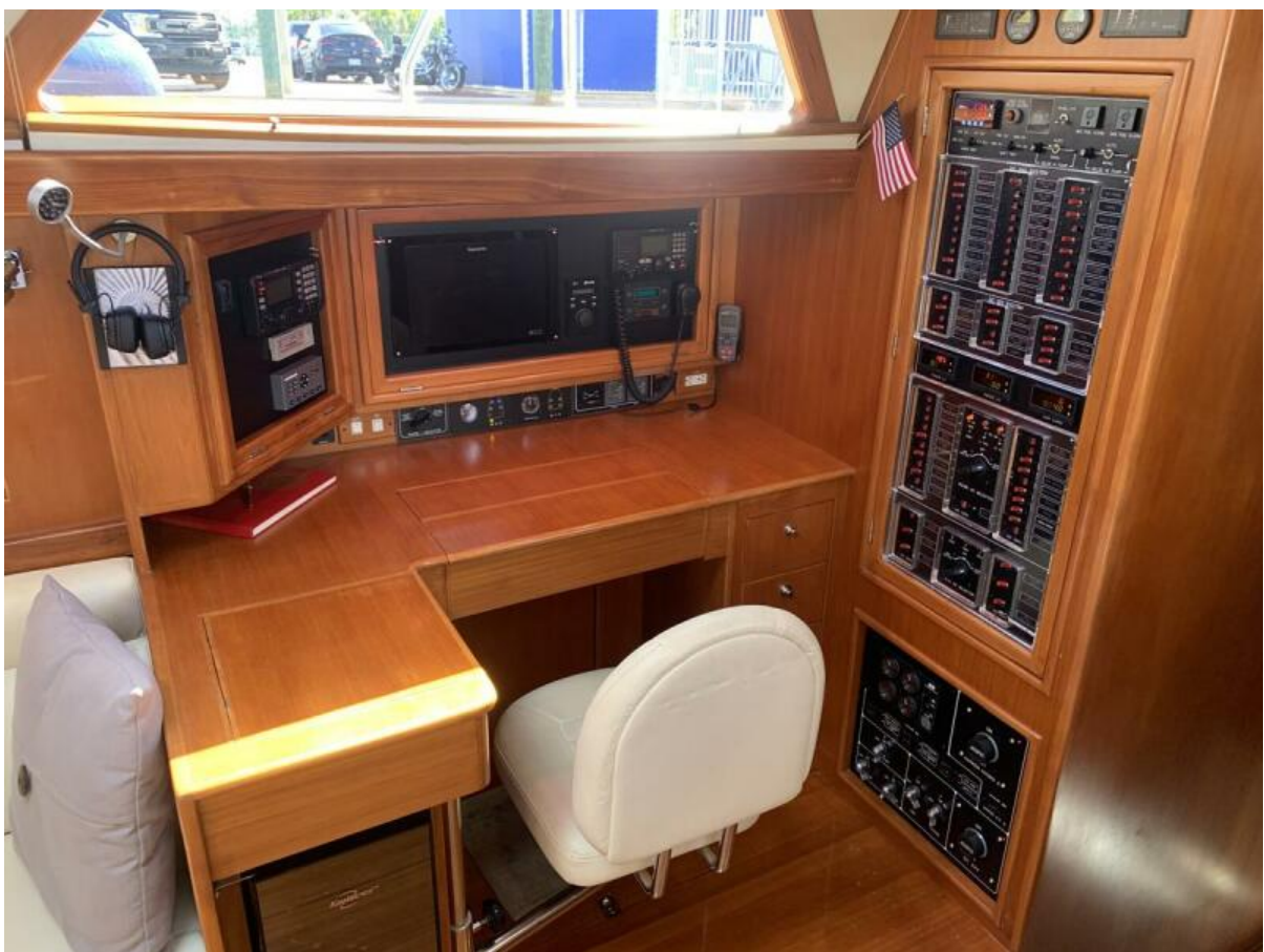
Nav Station Desk