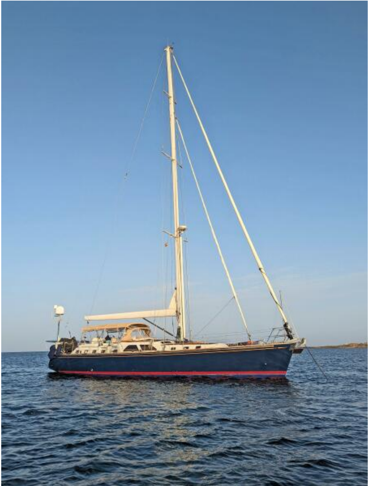
Stbd Side at Anchor