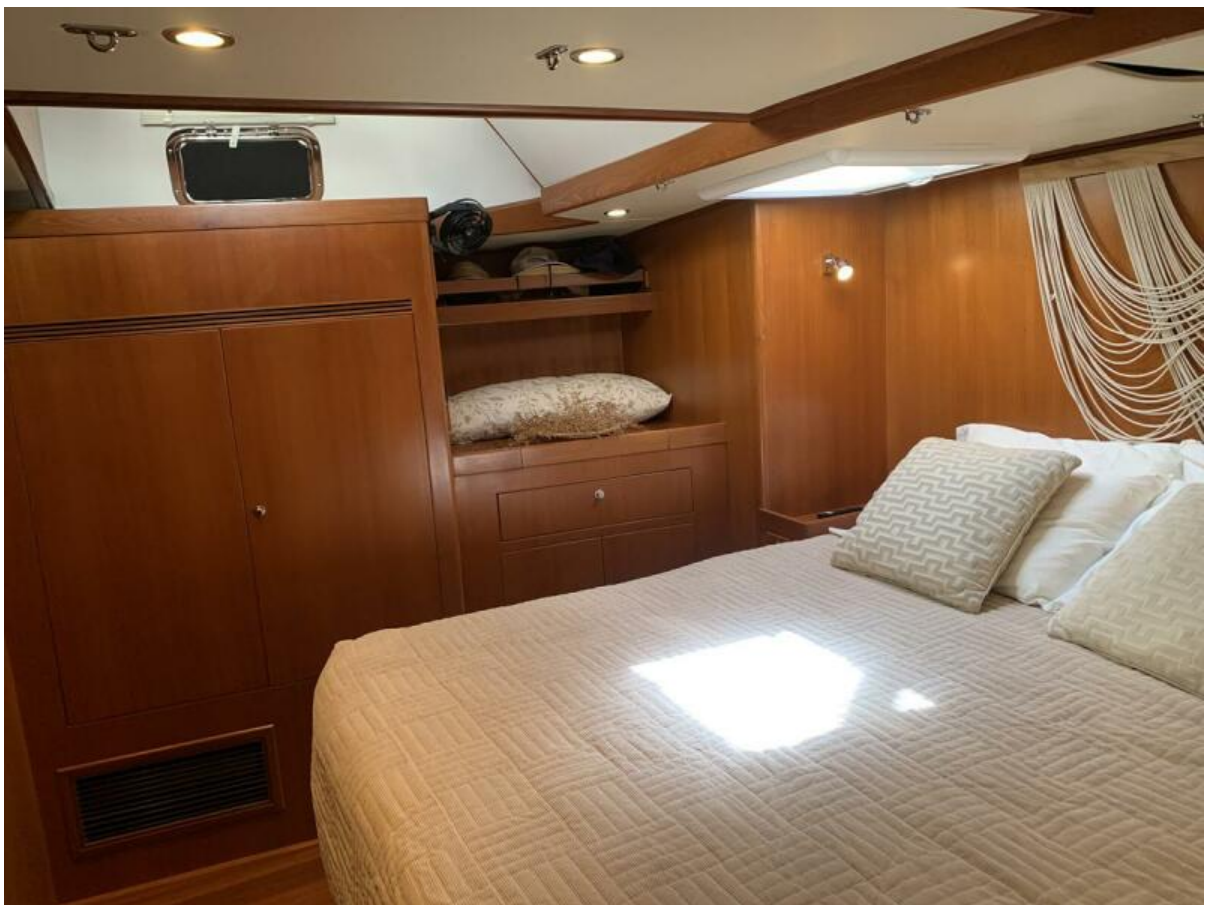
Owner's Berth Stbd