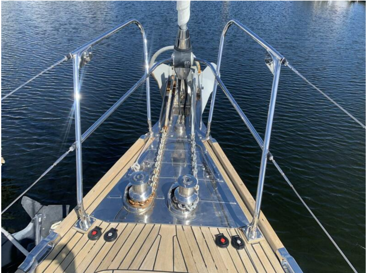
Anchor And Pulpit