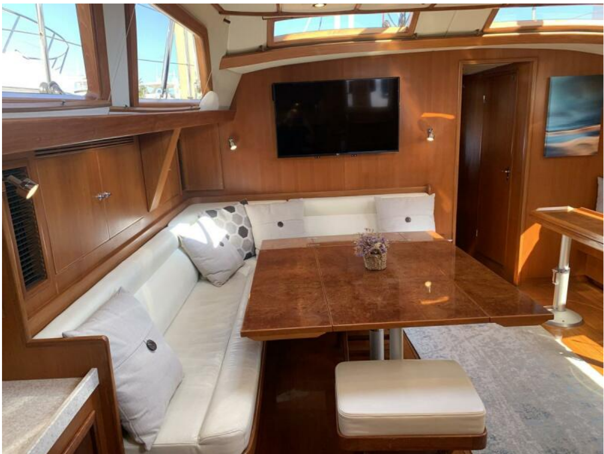
Port Salon Settee