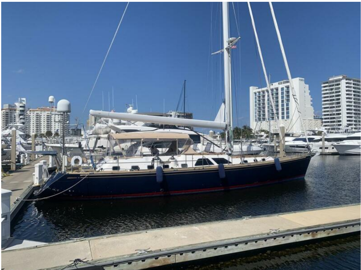
Stbd Side At Dock