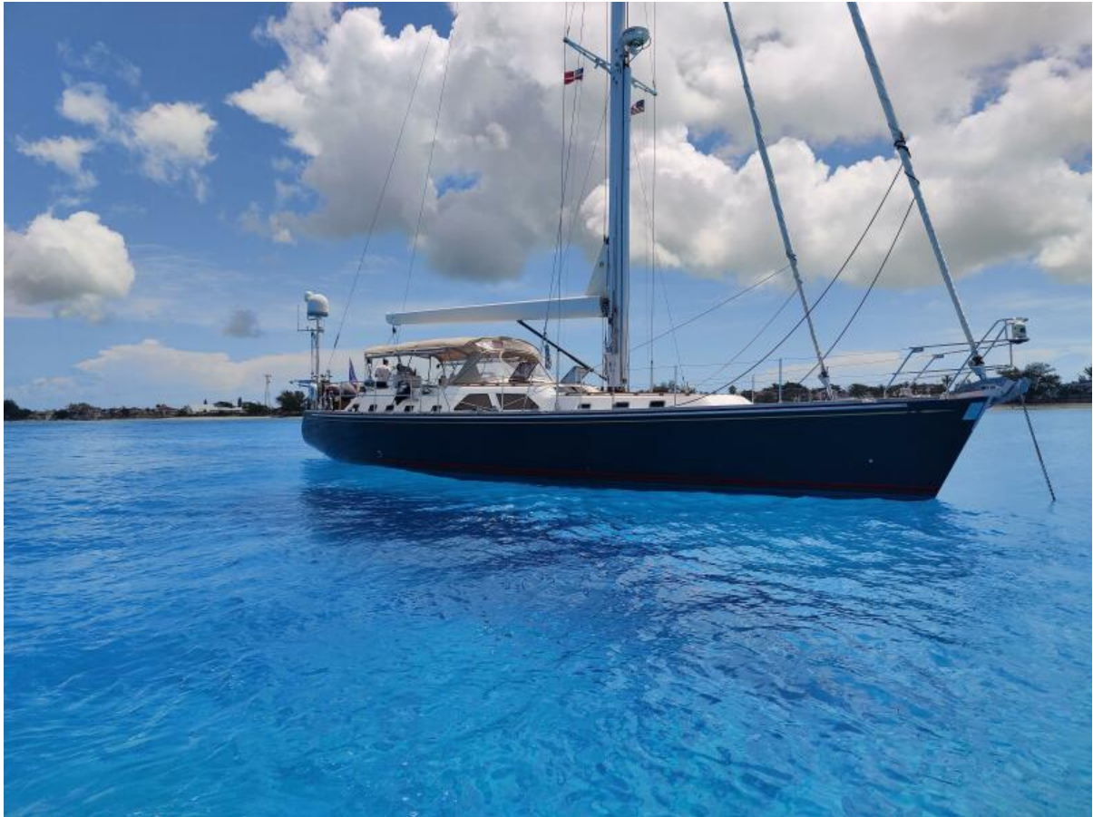
Starboard Bow At Anchor