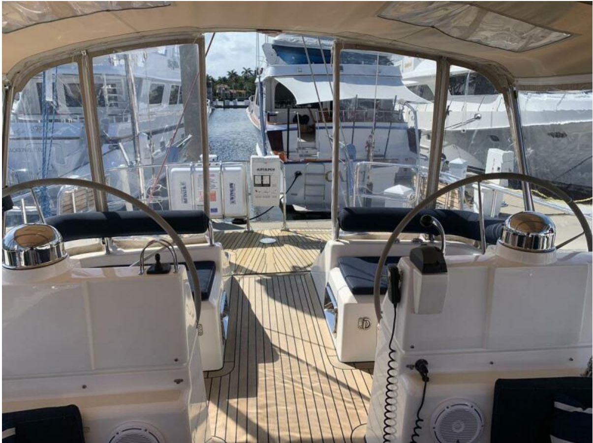
Aft Cockpit Enclosure