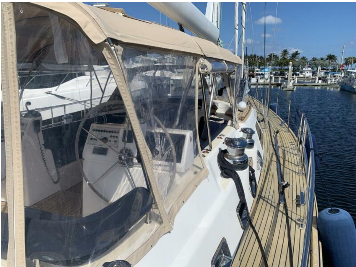
Stbd Side Decks & Cockpit