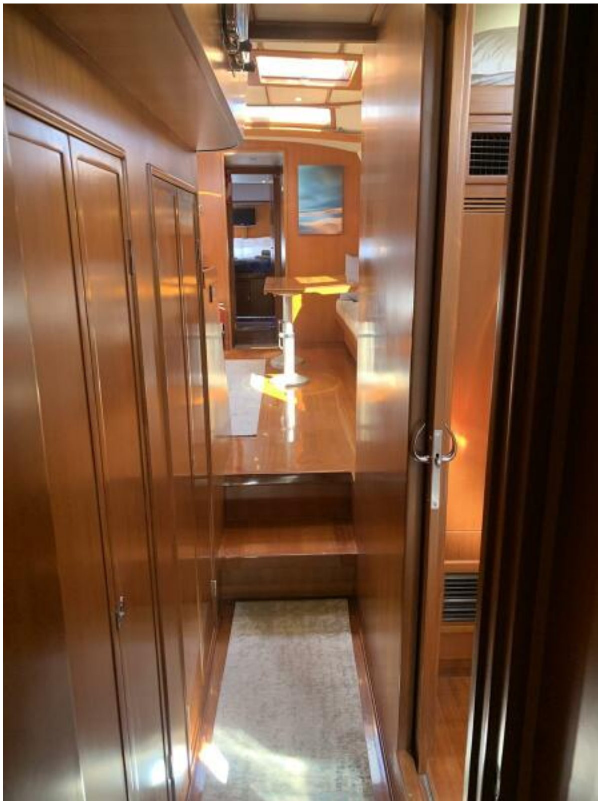
Passageway Looking Aft