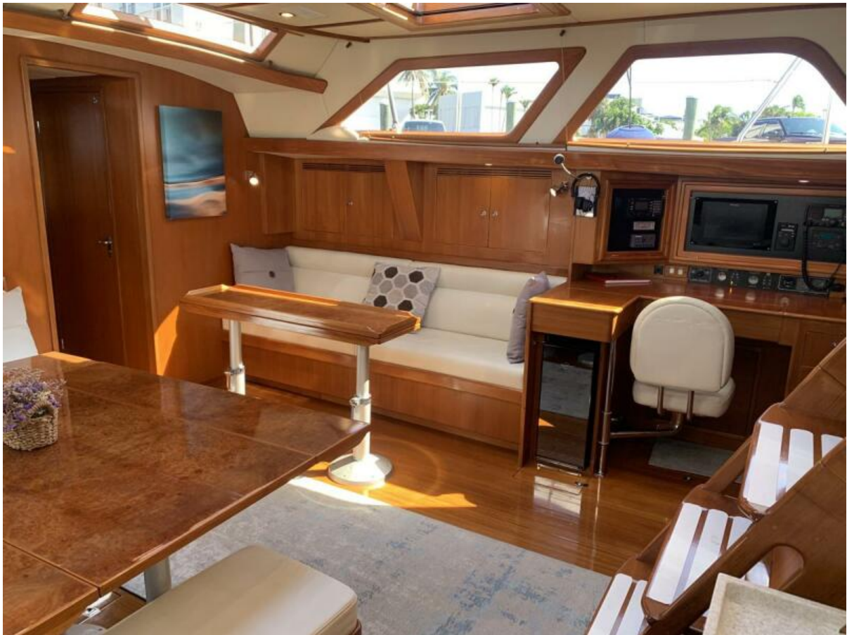
Stbd Settee And Nav Station