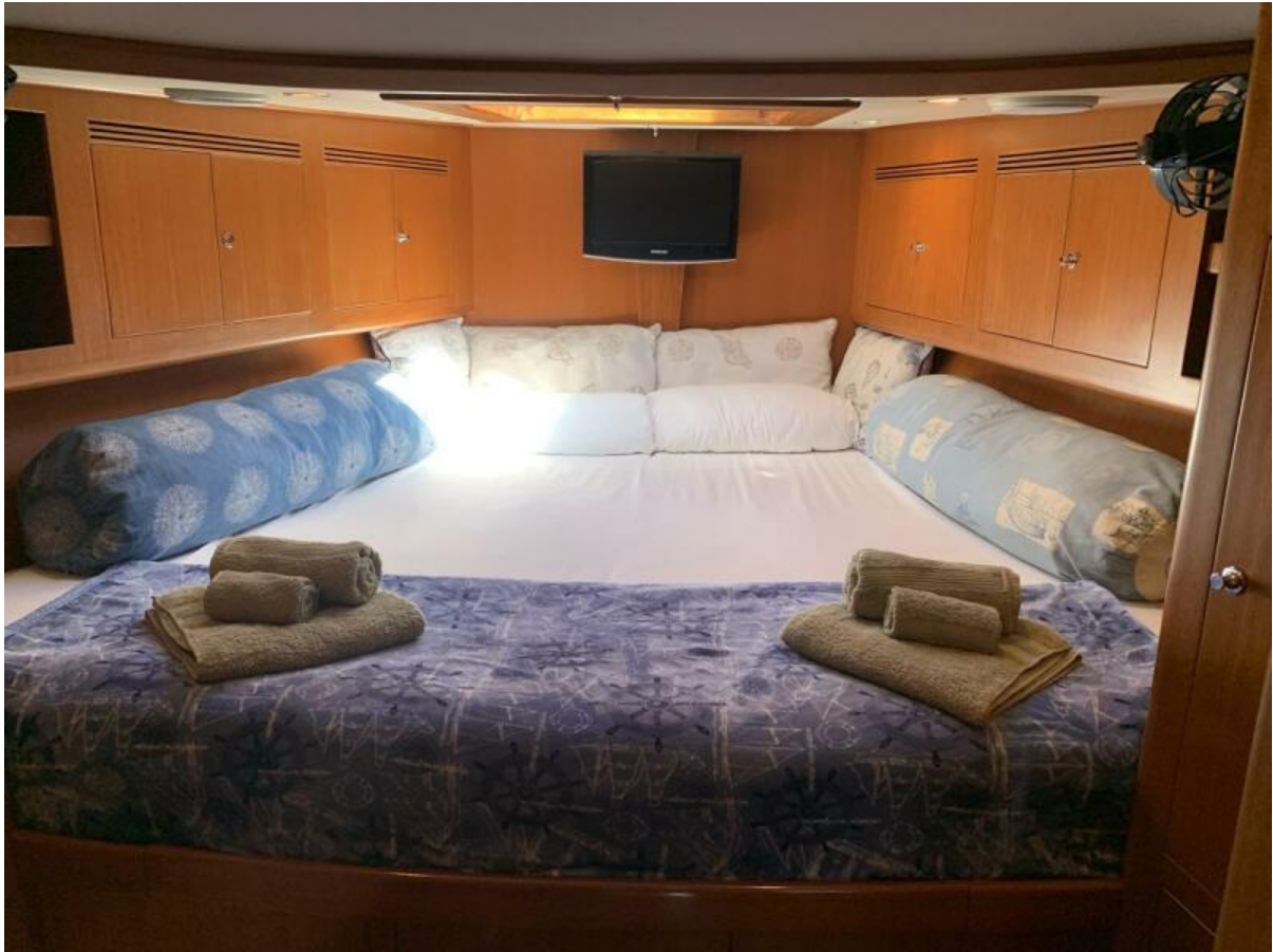
Fwd Cabin V-Berth