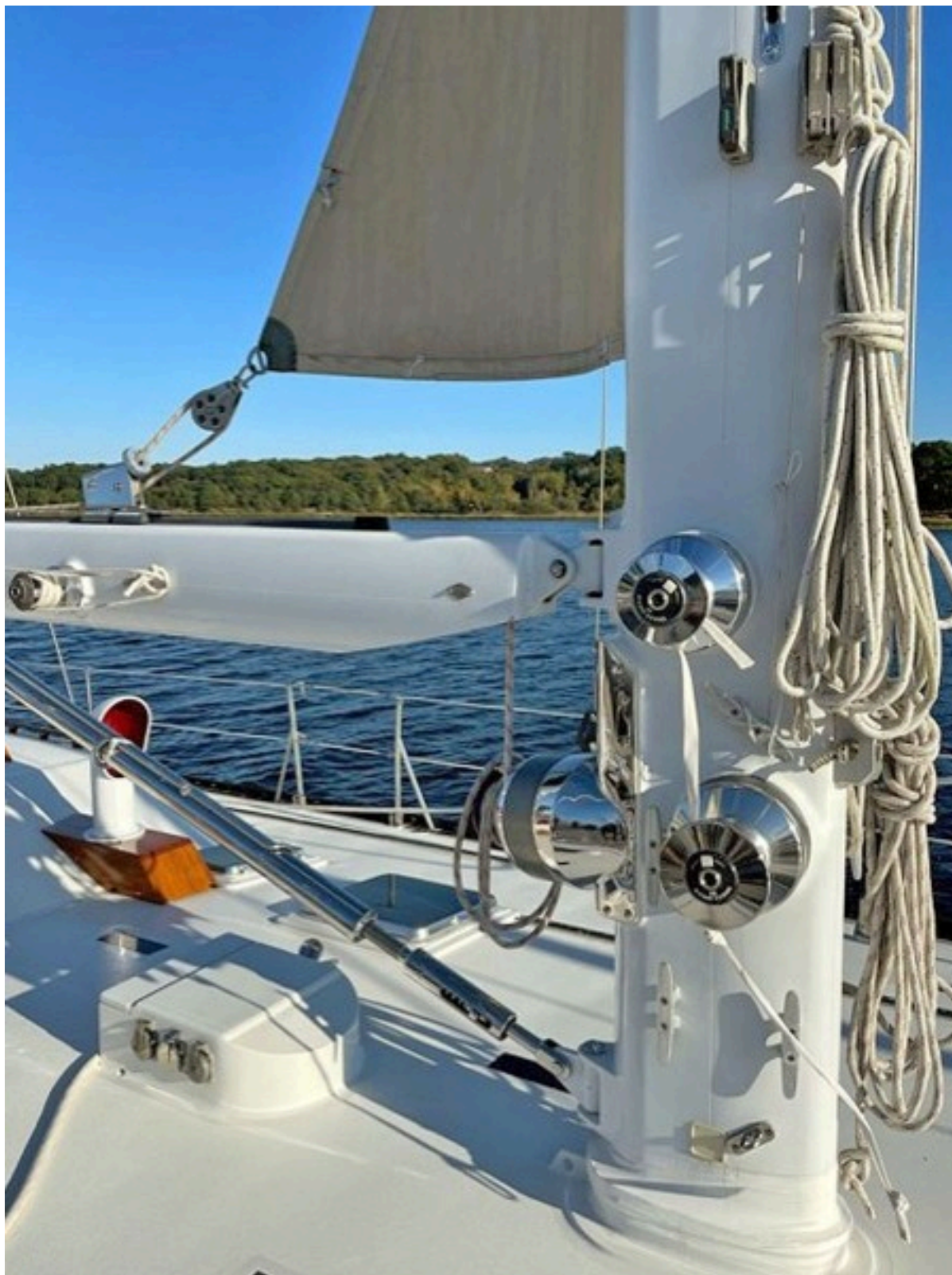
Mast and Boom