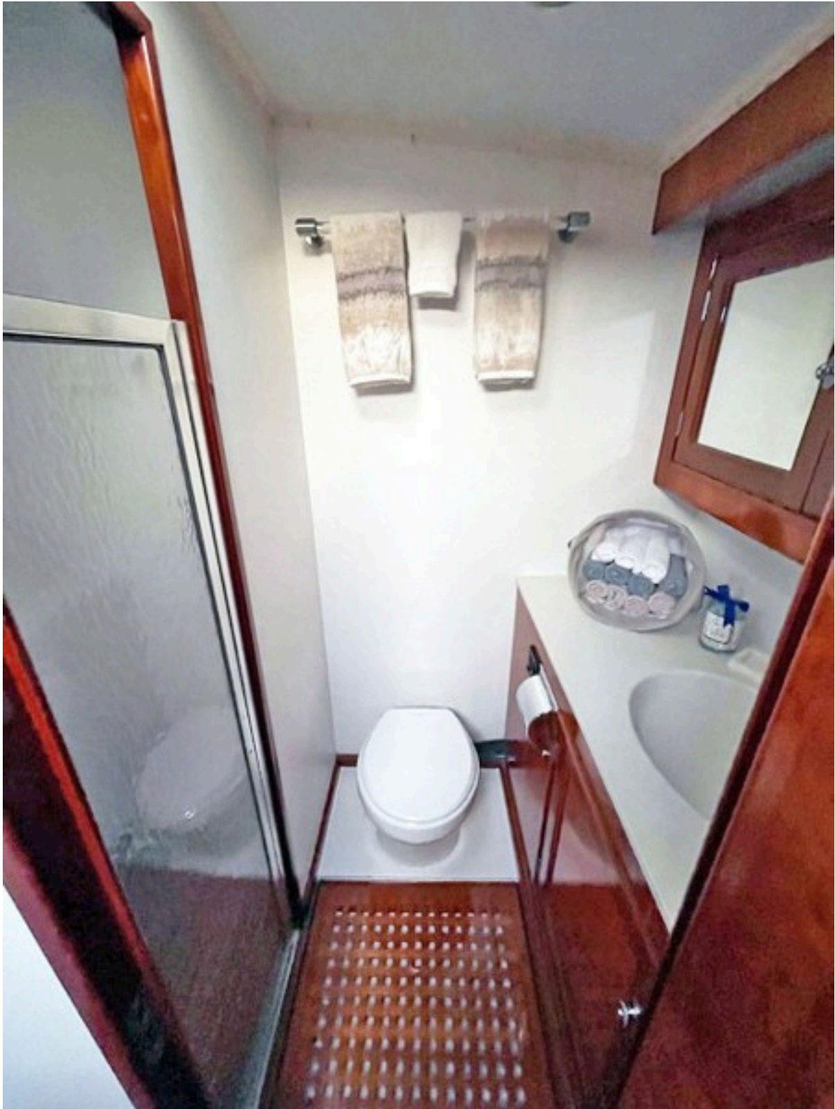
Stbd. Guest Head