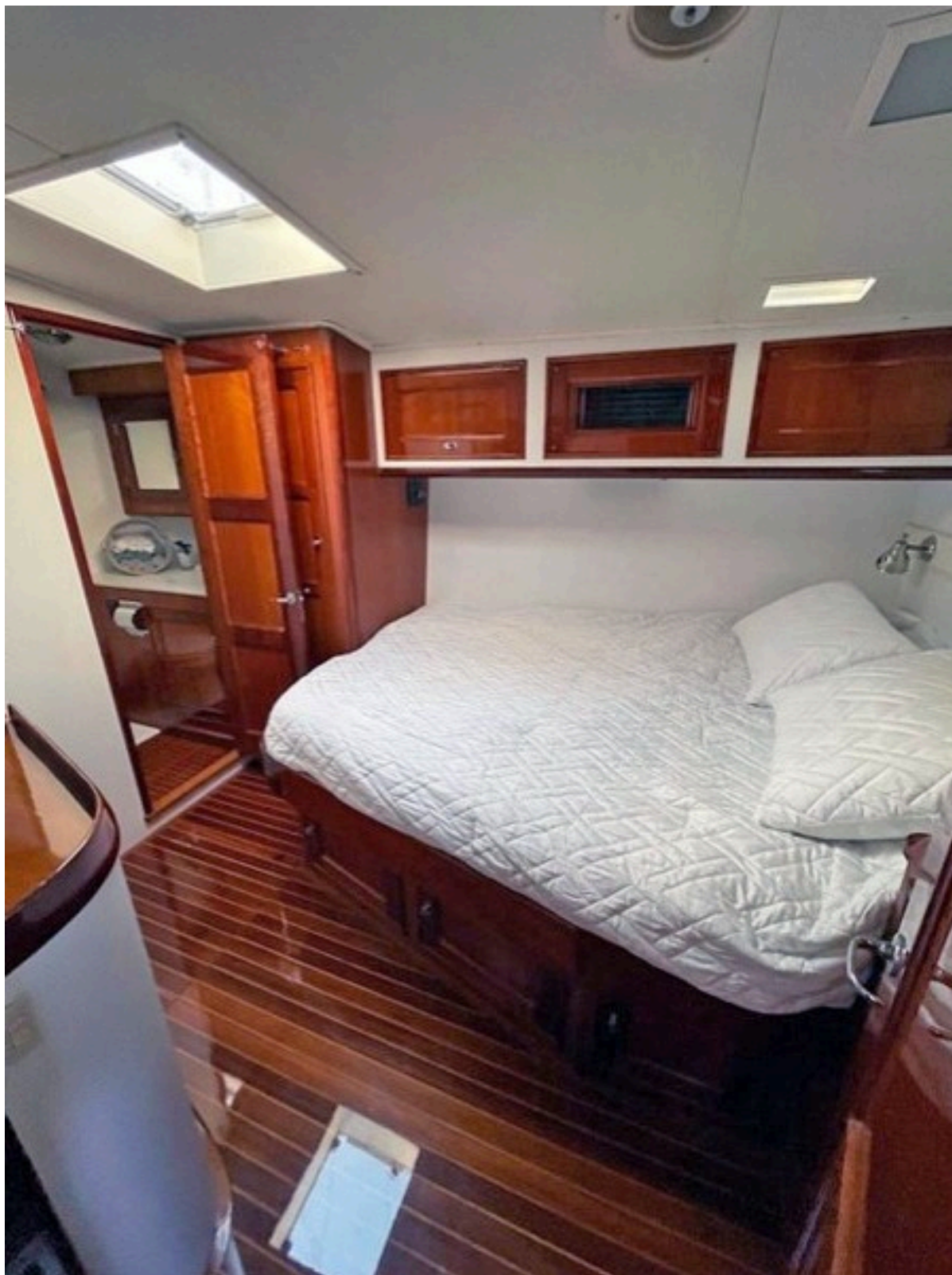
Stbd. Guest Cabin