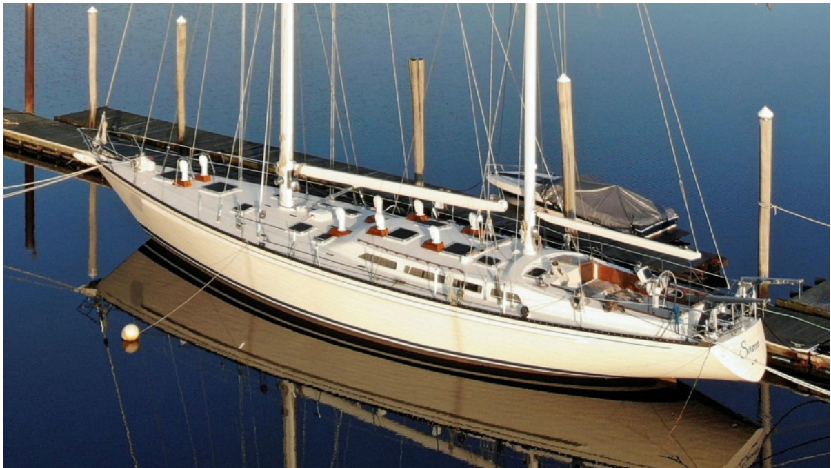
SIROCCO Alden/Palmer Johnson 78