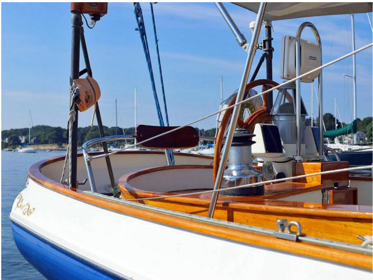
Scrollwork, Aft Stbd. Qtr.