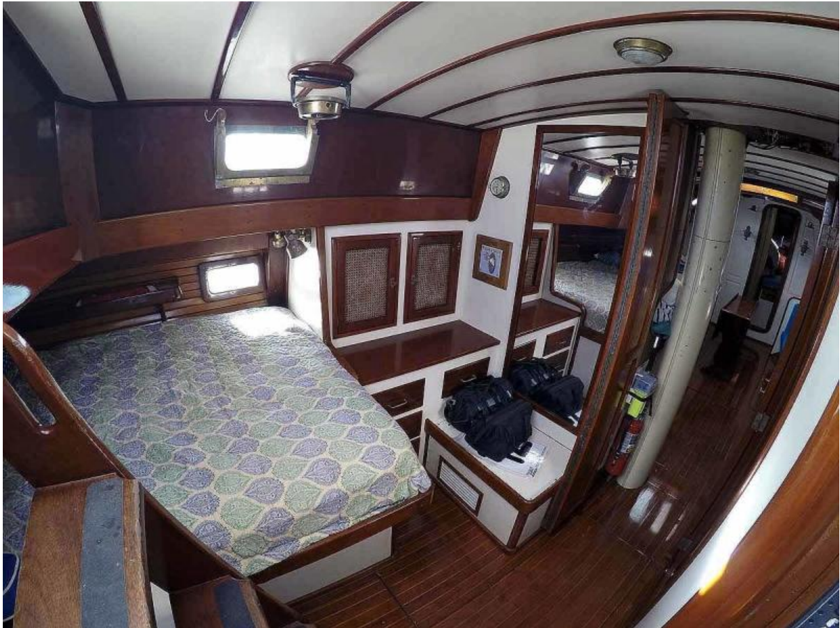
Aft Cabin, Looking Fwd.