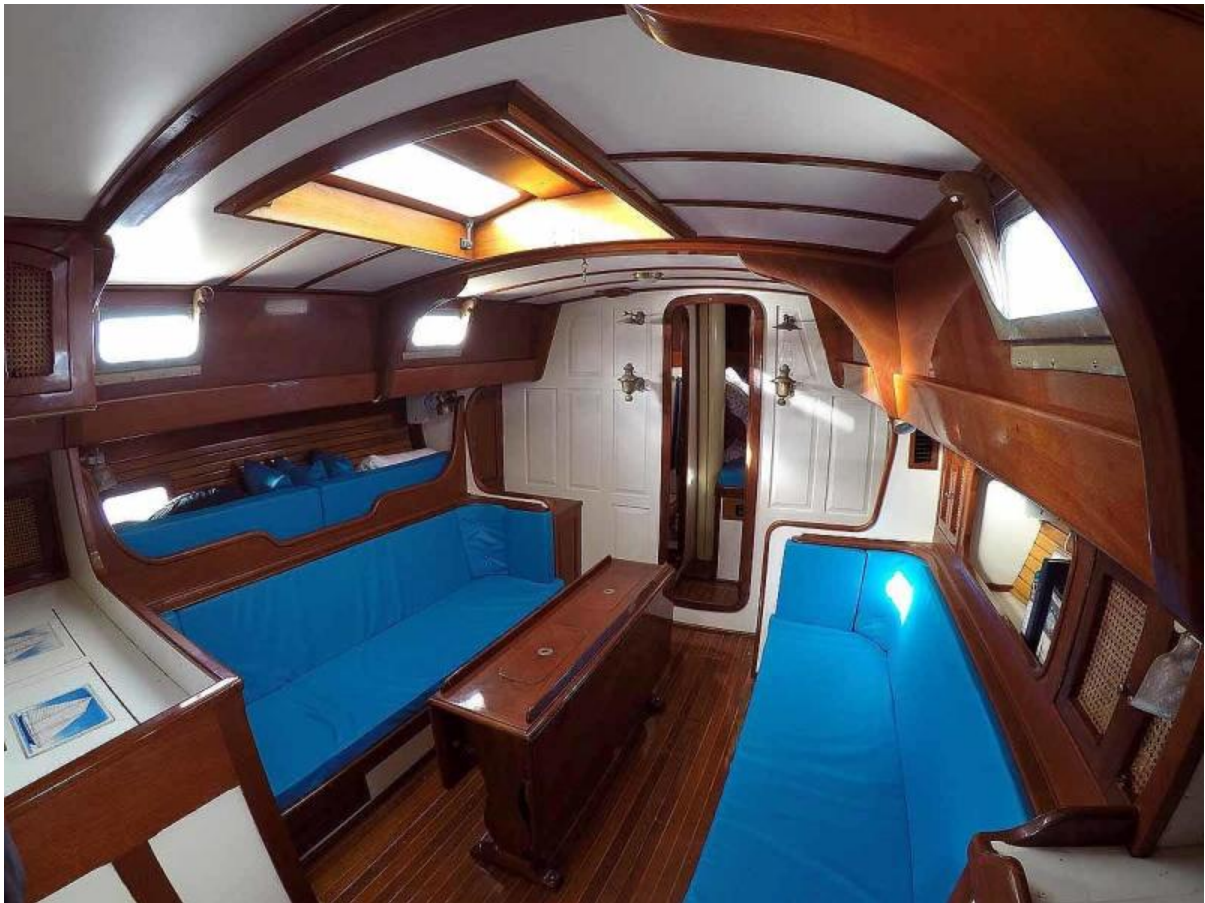
Salon Looking Fwd.