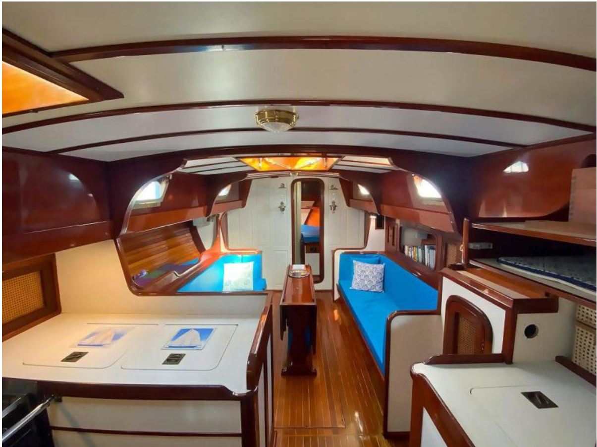
Interior, Fwd. from Galley