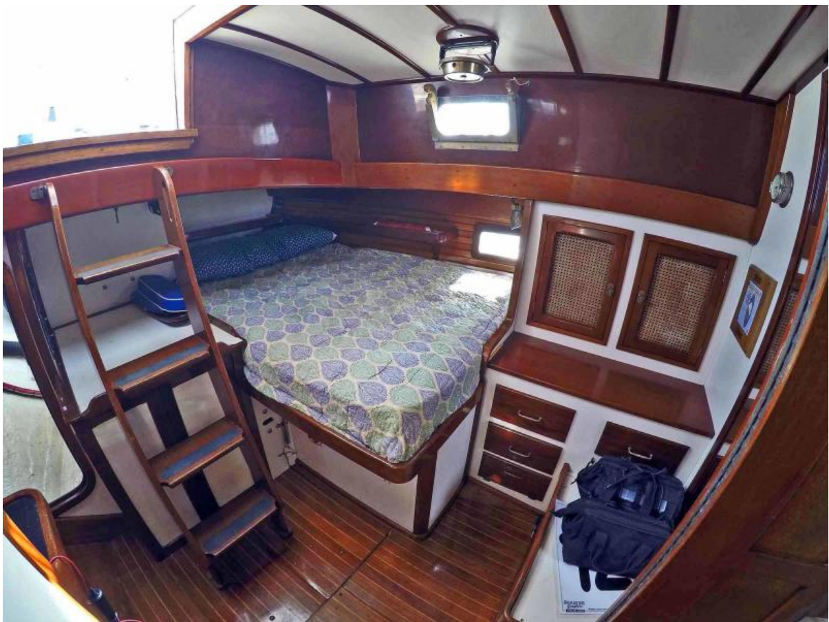
Aft Double Berth