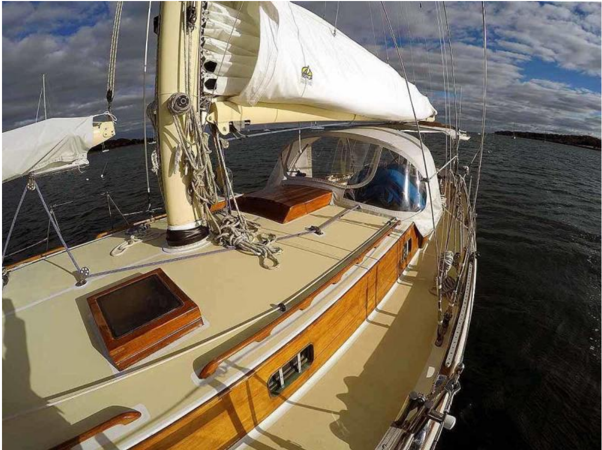
Varnished Cabin Sides