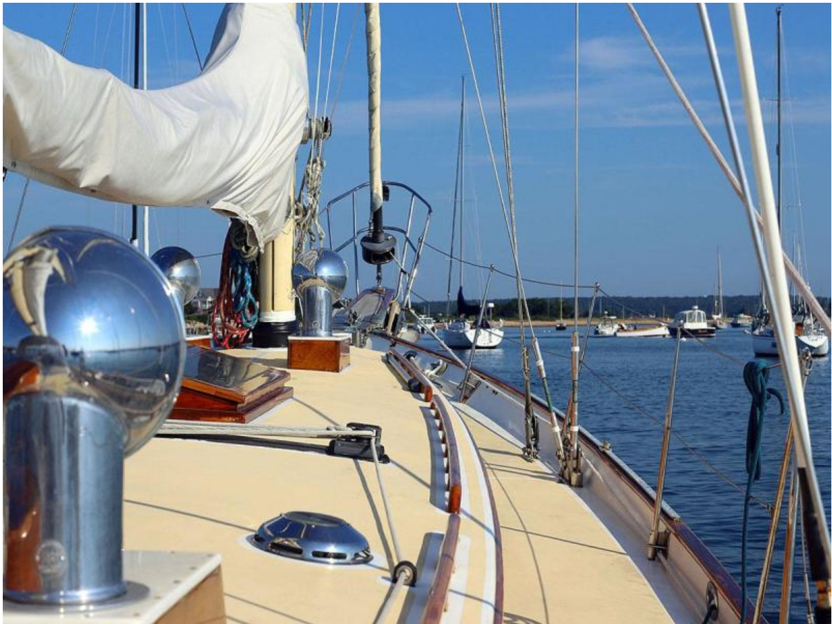
Stbd. Deck, Fwd.