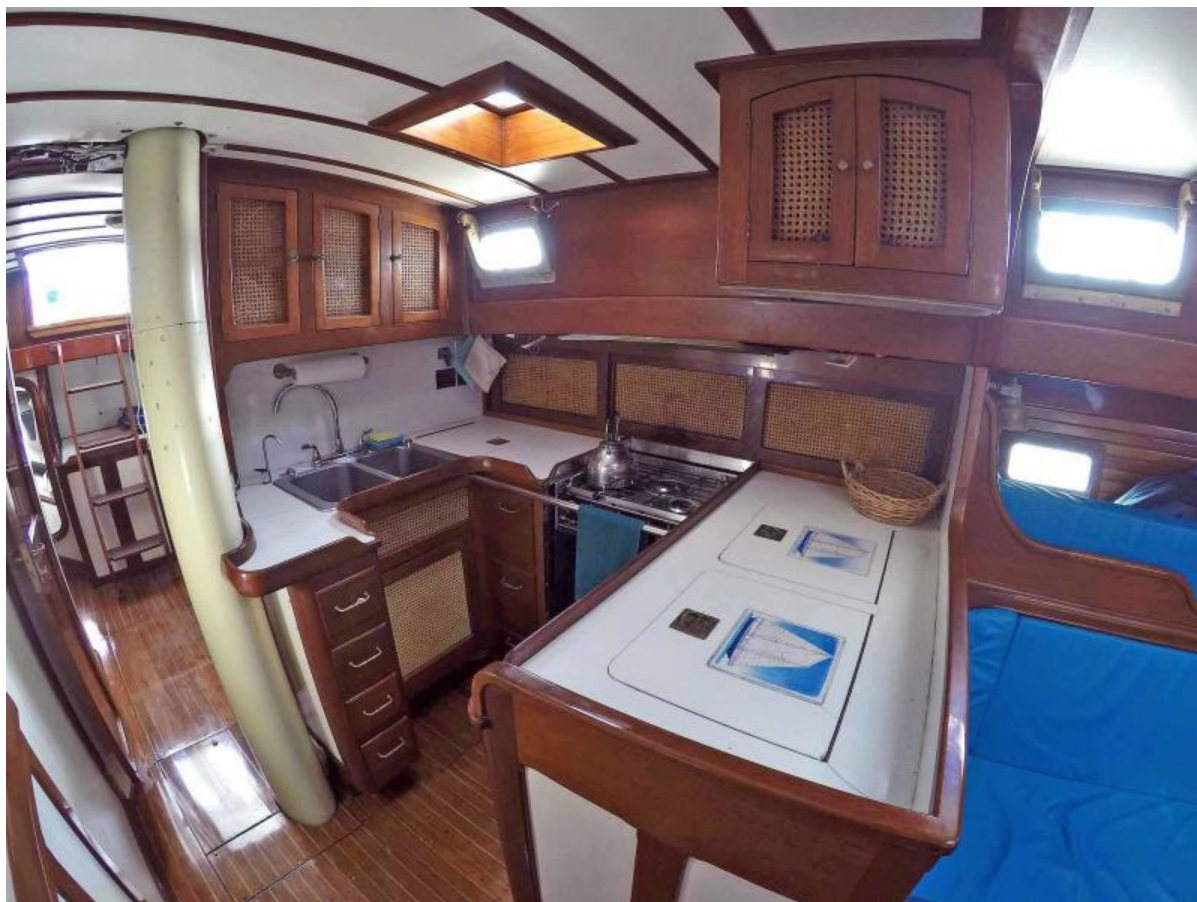
Galley, Looking Aft