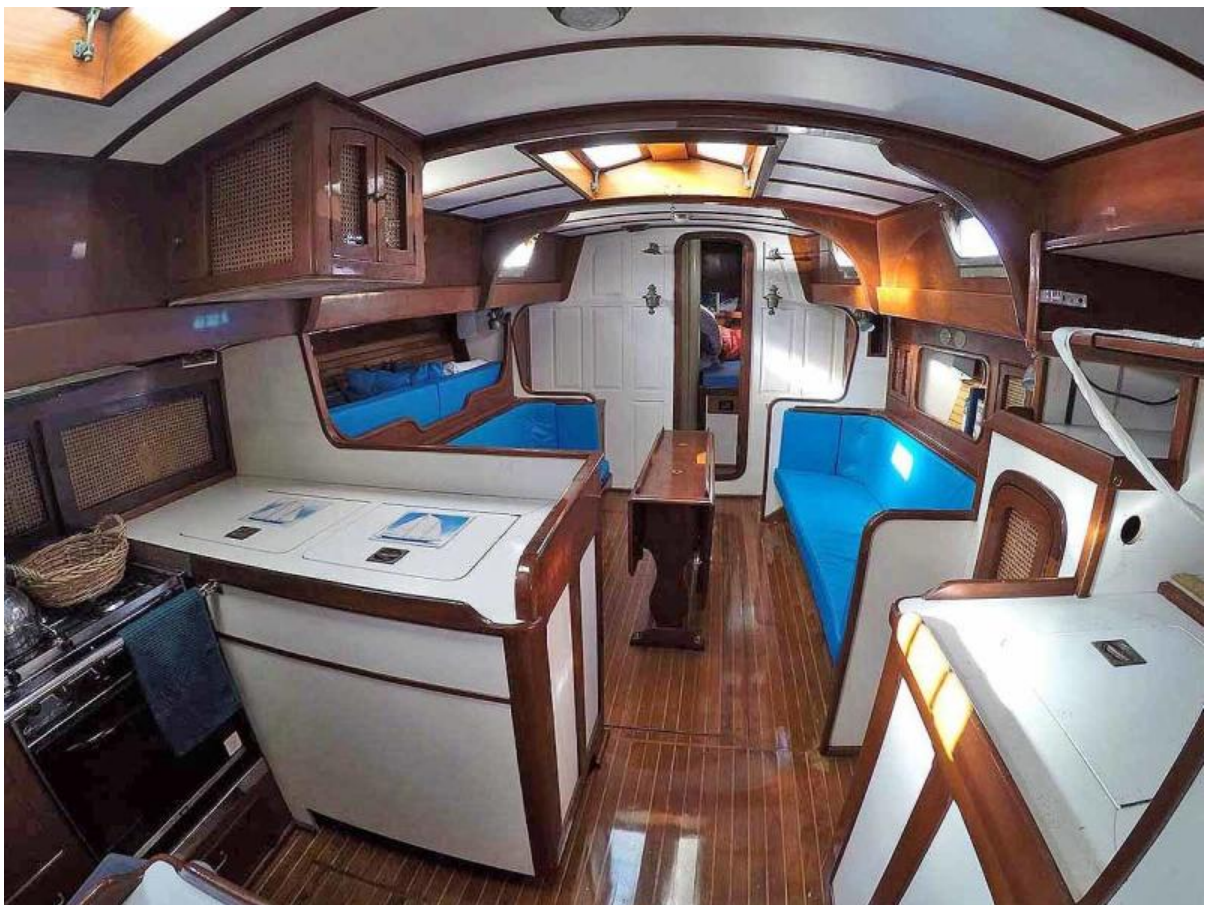
Galley to Salon