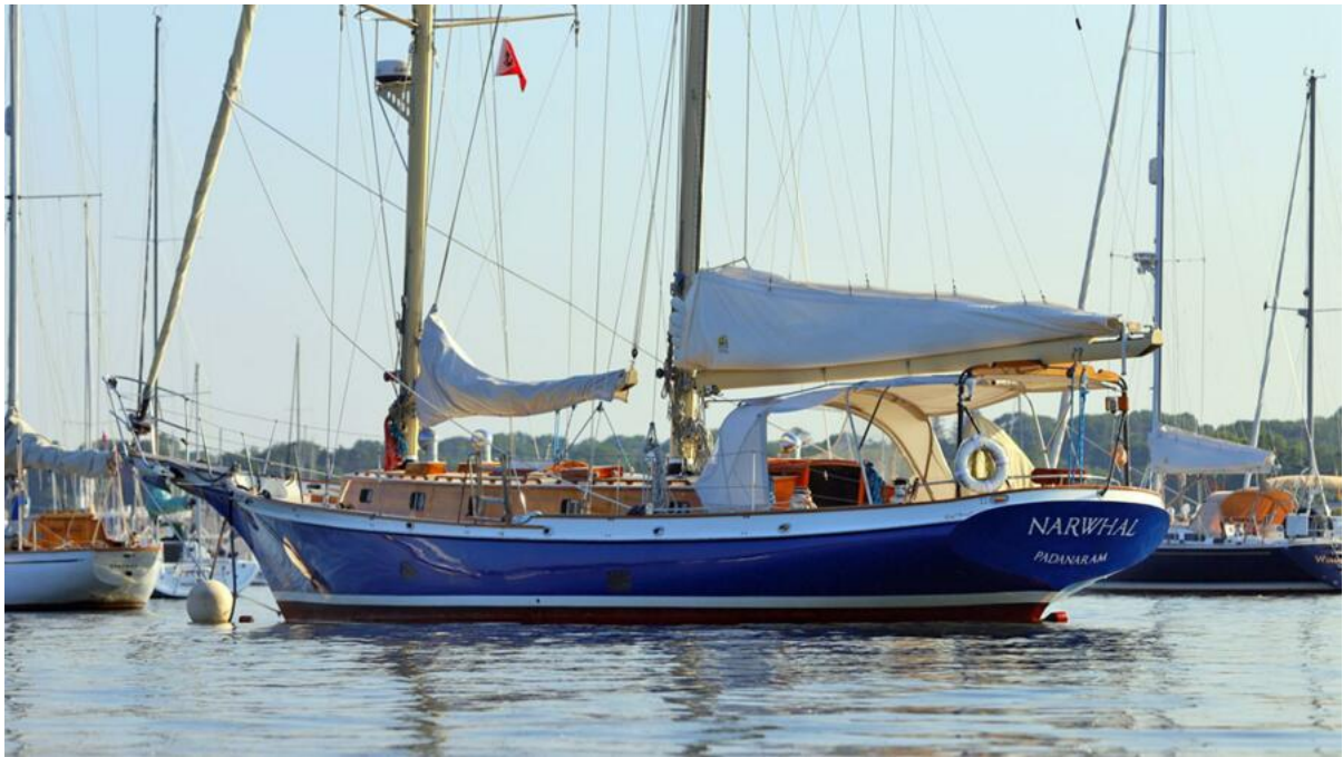
NARWHAL Cherubini 48 Schooner