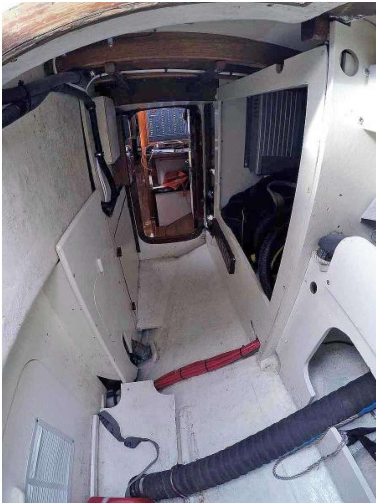
Utility Room Looking Fwd.