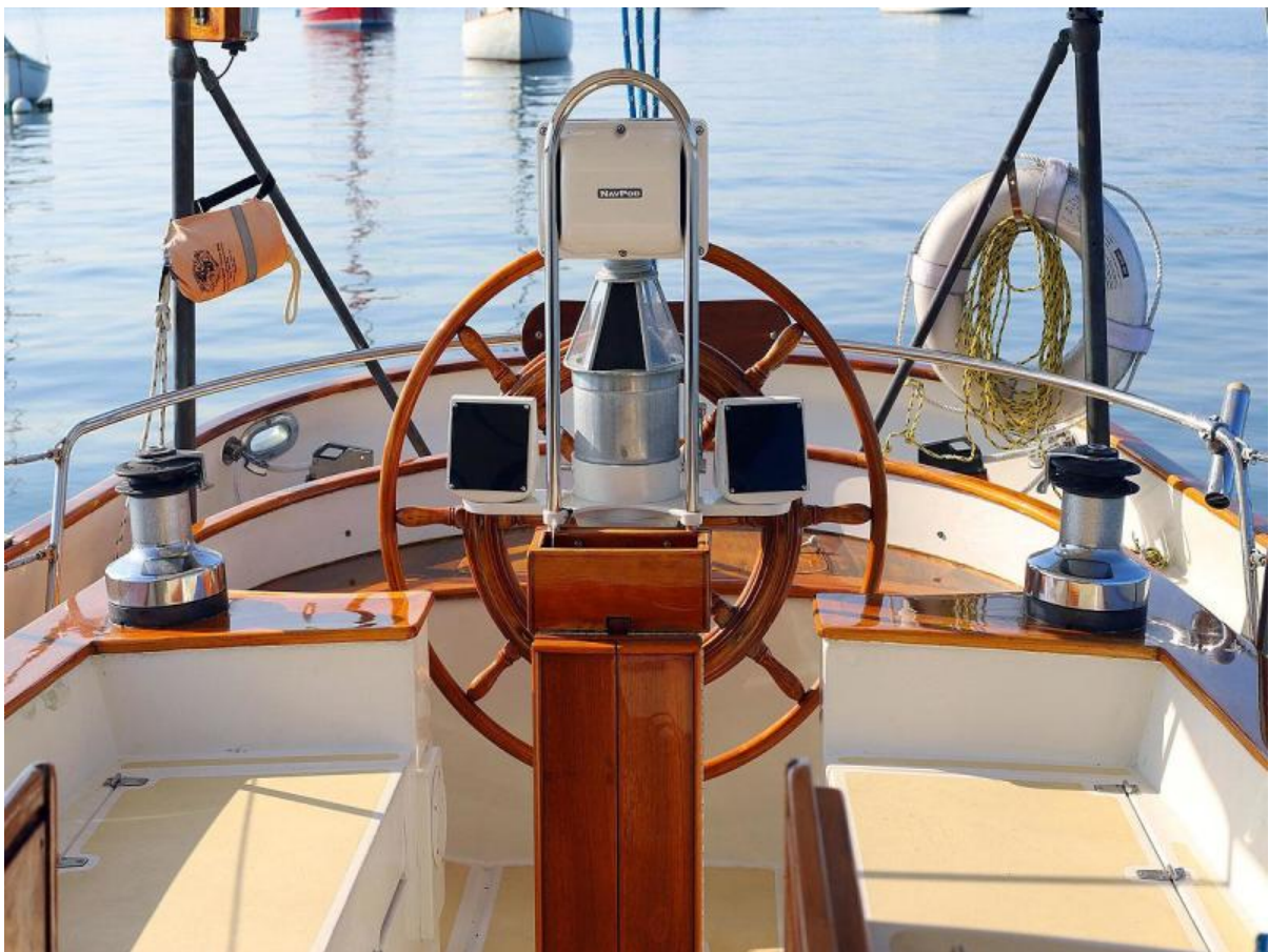
Cockpit Aft to Helm