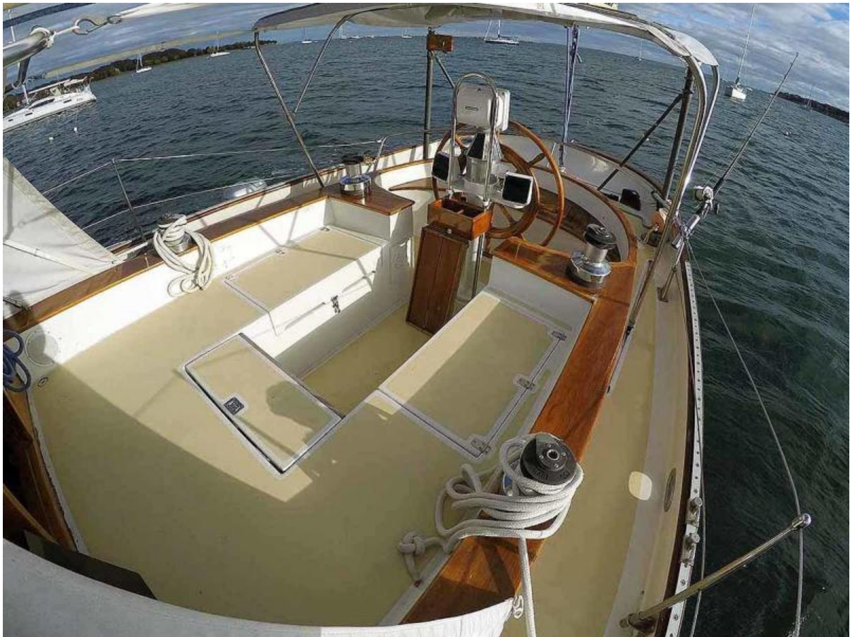
Cockpit to Stbd.