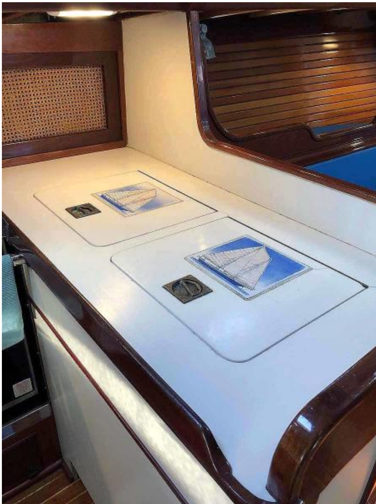
Galley Counter Tiles