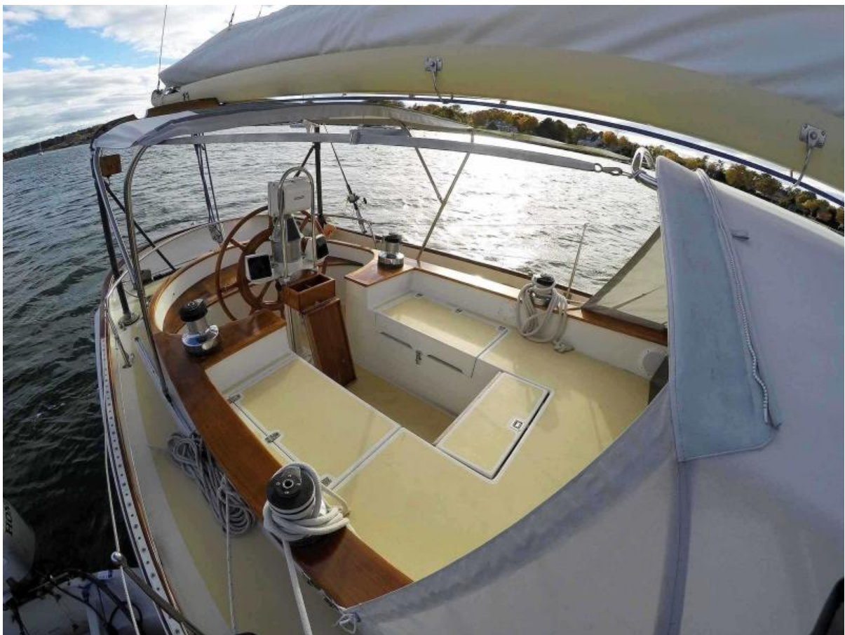
Cockpit Dodger and Bimini