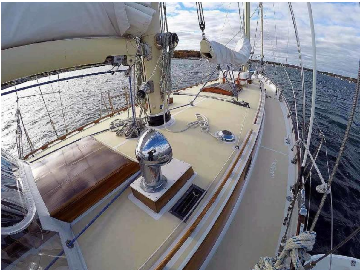
Cabin Top, Looking Fwd.