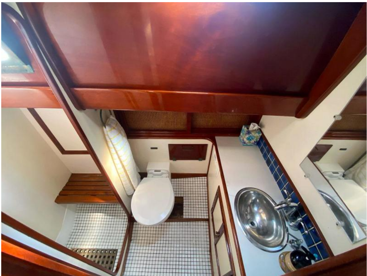
Aft Head and Shower