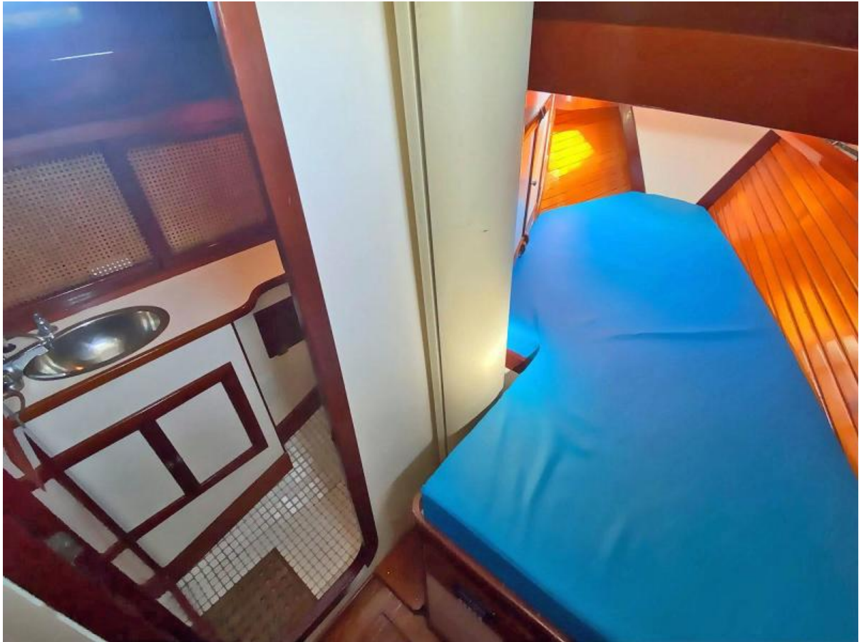
Fwd. Cabin Ensuite Head