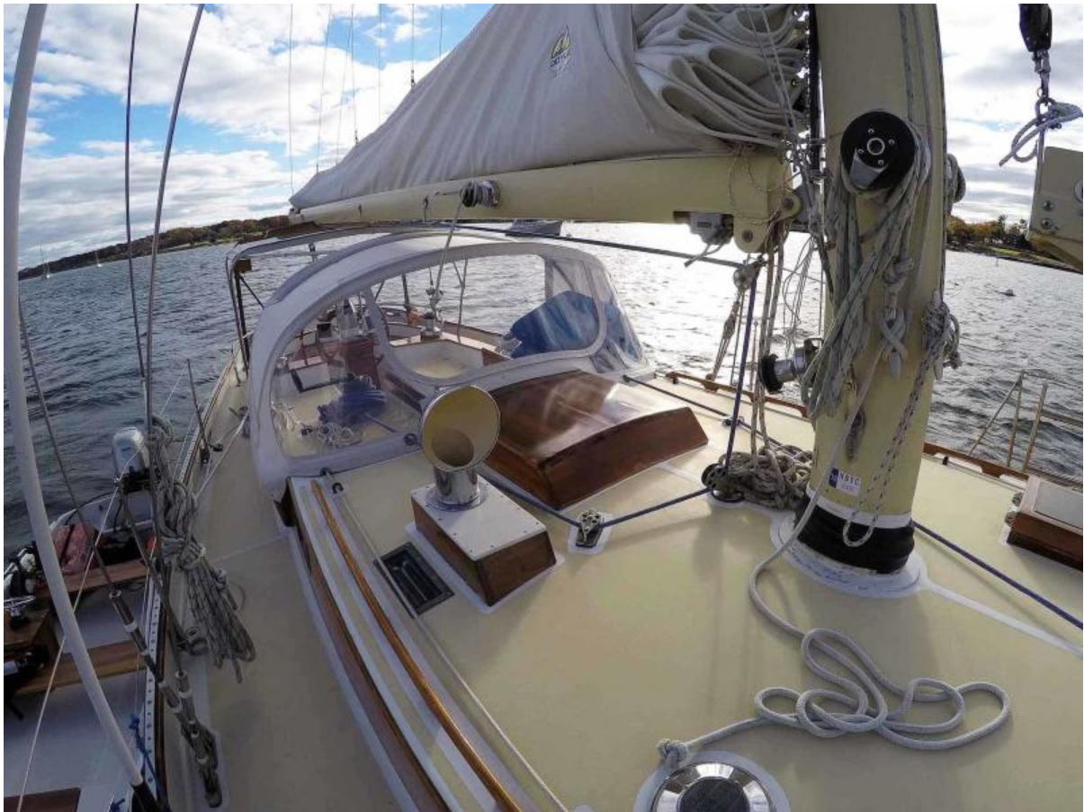
Cabin Top, Looking Aft