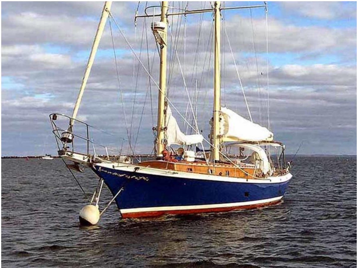
Port Fwd. Qtr.