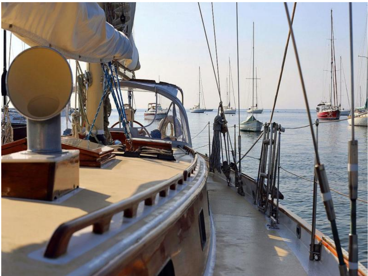
Port Deck, Aft