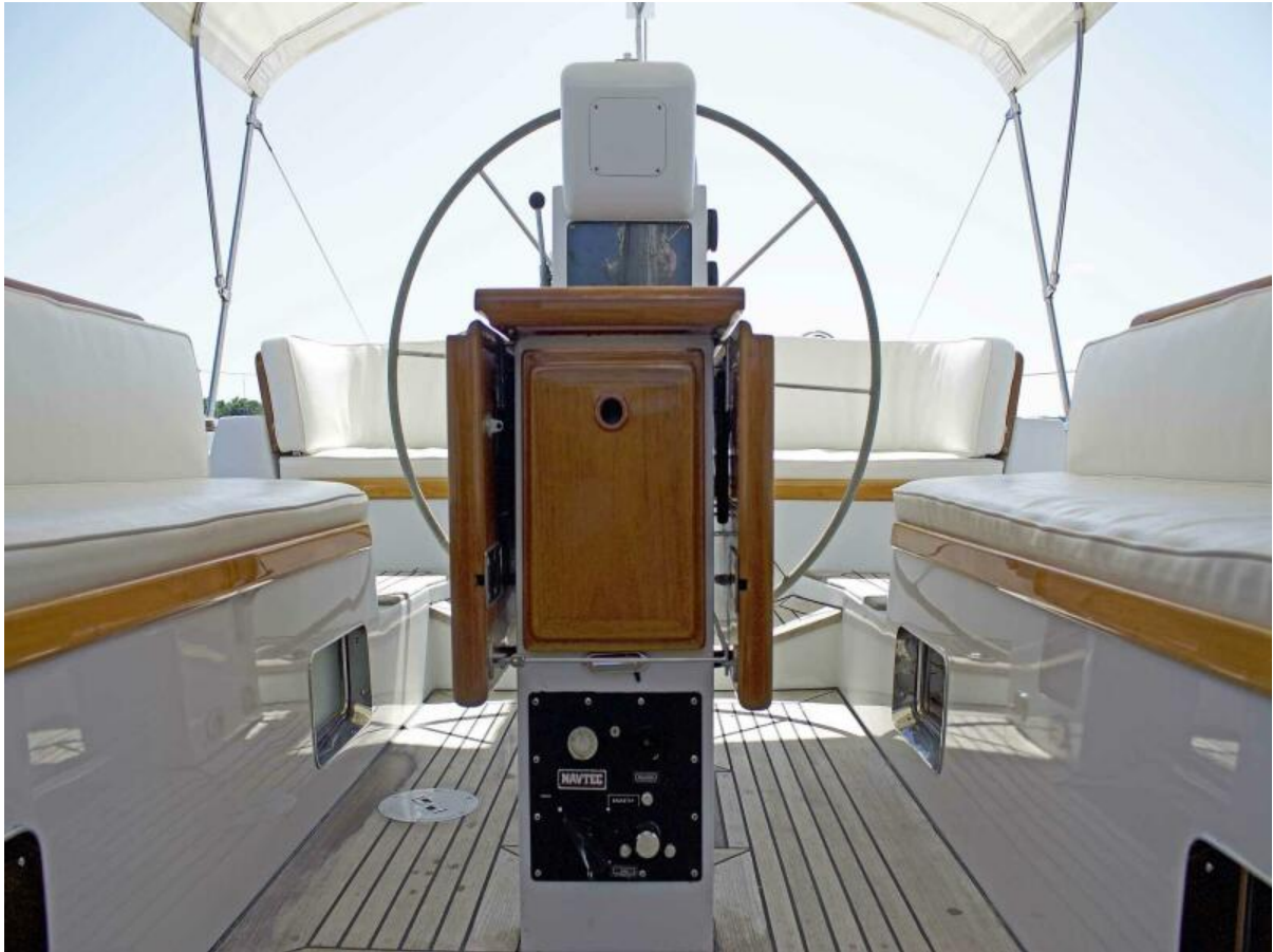
Cockpit Looking Aft