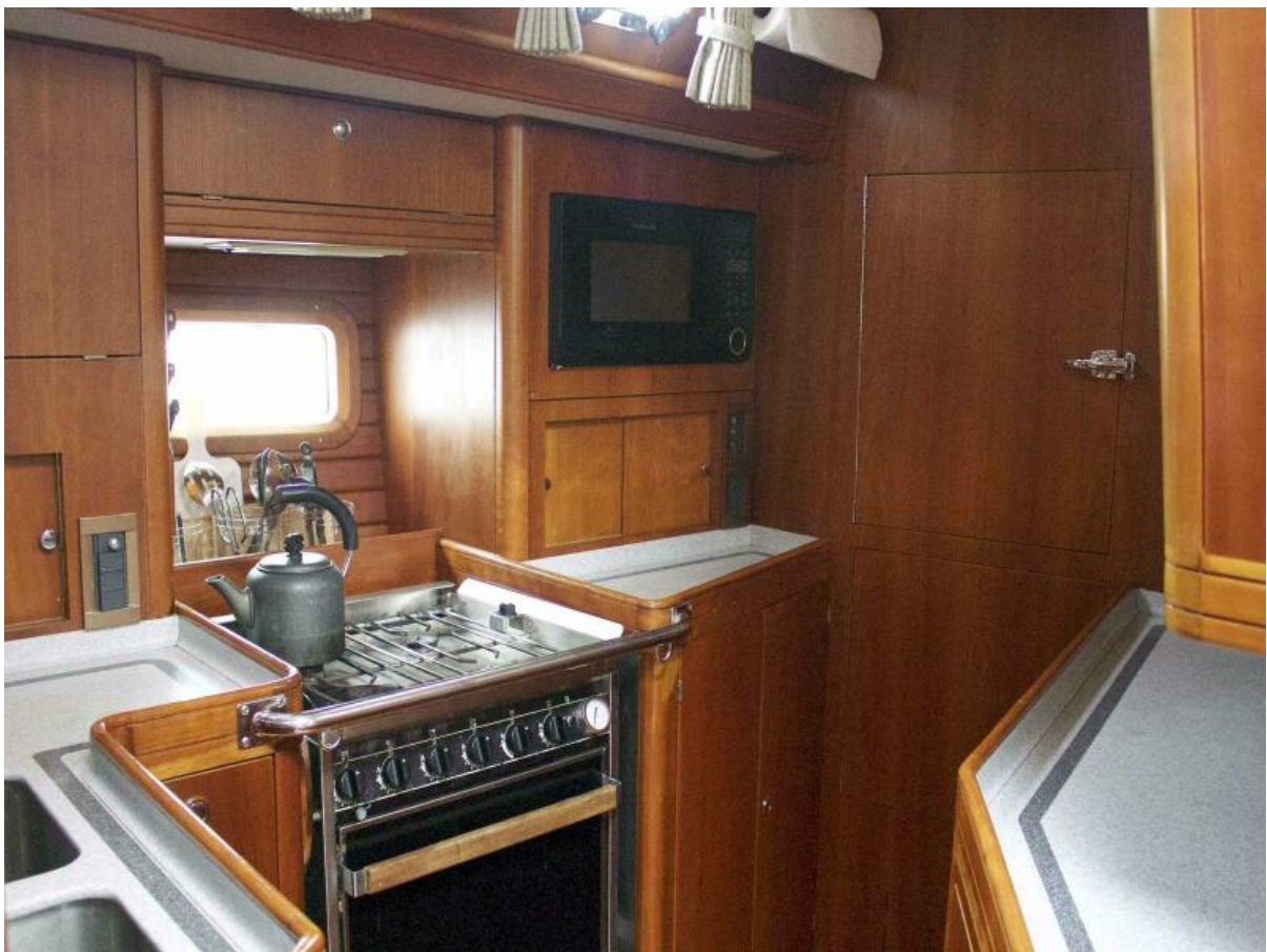
Galley Looking Aft