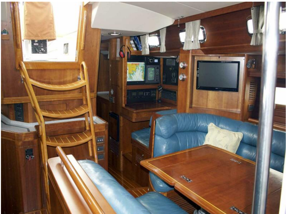
Salon Aft Nav Area