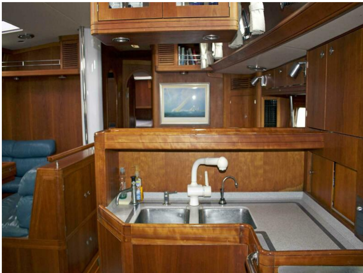
Galley Looking Fwd