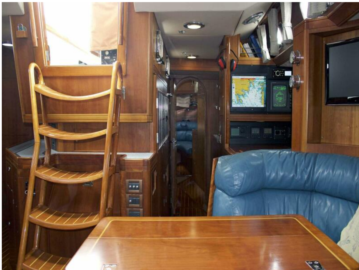
Port Passageway Aft