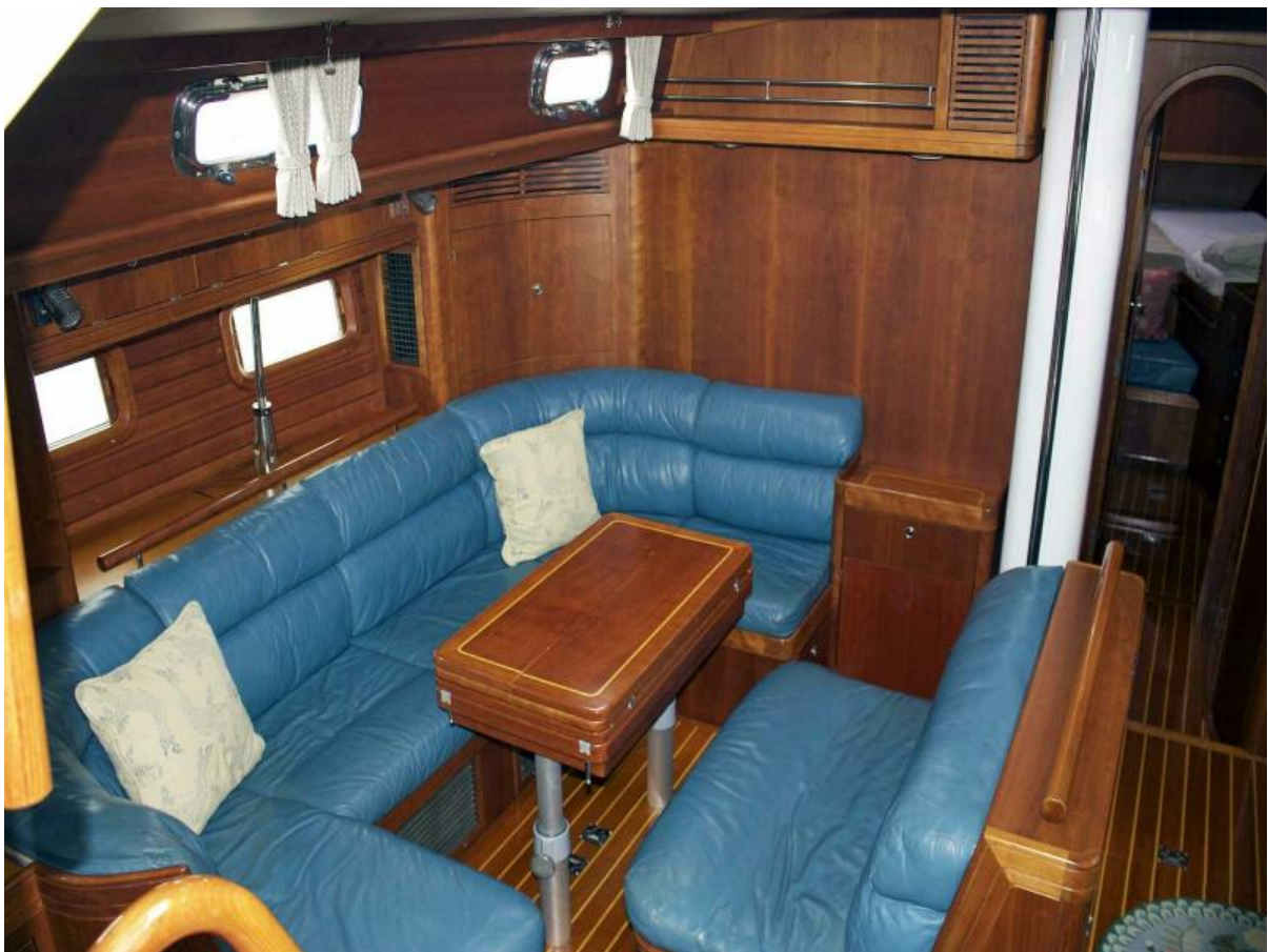
Salon Table Folded