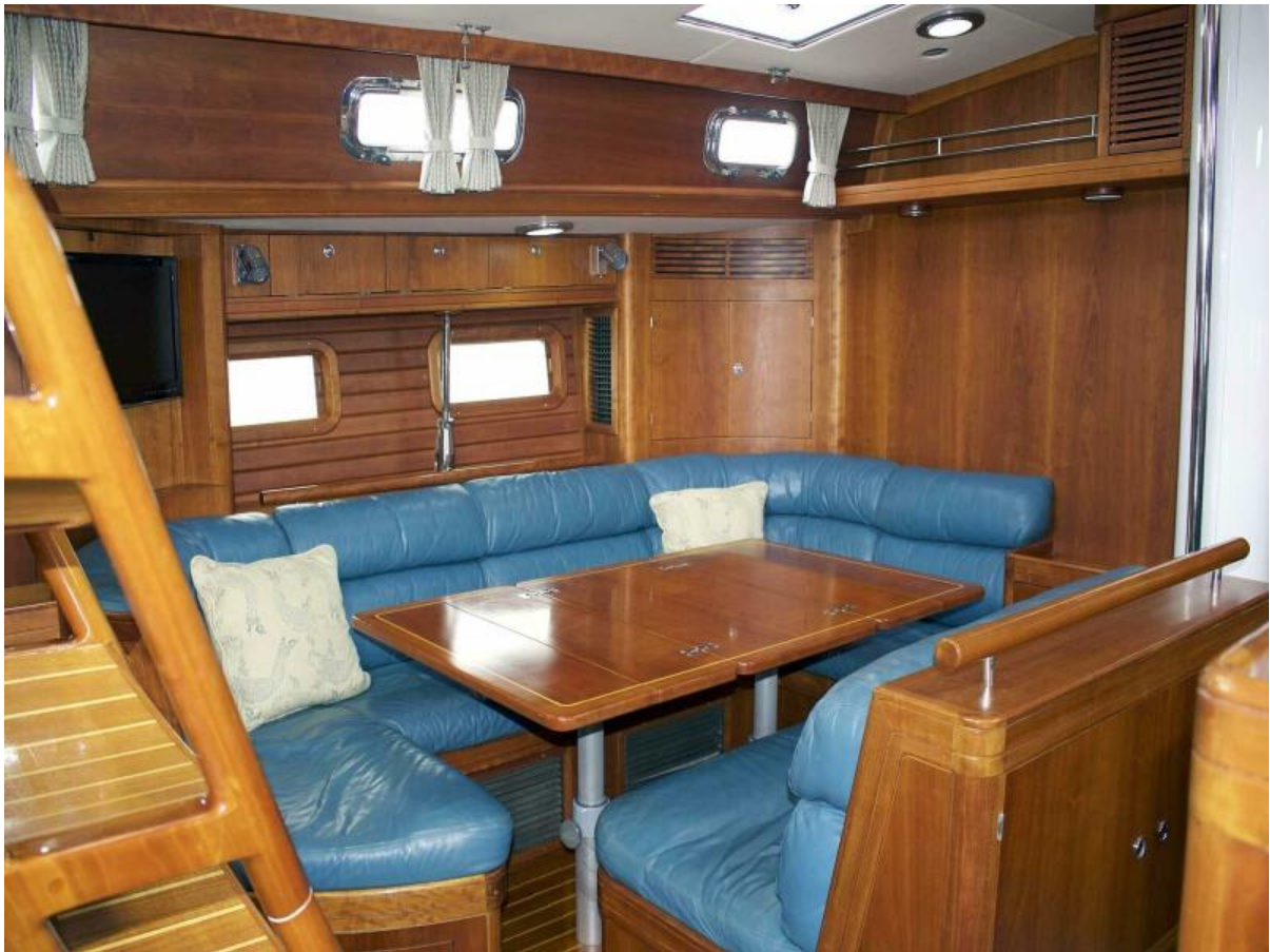
Salon Table Extended