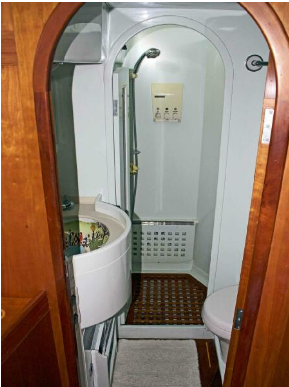
Owner Stateroom Head and Shower