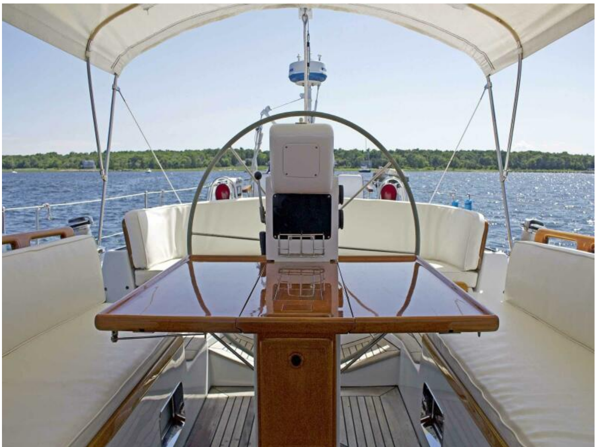
Cockpit Looking Aft Table Extended