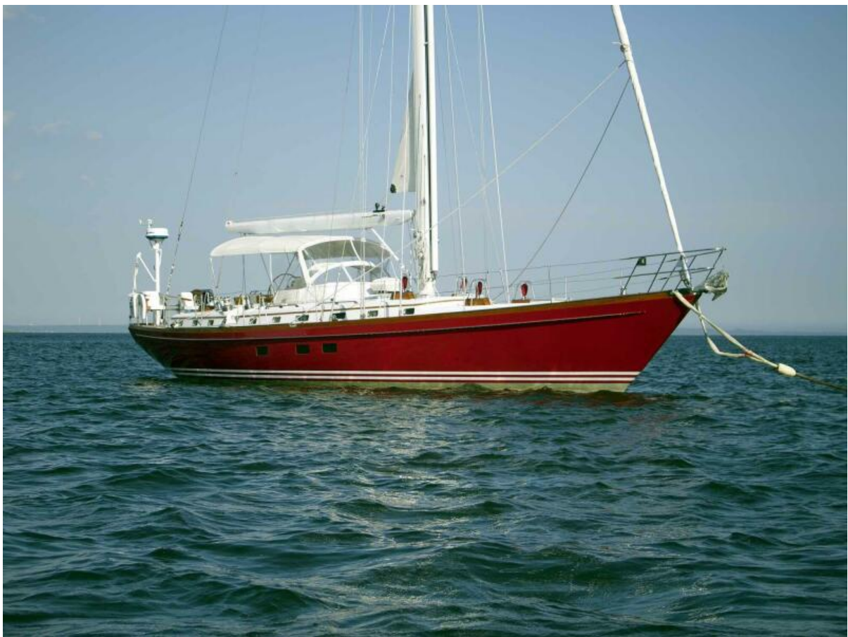
Stbd Profile Fwd