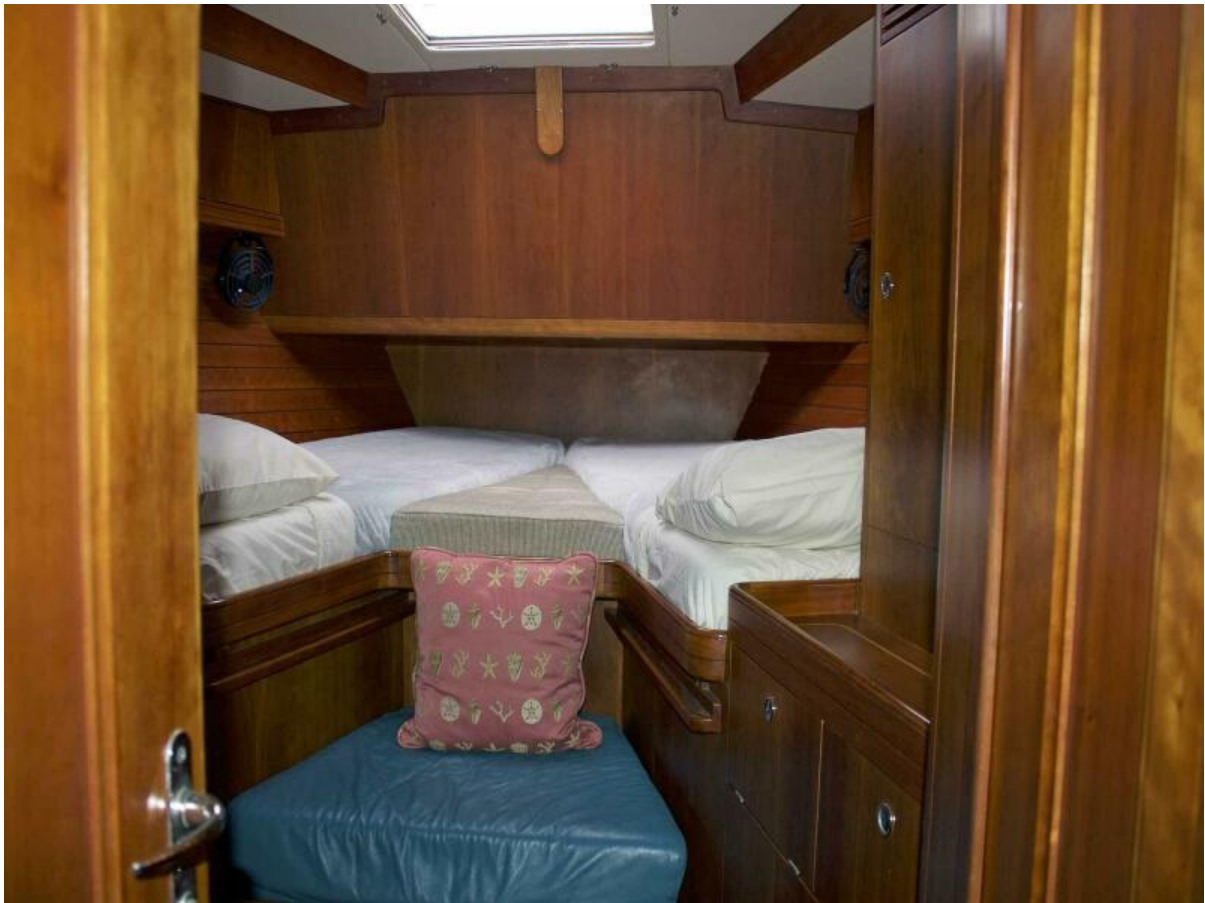
Fwd Guest Stateroom V-berth