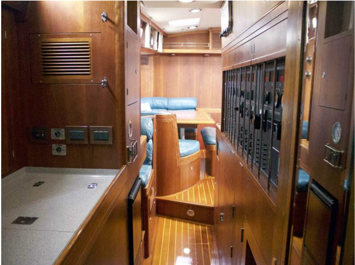
Port Passageway Fwd