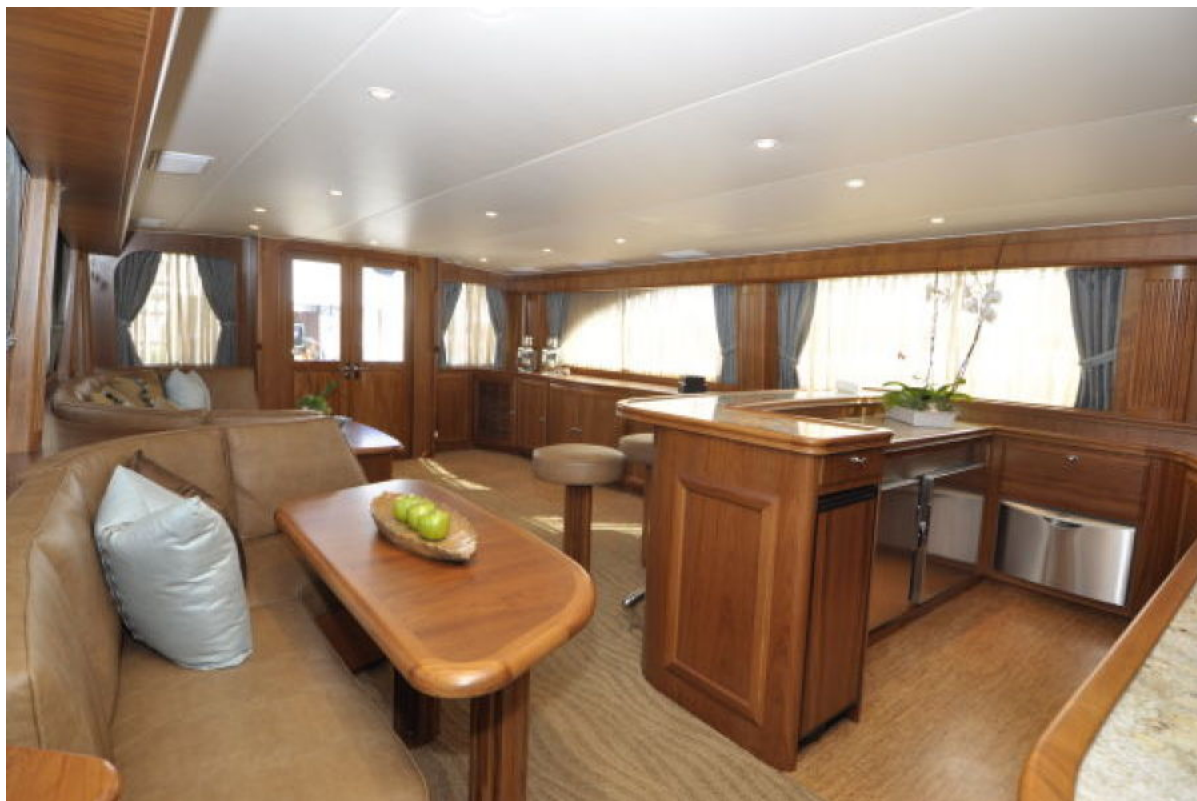
Aft Salon Aft Salon