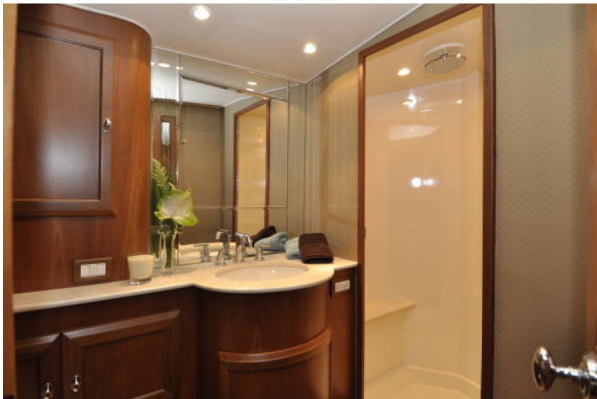
Master Bath Master Bath