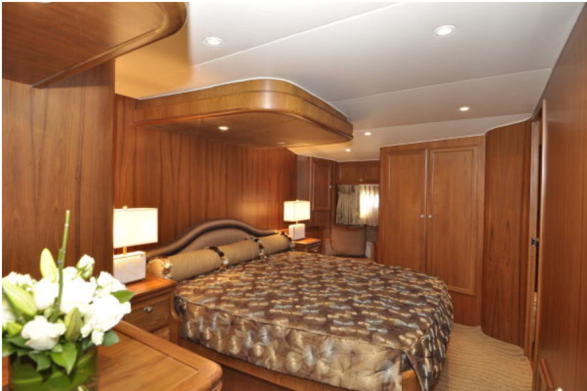
Master Stateroom Master Stateroom