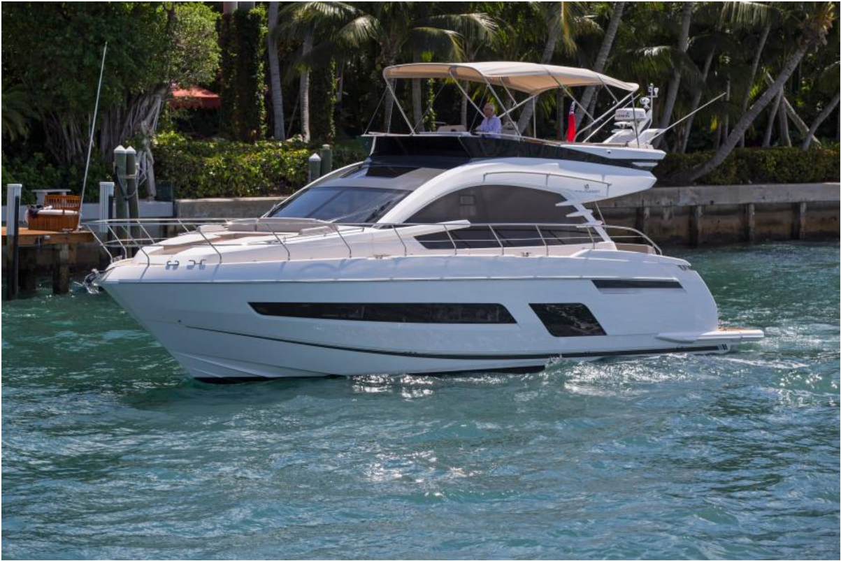
Fairline Squadron 53