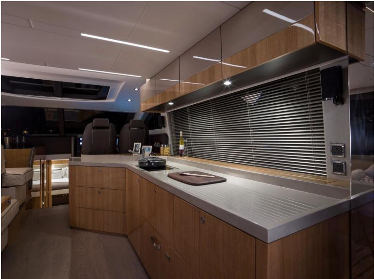
Fairline Squadron 53 Galley