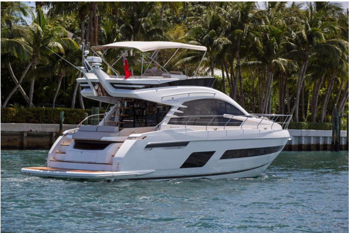
Fairline Squadron 53 Stern