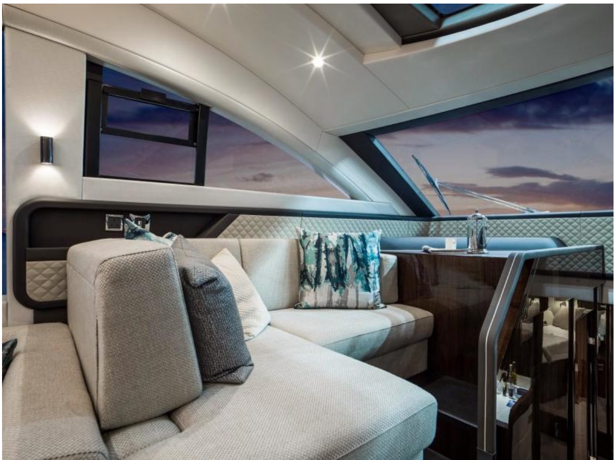
Manufacturer Provided Image: Manufacturer Provided Image: Fairline Squadron 53 Saloon