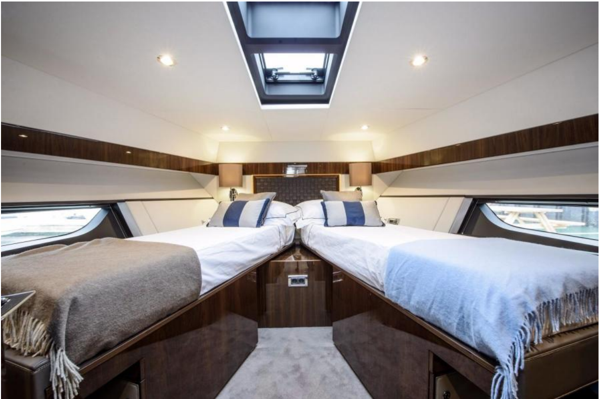
Manufacturer Provided Image: Manufacturer Provided Image: Fairline Squadron 53 Twin Cabin