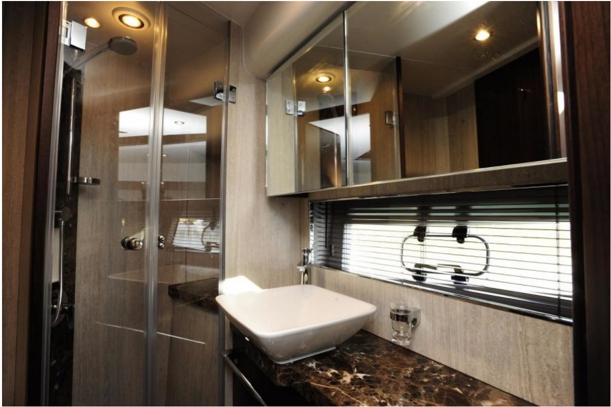
Manufacturer Provided Image: Manufacturer Provided Image: Fairline Squadron 53 Heads