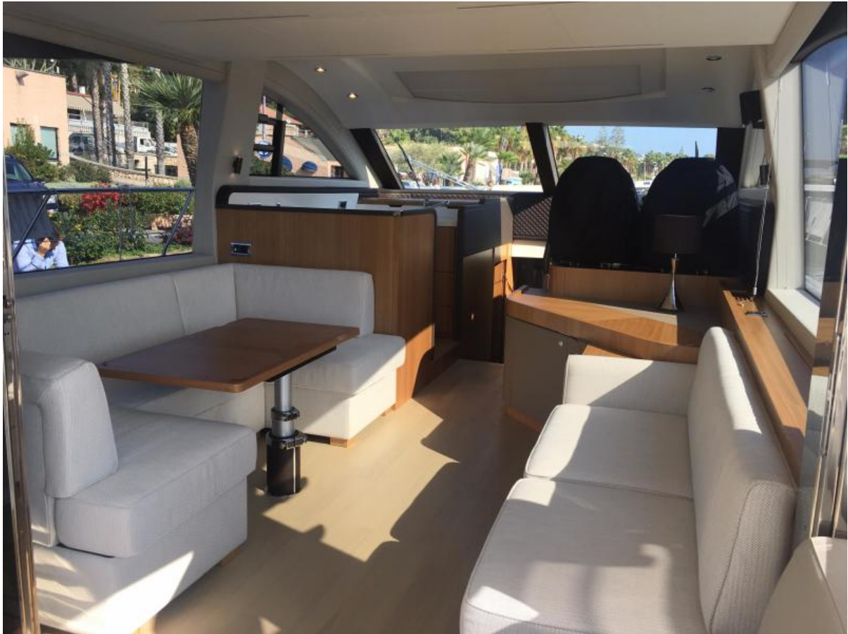
Manufacturer Provided Image: Manufacturer Provided Image: Fairline Squadron 53 Interior