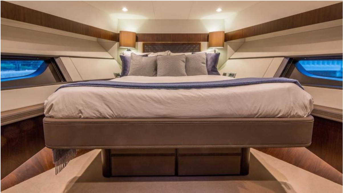
Manufacturer Provided Image: Manufacturer Provided Image: Fairline Squadron 53 Cabin