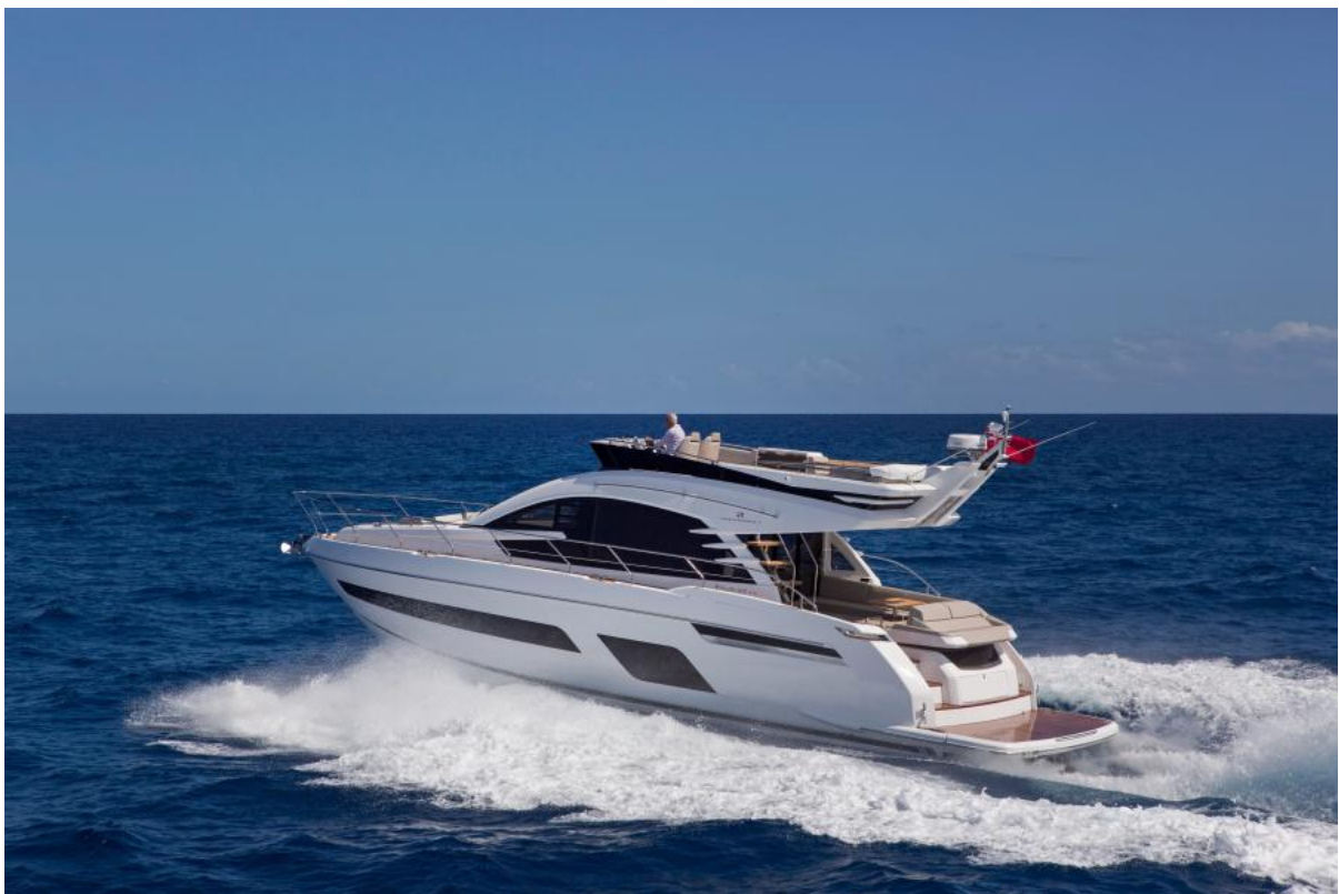
Fairline Squadron 53