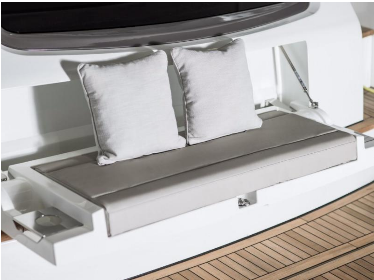
Manufacturer Provided Image: Manufacturer Provided Image: Fairline Squadron 53 Cockpit