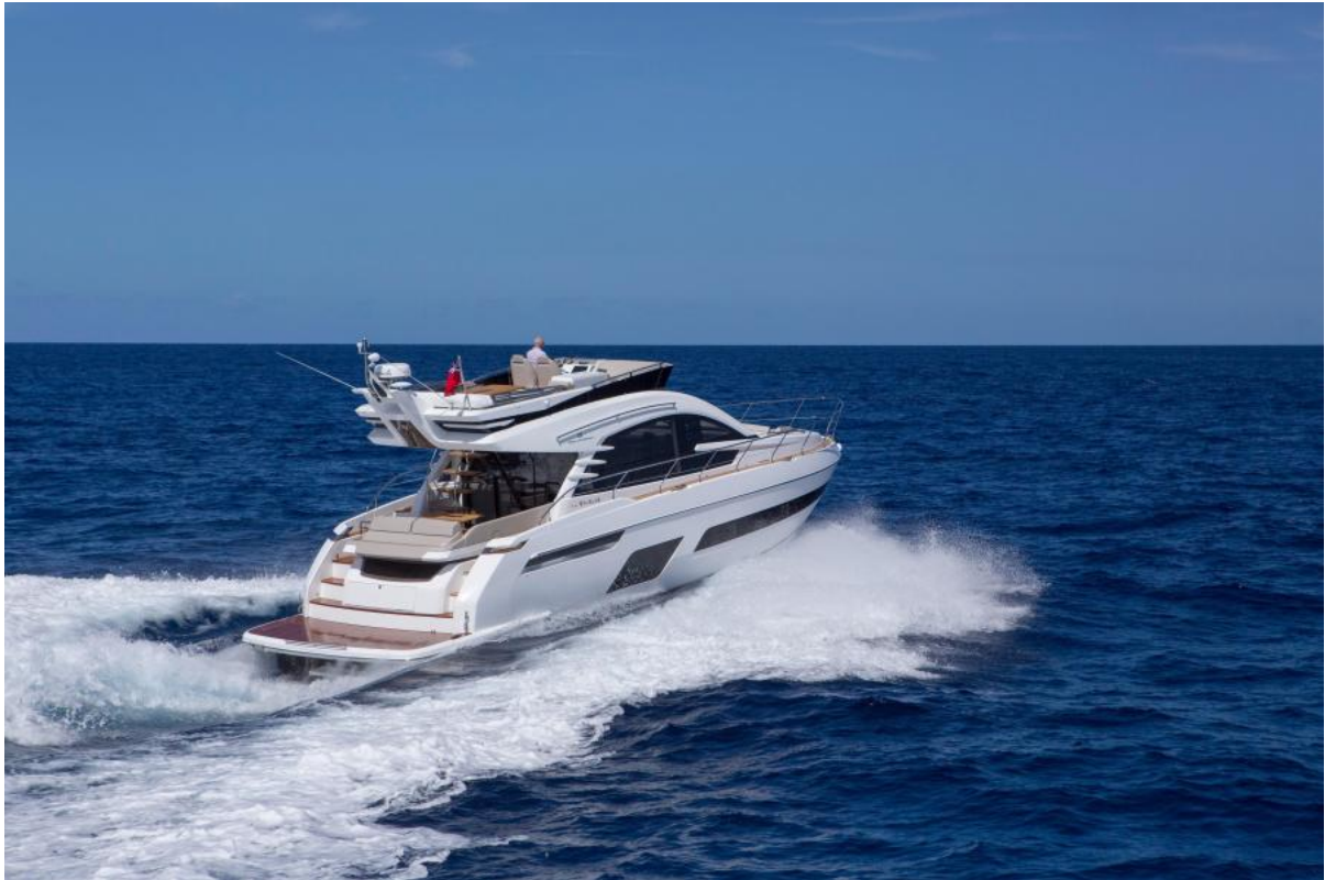
Manufacturer Provided Image: Manufacturer Provided Image: Fairline Squadron 53