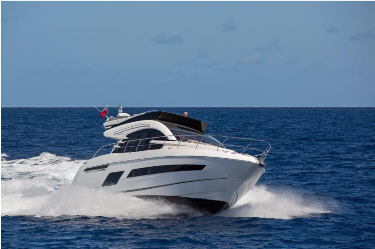
Manufacturer Provided Image: Manufacturer Provided Image: Fairline Squadron 53