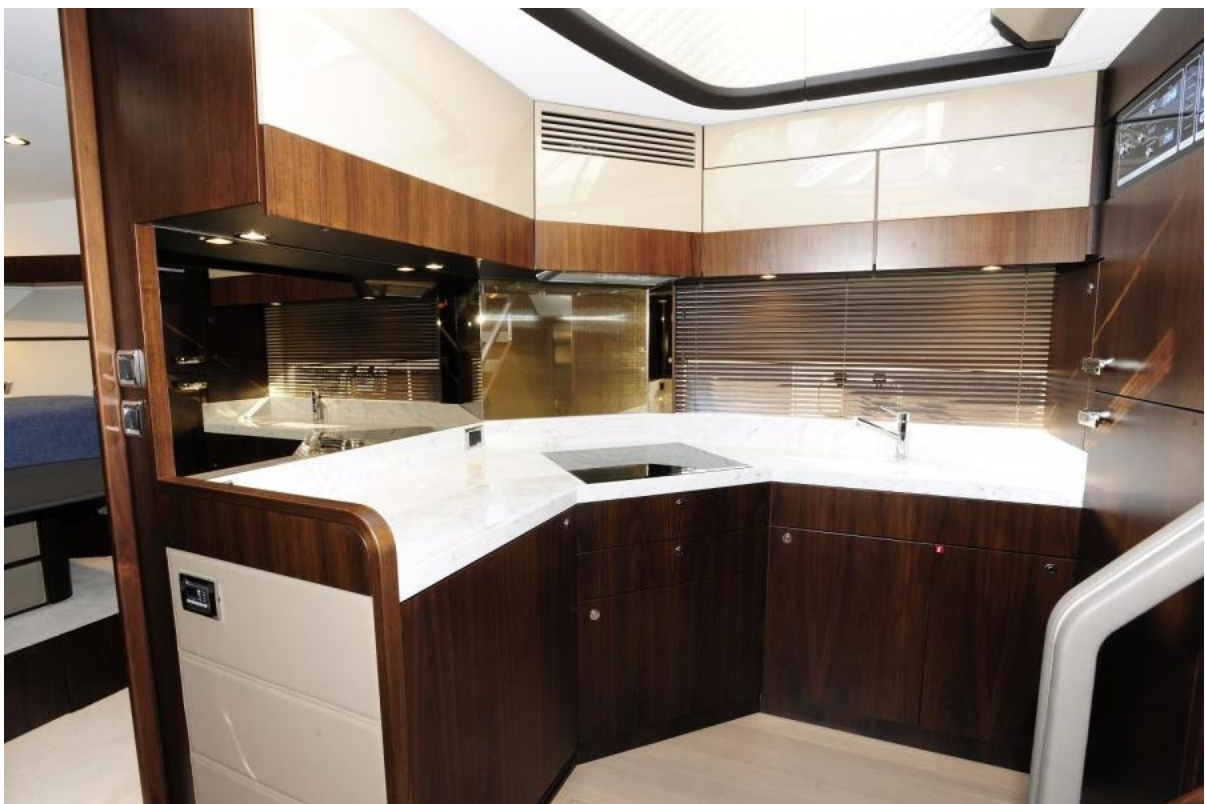
Fairline Squadron 53 Galley