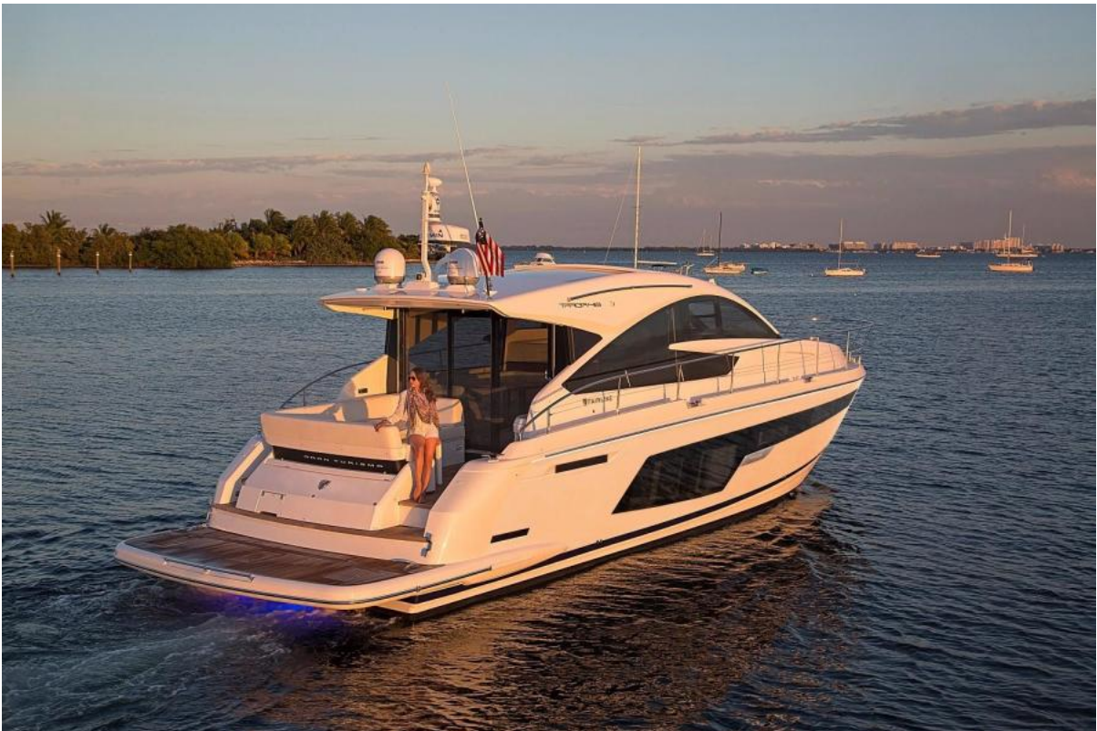
Fairline Targa 48 Gran Turismo Stern