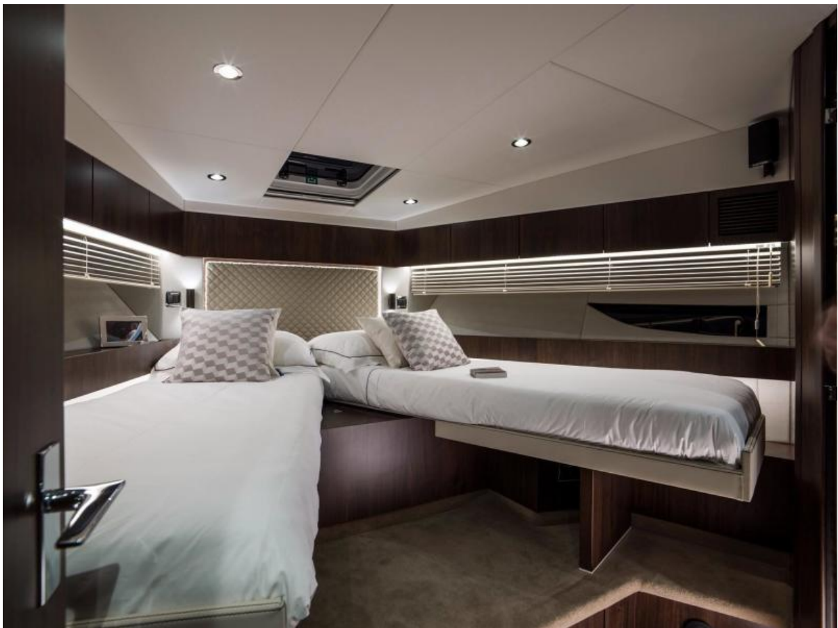
Fairline Targa 48 Gran Turismo Cabin