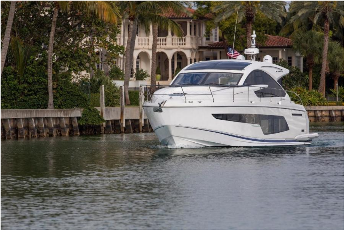
Fairline Targa 48 Gran Turismo