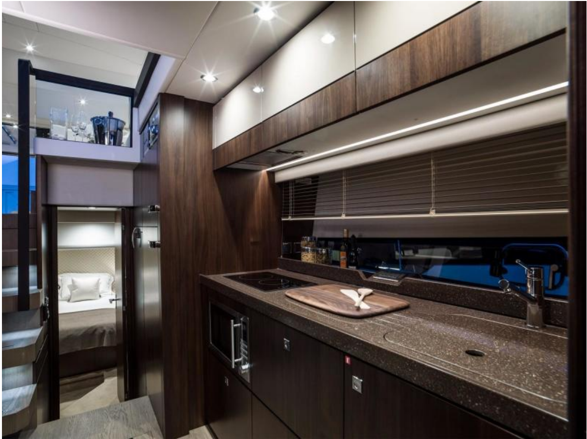
Manufacturer Provided Image: Fairline Targa 48 Gran Turismo Galley