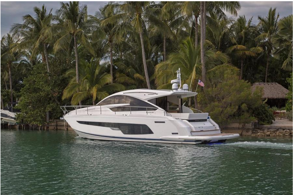
Fairline Targa 48 Gran Turismo