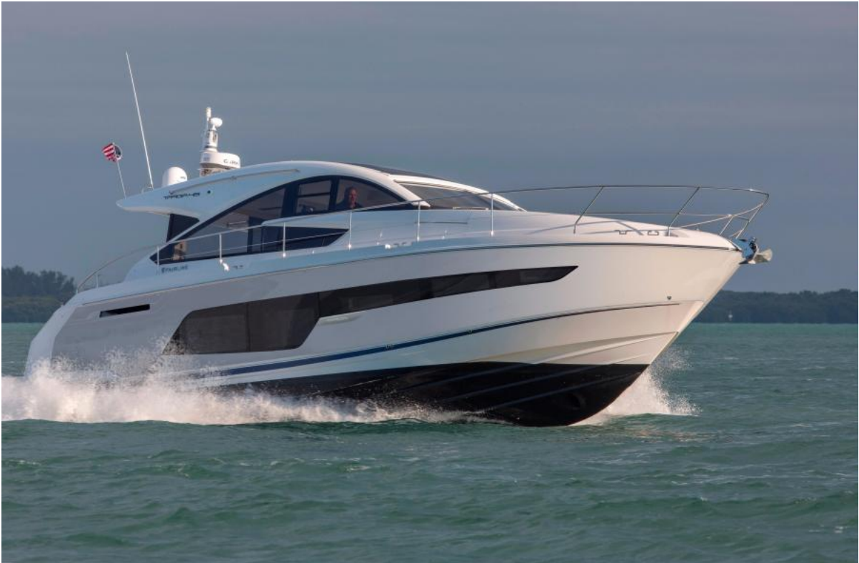
Fairline Targa 48 Gran Turismo