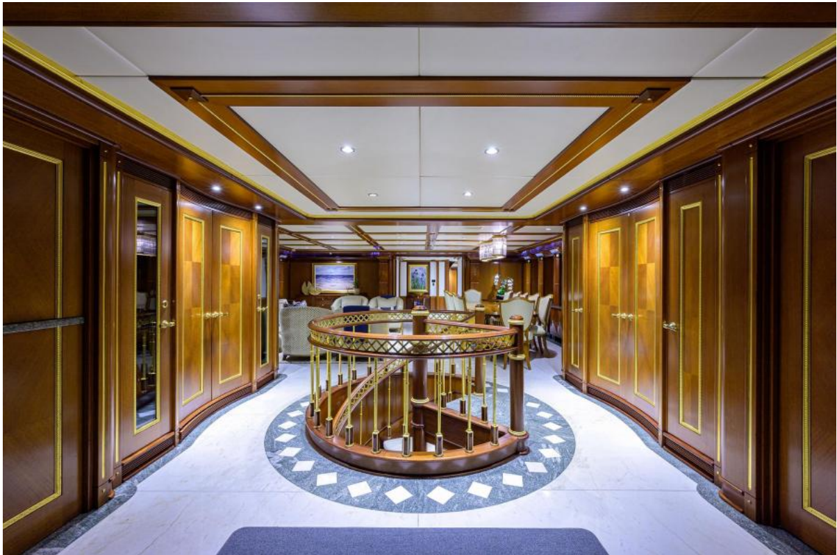
Main Deck Foyer