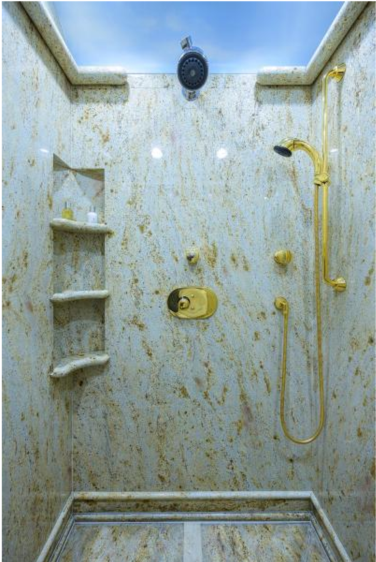
Owner Ensuite Shower