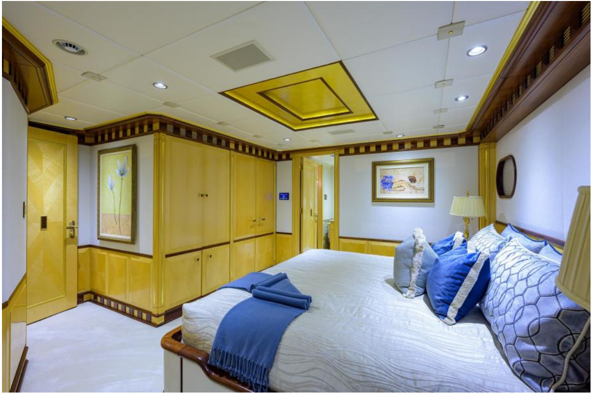
VIP Stateroom 3