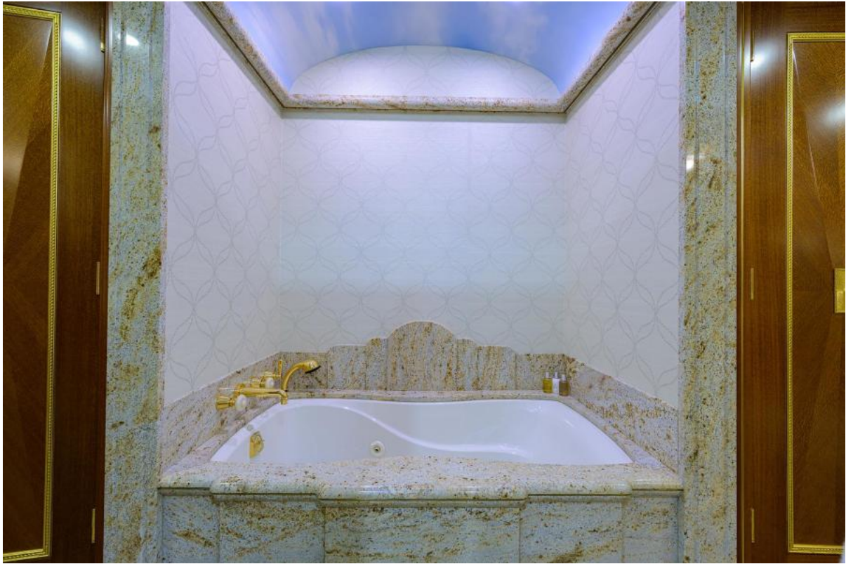
Owner Ensuite Bath