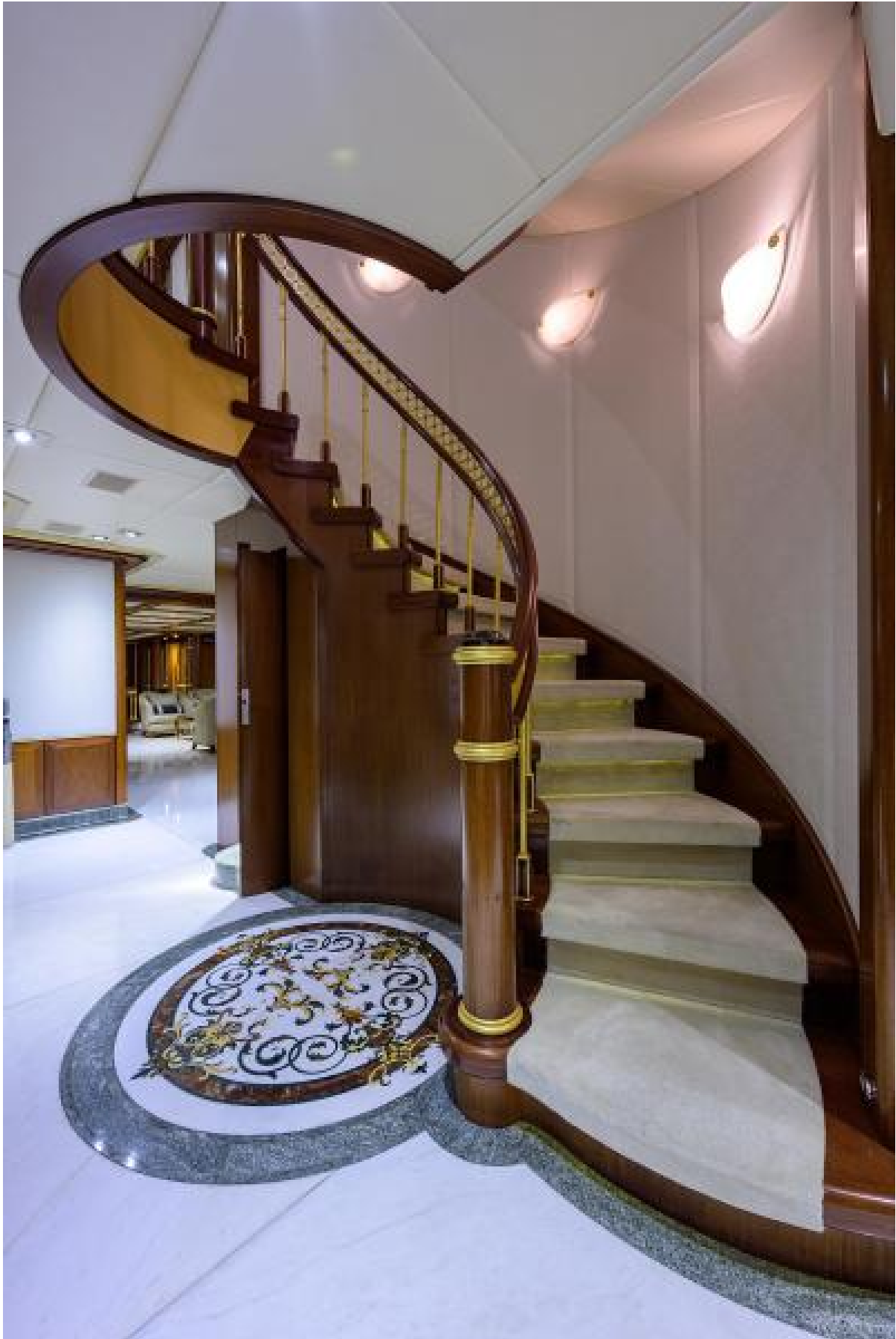
Main Deck Starboard Foyer