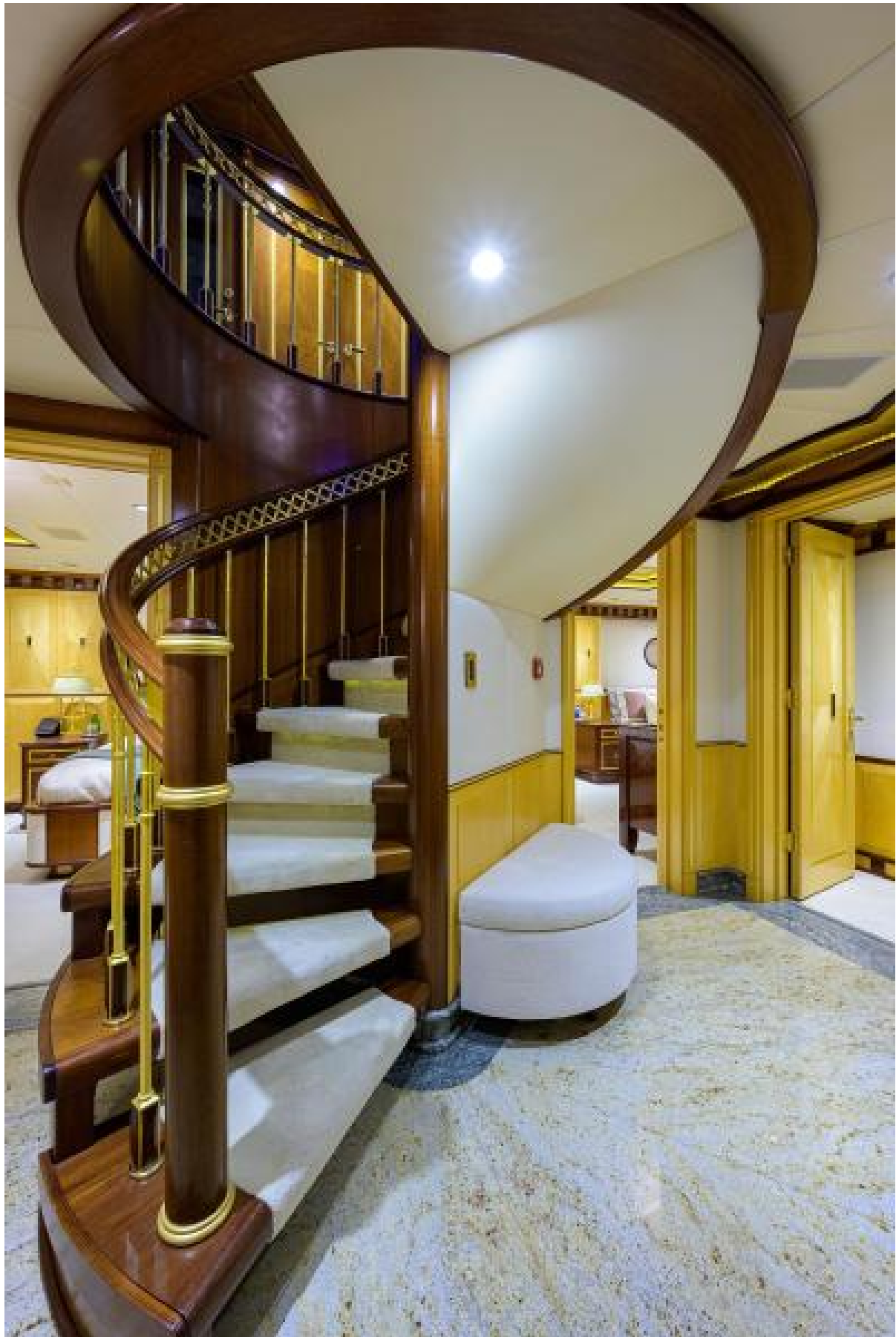
Lower Deck Foyer