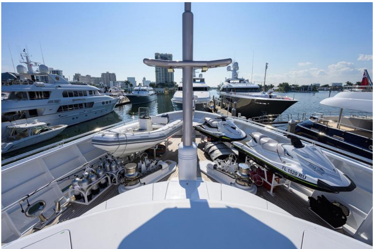
Foredeck Toy Storage