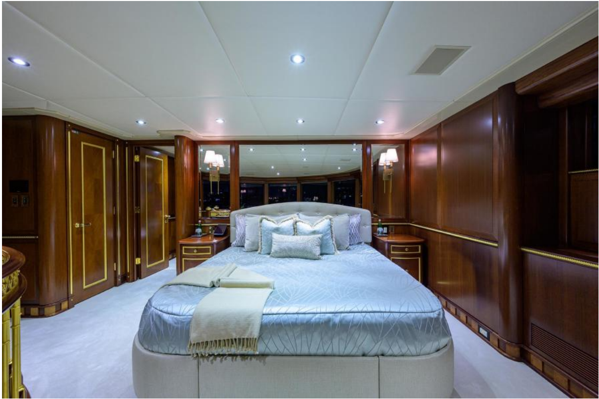
VIP Stateroom (Upper Deck)