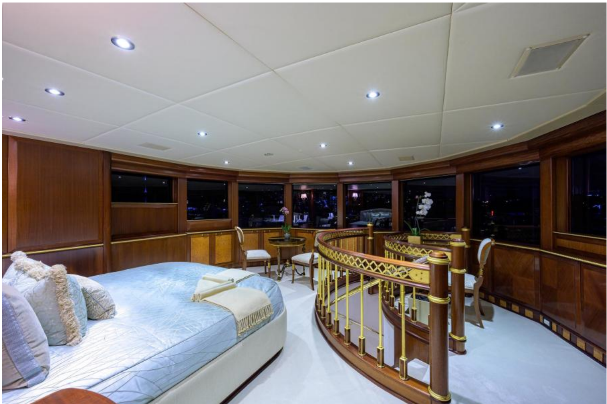
VIP Stateroom (Upper Deck)