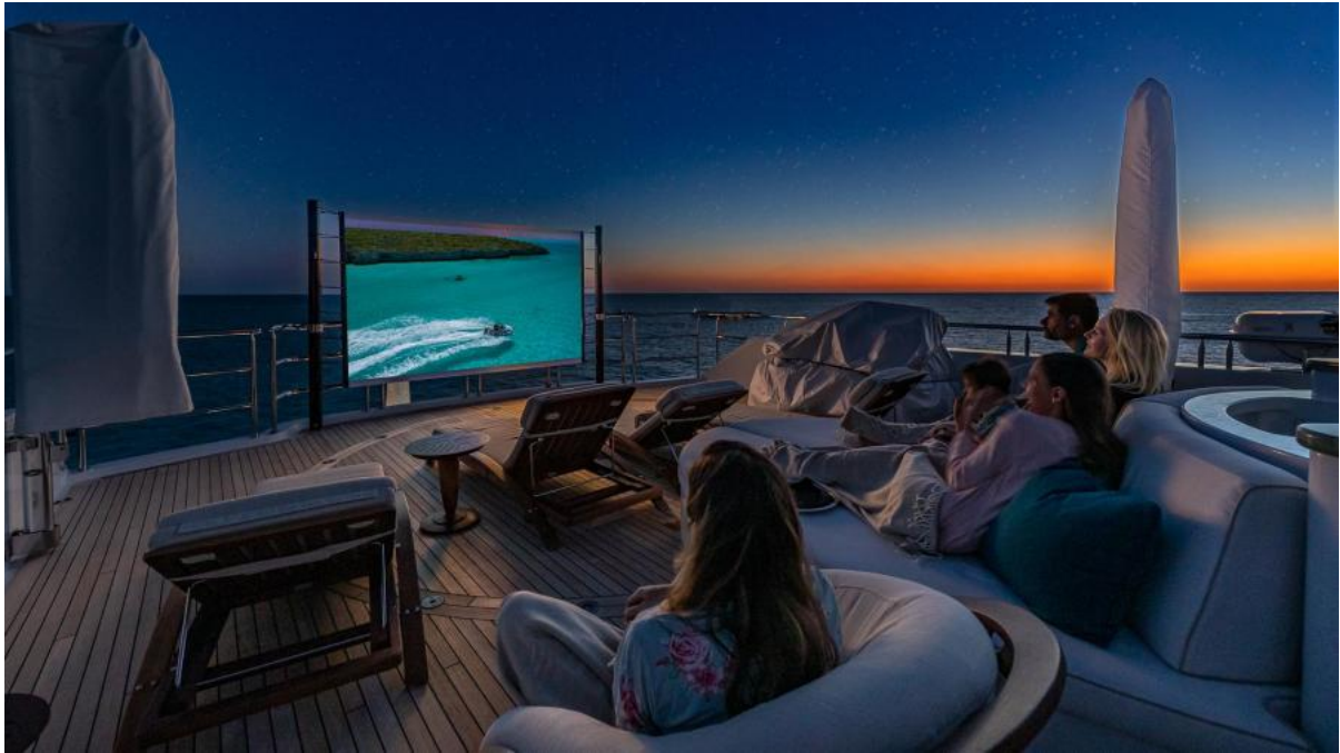
Open Air Cinema