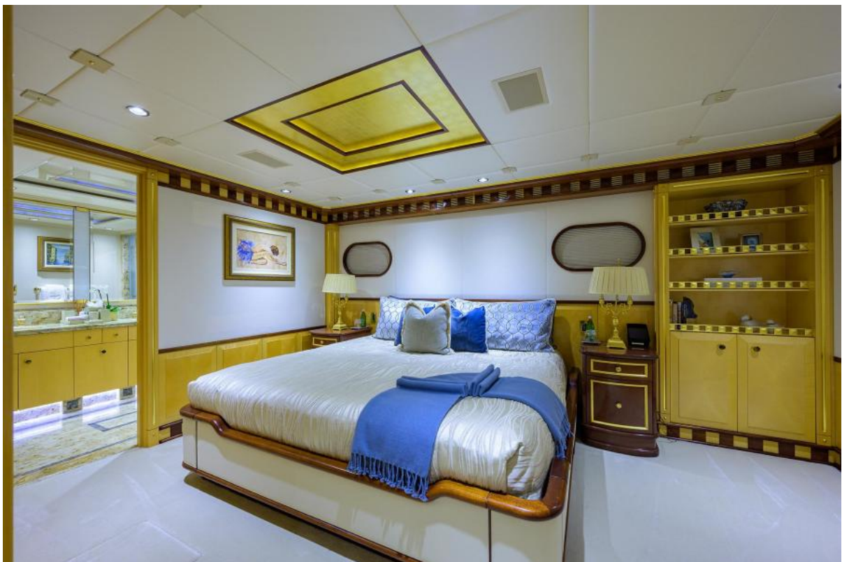
VIP Stateroom 3