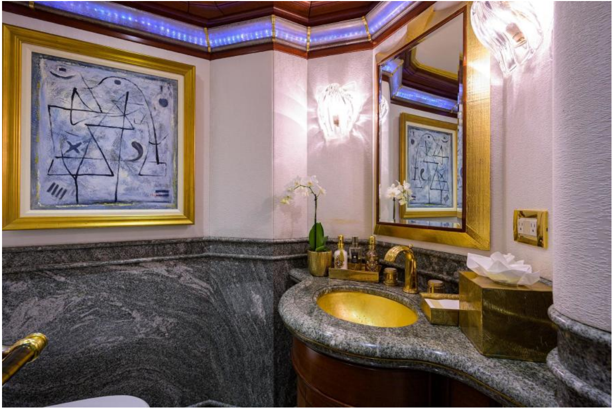
Bridge Deck Day Head