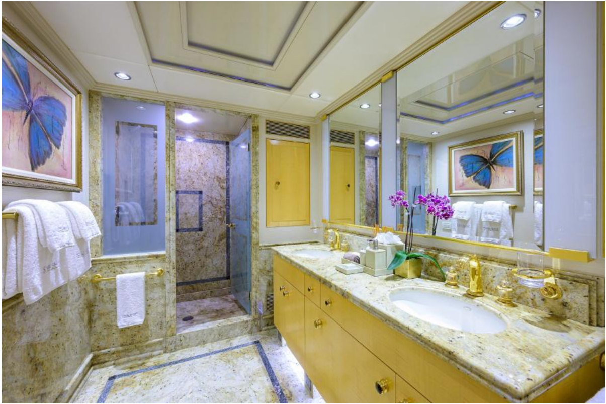
Guest Stateroom Ensuite