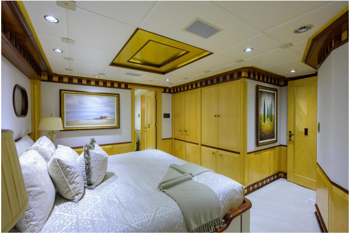
VIP Stateroom 2