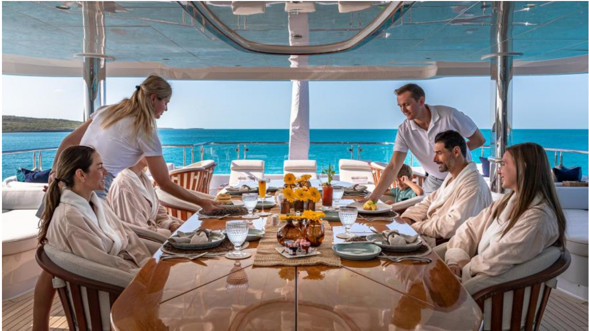
Bridge Deck Dining