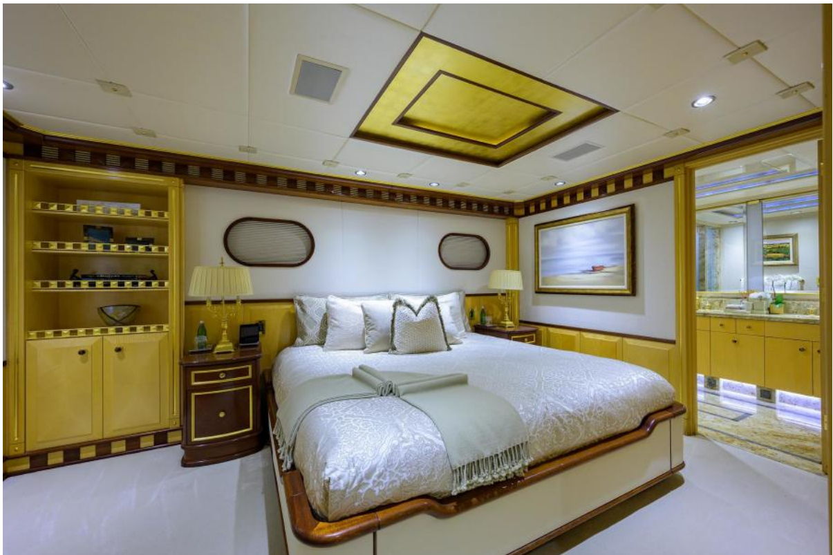
VIP Stateroom 2