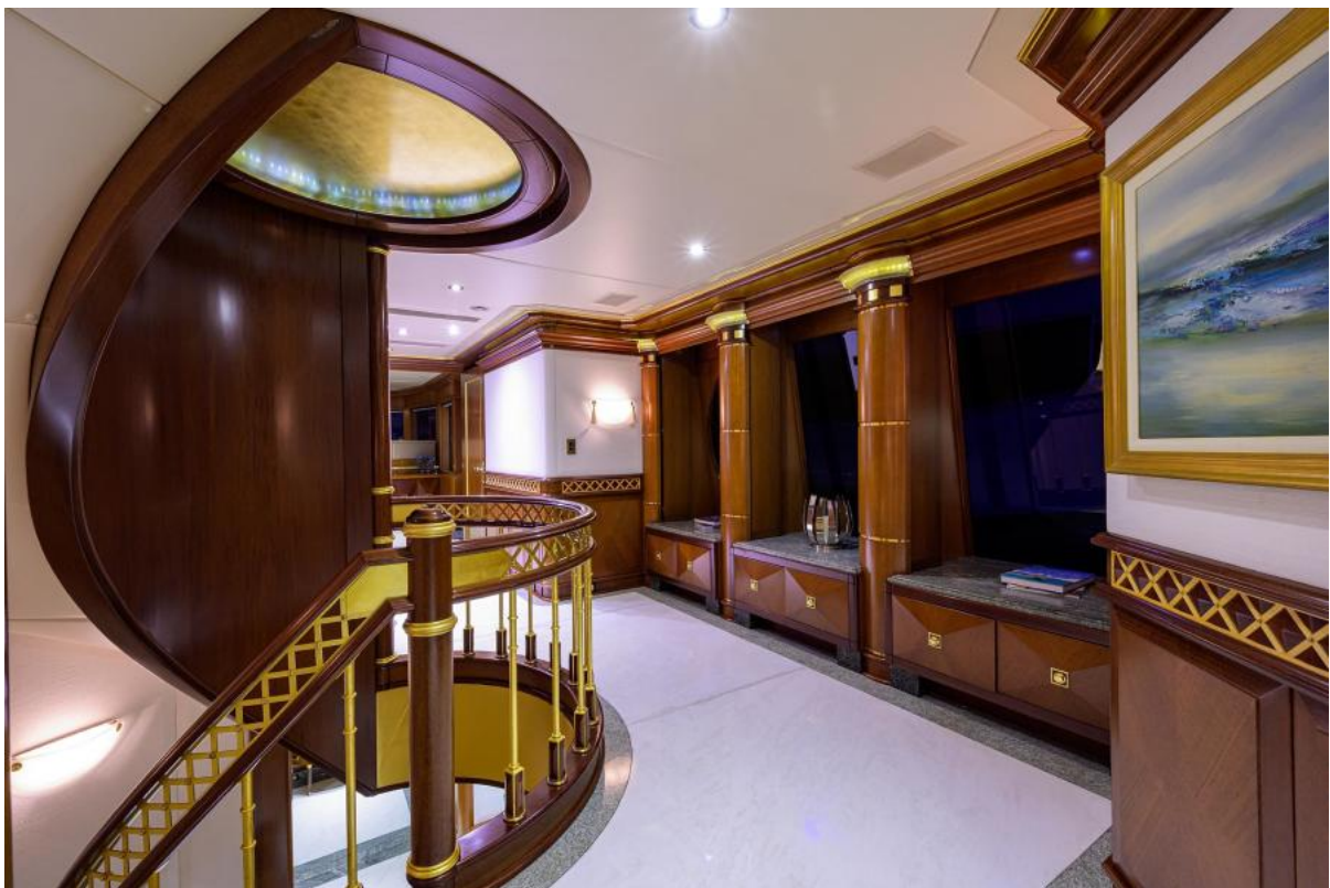
Bridge Deck Foyer