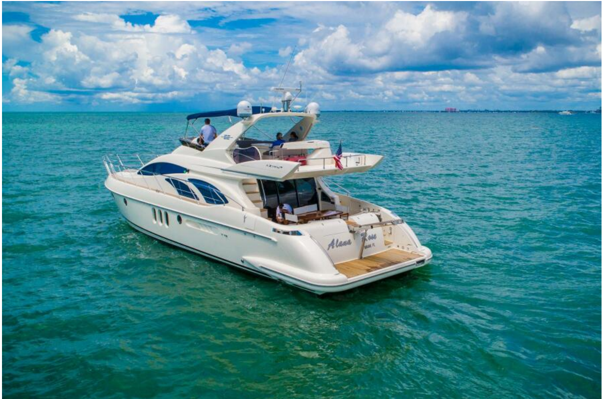
Port Stern Profile