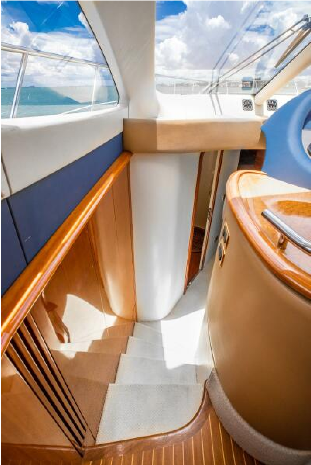
Stairway to Lower Deck