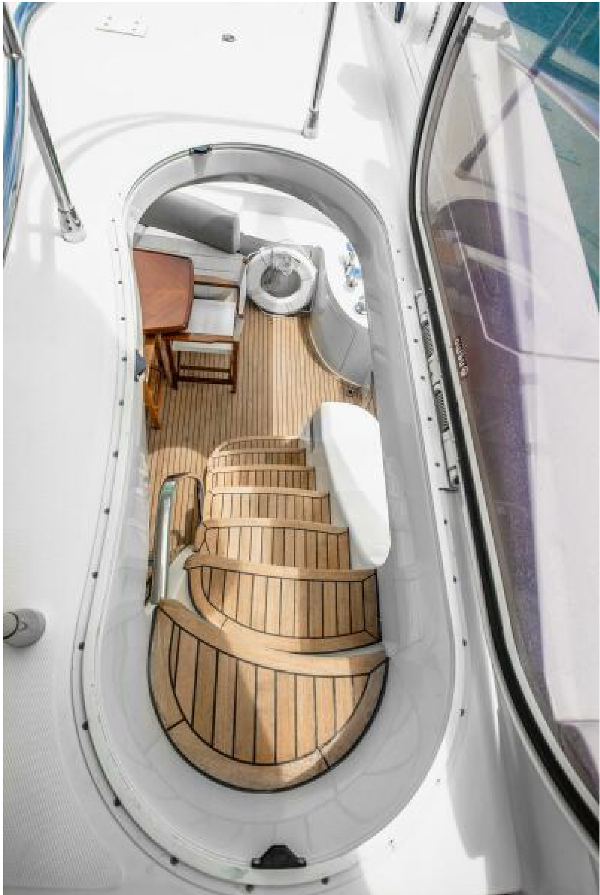
Stairway to Flybridge