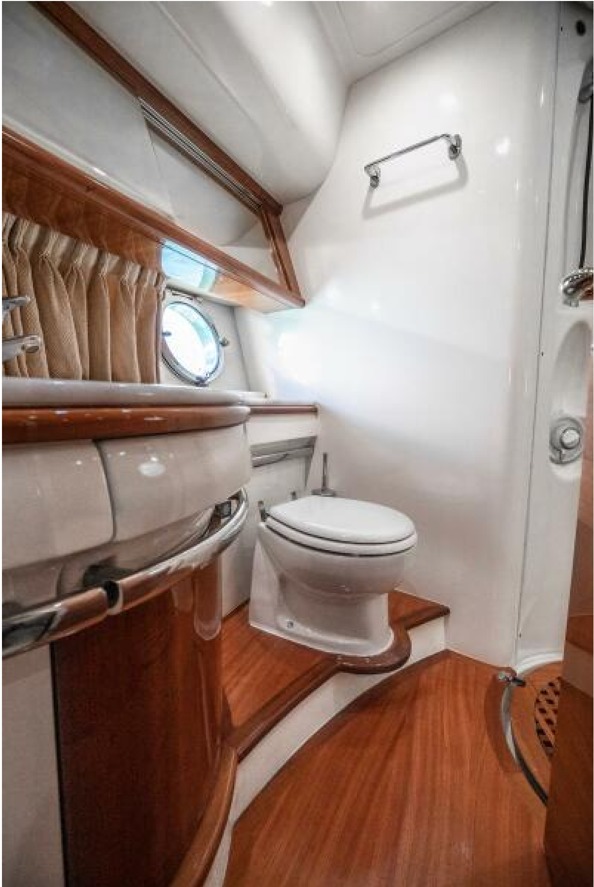
Forward VIP Ensuite