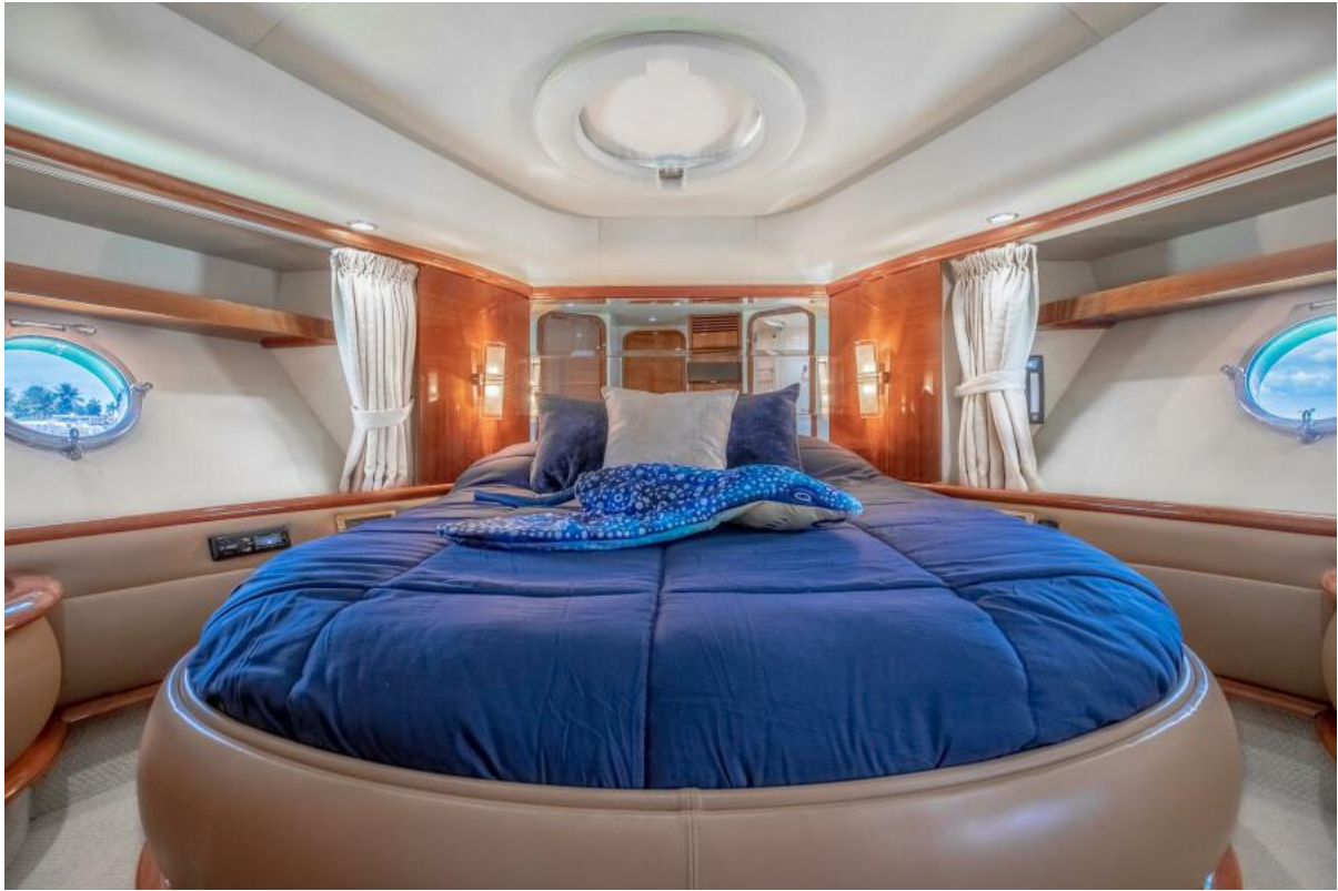
Forward VIP Stateroom