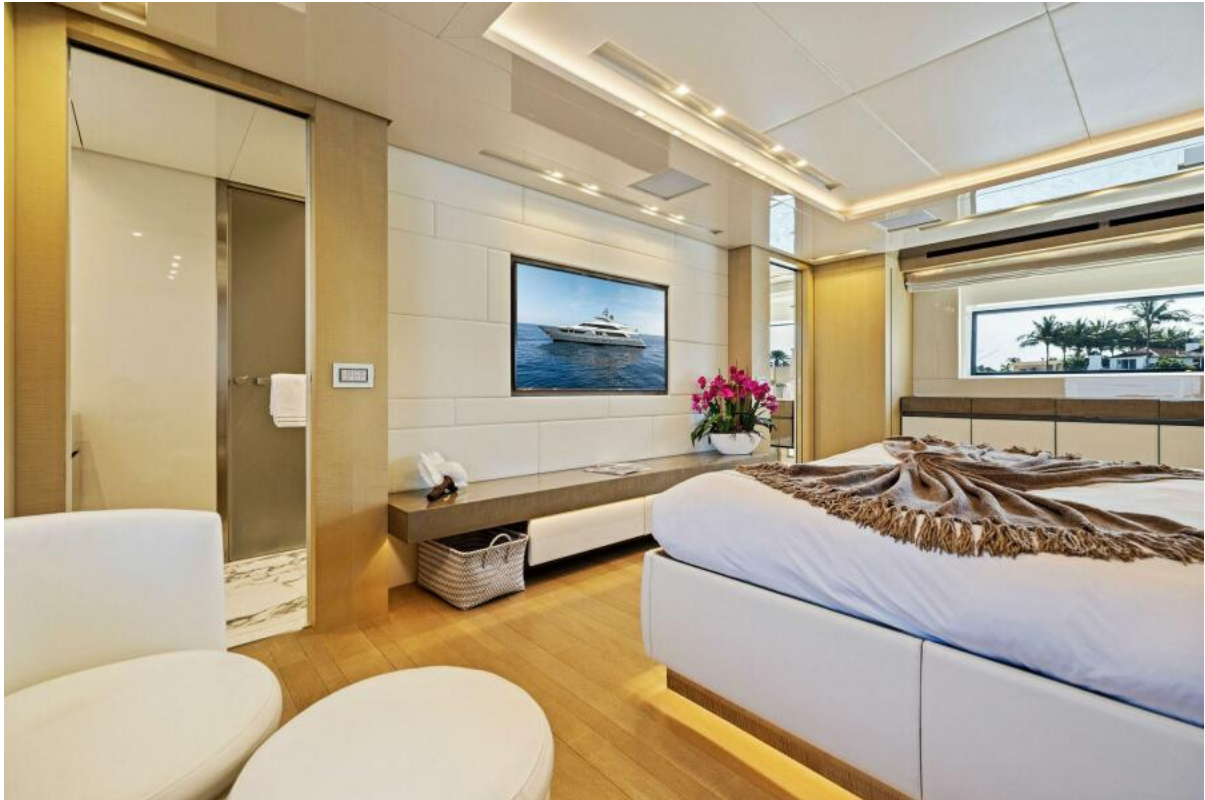
On Deck Primary