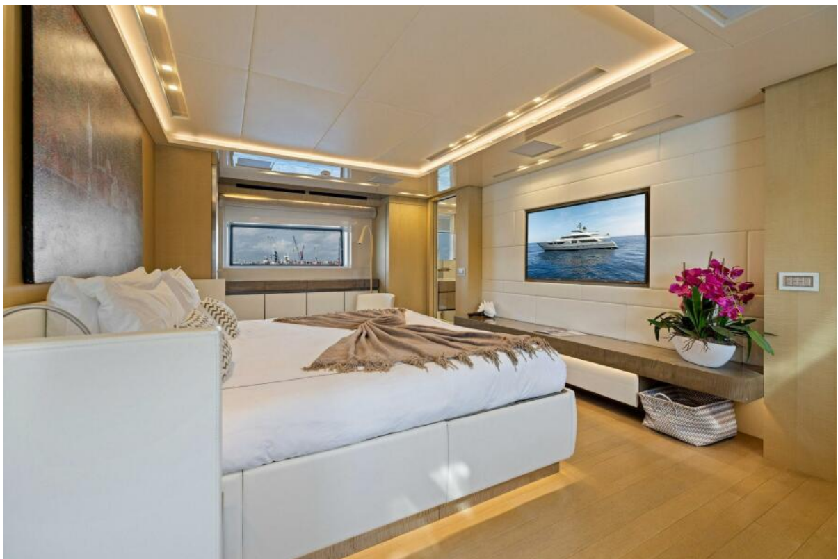
On Deck Primary