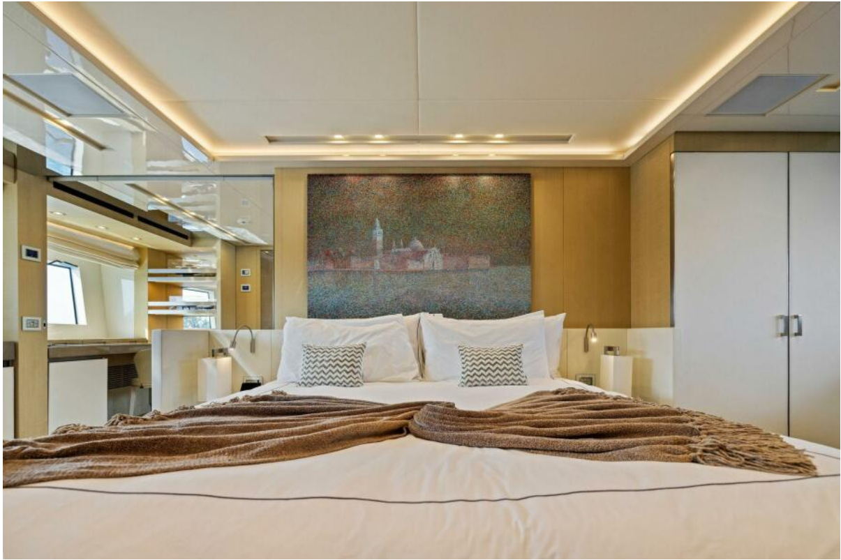
On Deck Primary