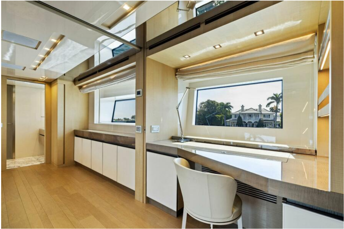
On Deck Primary