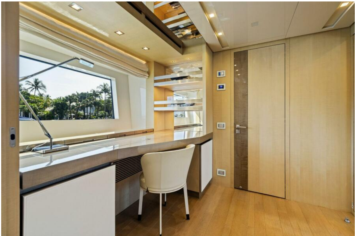
On Deck Primary