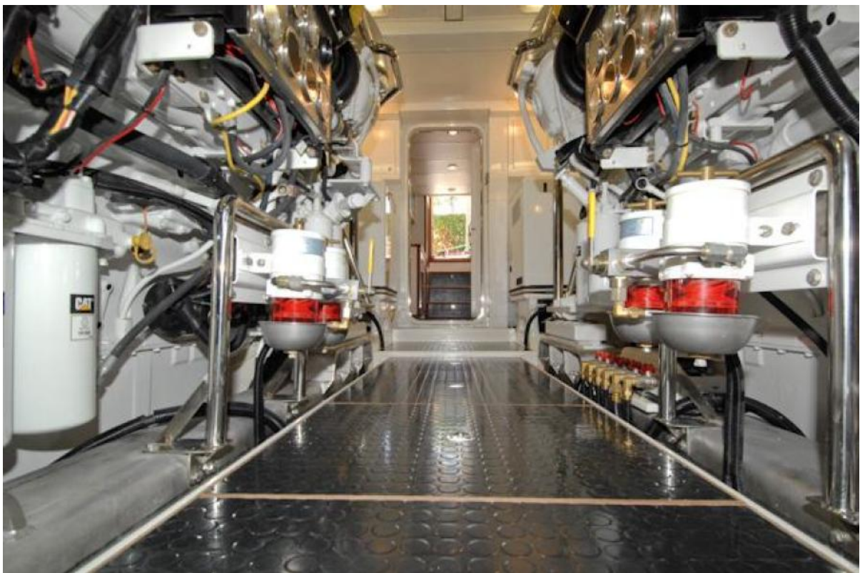
Engine Room Engine Room