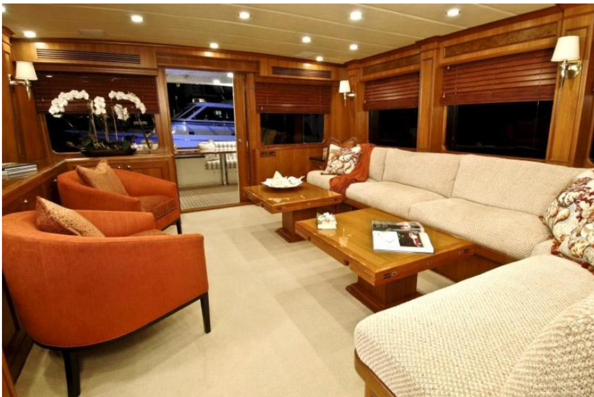
Salon Looking Aft Salon Looking Aft