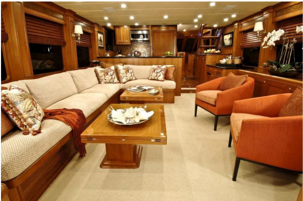
Salon Looking Forward Salon Looking Forward