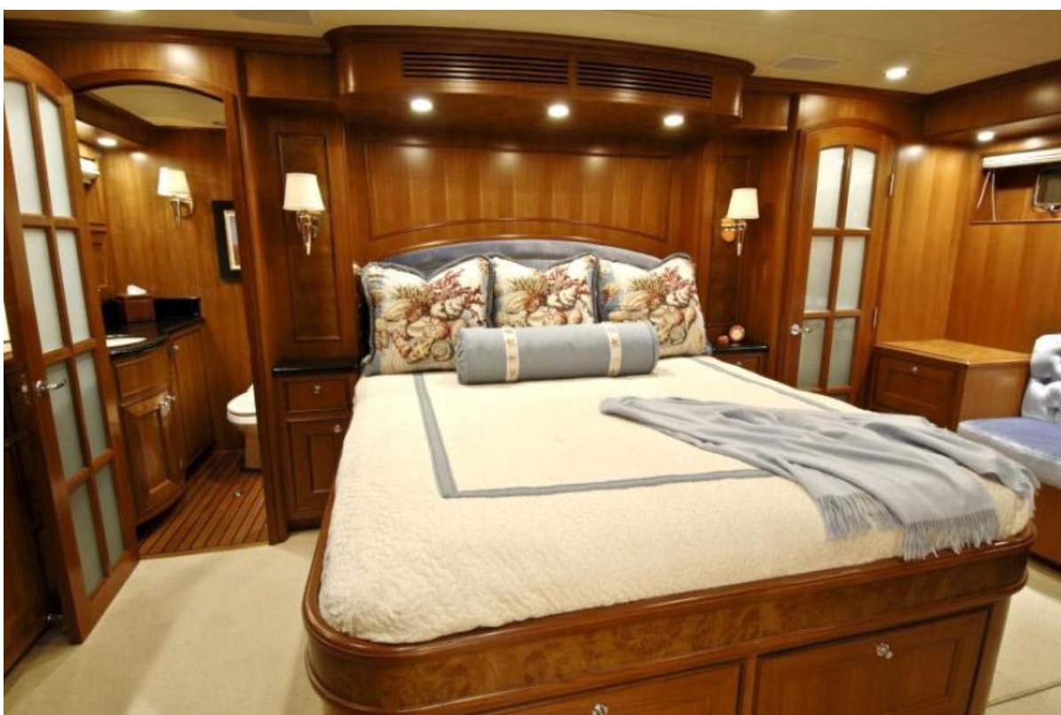
Master Stateroom Master Stateroom