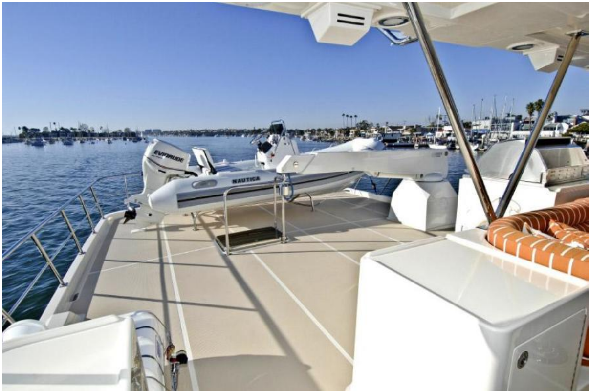
Boat Deck Boat Deck