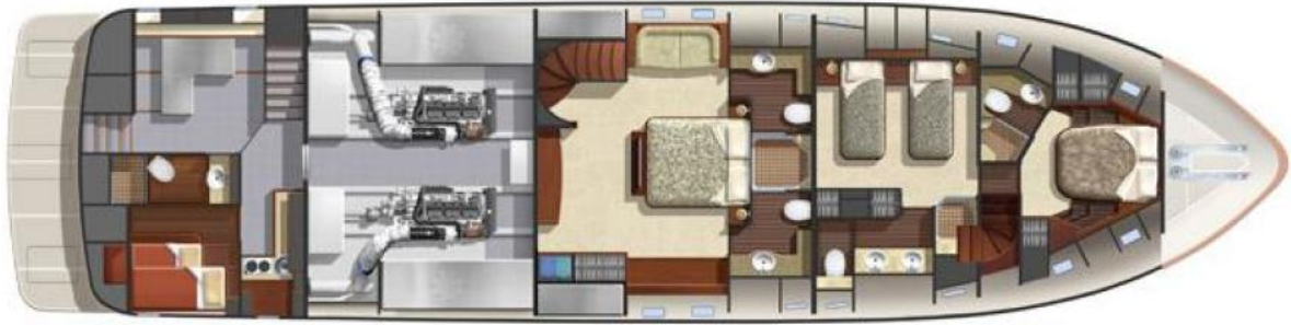
87 Standard Lower Deck 87 Standard Lower Deck