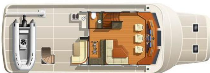
87 / 92 Wheelhouse & Boat Deck