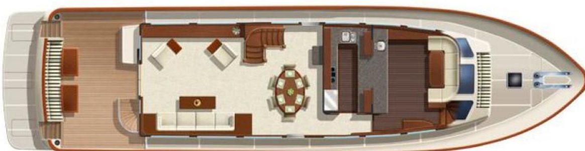
87 Standard Main Deck 87 Standard Main Deck