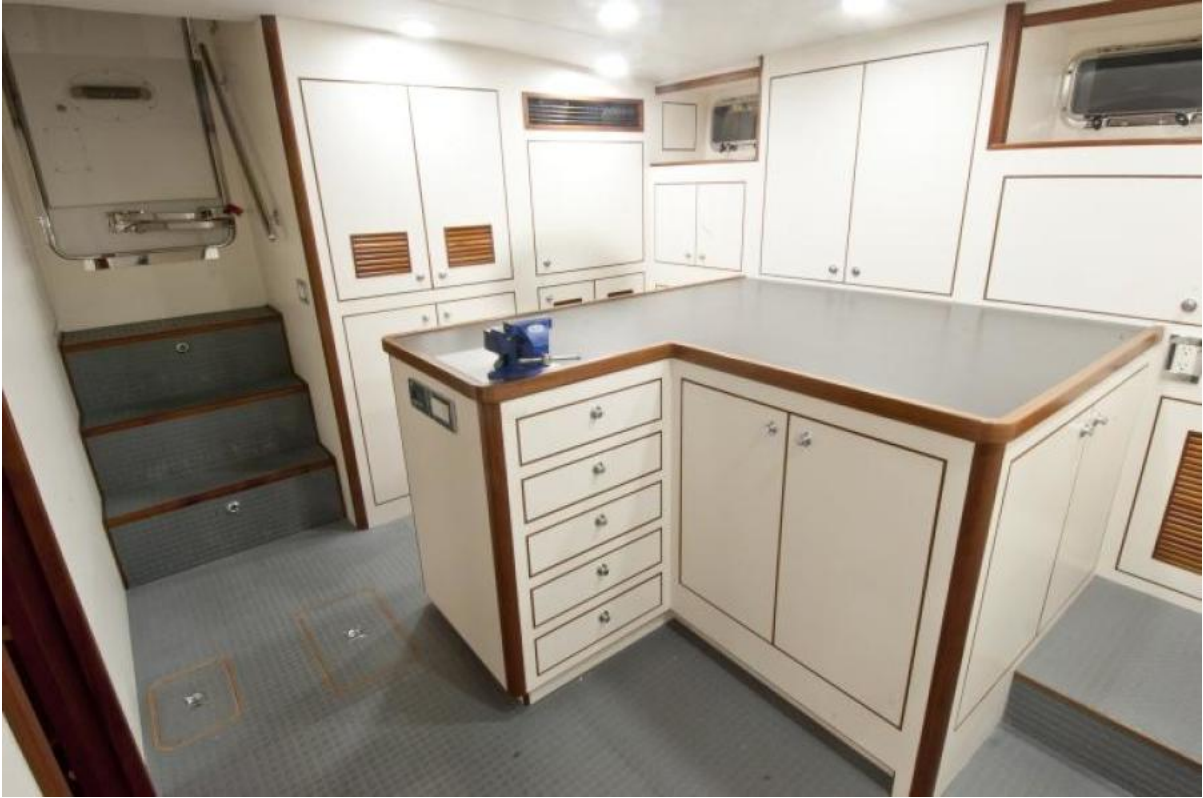
Utility Room Utility Room