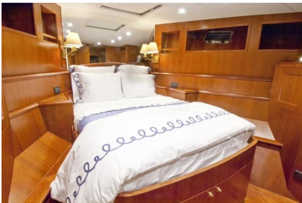
Forward VIP Stateroom Forward VIP Stateroom