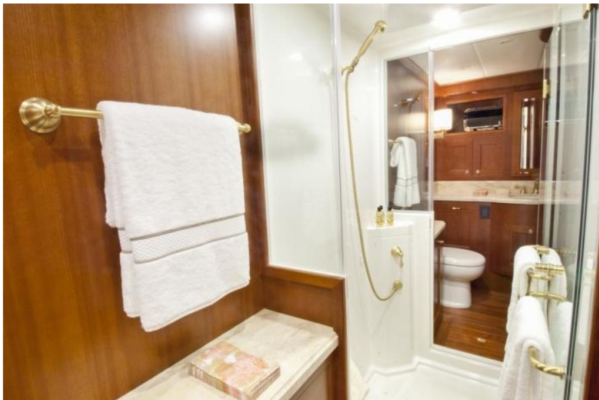
Master Head Master Head