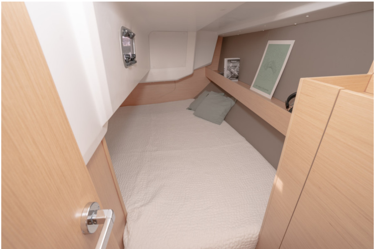
Beneteau OCEANIS 30.1