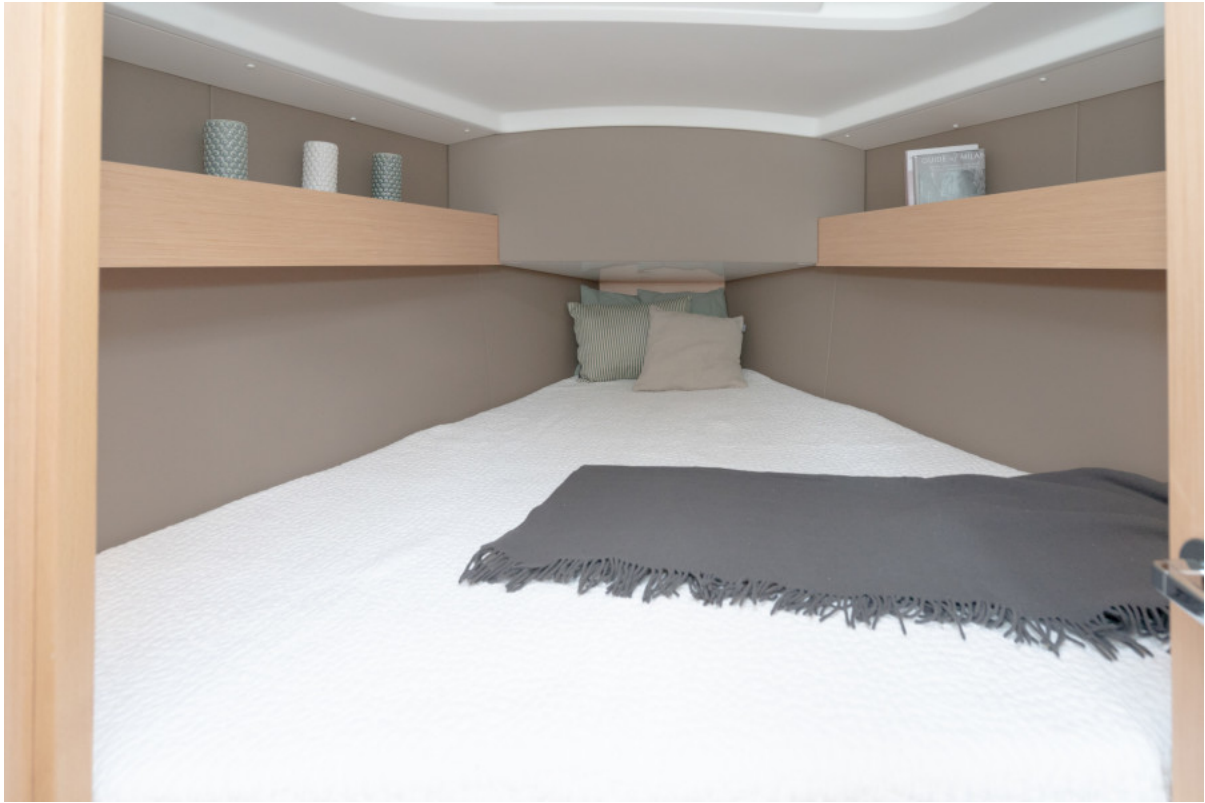
Beneteau OCEANIS 30.1