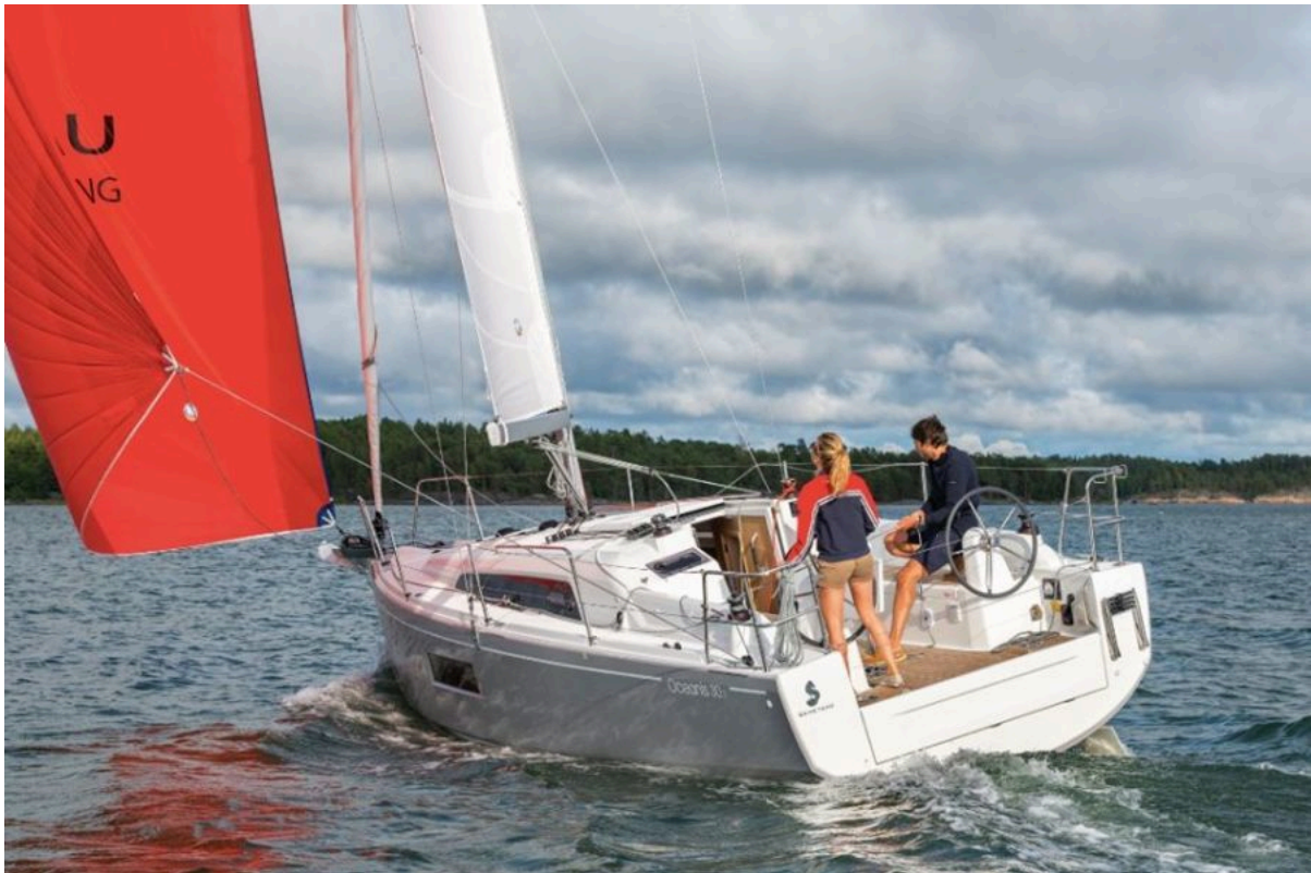
Beneteau OCEANIS 30.1