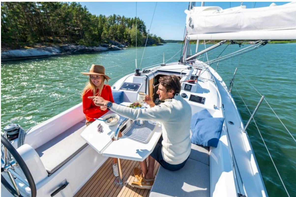
Beneteau OCEANIS 30.1