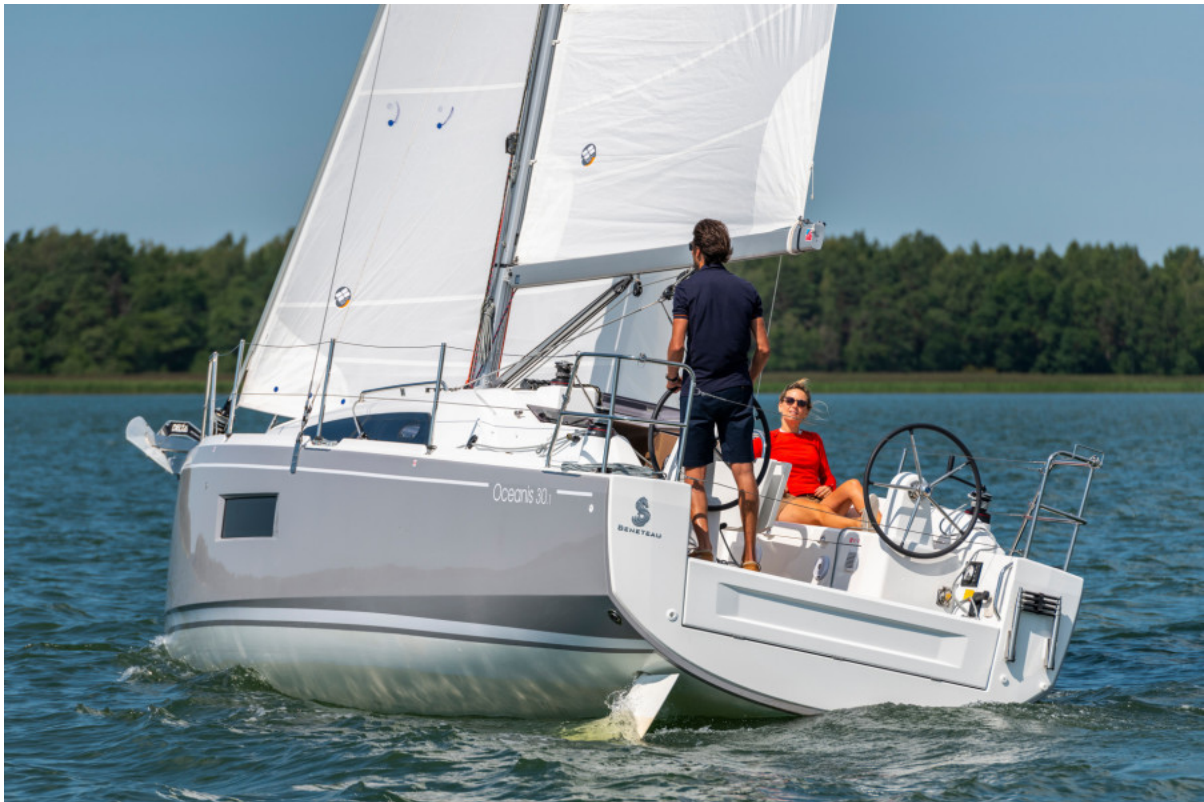
Beneteau OCEANIS 30.1