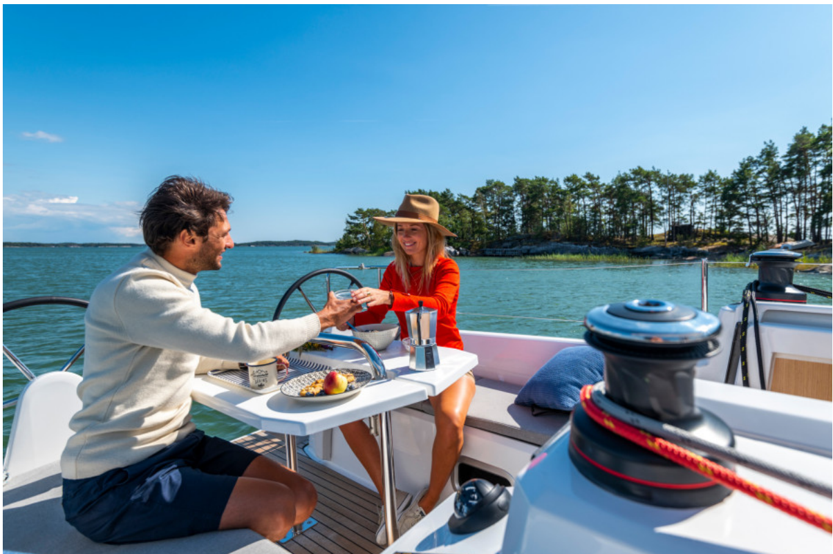
Beneteau OCEANIS 30.1