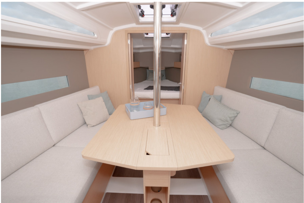
Beneteau OCEANIS 30.1