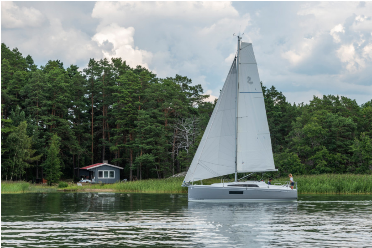
Beneteau OCEANIS 30.1