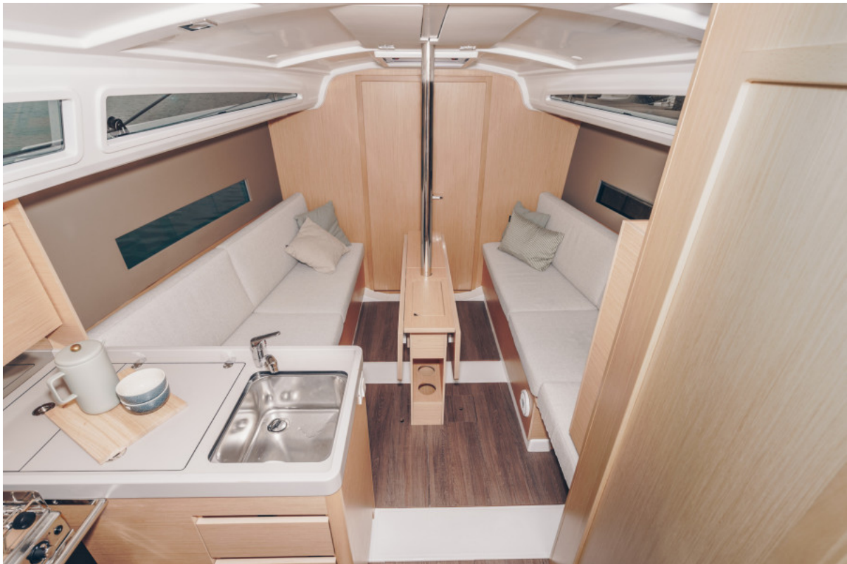
Beneteau OCEANIS 30.1