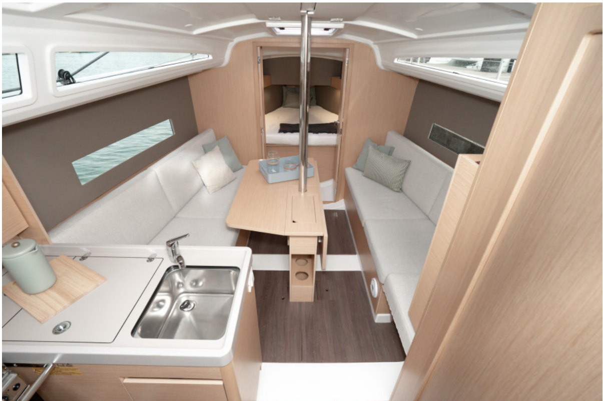
Beneteau OCEANIS 30.1