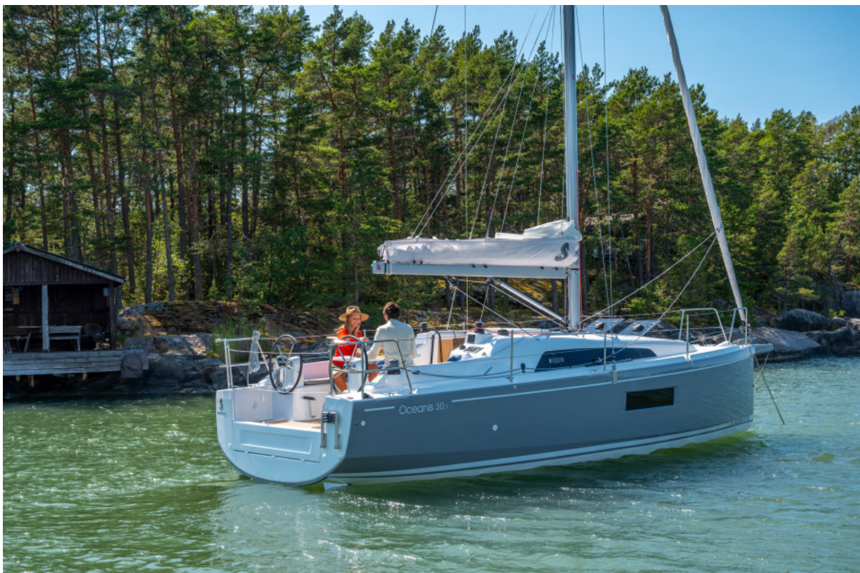
Beneteau OCEANIS 30.1