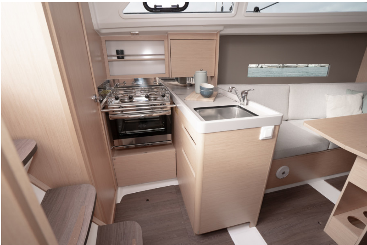
Beneteau OCEANIS 30.1