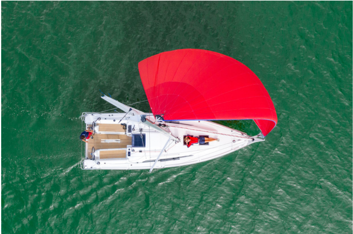
Beneteau OCEANIS 30.1