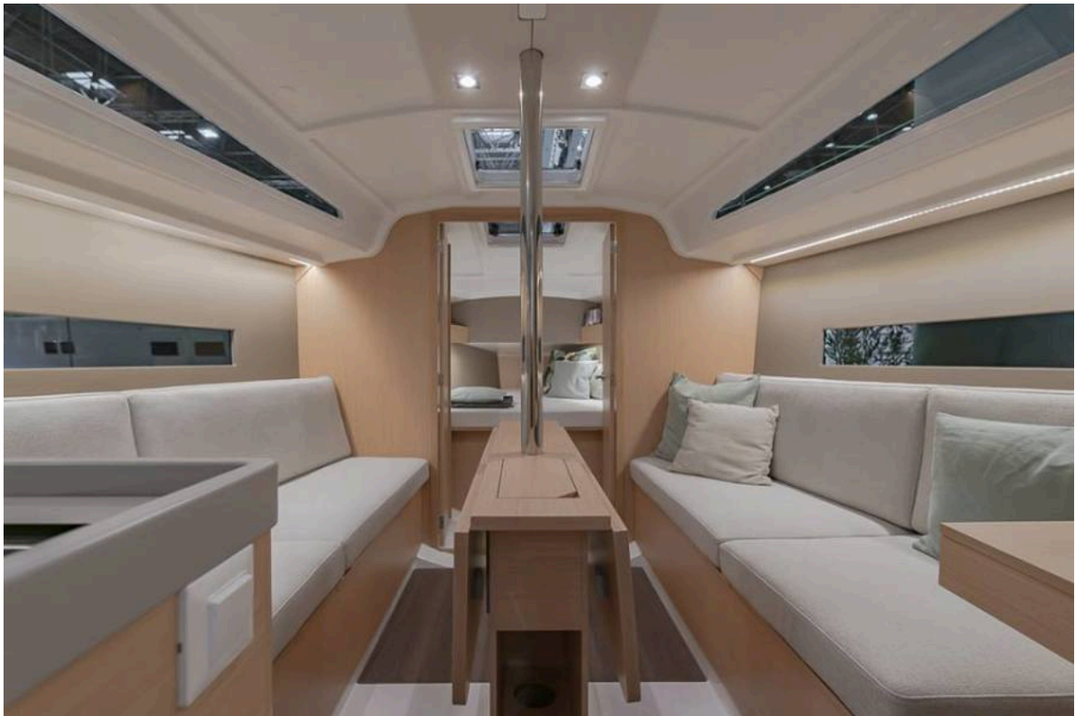
Beneteau OCEANIS 30.1