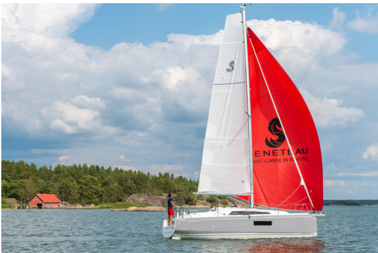
Beneteau OCEANIS 30.1