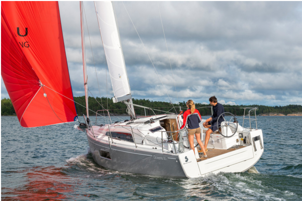
Beneteau OCEANIS 30.1