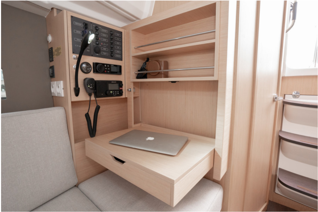
Beneteau OCEANIS 30.1