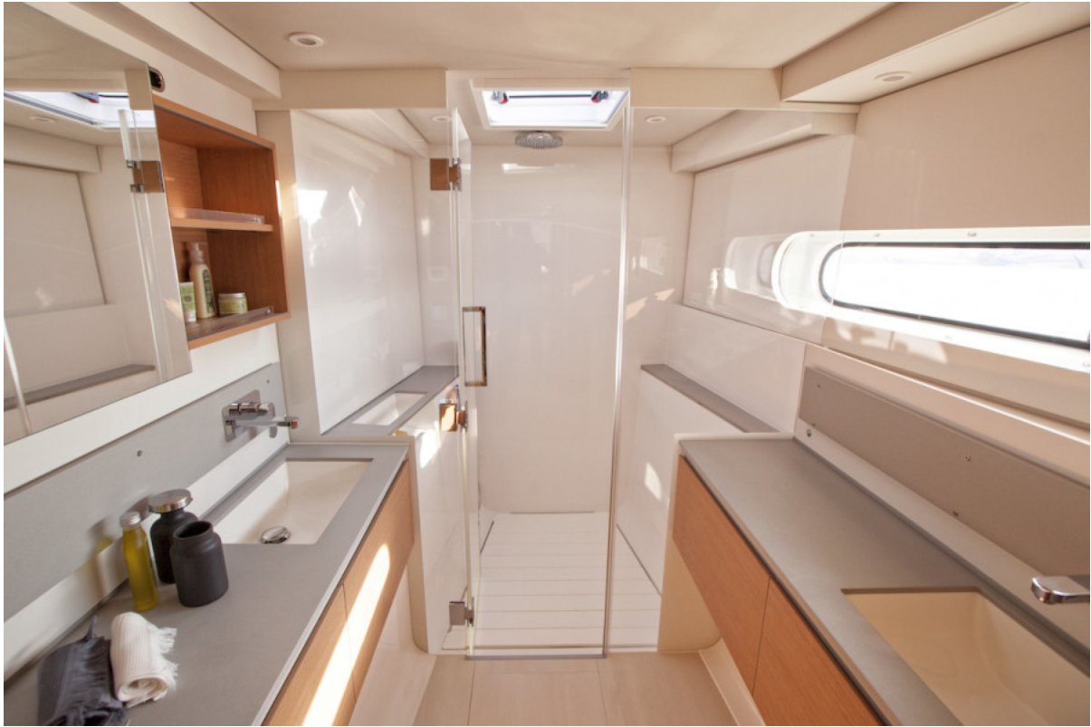
EXCESS 15 Master Head