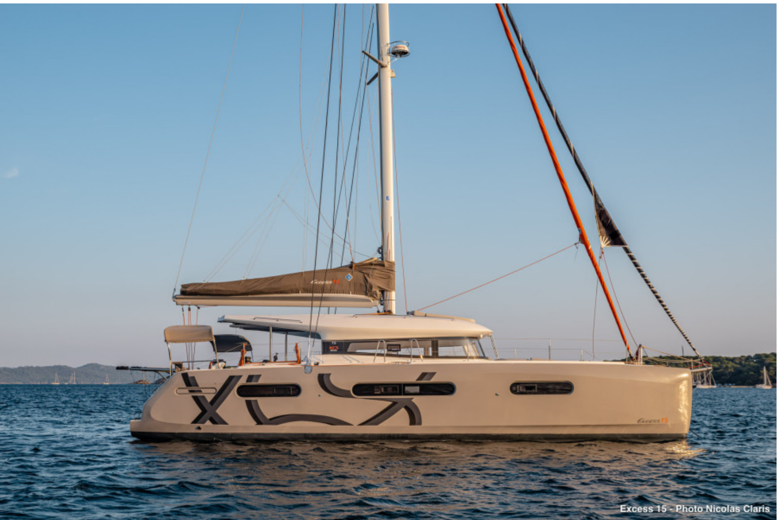
Excess 15 - Photo Nicolas Claris