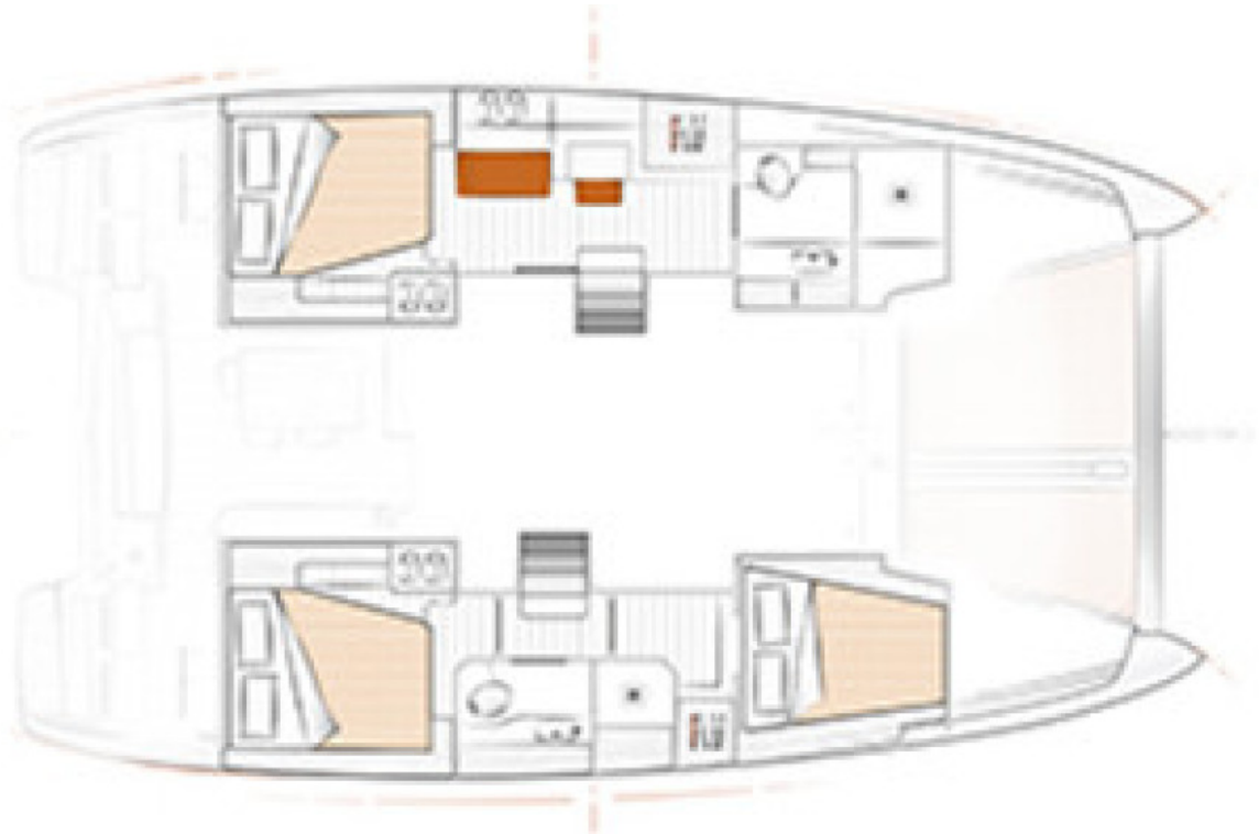
EXCESS 15 3 Cabins / Two Heads Layout