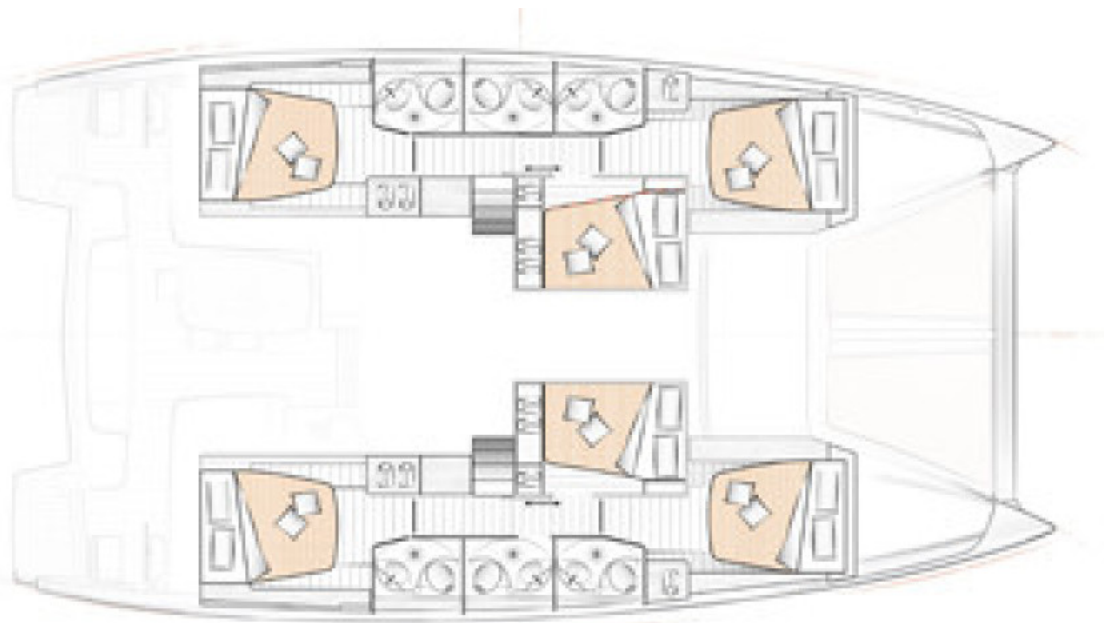
EXCESS 15 4 Cabins / Two Heads Layout