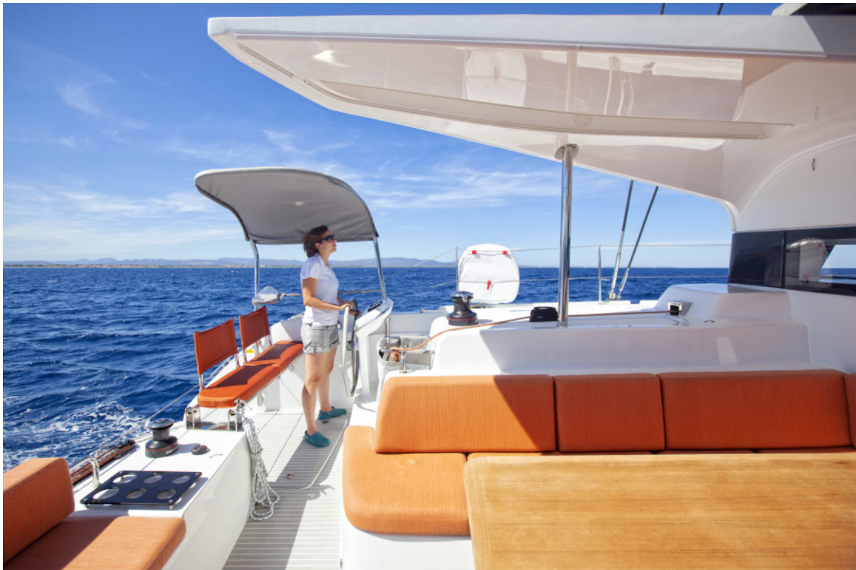
EXCESS 15 Optional Bimini