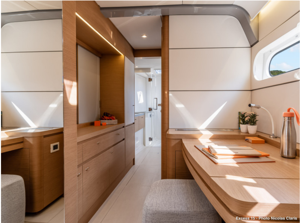
EXCESS 15 Master