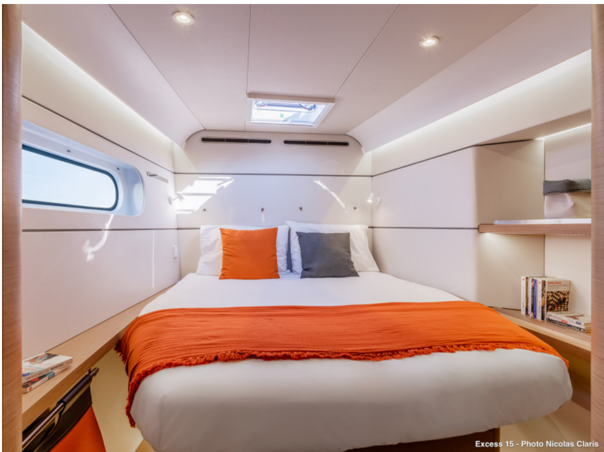
Excess 15