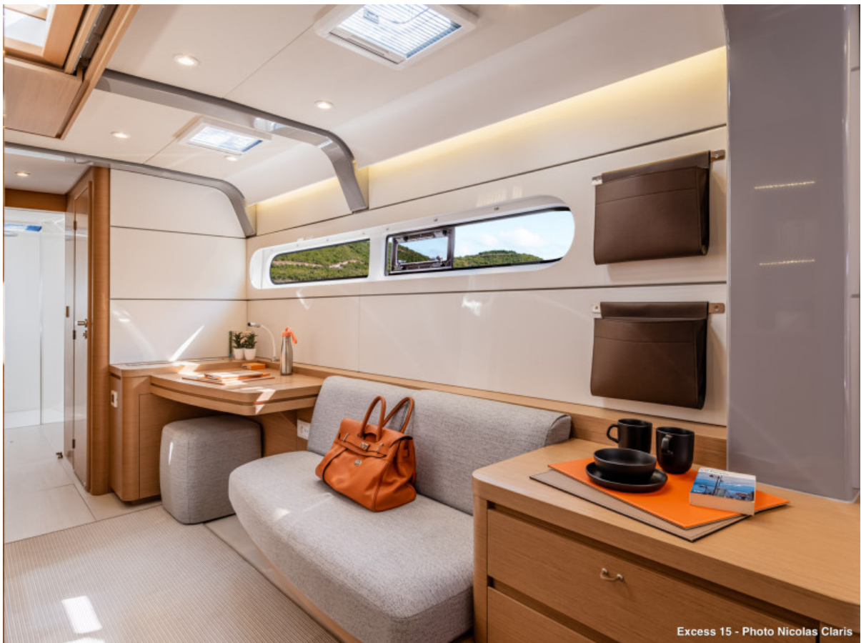
EXCESS 15 Master