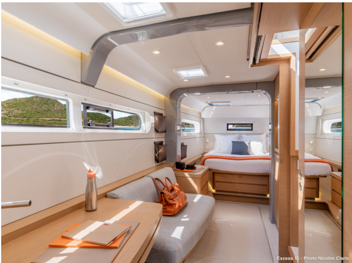
EXCESS 15 Master