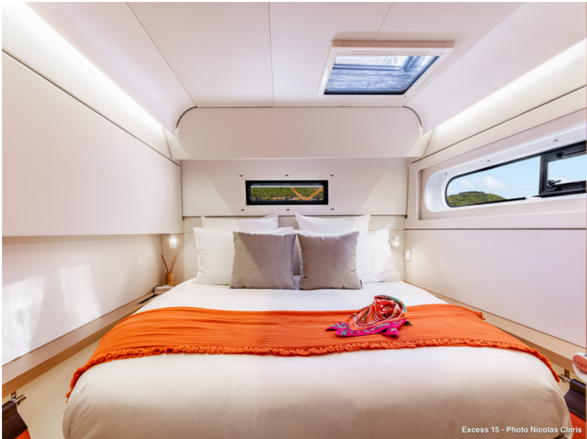
Excess 15