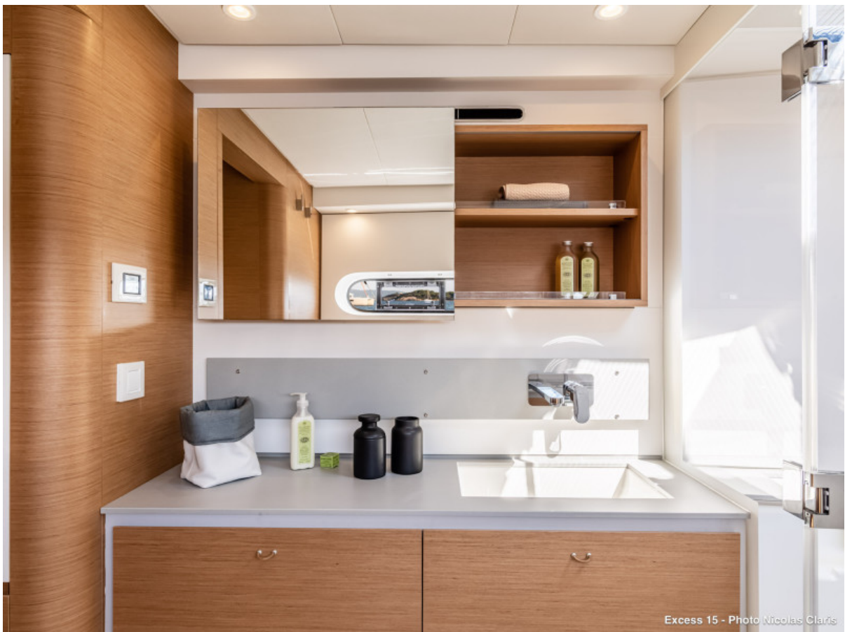
EXCESS 15 Master Head