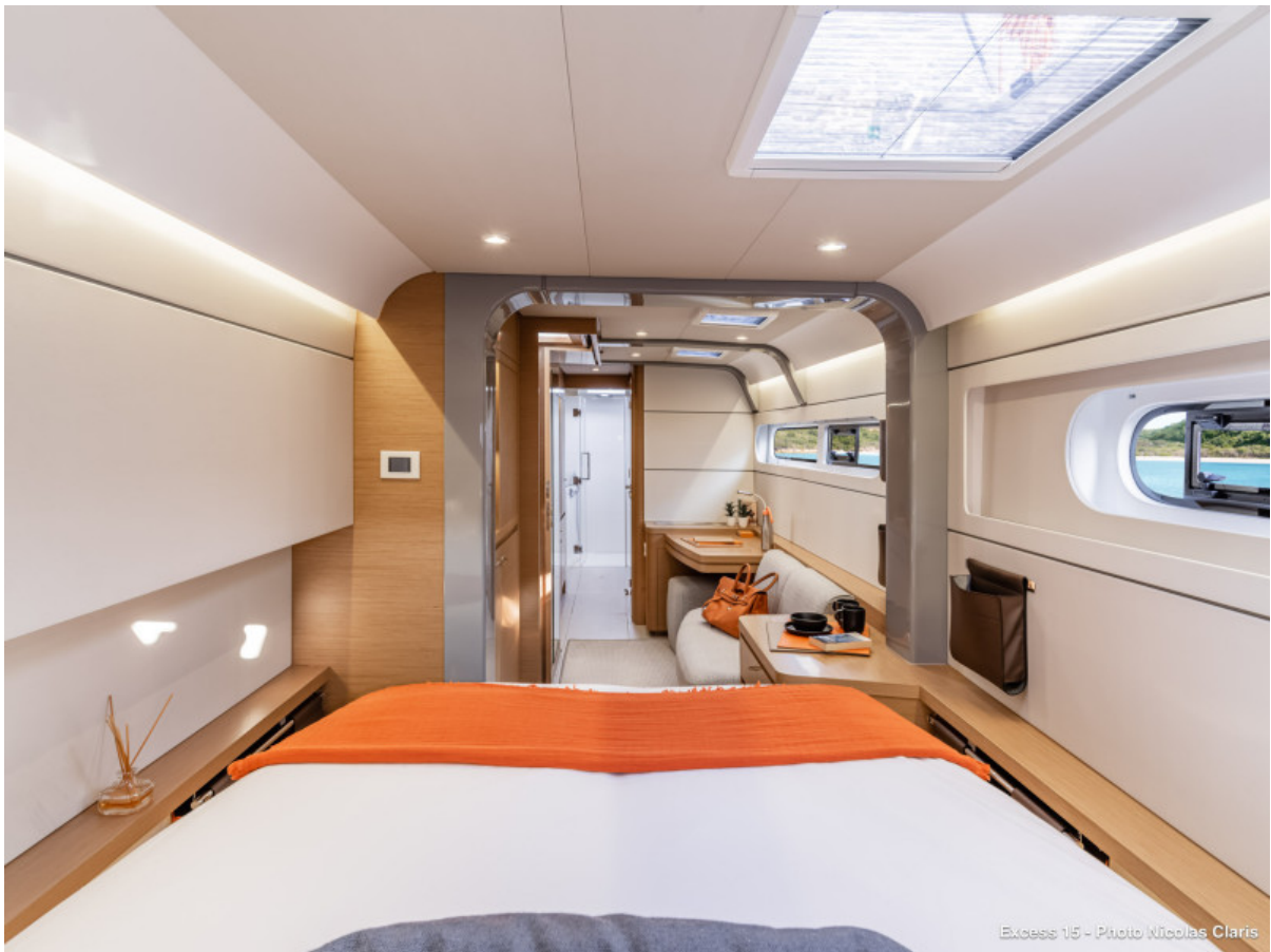
EXCESS 15 Master