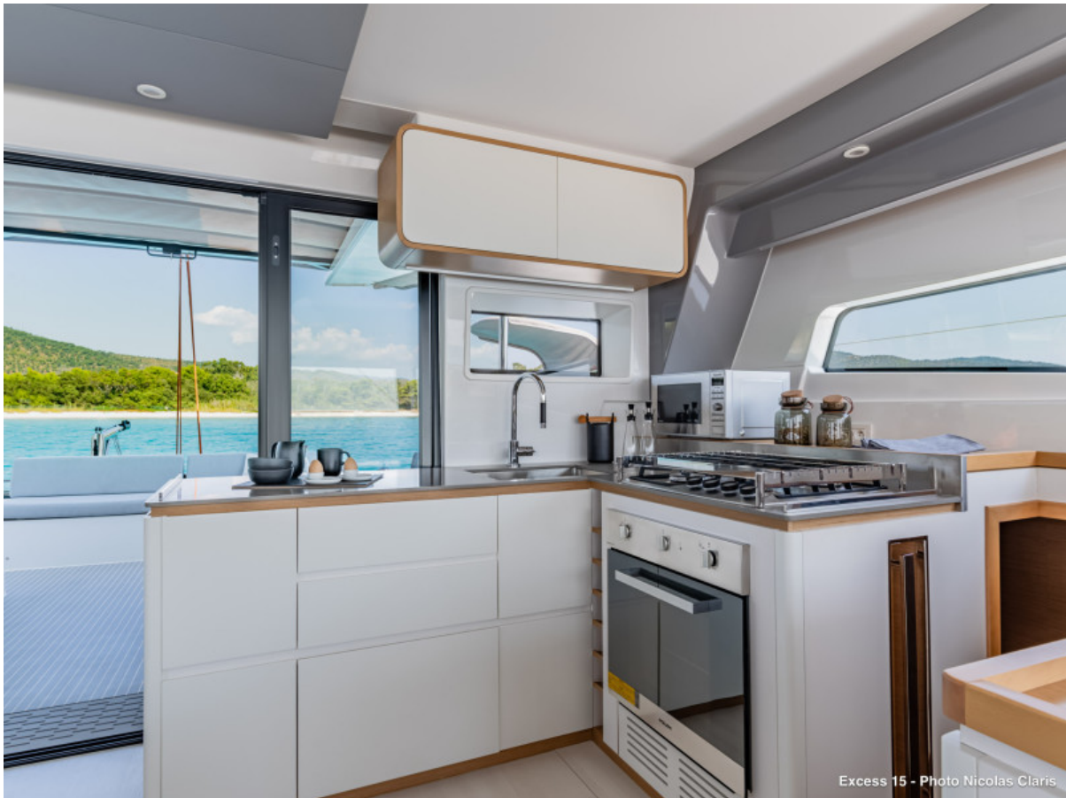
EXCESS 15 Galley