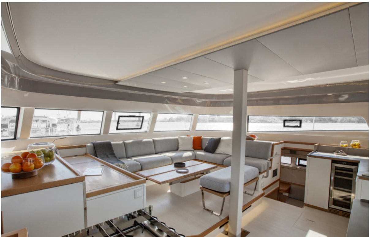
EXCESS 15 Salon / Galley