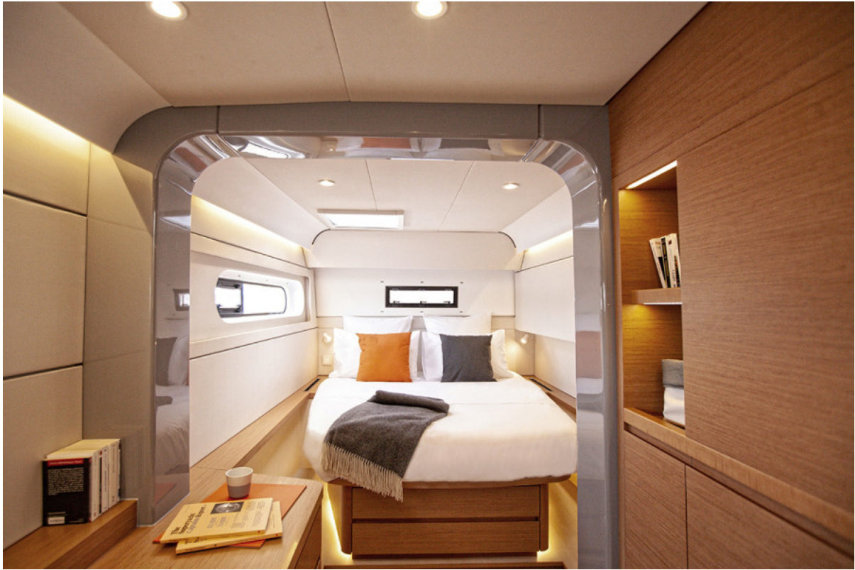
EXCESS 15 Master