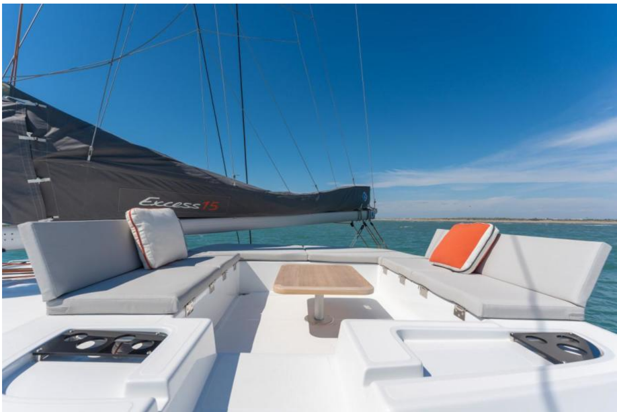
EXCESS 15 Sky Lounge Option