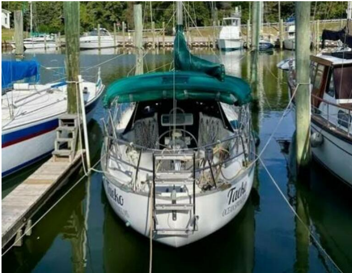
1993 Pacific Seacraft 34