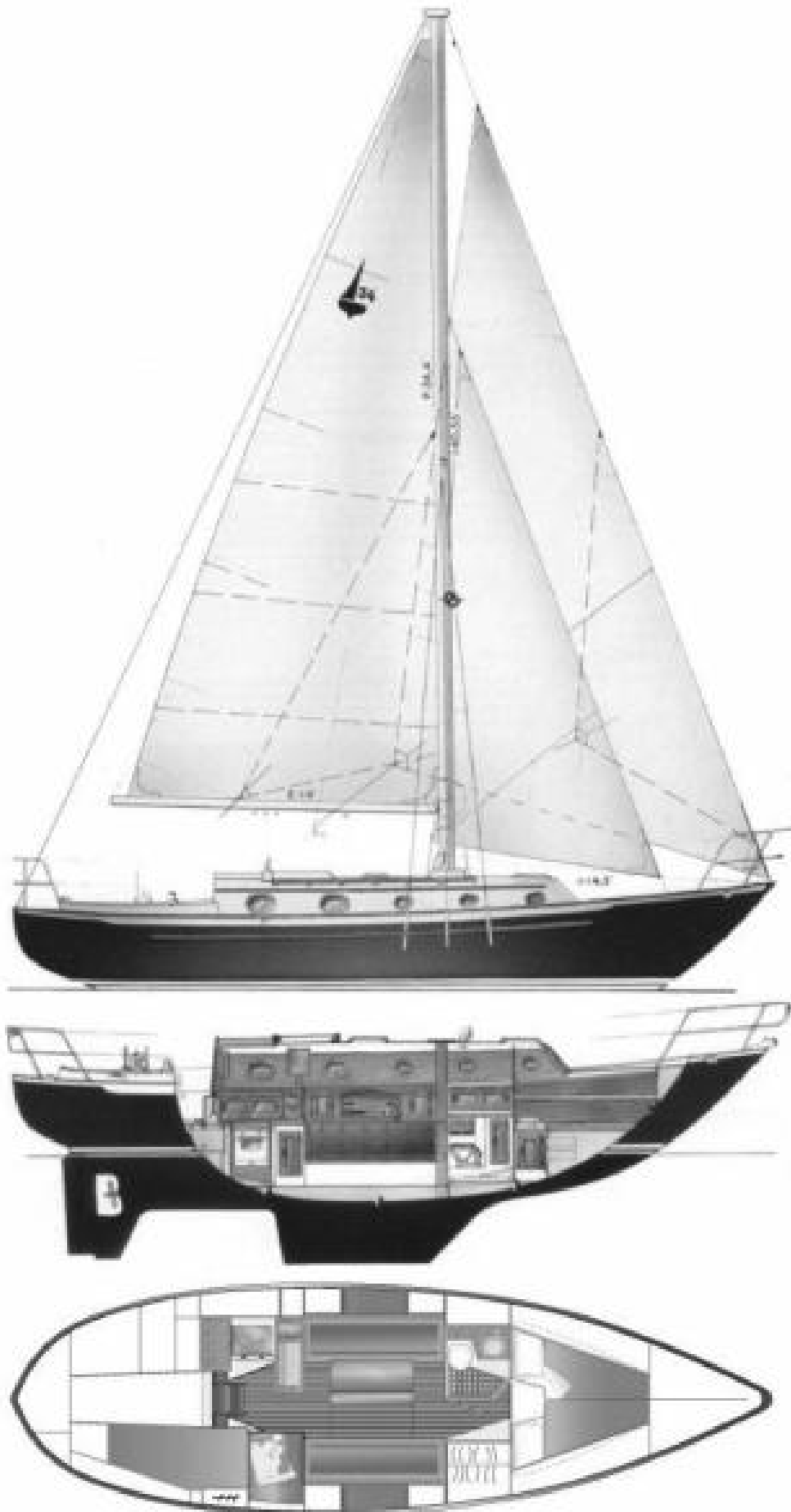
Pacific Seacraft 34