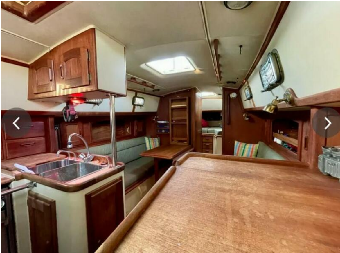
1993 Pacific Seacraft 34