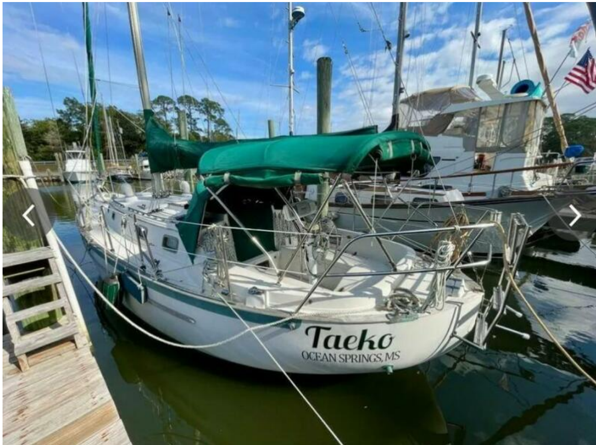
1993 Pacific Seacraft 34