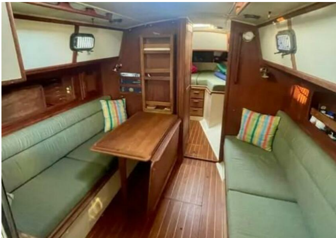
1993 Pacific Seacraft 34