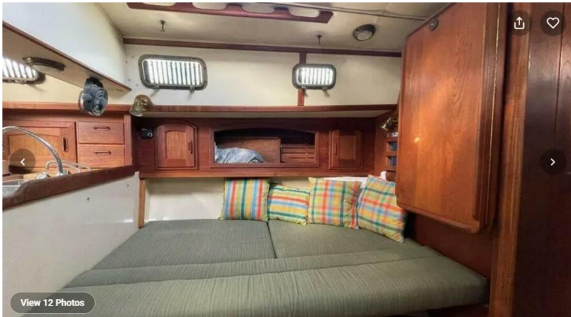
1993 Pacific Seacraft 34