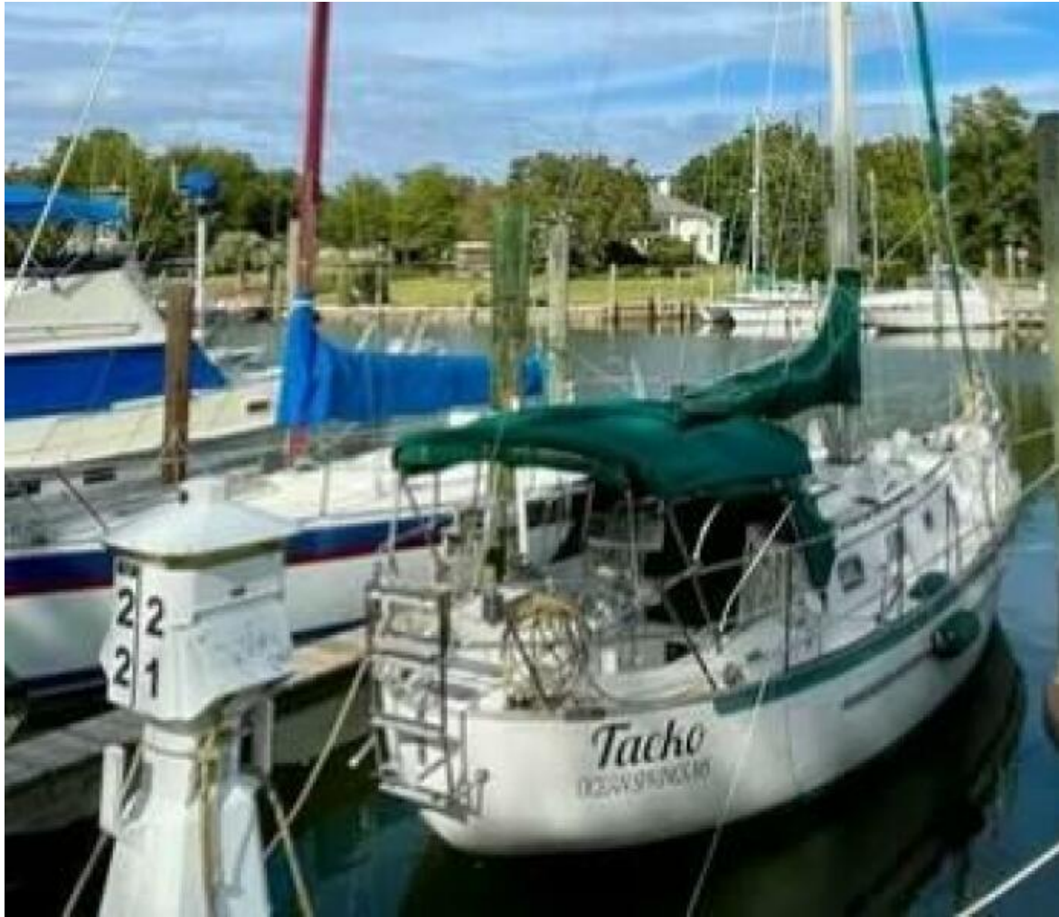
1993 Pacific Seacraft 34