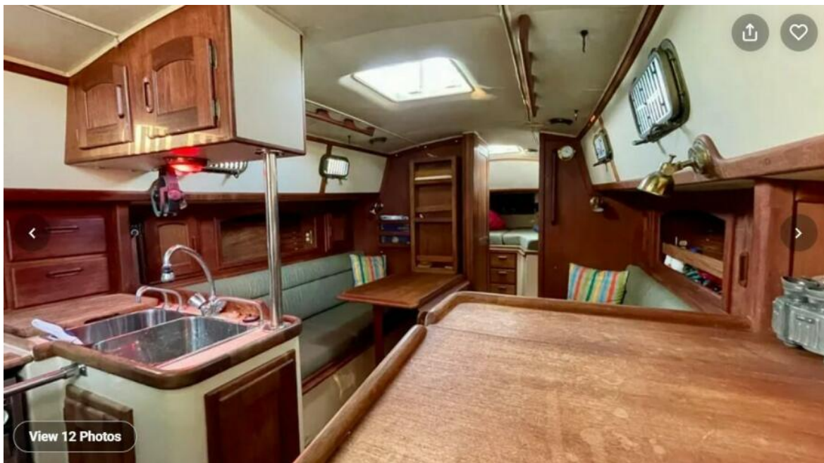
1993 Pacific Seacraft 34