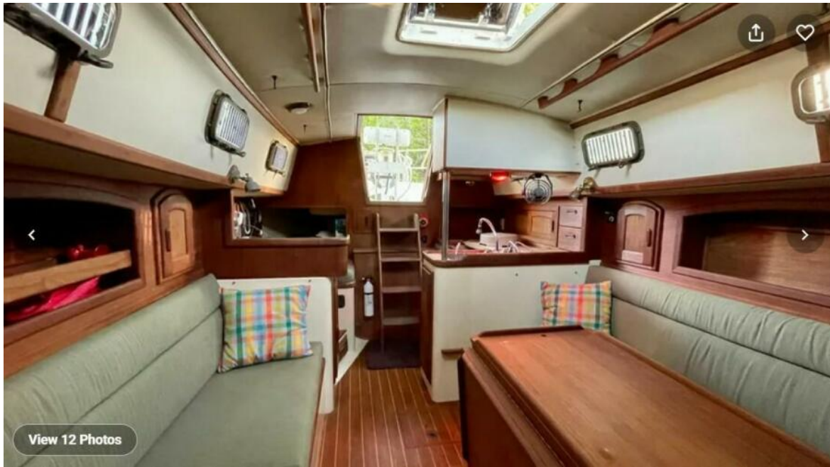
1993 Pacific Seacraft 34