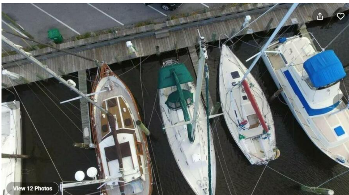
1993 Pacific Seacraft 34