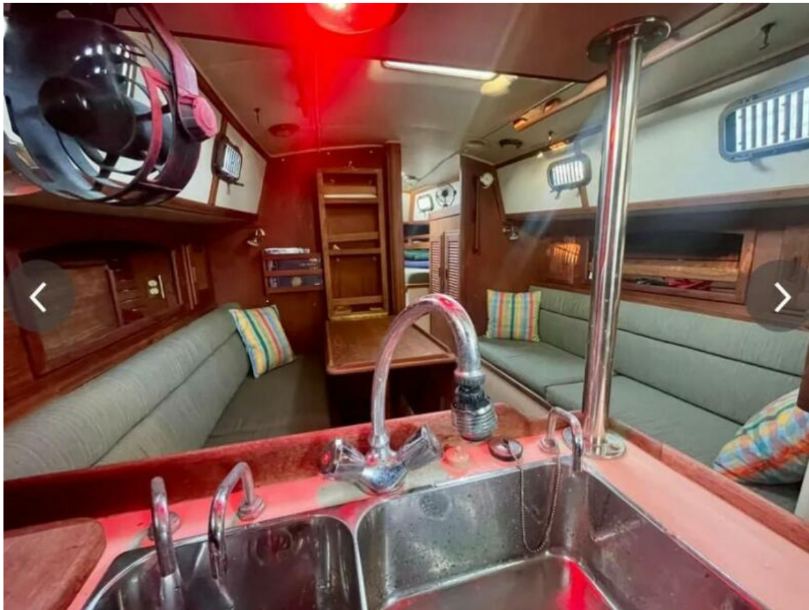
1993 Pacific Seacraft 34