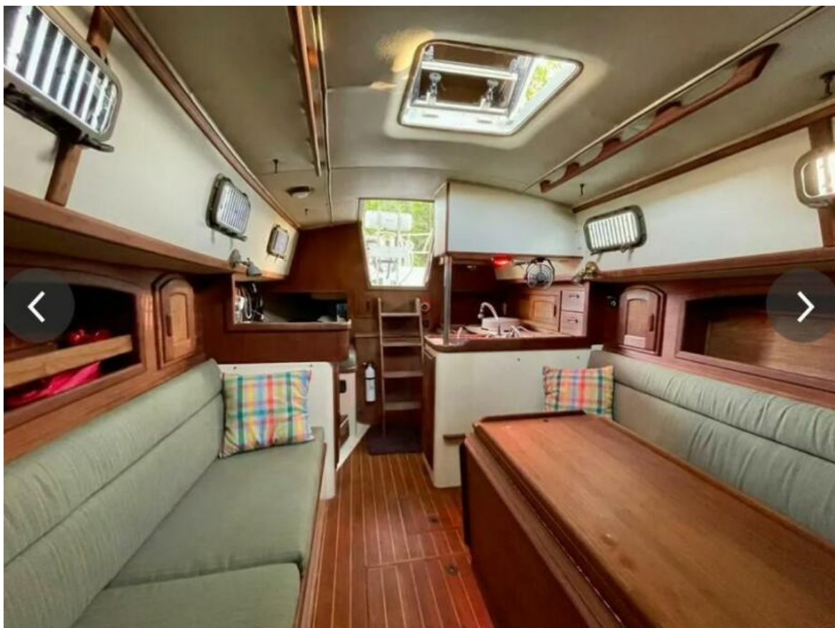
1993 Pacific Seacraft 34