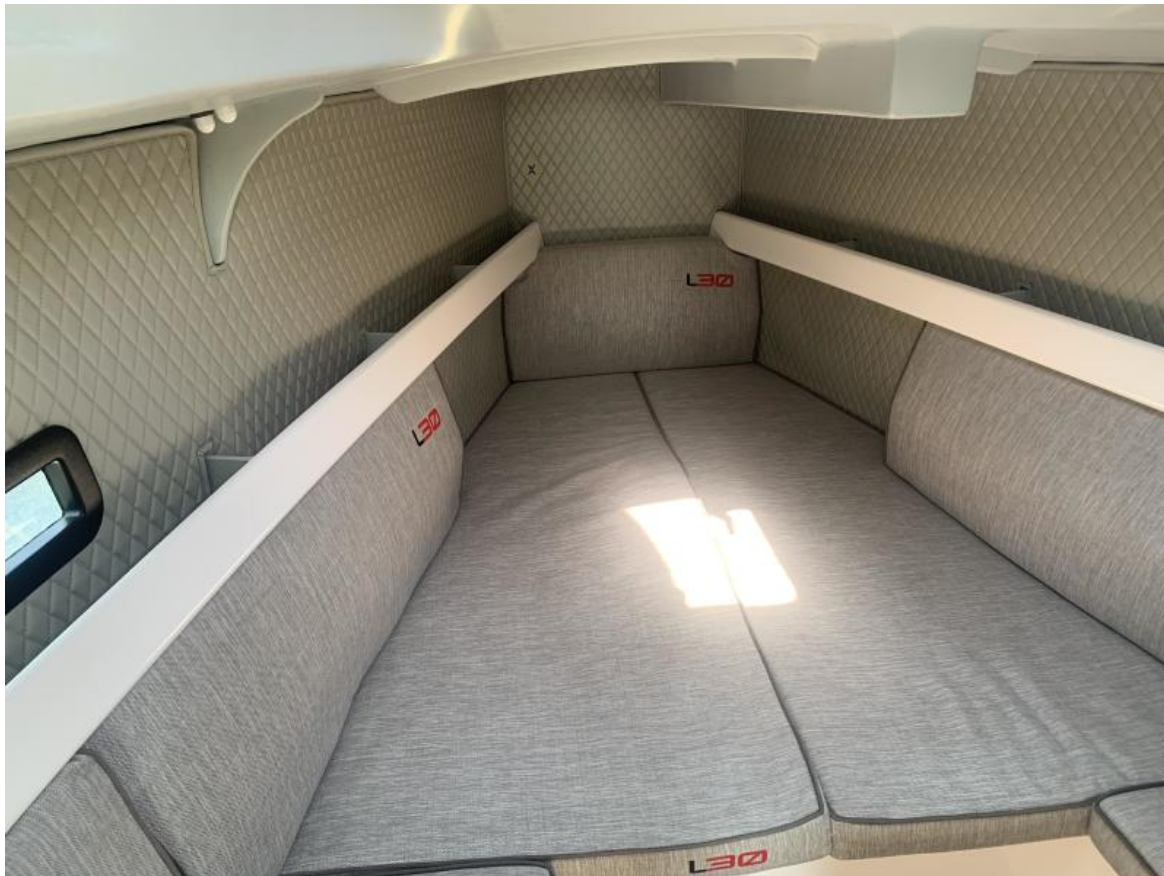
L30 V Berth