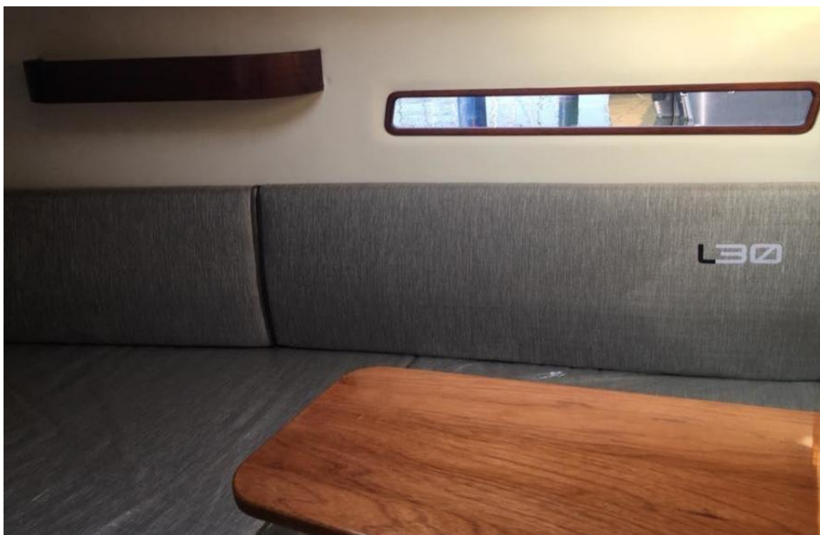
L30 Mfr Picture