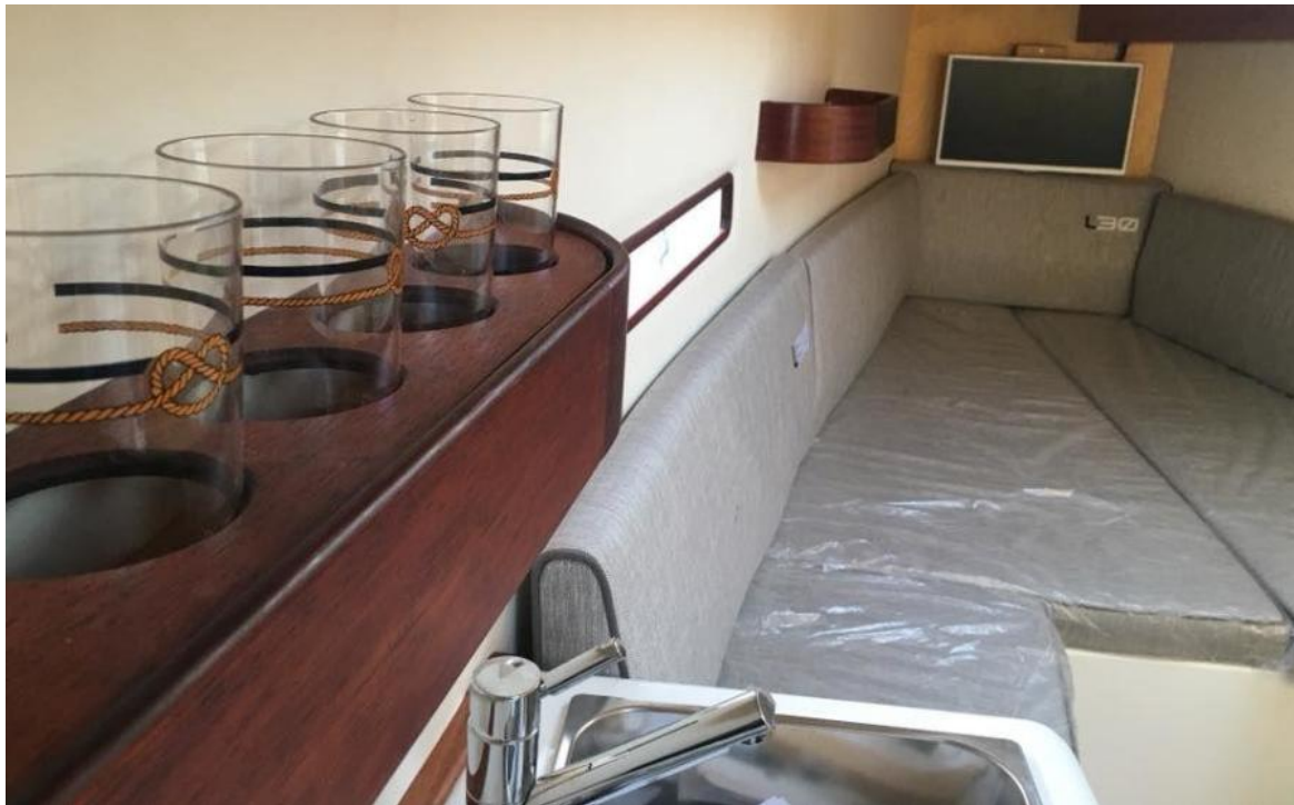
L30 Mfr Picture