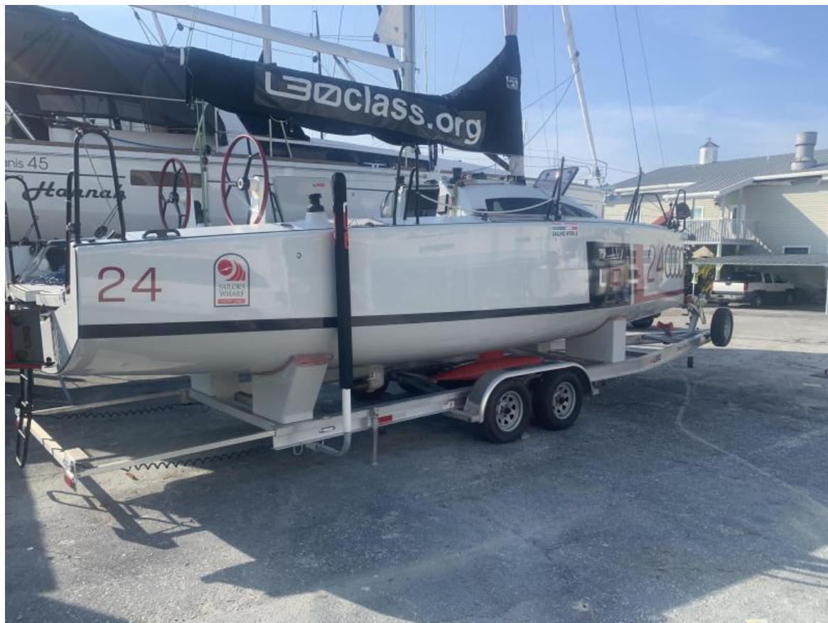
L30 Profile on the Trailer