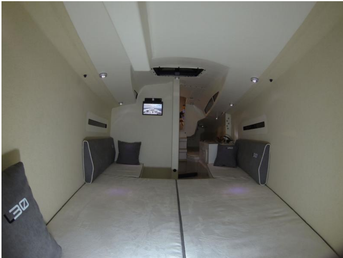
L30 Mfr Picture