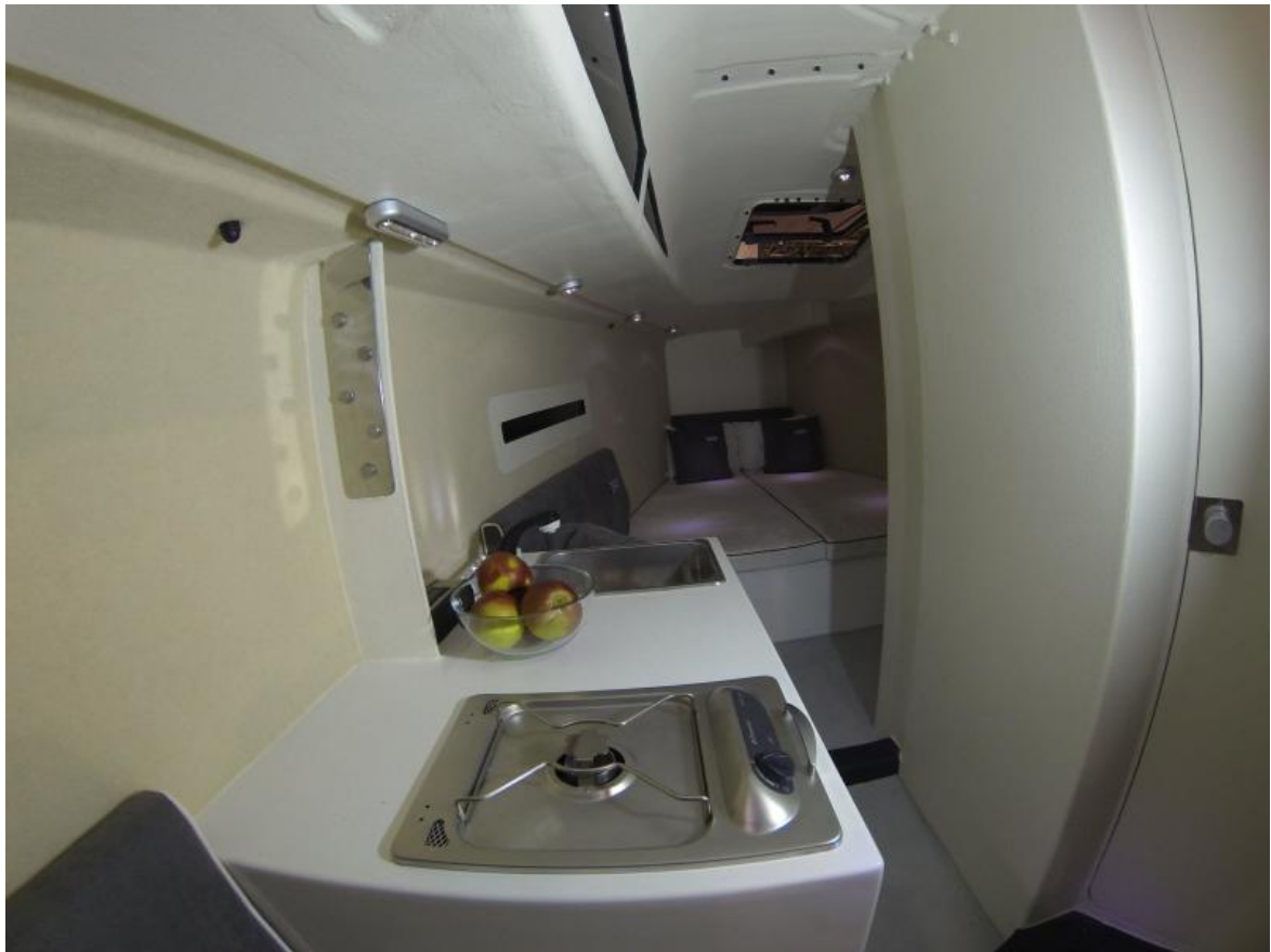
L30 Mfr Picture