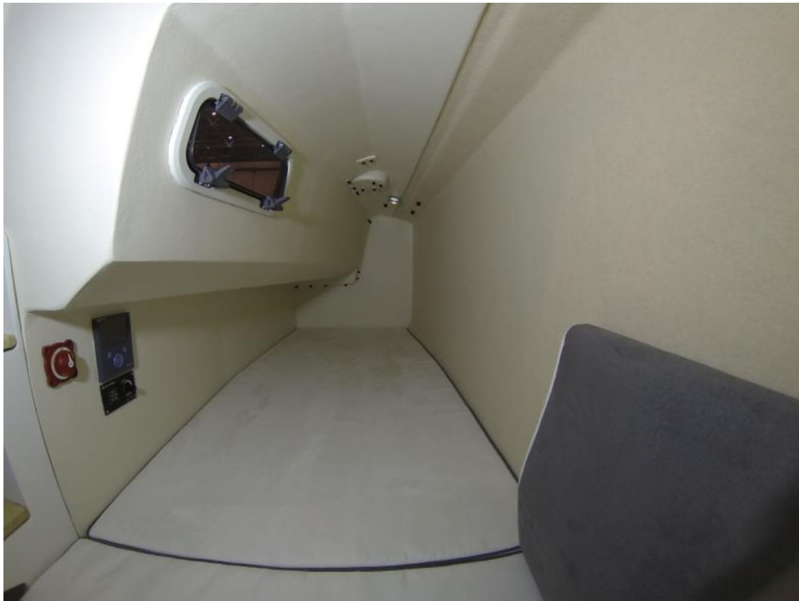
L30 Mfr Picture