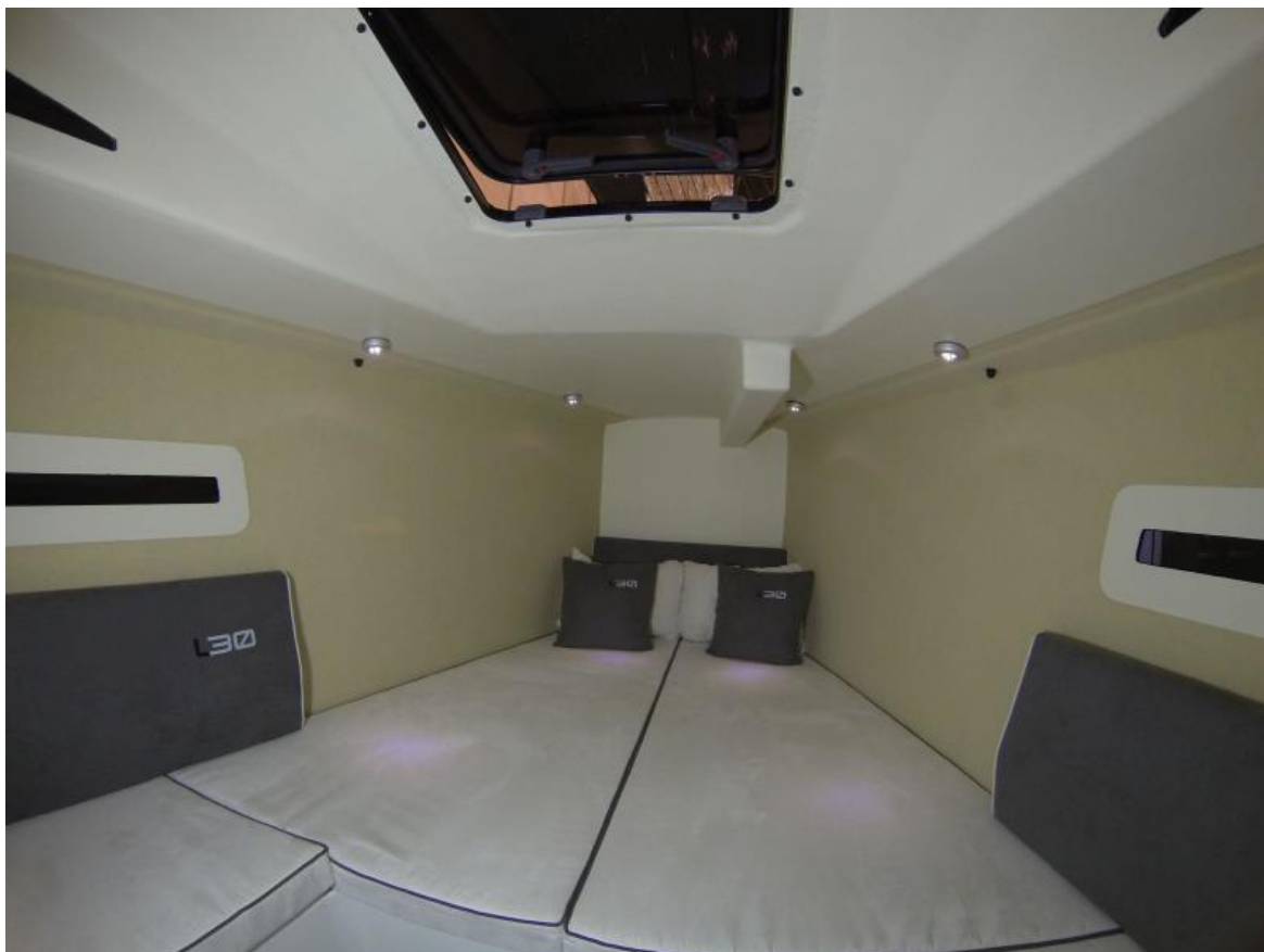
L30 Mfr Picture