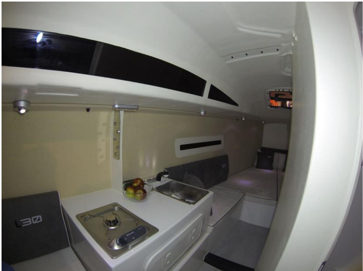
L30 Mfr Picture