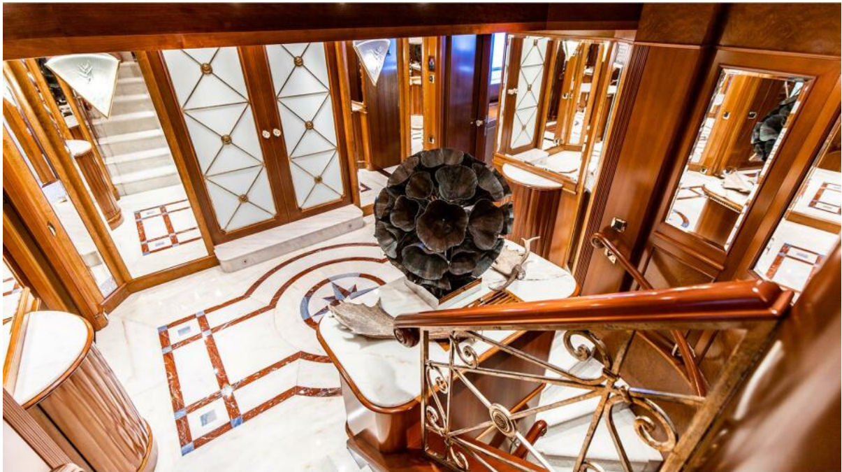
NEXT CHAPTER 180'6"/55m Benetti 2003/2022 Lower Deck Guest Foyer