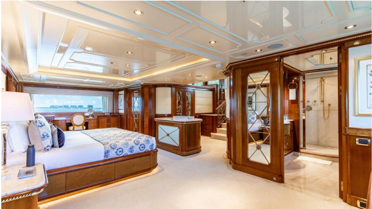
NEXT CHAPTER 180'6"/55m Benetti 2003/2022 Master Stateroom