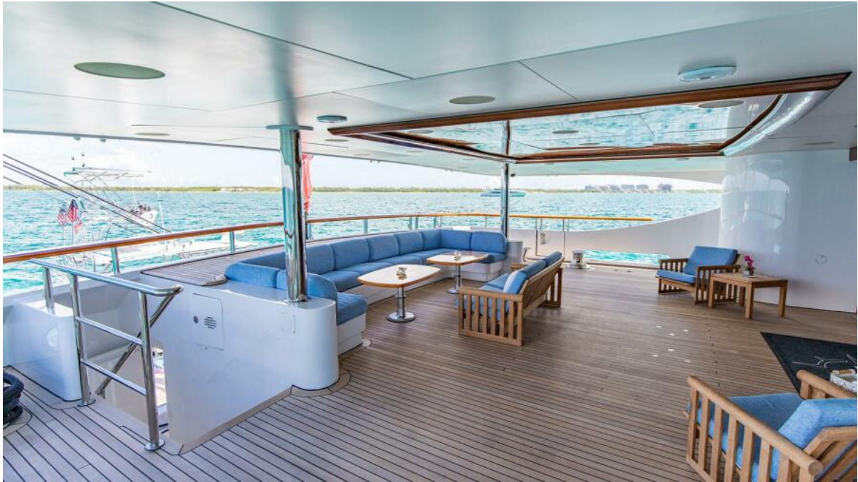
NEXT CHAPTER 180'6"/55m Benetti 2003/2022 Main Aft Deck