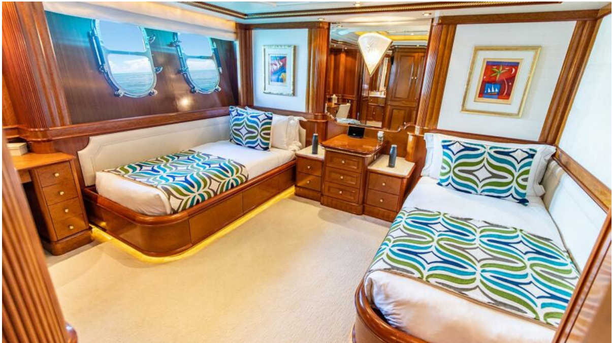
NEXT CHAPTER 180'6"/55m Benetti 2003/2022 Twin Ensuite