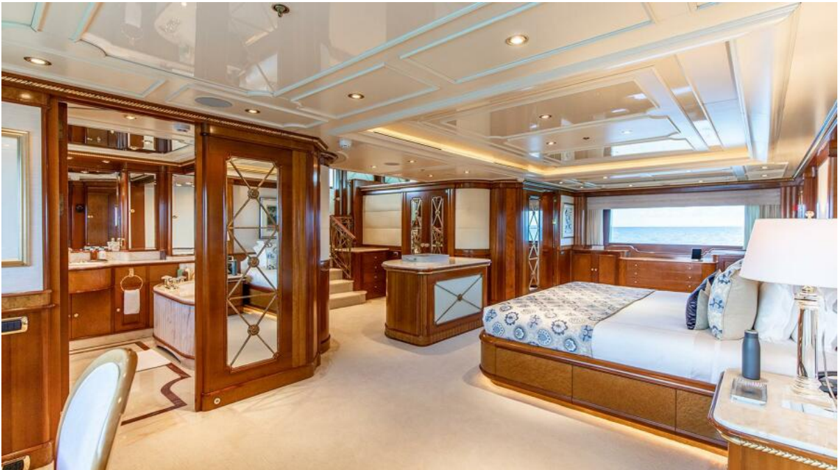
NEXT CHAPTER 180'6"/55m Benetti 2003/2022 Master Stateroom