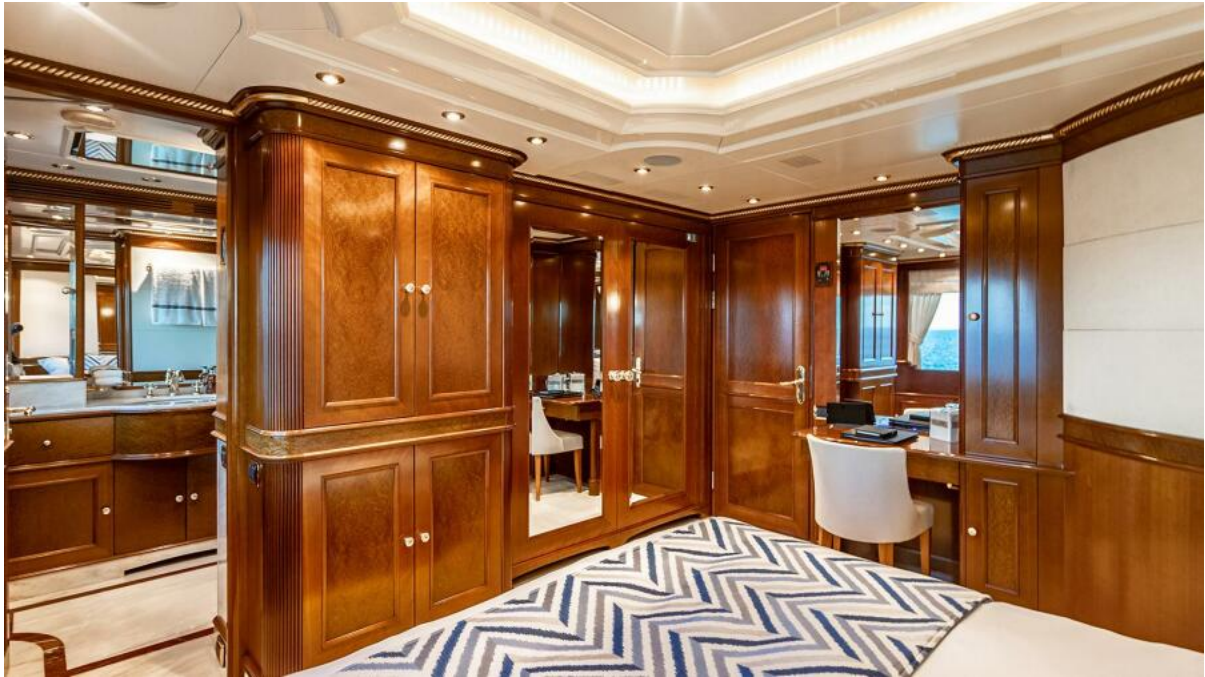
NEXT CHAPTER 180'6"/55m Benetti 2003/2022 Vip Ensuite