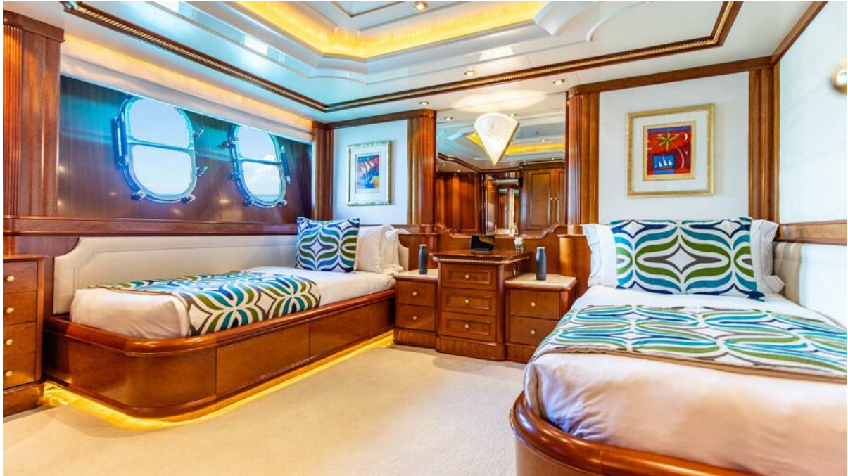
NEXT CHAPTER 180'6"/55m Benetti 2003/2022 Twin Ensuite