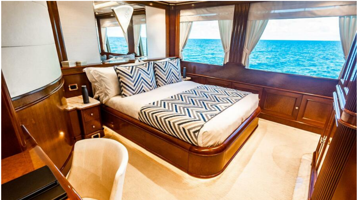
NEXT CHAPTER 180'6"/55m Benetti 2003/2022 VIP Ensuite