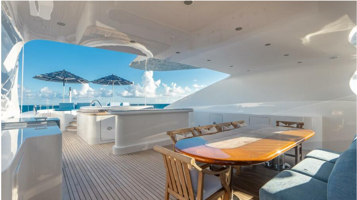
NEXT CHAPTER 180'6"/55m Benetti 2003/2022 Sundeck Bar and Dining