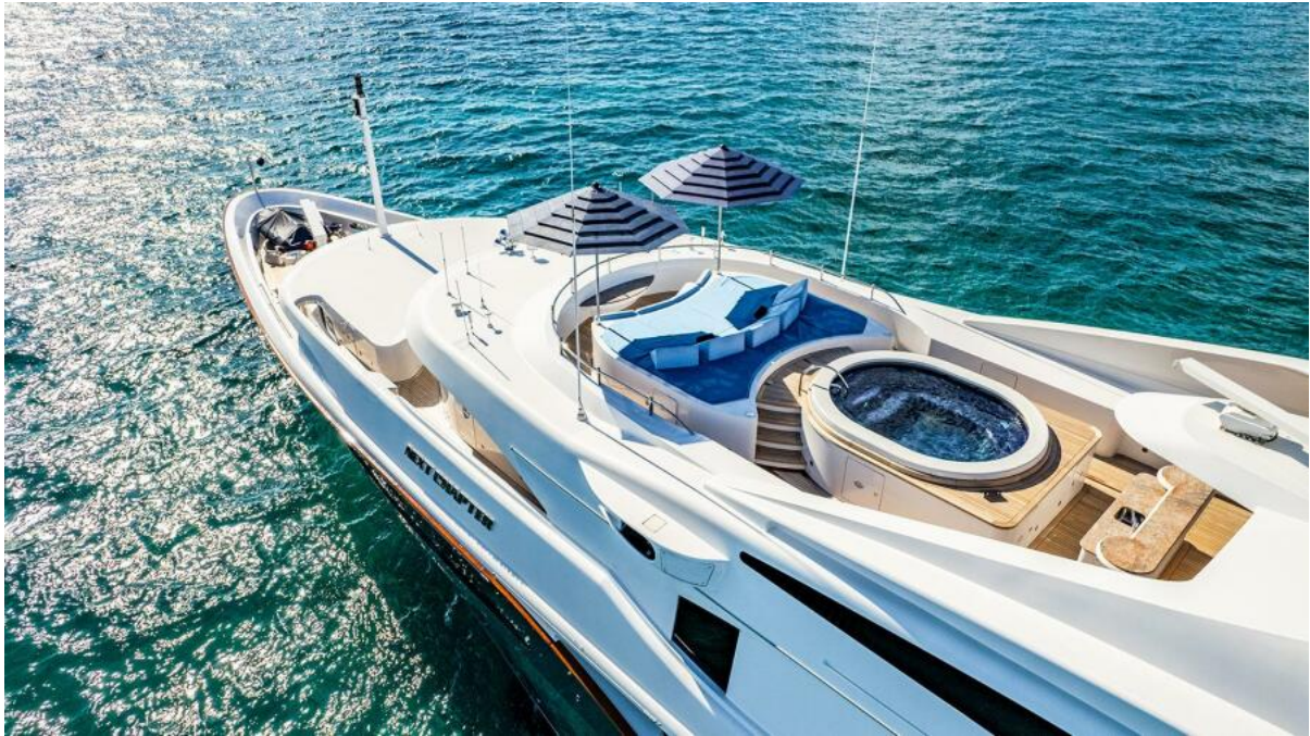
NEXT CHAPTER 180'6\"/>