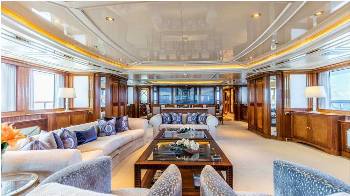
NEXT CHAPTER 180'6"/55m Benetti 2003/2022 Main Salon