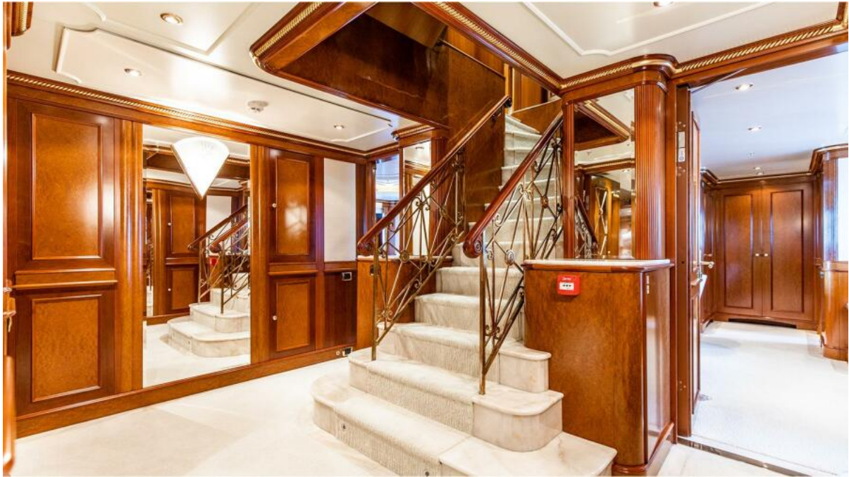
NEXT CHAPTER 180'6"/55m Benetti 2003/2022 Staircase to Main Deck