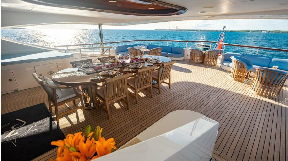
NEXT CHAPTER 180'6"/55m Benetti 2003/2022 Bridge Deck Aft Dining and Lounge Area