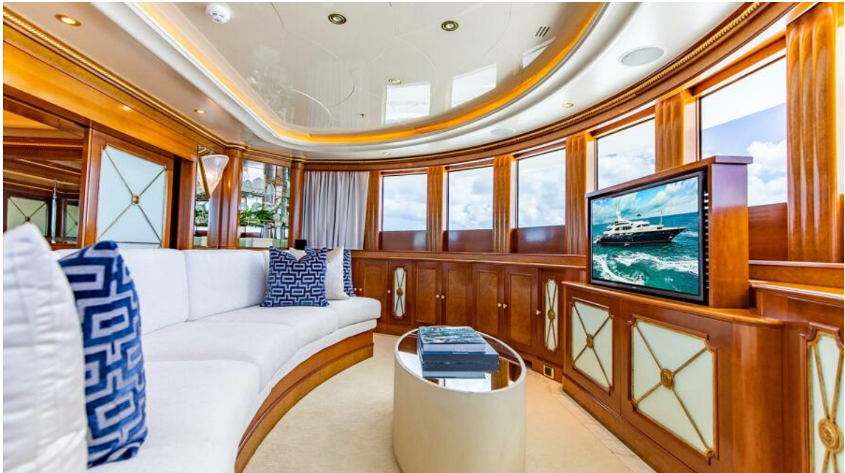
NEXT CHAPTER 180'6"/55m Benetti 2003/2022 Master Observation Lounge