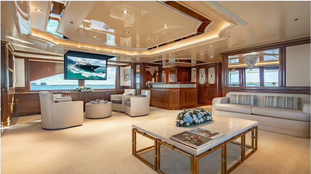
NEXT CHAPTER 180'6"/55m Benetti 2003/2022 Skylounge