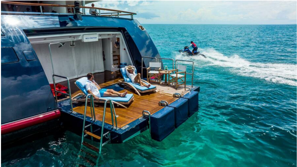
NEXT CHAPTER 180'6"/55m Benetti 2003/2022 Swim Platform/Beach Club