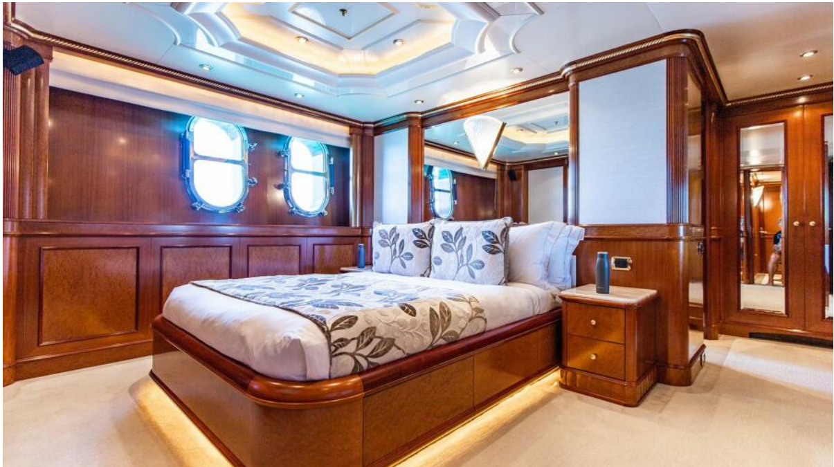
NEXT CHAPTER 180'6"/55m Benetti 2003/2022 Queen Ensite