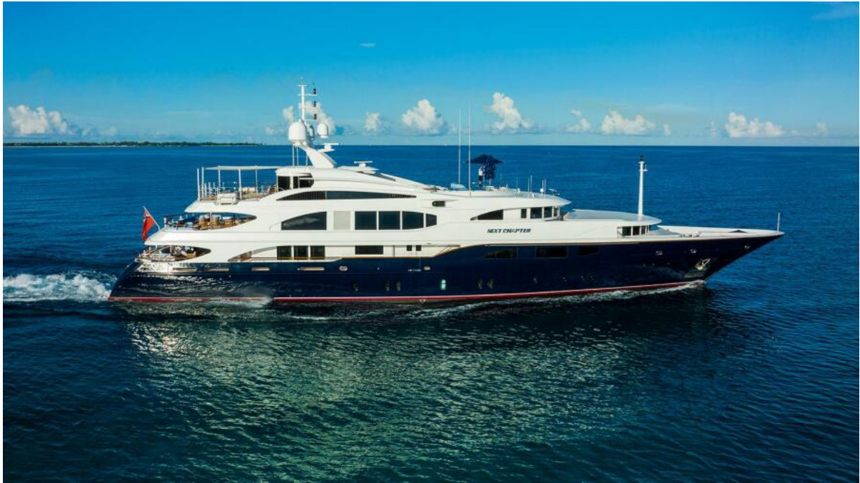
NEXT CHAPTER 180'6"/55m Benetti 2003/2022