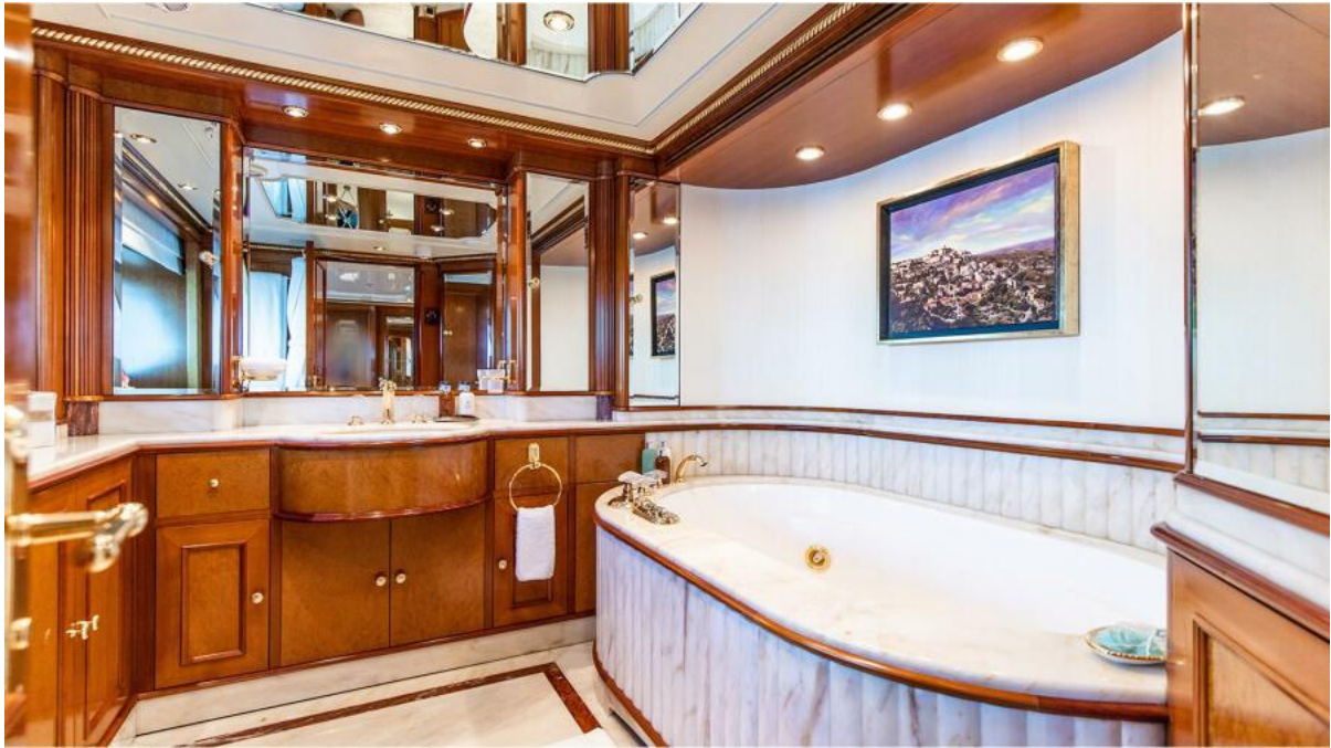
NEXT CHAPTER 180'6"/55m Benetti 2003/2022 Master Ensuite