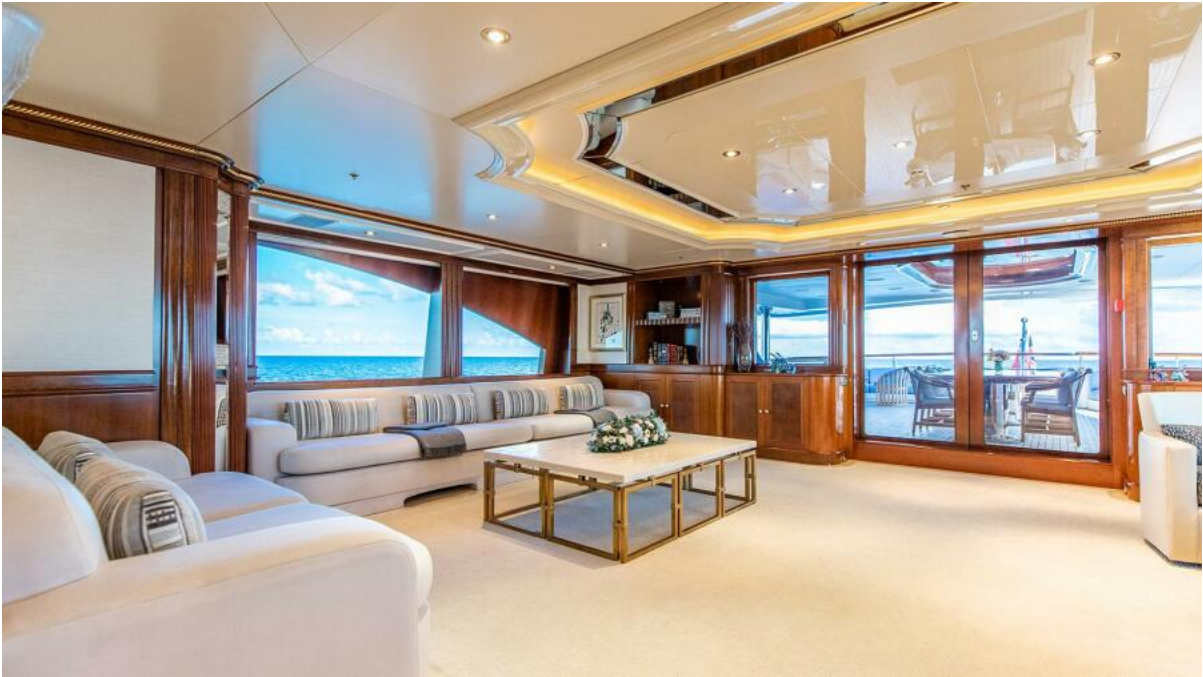
NEXT CHAPTER 180'6"/55m Benetti 2003/2022 Skyounge