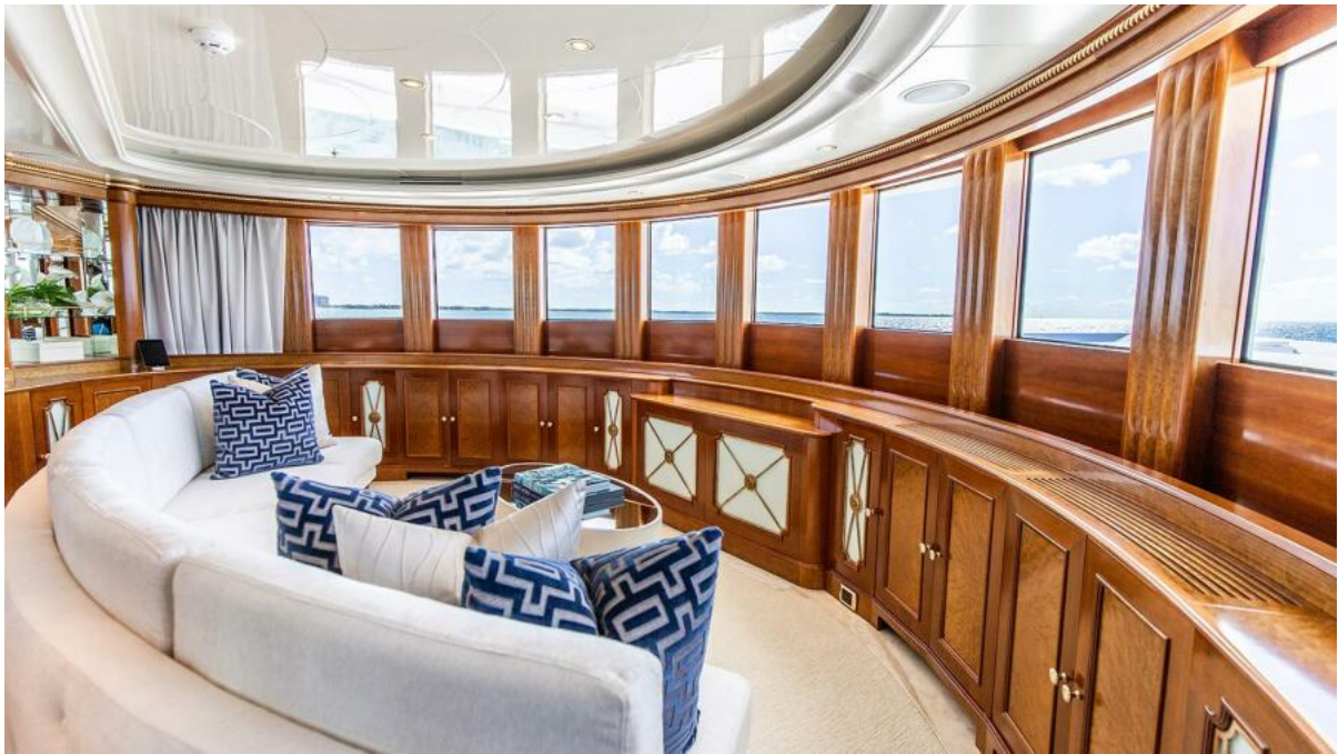
NEXT CHAPTER 180'6"/55m Benetti 2003/2022 Master Observation Lounge