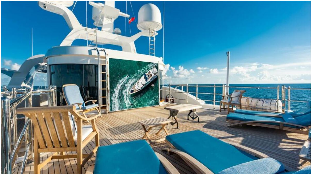
NEXT CHAPTER 180'6"/55m Benetti 2003/2022 Sundeck Aft Lounge; Outdoor Theater