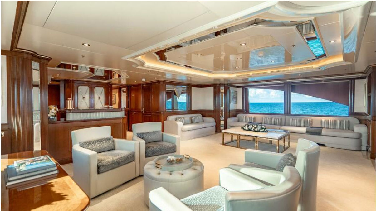
NEXT CHAPTER 180'6"/55m Benetti 2003/2022 Skylounge