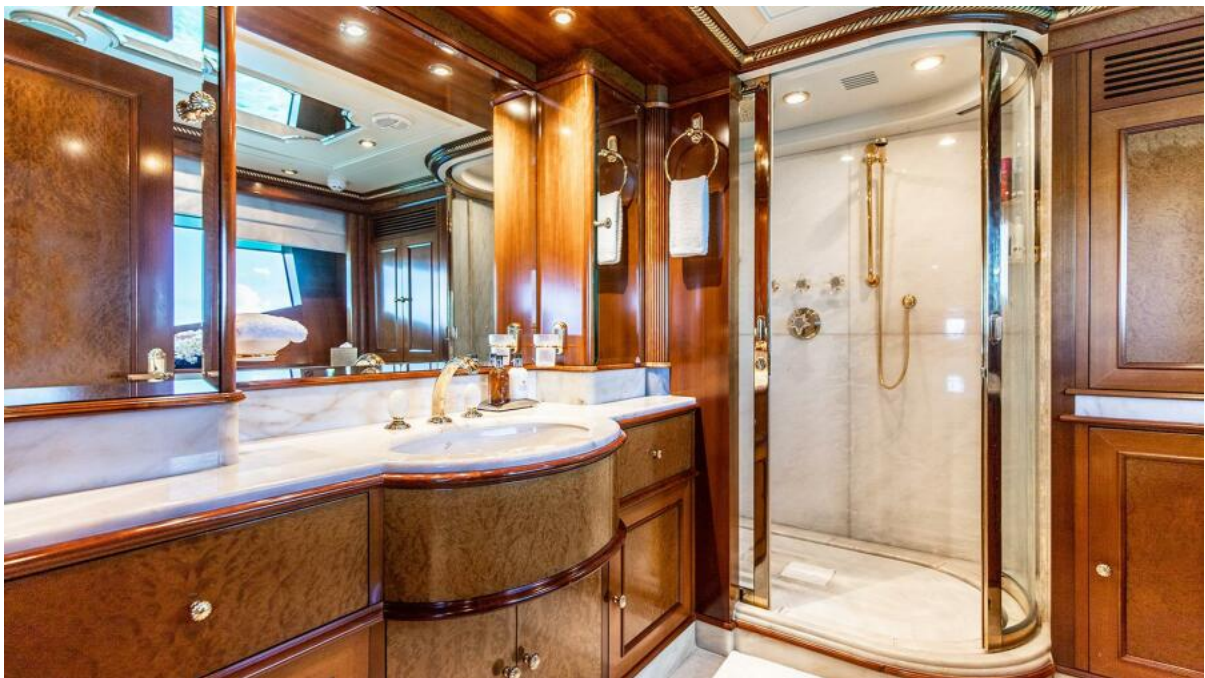
NEXT CHAPTER 180'6"/55m Benetti 2003/2022 Master Ensuite