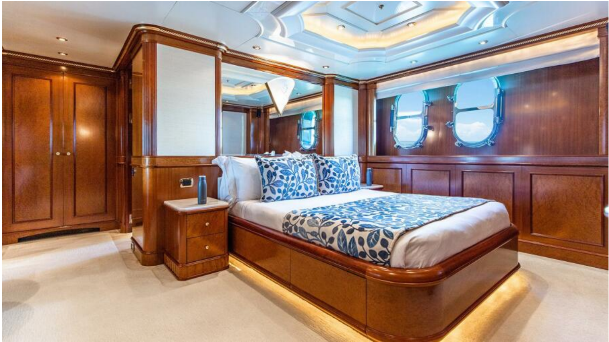
NEXT CHAPTER 180'6"/55m Benetti 2003/2022 Queen Ensite