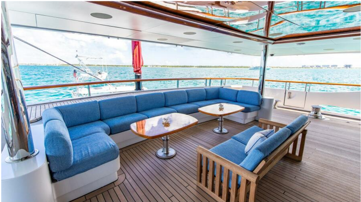
NEXT CHAPTER 180'6"/55m Benetti 2003/2022 Main Aft Deck