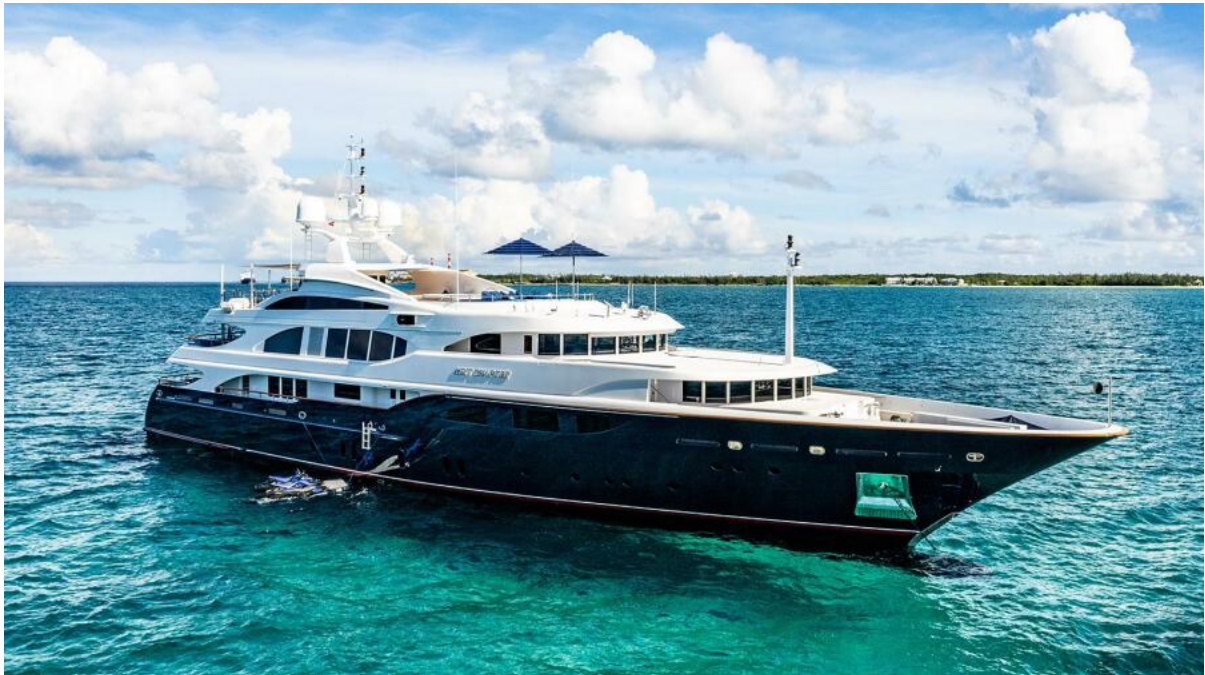
NEXT CHAPTER 180'6"/55m Benetti 2003/2022