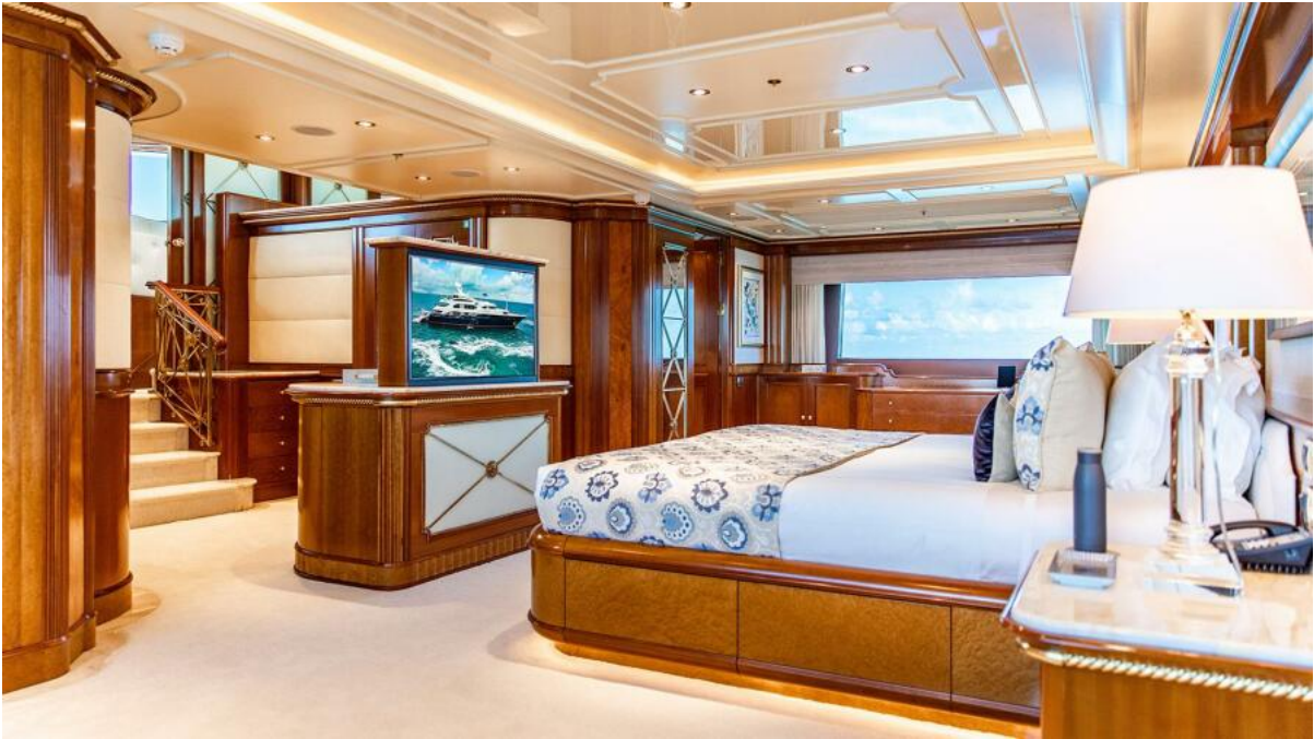
NEXT CHAPTER 180'6"/55m Benetti 2003/2022 Master Stateroom