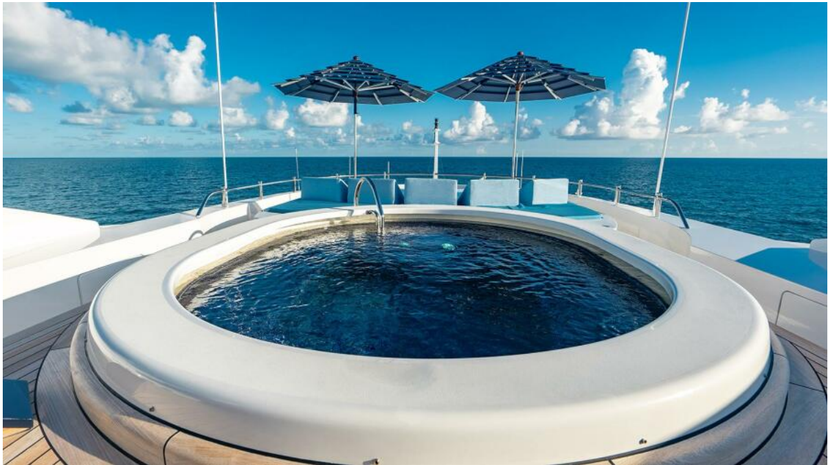
NEXT CHAPTER 180'6\"/>