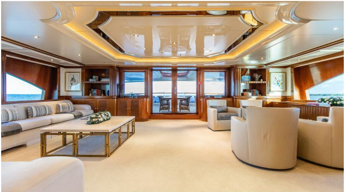
NEXT CHAPTER 180'6"/55m Benetti 2003/2022 Skylounge