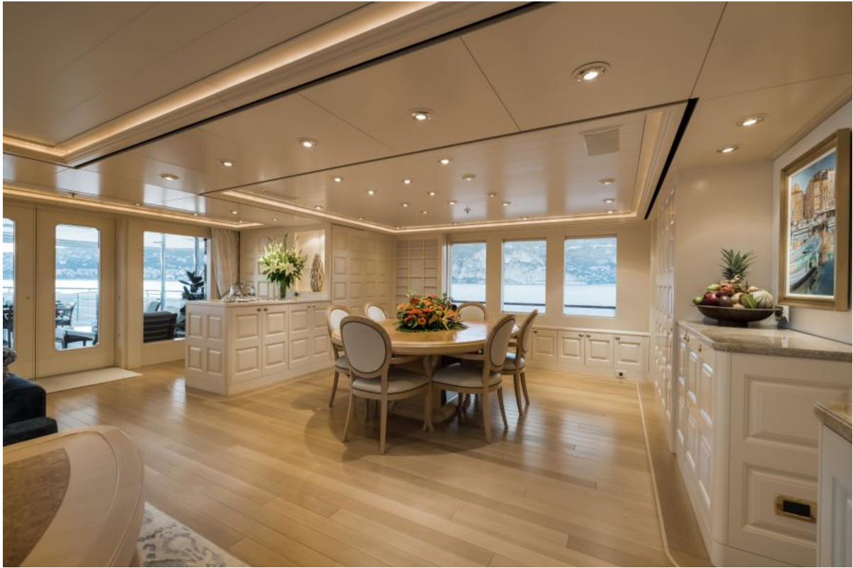
LAUREL 240'73.15m Delta 2006/2014 Sky Lounge