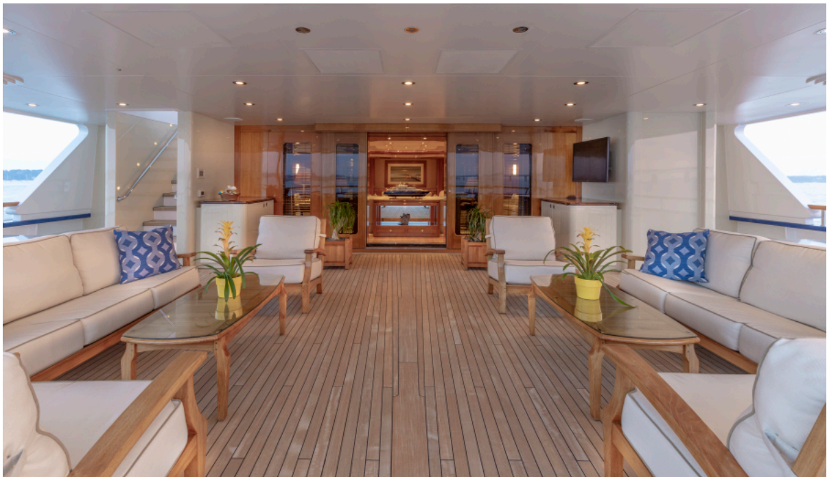
LAUREL 240'73.15m Delta 2006/2014 Main Aft Deck