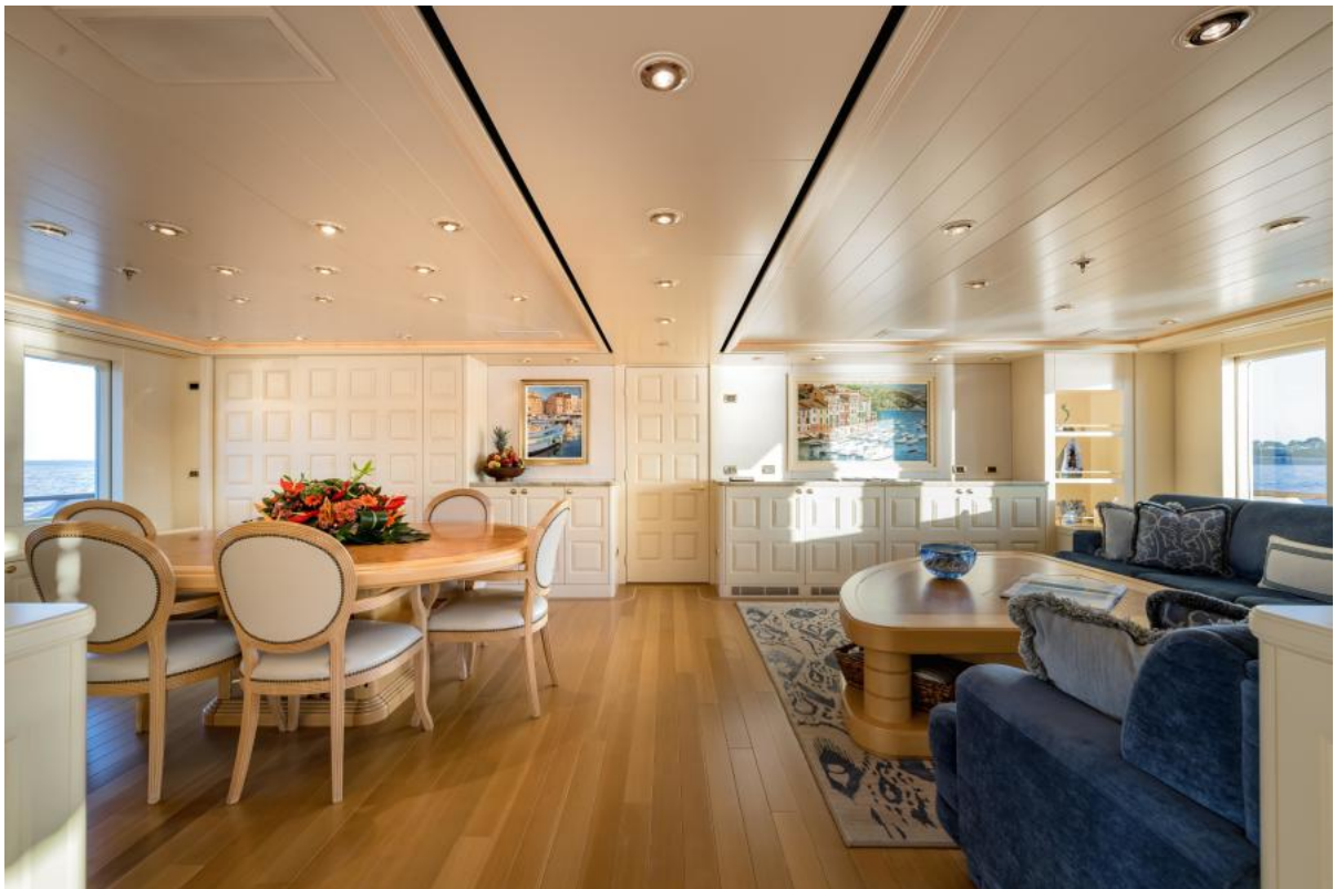
LAUREL 240'73.15m Delta 2006/2014 Sky Lounge