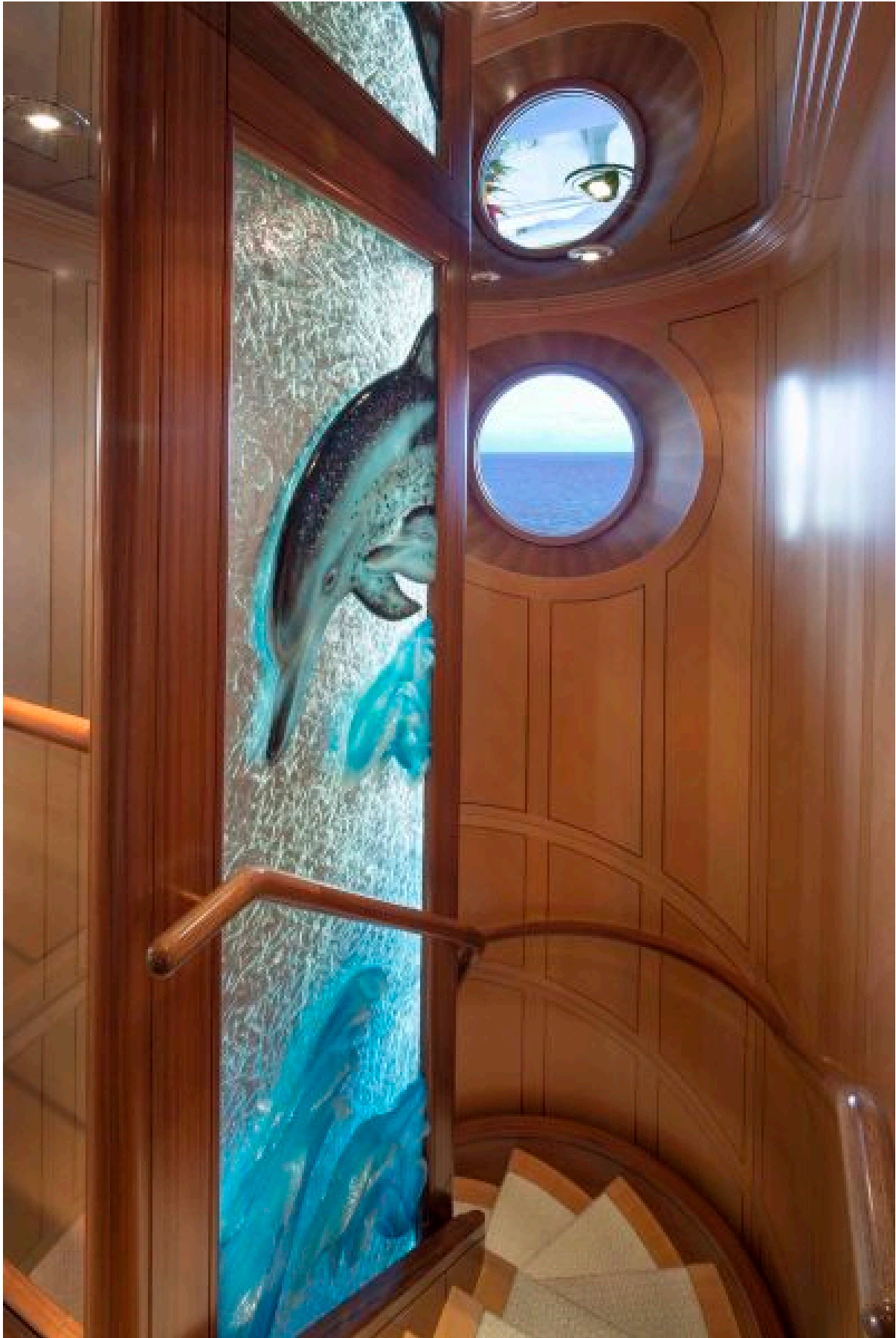
LAUREL 240'73.15m Delta 2006/2014 Main Staircase