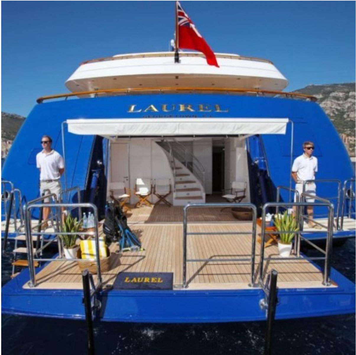
LAUREL 240'/73.15m Delta 2006/2014 Beach Club