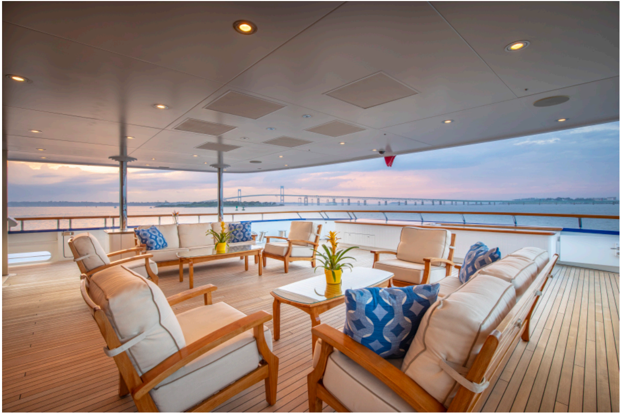
LAUREL 240'73.15m Delta 2006/2014 Main Aft Deck