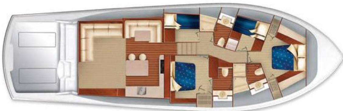
Manufacturer Provided Image: Standard Arrangement Standard Arrangement