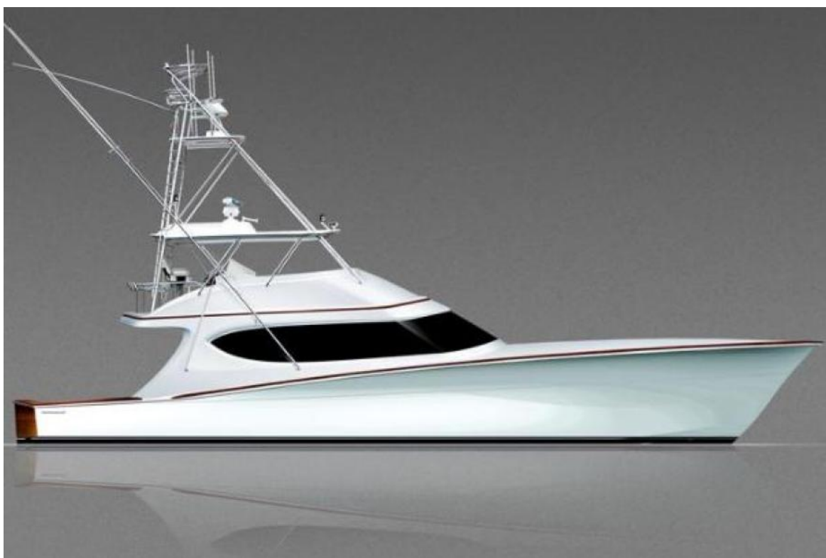
Manufacturer Provided Image